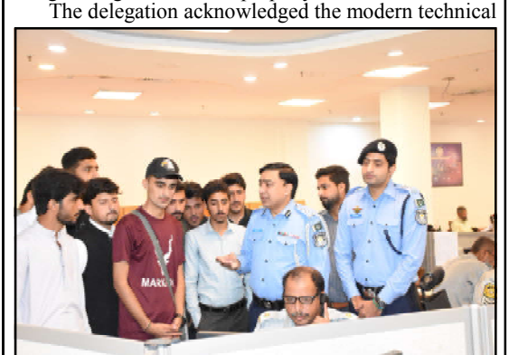
ISLAMABAD: A delegation of students from International Islamic University Islamabad visited Safe City Islamabad, a public relations officer said.