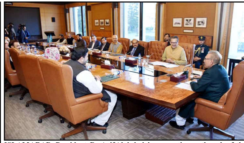
ISLAMABAD: President, Dr. Arif Alvi chairing a meeting on the role of the mosques and the pulpits in social development held at Aiwan-e-Sadr in Islamabad.

Increasing population, women's rights, interfaith harmony and promotion of tolerance were the significant social issues, he added. Commending the role of ulema, mosques and pulpits during Coronavirus pandemic, he said they created public awareness. The president opined that ulema could also create awareness in the society about different issues like diseases, malnutrition and mental and physical weakness. The social linkages would be further strengthened with intensifying of religious, educational and social activities, he observed. During the meeting, the participants also presented different proposals regarding role of ulema on various important national and social subjects.