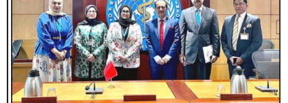
CAIRO: Caretaker Federal Health Minister Dr. Nadeem Jan met with H.E. Minister of Health, Bahraini Dr. Jaleela bint Alsayed Jawad Hasan on the sidelines of the 70th session of the WHO Regional Committee for Middle East held in Cairo.