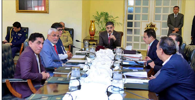
ISLAMABAD: Caretaker Prime Minister Anwaar-ul-Haq Kakar chairs a meeting regarding Pakistan International Airlines.

French Embassy in Pakistan, Campus Pakistan, and their local partners, to promote studying in France. The 2 Education fairs to be organized in Lahore on October 17 and in Karachi on October 19, will give the opportunity to students to interact directly with French universities, learn more about the 1700 programs taught in English at the Bachelor and Master levels, and get details about the 183 scholarship programs available for Pakistani students. This year, four French business schools are part of the delegation.