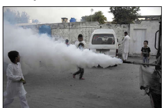
ISLAMABAD: Workers of Capital Development Authority (CDA) spraying anti dengue spray in a streets of sector G-6 in Federal Capital.

During the meeting, both the dignitaries discussed matters of mutual interests.