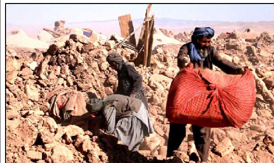
Afghan residents clear debris of damaged houses after earthquake in Nayeb Rafi village, Zenda Jan district of Herat province.

Monitoring Desk PRISTINA: A NATO top commander said Tuesday the alliance equipped its peacekeeping force in Kosovo with weapons of "combat power" following a recent shootout between masked Serb gunmen and Kosovo police that left four people dead and sent tensions soaring in the region. Adm. Stuart B. Munsch of the Allied Joint Force Command Naples, Italy said that a battalion of some 200 troops from the United Kingdom and 100 others from Romania "is bringing heavier armament in order to have combat power to" the NATO-led Kosovo Force, or KFOR, but didn't elaborate further. The KFOR peacekeepers — made up of around 4,500 troops from 27 nations — have been in Kosovo since June 1999, basically with light armament and vehicles. The 1998-1999 war between Serbia and Kosovo ended after a 78-day NATO bombing campaign forced Serbian forces to withdraw from Kosovo. More than 10,000 people died, mostly Kosovo Albanians. On Sept. 24, around 30 Serb gunmen killed a Kosovar police officer and then set up barricades in northern Kosovo before launching an hours-long gun battle with Kosovo police.