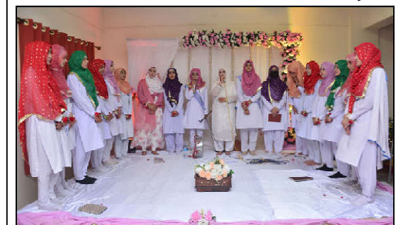
ISLAMABAD: Students are reciting Naat-e-Rasool-e-Maqbool during Milad ceremony at Islamabad College for Girls in Federal Capital.

Chairman Bilawal said that PPP believes in equal rights and equality for all citizens in the country.