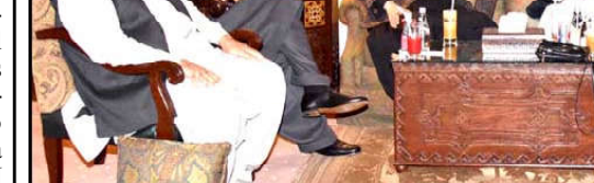
Chairman Senate, Muhammad Sadiq Sanjrani exchanging views with former Chief Minister of Balochistan, Mir Abdul Qudous Bizenjo in Islamabad.

Chairman Senate emphasized the importance of creating opportunities to involve the youth of Balochistan in the development process. He called for unity among all political forces, stressing the collective responsibility for the development of Balochistan.