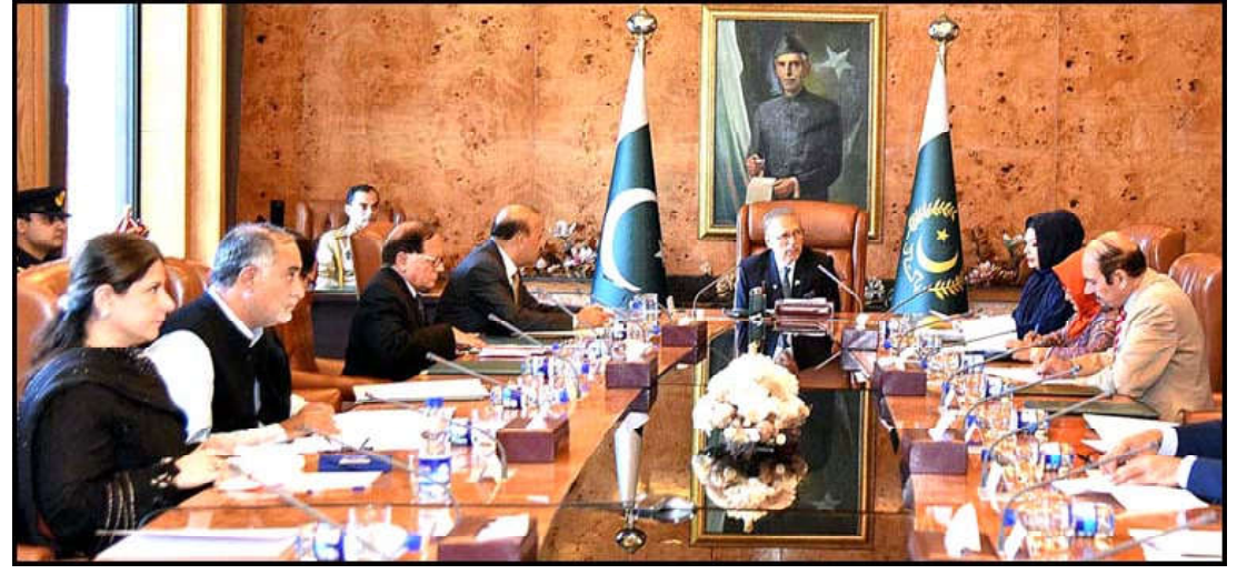
ISLAMABAD: President Dr. Arif Alvi chairing a meeting regarding the implementation of Zainab Alert Response & Recovery Act (ZARRA) 2020, at Aiwan-e-Sadr.

The president said that ZARRA's coverage should be extended to the entire country by allocating adequate resources and creating awareness among the people.