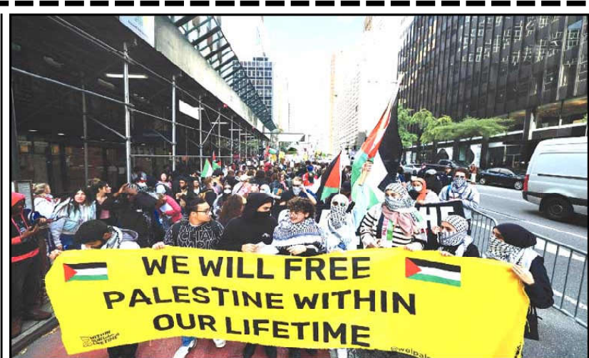
NEW YORK: Demonstrators gather in support of the Palestinian people during a rally for Gaza outside the Consulate of Israel.