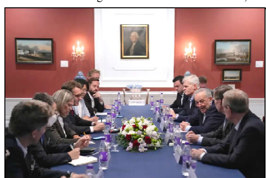
U.S. Senate Majority Leader Chuck Schumer, D-N.Y., speaks during a press roundtable with Schumer and his delegation at the residence of U.S. Ambassador to China, in Beijing.