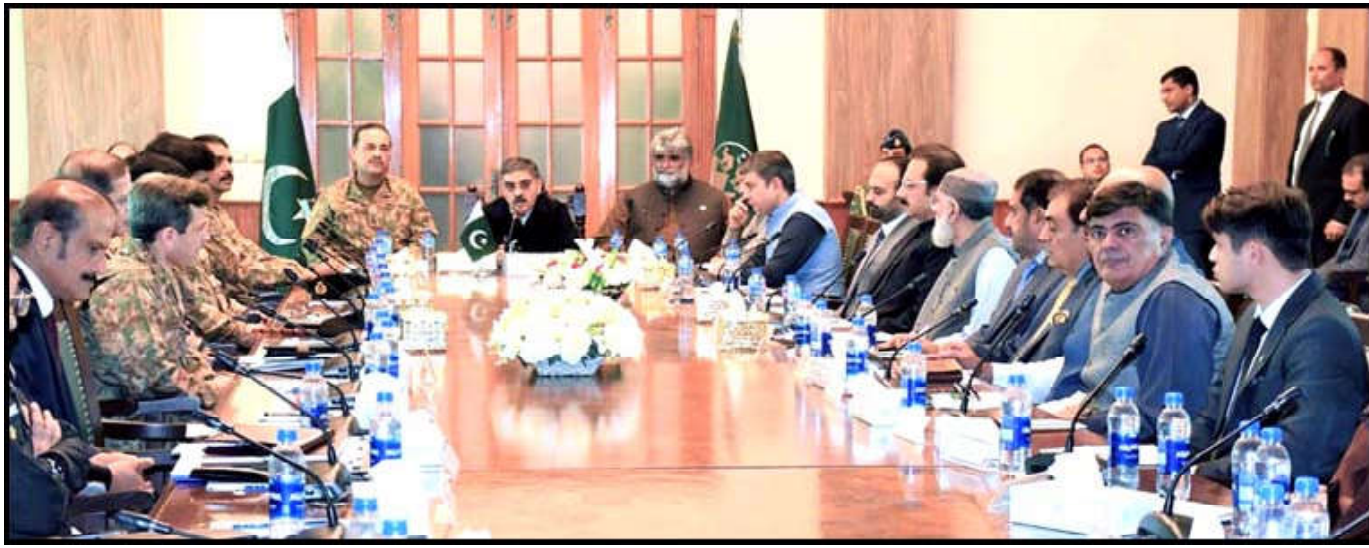
QUETTA: The Caretaker Prime Minister Anwaar-ul-Haq Kakar chairs a meeting of the Provincial Apex Committee.

Vol. XIII No. 289 Reg. mails-B / ID-445 Wednesday October 11, 2023, Rabi-ul-Awwal 24, 1445 A.H. Ph: 2158688, 2158997 Pages 4: Rs. 12