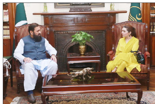
LAHORE: Special Assistant to Prime Minister for Human Rights Mushaal Hussein Malik meeting with Governor Punjab Muhammad Balighur Rehman.

LAHORE (APP): Special Assistant to the Prime Minister (SAPM) on Human Rights and Women Empowerment, Mushaal Hussein Mullick has said that the provision of best facilities to inmates is the top priority of the government as they have equal rights like other citizens of the country. Talking to media prior to visiting the Kot Kahpat Jail here on Tuesday, she said that jail and prisoners were near to her heart as her husband, Yasin Malik, is also in the death cell of the notorious Tihar jail in false, fabricated and politically motivated cases. Mullick said that maximum facilities would be provided to prisoners through her mandate of human rights and women empowerment, adding that prisoners' rights according to the Geneva Convention should be protected. She said that a 100-day plan would be launched next week with special focus on protection of prisoners' rights and for their rehabilitation. She said that a rehabilitation proposal is being prepared with the coordination of Legal Aid and Justice Authority (LAAJA) for juveniles and women in jails. Under the proposal legal aid would be provided to prisoners while their facilities and rights would be monitored, she informed.