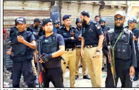
KARACHI: Police officials carry out the grand combing search operation against criminals as security has been tightened in city due to security reasons at different areas of Old Golimar area in Karachi.