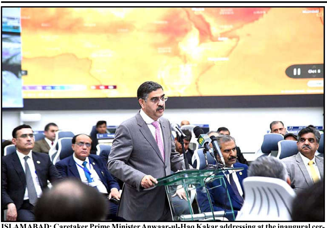
ISLAMABAD: Caretaker Prime Minister Anwaar-ul-Haq Kakar addressing at the inaugural ceremony of National Emergencies operation Center established by NDMA.

Vol. XIII No. 285 Reg. mails-B / ID-445 Friday October 06, 2023, Rabi-ul-Awwal 19 1445 A.H. Ph: 2158688, 2158997 Pages 4: Rs. 12