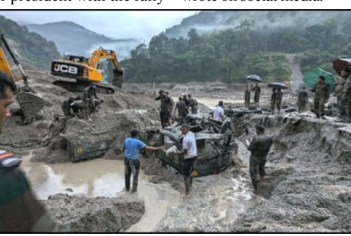
Indian army personnel conduct a search operation for the missing soldiers in north Sikkim.

there are only two things that have consistently worked. wheels, and walls!" Trump wrote on social media