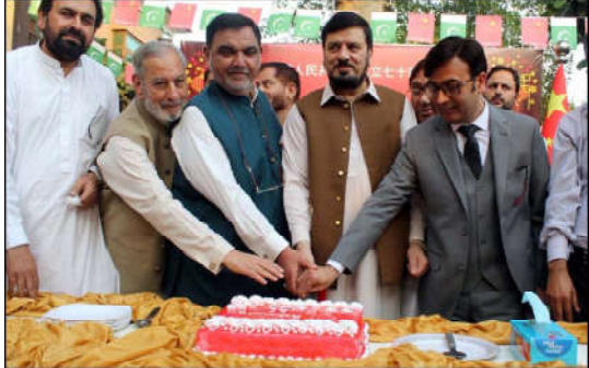
PESHAWAR: Governor Khyber Pakhtunkhwa, Ghulam Ali along with others cutting cake during a ceremony on the eve of National Day of China, at China Window in Peshawar.

The details further reveal that 1388 victims were affected by road traffic crashes including 1130 males & 263 females, while the age group of the victims shows that 191 were under 18 years of age, 770 were between 18 and 40 years and rest of the 432 victims were reported above 40 years of age.