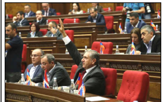
Armenian lawmakers attend the session of the National Assembly of the Republic of Armenia in Yerevan.

"At present, we have not left the regime of abandoning nuclear tests," Kremlin spokesman Dmitry Peskov told reporters. "I don't think such discussions are possible now from an official point of view," Peskov said, adding that Simonyan's words did not "always" reflect Moscow's official position.