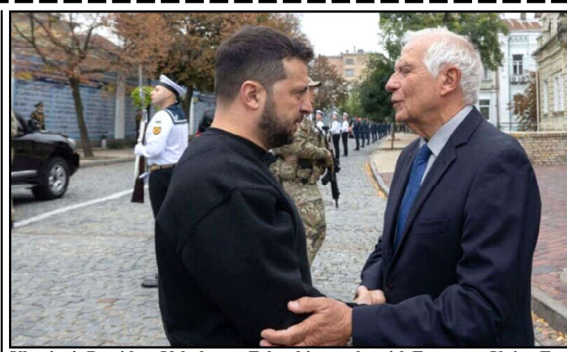
Ukraine's President Volodymyr Zelenskyy speaks with European Union Foreign Policy Chief Josep Borrell as they visit the Memory Wall of Fallen Defenders of Ukraine, amid Russia's attack on Ukraine, during the marking of Defenders of Ukraine Day in Kyiv.

France's top diplomat Catherine Colonna appeared to address the concerns, saying the meeting was a signal to Moscow of the bloc's determination to support Ukraine over the long term.