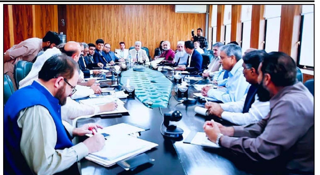
Caretaker Federal Minister for National Food Security and Research, Dr. Kausar Abdullah Malik chaired a meeting on Seed System of Pakistan and reviewed its challenges and future prospects at Islamabad.

The government's relief package of free seeds, subsidized credit,