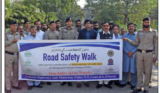
LAHORE: Representative of Motorway Police and Administrators of Bus transportation Company participate in the awareness rally about smog and fog, at General Bus stand in Provincial Capital.