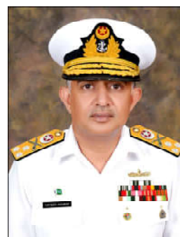
Chief of Staff at the Naval Headquarters.