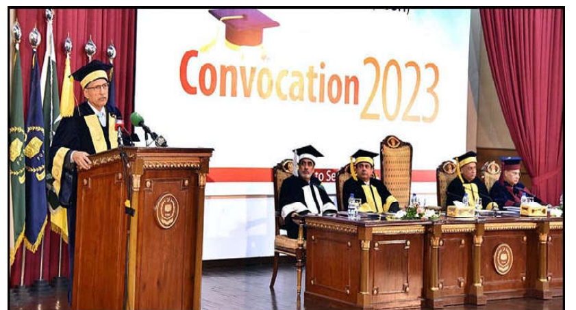
ISLAMABAD: President Dr. Arif Alvi addressing the convocation ceremony of the dentistry and nursing departments of the Foundation University School of Health Science (FUSH).

At the start of today's hearing, the chief justice said the law affected the CJP and the two senior-most judges of the SC. He added that the law would also apply to future chief justices and senior judges of the apex court. Elaborating further, Justice Isa stated that he felt that he should not have been part of the bench, however, as the law affects all judges of the apex court, it was decided that a full court will hear the case.