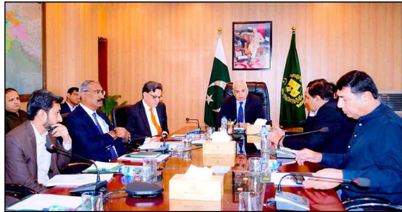
ISLAMABAD: Caretaker Federal Minister for Railways, Shahid Ashraf Tarar chairing a meeting at Ministry of Railways.

Even though the rate is higher from 02 hundred to 05 rupees, urea fertilizer is not available in the market. From where they are busy selling urea fertilizer in black at high prices to influential farmers, various fertilizer dealers in their position blamed the ongoing crisis on the fertilizer companies and said that the fertilizer companies did not get the required quantity of urea fertilizer on time.