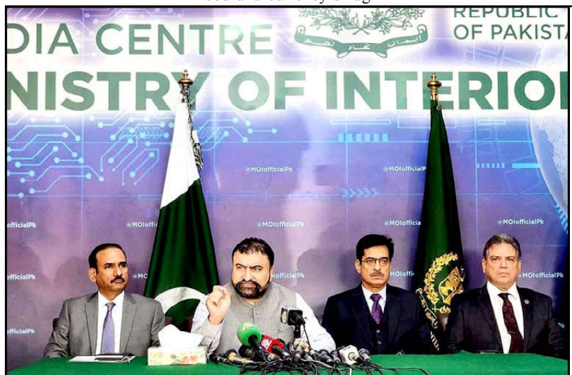
ISLAMABAD: Caretaker Federal Minister for Interior, Sarfraz Ahmed Bugti addressing a Press Conference.

Dr Alvi said only nine percent of students of F.Sc (Faculty of Sciences) Pre-Medical got admission to medical colleges in Pakistan, while the statistics were 25 percent in India and Bangladesh. The situation needed a strategy to set up more medicine schools to accommodate a greater number of students, he added. The president pointed out that the women doctors who quit their professional fields while in a struggle to balance their family lives was a huge loss to the country.