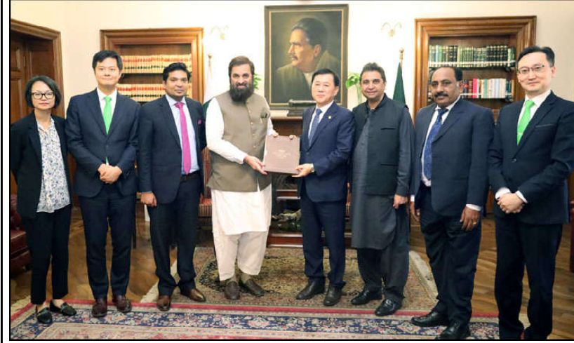
LAHORE: A delegation of an International Peace Organization, Heavenly Culture World Peace Restoration Light (HWPL) working for global peace, led by Senator Kamran Michael in a group photo with Punjab Governor, Muhammad Balighur Rehman at Governor House Lahore.

Kashmiris by usurping their basic human rights. He said that international organizations should ensure the implementation of the UN resolutions to resolve the Kashmir issue. Governor Punjab said international peace organizations need to be more active and play an effective role in resolving Palestine and Kashmir issues for durable peace in the world.