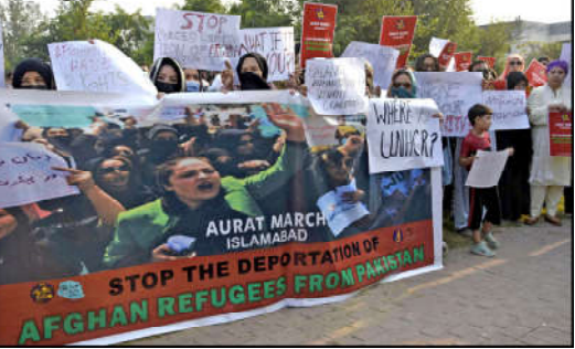
ISLAMABAD: Members of Aurat March, holds placards during protest in favor of their demands outside National Press club, in Federal Capital.