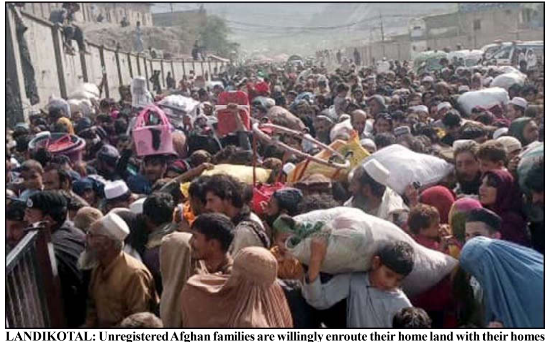
necessities after the government of Pakistan decided in the apex committee meeting to return all those Afghans who are living in Pakistan unlawfully, at Torkham Border in Landikotal.