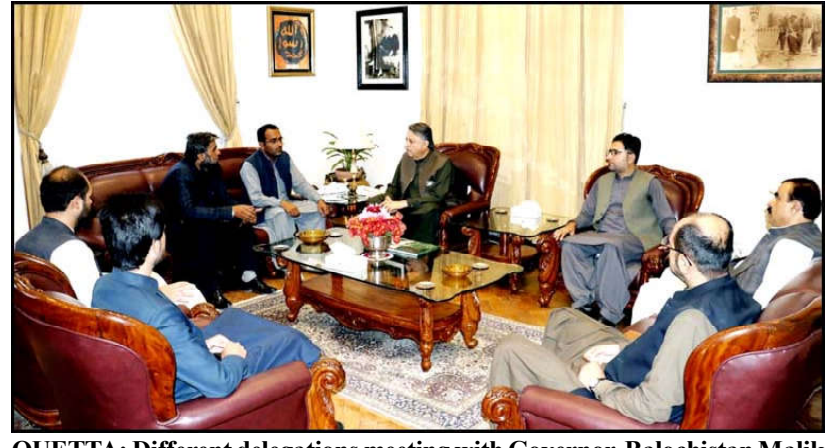
QUETTA: Different delegations meeting with Governor Balochistan Malik Abdul Wali Khan Kakar

Caretaker federal ministers for interior, energy and information & broadcasting, provincial chief secretaries and relevant federal secretaries attended the meeting.