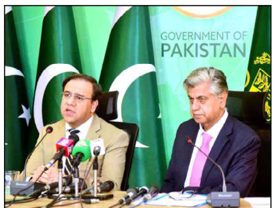
ISLAMABAD: Caretaker Federal Minister for IT and Telecommunication, Dr. Umar Saif, and Caretaker Federal Minister for Information & Broadcasting, Murtaza Solangi addressing Press Conference.

The PTI chief, in his petition, stated that his indictment was made in a haste by the trial court and it was a violation of Criminal Procedure 1898, and articles 4 and 10A of the Constitution. He said that the charges could be framed after seven days of providing the copy of the challan to the defence, and prayed the court to set aside the indictment as it would be violation of fundamental rights if the trial is concluded in haste.