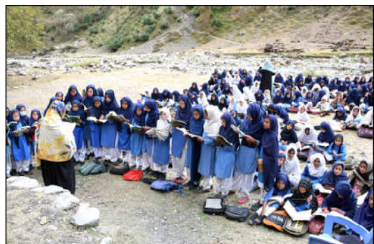
MUZZAFERABAD: Students are attending the classes at open air schools in the different areas of the Azad Kashmir, as after millions rupees of education fund, students are studying with building.

Lahore Safe City Project will be made functional at the earliest. CM presided over an important meeting at the Punjab Safe City Authority Office in which progress was reviewed on the Safe City projects of Rawalpindi, Faisalabad and Gujranwala. The proposals to bring improvements in the Emergency Services 15 and making paperless working of the Punjab Safe City Authority were reviewed during the meeting. CM was informed during the briefing that 2000 cameras will be made functional by the first week of November in Lahore. IG Police gave a briefing with regard to progress being made in the Safe City.