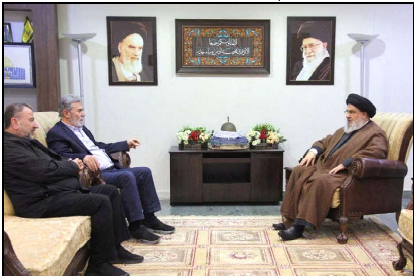
Lebanon's Hezbollah leader Sayyed Hassan Nasrallah meets Jihad Secretary General Ziyad al-Nakhlah and deputy leader of Hamas, Sheikh Saleh al-Arouri at an unidentified location in this handout image released.

Monitoring Desk BRASILIA: Approval of President Luiz Inacio Lula da Silva's performance has fallen in the last two months as Brazilians worry that Latin America's largest economy is worsening, a new Genial/Quaest poll showed on Wednesday. Approval of his way of governing has fallen to 54% in October from 60% in August.