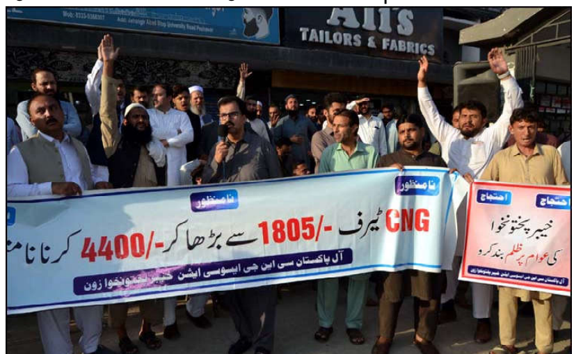
PESHAWAR: Members of All Pakistan CNG Association are holding protest demonstration against CNG Tariff hike, at University road in Peshawar