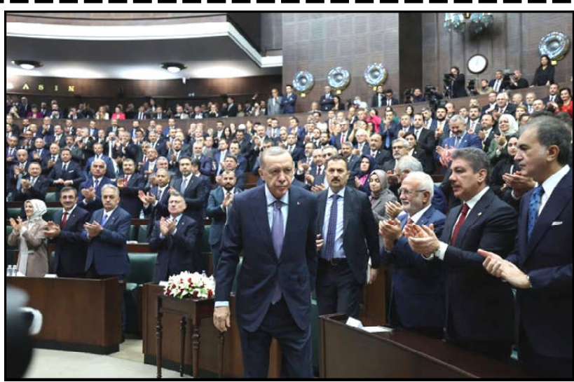
Turkish President Tayyip Erdogan attends a meeting with members of parliament from his ruling AK Party (AKP) at the Turkish parliament in Ankara, Turkey.

a terrorist organisation and hosts members of the group on its territory. Ankara backs a two-state solution to the decades-old Israel-Palestinian conflict. Advertisement Scroll to continue Erdogan also slammed Western powers for supporting Israel's bombing of Gaza and called for an immediate ceasefire, the unhindered entry of humanitarian aid into Gaza and for Muslim countries to work together to stop the violence.