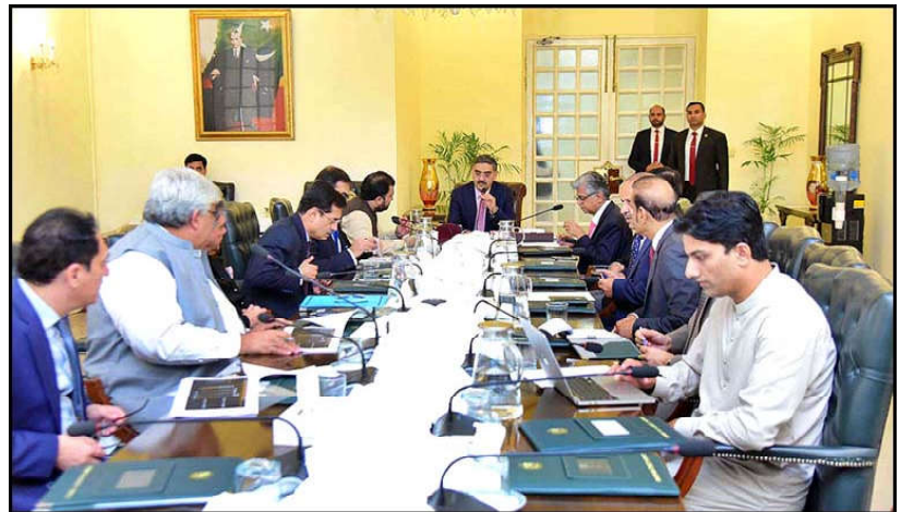
ISLAMABAD: Caretaker Prime Minister Anwaar-ul-Haq Kakar chairs a review meeting regarding the Anti-Power Theft Campaign 2023.

He also sought a comprehensive report on the resistance faced during the anti-power theft drive in Balochistan and other allied issues.