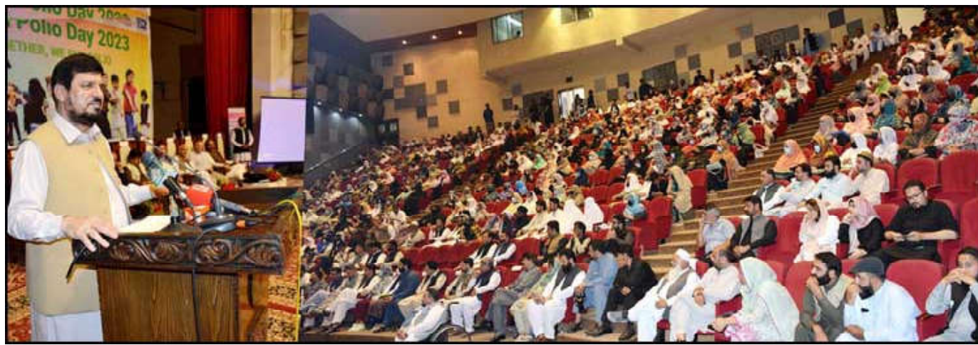
PESHAWAR: Governor Khyber Pakhtoonkhwa Haji Ghulam addressing a ceremony on eve of International Polio Day at Nishtar Hall.