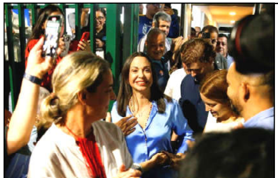
Industrial engineer and former lawmaker Maria Corina Machado reacts to the vote count, after Venezuelans voted in a primary to choose a unity opposition candidate to face Venezuela's President Nicolas Maduro in his probable re-election bid in 2024, in Caracas, Venezuela.

A senior state security official was traveling in the convoy when it was attacked, authorities said, without confirming media reports that he was murdered along with police bodyguards.