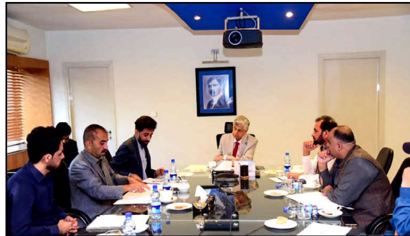
ISLAMABAD: A delegation of Afghan media meeting with Caretaker Federal Minister for Information and Broadcasting Murtaza Solangi