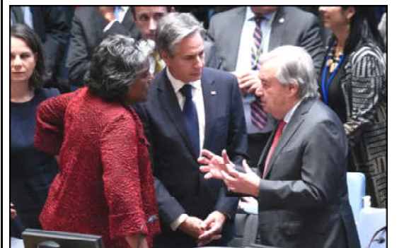
U.S. Secretary of State Antony Blinken, center, and U.S. Ambassador to the United Nations Linda Thomas-Greenfield, left, talk with UN Secretary-General Antonio Guterres before a Security Council meeting at United Nations headquarters.

"We are saying enough is enough," Emir Sheikh Tamim bin Hamad Al-Thani told a meeting of the Shura Council, Qatar's legislative body, according to a translation released by the royal court. "It is untenable for Israel to be given an unconditional green light and free licence to kill, nor is it tenable to continue ignoring the reality of occupation, siege and settlement." Qatar, a US ally which hosts a large US military base, also hosts an office of Hamas which doubles as the main residence of its self-exiled leader Ismail Haniyeh.