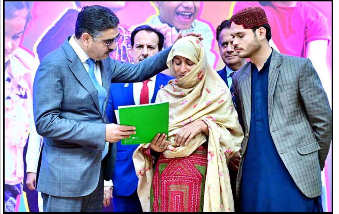
ISLAMABAD: The Caretaker Prime Minister Anwaar-ul-Haq Kakar distributes cheques among the families of martyred polio workers and polio workers who got injured in the line of duty.

The prime minister also announced to personally visit Huma as a gesture to recognise her services in the mission of a polio-free Pakistan.