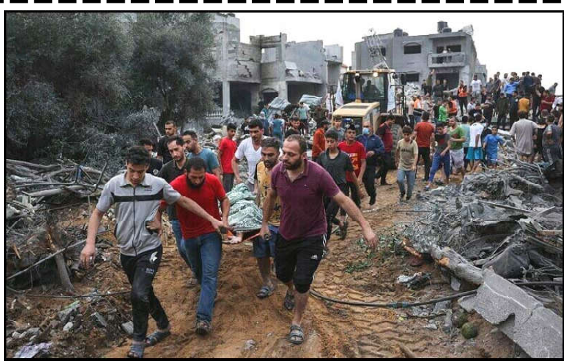
Palestinians transport the body of a victim from the rubble after Israeli strikes in Rafah in the southern Gaza Strip.

The United States has some 900 troops in Syria and 2,500 in Iraq as part of efforts to combat IS, which once held significant territory in both countries but was pushed back by local forces supported by international air strikes. Meanwhile, Iraq on Monday condemned as "unacceptable" attacks against bases on its territory housing US.