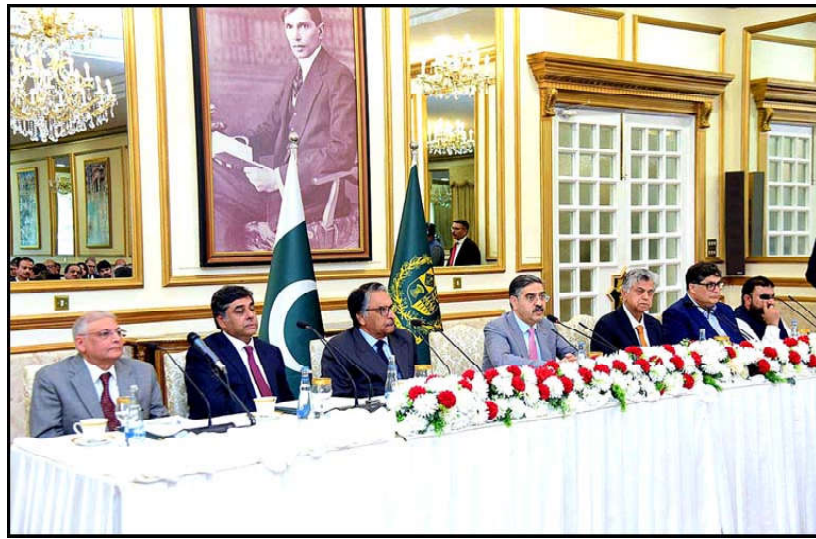
ISLAMABAD: The Caretaker Prime Minister Anwaar-ul-Haq Kakar addresses a Press Conference.

Ph: 2841470/2841473 Vol: XVIII No. 293, Rabi-us-Sani 08, 1445 AH Tuesday October 24, 2023, Pages 08, Price Rs.15