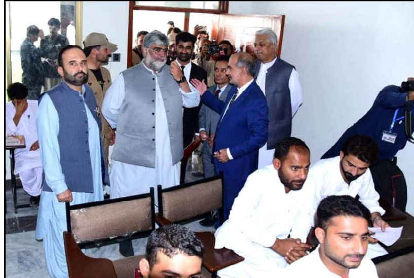
TURBAT: Caretaker Chief Minister Balochistan Mir Ali Mardan Khan Domki inspecting class rooms during his visit to Turbat Law College