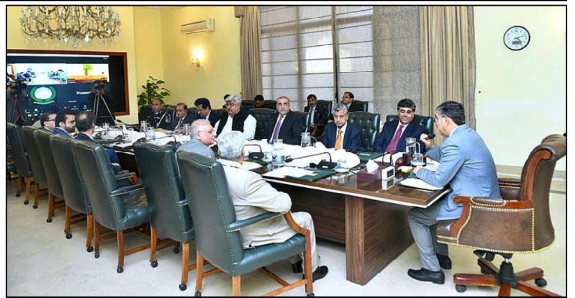
ISLAMABAD: Caretaker Prime Minister Anwaar-ul-Haq Kakar chairs a briefing on decline in prices of essential items as a result of reduction in the prices of petroleum products.

He said 18 percent reduction of wheat price and sugar by 16 percent in Balochistan was welcoming.