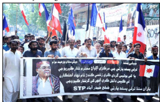
HYDERABAD: Workers of Sindh Tarraqi Passand Party hold a protest against Nawabshah police.