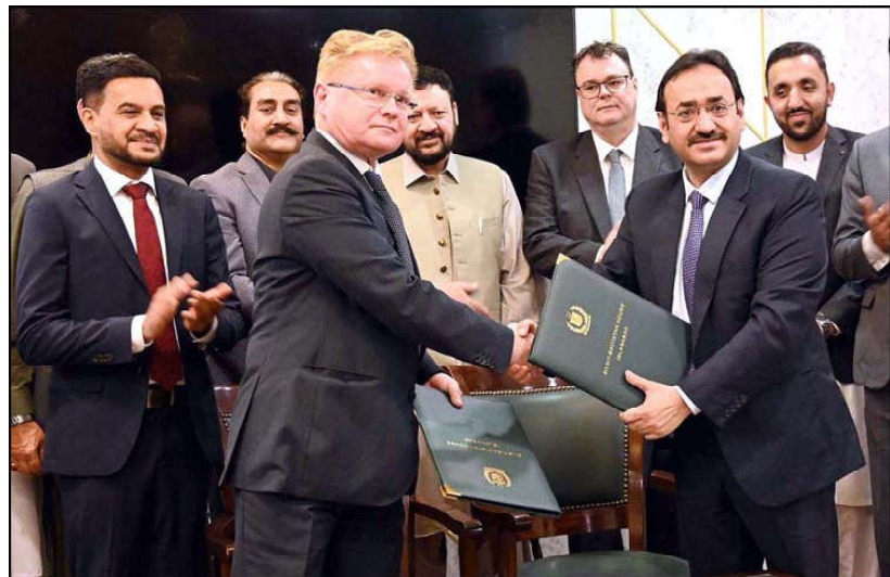
ISLAMABAD: Provincial Secretary Power Gilgit-Baltistan and Chairman of Nor Hydro are signing the memorandum of understanding for the solar project started with the cooperation of Norway, Chief Minister Gilgit-Baltistan Haji Gulbar Khan and ambassador of Norway is also present.