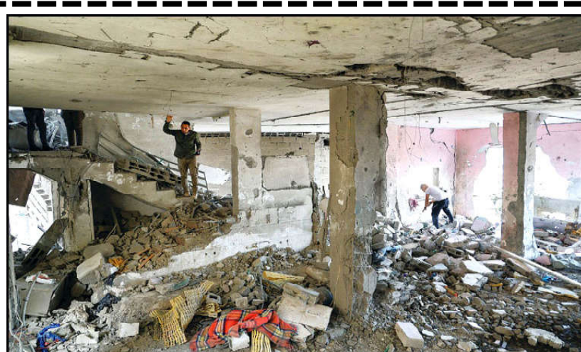
Palestinians check the damage inside a mosque which was hit in an Israeli air strike, in Jenin refugee camp in the Israeli-occupied West Bank.

Minister Ulf Kristersson wrote on X, the platform formerly known as Twitter. "Now it remains for Parliament to deal with the issue. We look forward to becoming a member of NATO." Sweden and its neighbor Finland abandoned decades of military nonalignment and sought protection under NATO's security umbrella after President Vladimir Putin ordered Russian troops to invade Ukraine in February 2022. Finland joined the military alliance in April after Turkey lifted its objections to its membership, saying Helsinki had taken steps to address Ankara's security concerns.