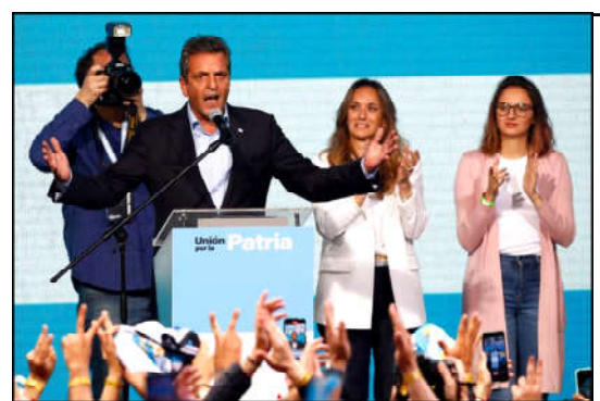
Argentina's presidential candidate Sergio Massa addresses supporters, as he reacts to the results of the presidential election, in Buenos Aires, Argentina.

Monitoring Desk AZERBAIJAN: Azerbaijan said on Monday it had begun a series of joint military exercises with close ally Turkiye, the first since Baku retook the breakaway region of Nagorno-Karabakh last month, prompting most of the territory's ethnic Armenians to flee. Azerbaijan's defence ministry said in a statement that up to 3,000 military personnel were participating in exercises named for the founder of modern Turkiye, Mustafa Kemal Atatürk. It said the drills were being held across Azerbaijan, including in Baku, the Nakhichevan exclave which borders Turkiye, and in what the ministry called the "liberated territories" of Karabakh. Turkiye has close linguistic and cultural links to Azerbaijan, and offered Baku military and political support during its three decade-long conflict with Armenia, with which Ankara has no formal diplomatic relations. Armenia and Azerbaijan have recently signalled willingness to end a peace treaty formally signing their conflict following Azerbaijan's victory in Karabakh and the exodus of almost all the region's 120,000 ethnic Armenians. The foreign ministers of the two countries, along with those of Turkiye, Iran and Russia, were due to hold talks hosted by Tehran on Monday on progress towards a peace agreement.