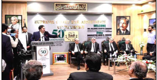
ISLAMABAD: Peoples Party (PPP) Chairman, Bilawal Bhutto Zardari addresses during the ceremony regarding the completion of 50 years of the Constitution of Pakistan under the Supreme Court Bar Association of Pakistan held in Islamabad.

Recalling the lawyers' movement of 2009 for the