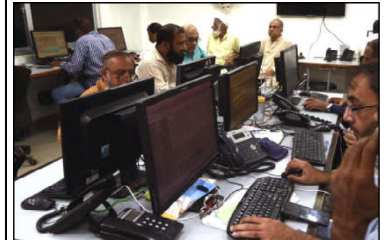
KARACHI: Brokers are busy in trading at Pakistan Stock Exchange (PSX) in Karachi.

The report highlighted that Pakistan's economic situation has started to show some early signs of improvement as the country has been able to secure a US$ 3.0 billion Stand-By Arrangement (SBA) from IMF, towards the end of FY23.