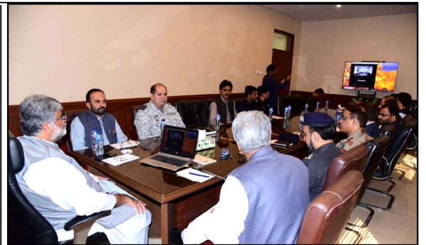
TURBAT: Caretaker Chief Minister Balochistan Mir Ali Mardan Khan Domki presiding over a meeting regarding law and order

Addressing a press conference about his recent visit to China, the prime minister said 20 Memorandums of Understanding (MoUs) were signed and hoped that the upcoming government would ensure consistency of the policy. The prime minister, along with a high-level delegation visited China from October 16-20, mainly to attend the Belt and Road Forum where he also held bilateral meetings with Chinese President Xi Jinping, Premier Li Qiang, and the leadership of the Communist Party of China.