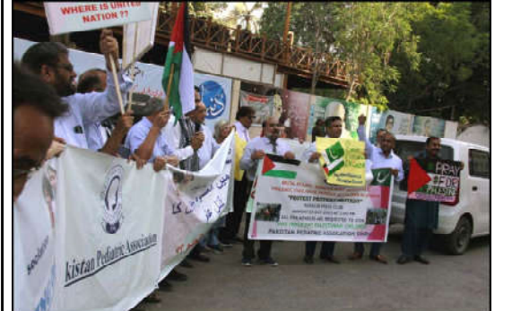
KARACHI: Members of Pakistan Pediatric Association Sindh are holding protest demonstration against Israeli cruel and inhumane acts and express unity with the innocent people of Palestine, held at Karachi press club.