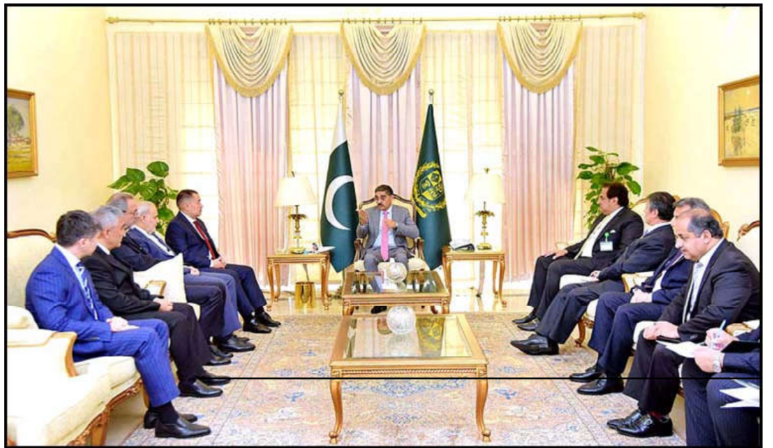
ISLAMABAD: Ambassadors of the ECO member States called on Caretaker Prime Minister Anwaar-ul-Haq Kakar.

and order situation besides the progress made so far about the investigations, adding he mentioned. He said that the decisions made in the law and order meeting are of important nature and as such they can't be disclosed before time. "However, I want to make it clear that those involved in the Turbat incident would be dealt with iron hands", asserted the Chief Minister. He also said that no one would be spared irrespective of one's status.