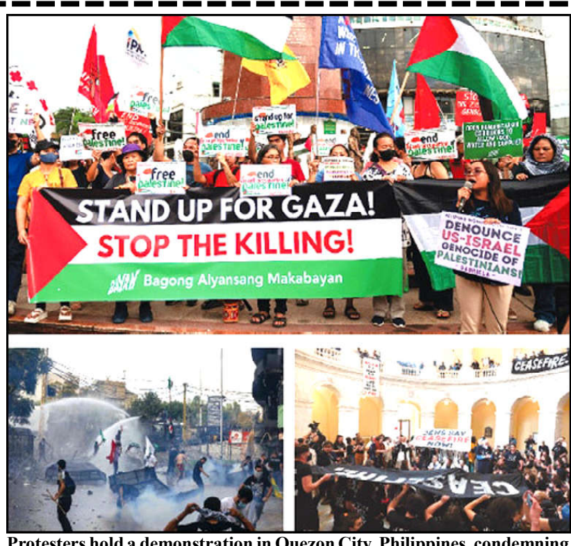
Protesters hold a demonstration in Quezon City, Philippines, condemning the blast at the Ahli Arabi hospital in Gaza; members of the US Jewish community protest in the US Capitol in Washington against Israeli attacks; and Lebanese security forces use water cannons as they clash with protesters outside the US Embassy in Awkar, east of Beirut, during a pro-Palestinian demonstration.

Monitoring Desk CAIRO: Egypt's President Abdel Fattah al-Sisi said on Wednesday that Egyptians would reject the forced displacement of millions of Palestinians into Sinai, adding that any such move would turn the peninsula into a base for attacks against Israel. The Gaza Strip is effectively under Israeli control and Palestinians could instead be moved to Israel's Negev desert "till the militants are dealt with", Sisi told a joint news conference in Cairo with German Chancellor Olaf Scholz. The border between Egypt's Sinai Peninsula and the Gaza Strip is the site of the only land crossing from the Palestinian territory that is not controlled by Israel. Israel's unprecedented bombardment and siege of Gaza has raised fears that its 2.3 million residents could be forced southwards into Sinai.