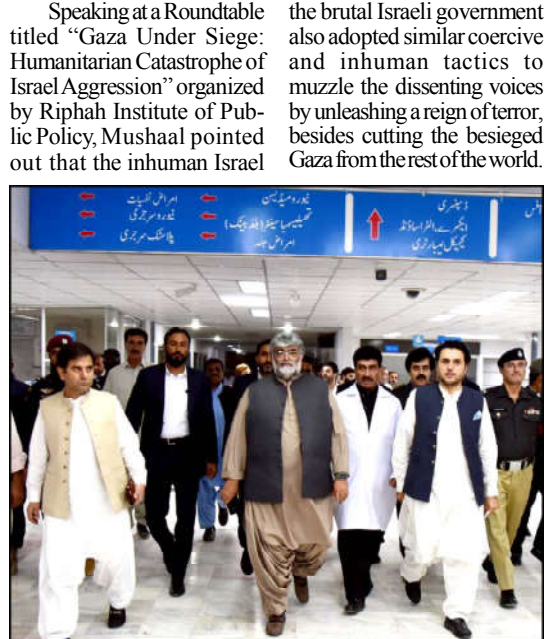
QUETTA: Caretaker Chief Minister Balochistan Mir Ali Mardan Khan Domki visiting BMC hospital

The SAPM on Human Rights and Women Empowerment lamented that the Zionist regime had no respect for the international laws, as it was targeting hospitals, residential areas and shelter homes with complete impunity, as Gazans were being subjected to genocide. She recalled that like Hindutva Indian government, the brutal Israeli government also adopted similar coercive and inhuman tactics to muzzle the dissenting voices by unleashing a reign of terror, besides cutting the besieged Gaza from the rest of the world.