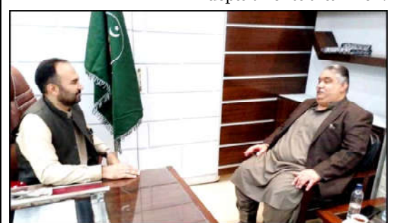
QUETTA: Former Provincial Minister Mir Umar Khan Jamali meeting with caretaker Home Minister Balochistan Captain (retd) Muhammad Zubair Jamali

In view of the performance of the women civil servants, Jan Achakzai remarked that the women are more active in the government departments than men.