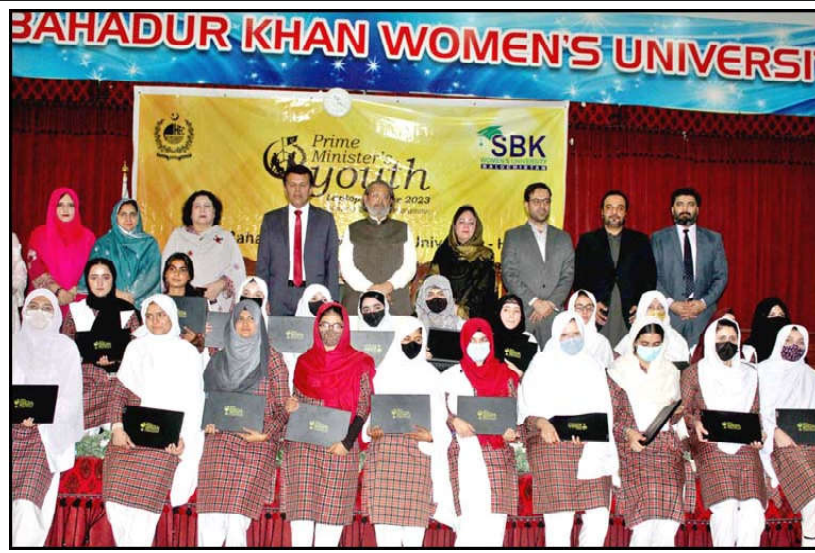
QUETTA: Caretaker Federal Minister for Education and Professional Training Madad Ali Sindh poses for a group photo with students after awarding laptops at Sardar Bahadur Khan Women's University Quetta.

Madad Ali said that fewer opportunities were provided to female students for quality education and it would be difficult for them to work in the practical field.