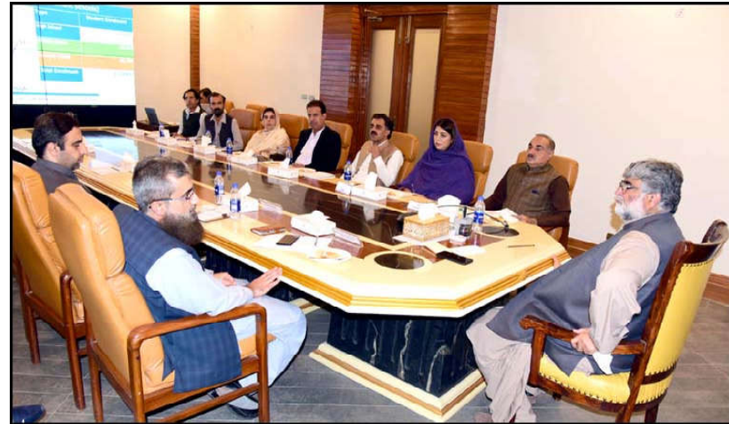
QUETTA: Caretaker Chief Minister Balochistan Mir Ali Mardan Khan Domki presiding over a meeting regarding Balochistan Education Sector Plan and Health Screening.

He urged the UN to give urgent consideration to OIC's proposal for an international protection force to protect innocent lives from the ongoing attacks by the occupation forces and extremist colonialist settlers. The root cause of this latest violence is the prolonged and illegal occupation of Palestine and the usurpation of the lands and properties of Palestinians and the accompanying oppression and massive violations of human rights committed with impunity by Israel, he said, noting that illegality of Israel's occupation has been reaffirmed by the International Court of Justice.