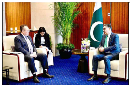
BEIJING: Liu Jianchao, Minister of the International Department of the Communist Party of China (IDCPC) called on Caretaker Prime Minister Anwaar-ul-Haq Kakar.

Sources have said that Russian crude oil is ten dollars per barrel cheaper than the normal market even after taking out the rent and premium, and in the first test cargo, Pakistan saved 4 million dollars.