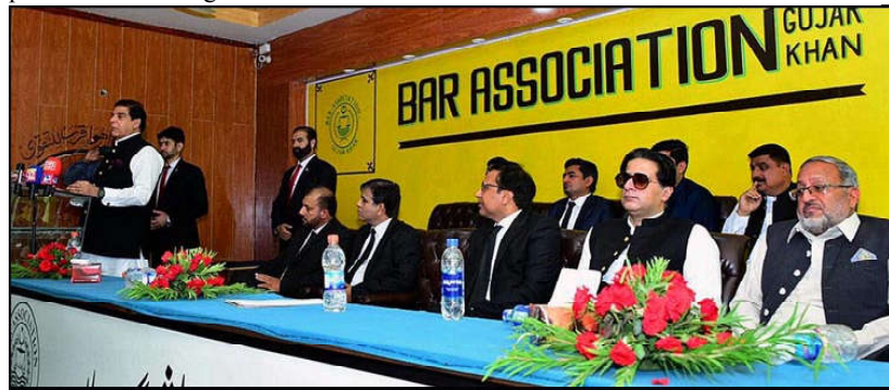
GUJJAR KHAN: Speaker National Assembly Raja Pervez Ashraf addressing the Public Gathering after Inaugurating Solar Energy System at Gujjar Khan Bar Association.