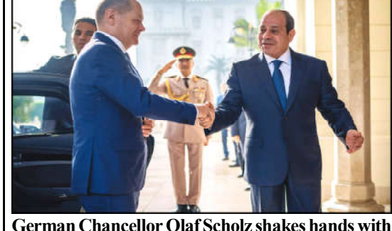
German Chancellor Olaf Scholz shakes hands with Egypt's President Abdel Fattah al-Sisi in Cairo.

far east. Earlier in the day, Lavrov lashed out at what he termed a "dangerous" US policy towards North Korea while touting the "new, strategic level" of relations between Moscow and Pyongyang. "Like our North Korean friends, we are seriously worried about the intensification of military activity of the United States, Japan and South Korea in the region and by Washington's policies," Lavrov told journalists, according to Russian news agencies. "We oppose this unconstructive and dangerous line," he said.