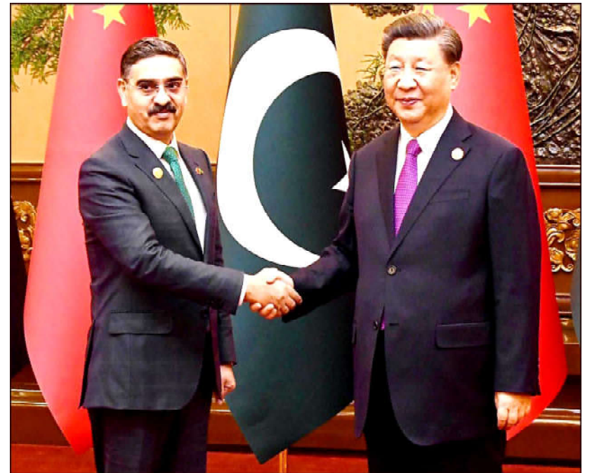
BEIJING: Caretaker Prime Minister Anwaar-ul-Haq Kakar meets Chinese President Xi Jinping in Beijing.

He said China's unprecedented progress was a role model which transformed the lives of the millions of its people, also having no parallel in the world history.