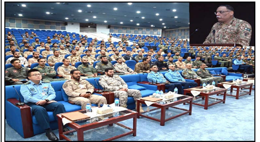
ISLAMABAD: Chairman Joint Chiefs of Staff Committee, General Sahir Shamshad Mirza addressing the participants of ongoing aerial exercise Indus Shield-2023

Speaking on the occasion, the Chief Minister said that the provincial government would take special measures for resolving the issues being faced by the universities of the province with cooperation of the federal government.