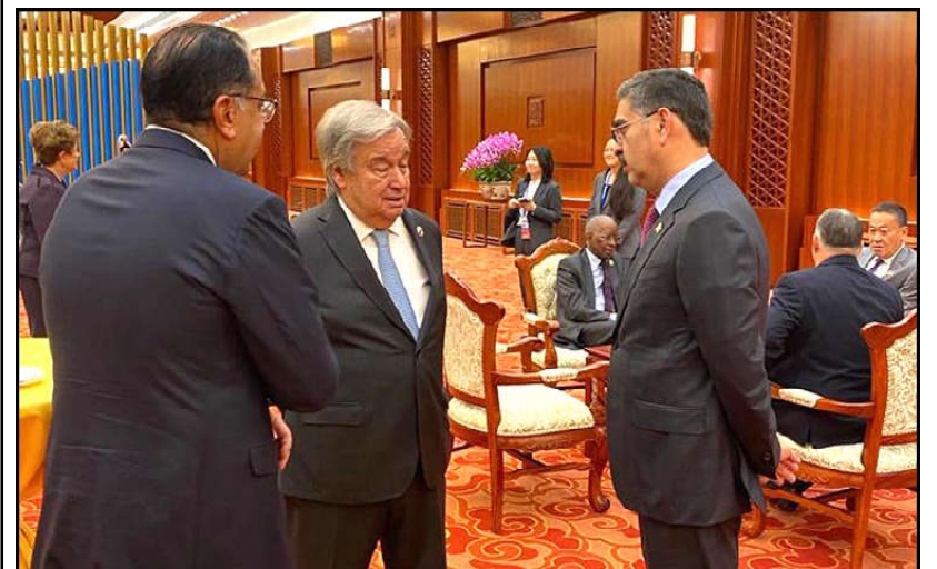
BEIJING: Caretaker Prime Minister Anwaar-ul-Haq Kakar meets Secretary General of United Nations António Guterres on the sidelines of 3rd Belt and Road Forum, Beijing.

He also urged the international community to play its role to end the besiege of Israel at Gaza strip. He also appealed to ensure implementation on the international laws for provision of medical emergency treatment in Gaza.