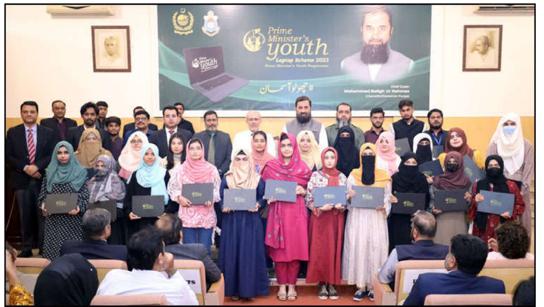
LAHORE: Governor Punjab Muhammad Balighur Rehman in a group photo with students during laptop distribution ceremony under Prime Minister Youth Programme Scheme Phase 3 at Punjab University.

facts. He said that a disappointed nation can never develop. We must avoid those who spread despair, he added. He said that we have to get the nation out of despair. Therefore, the positive aspects should be highlighted. He said that respecting the opinion of others is also very important in a pluralistic society. Governor Punjab said that teachers should also focus on character building of students. He said that our religion has taught us not to believe without verifying the facts.