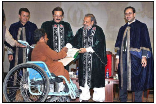
QUETTA: Caretaker Federal Minister for Education and Professional Training Madad Ali Sindhi distributing certificates in a graduation ceremony under PM's Youth Skills Development Program at University of Balochistan.

He said hospitals and medical staff are protected under international humanitarian law and targeting civilian populations and property is a violation of international law and a war crime.