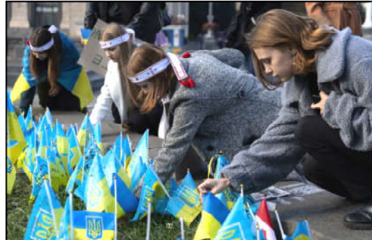
Ukrainian students, who lost relatives due to the Russia-Ukrainian war set flags in their memory on the memorial of fallen Ukrainian soldiers, while attending the reconstruction of a student-led protest campaign "Revolution on Granite" on Independence square in Kyiv, Ukraine.

consensus. Israel's Gilad Erdan said the Security Council, which has not adopted a resolution on the situation in Israel and the Palestinian territories since 2016, stood at "one of its most pivotal crossroads" since its founding in the aftermath of World War II. Palestinian ambassador Riyad Mansour said the council had a moral duty to act in a bid to restrain an Israeli assault on the Gaza Strip he said was claiming 12 lives every hour. "Don't send the signal that the Palestinian lives don't matter," he said.