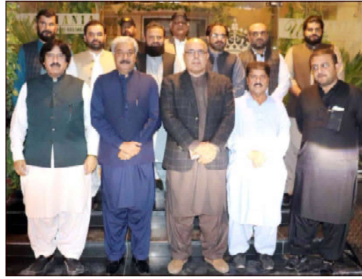
QUETTA: Caretaker Information Minister Jan Achakzai and DGPR Muhammad Noor Khetran in a group photo with members of Balochistan Editors Council

) Waheed Sharif Umrani during a meeting held here on Wednesday. The Secretary RTA called the meeting of transporters in line with the orders of interim provincial government and directives of Commissioner Quetta for reduction in fare of public transport in Quetta and other parts. The transporters on the occasion also apprised Secretary RTA about their issues and apprehensions. The Secretary RTA assured to resolve the issues of transporters.