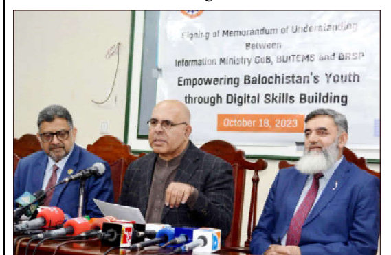
Wednesday that Pakistan will deport all illegal Afghan immigrants by November 1.

Achakzai said that refugees have been treated with