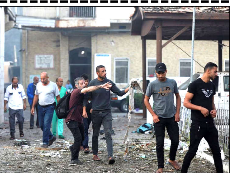
People inspect the area of Al-Ahli hospital, where hundreds of Palestinians were killed in a blast that Israeli and Palestinian officials blamed on each other, in Gaza City.

Monitoring Desk LONDON: Students from the Palestine Society at SOAS (School of Oriental and African Studies) on Tuesday said the university had "suspended students following a rally in solidarity with Gaza". The SOAS Palestine Society posted to X saying, "URGENT: @SOAS University of London, renowned for its so called progressive politics, has officially begun taking steps suspending its own students following a rally in solidarity with Gaza. This is a clear act of political repression. Please read on and share widely." The tweet said that on Oct 9, the Palestine Society and its student community held a rally in solidarity with the people of Gaza and that hundreds of students joined the demonstration. On October 13 and 14, the statement said "students were suspended and given warnings through disciplinary by the university" and said the action by the university demonstrated "a targeted act of political repression. The two leaders con-