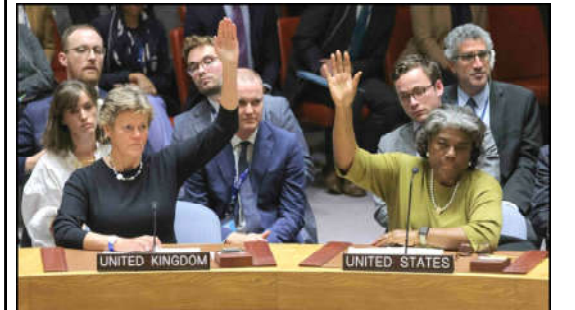
British Ambassador to the United Nations Barbara Woodward and US Ambassador Linda Thomas-Greenfield vote against the resolution.

deemed not to have the right to stay in the 27-nation bloc. Sweden's Prime Minister Ulf Kristersson said Europe's open-border Schengen zone would not survive unless the EU's external frontiers were better protected from unwanted immigration. "If we are not able to protect our common borders, we will not be able to uphold free movement within Europe," he said. Belgian Prime Minister Alexander De Croo said the EU also needed a more effective system of returning unauthorised immigrants. "This is something we need to tackle and can only do that in a coordinated way," he said.