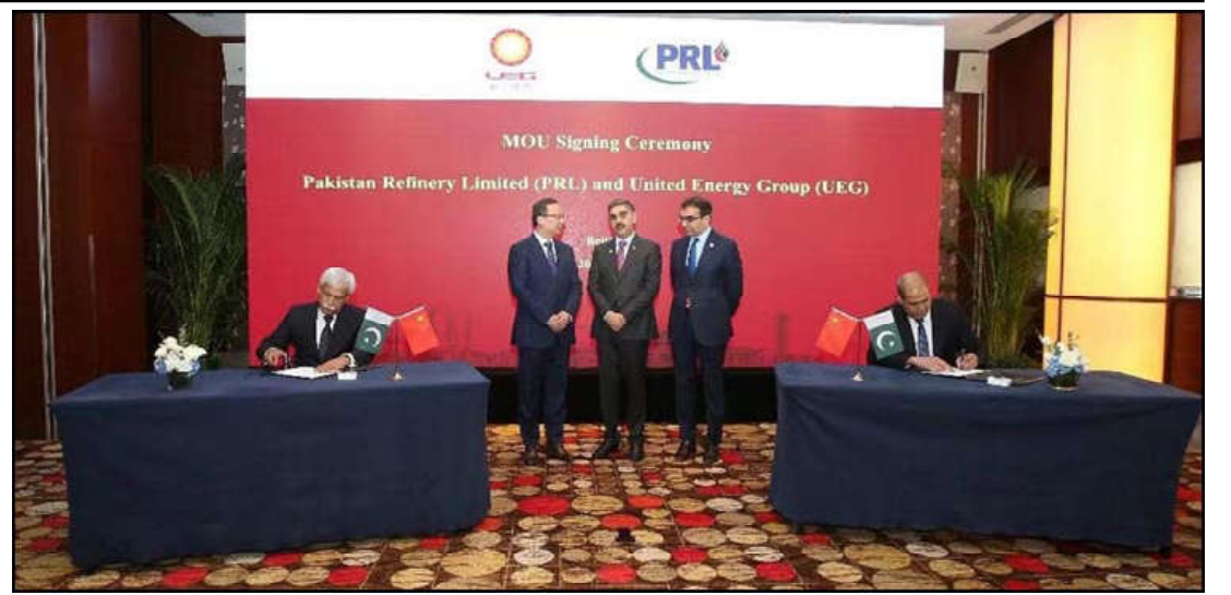
Caretaker Prime Minister Anwaar-ul-Haq Kakar and Caretaker Minister for Energy Muhammad Ali witnessing the signing ceremony of MoU between United Energy Group of China and Pakistan Refinery Limited for investment in the petroleum sector of Pakistan, Beijing.

Launched in 2013, the CPEC was a corridor linking the Gwadar port in southwestern Pakistan with Kashgar in northwest China's Xinjiang Uygur Autonomous Region, which highlights energy, transport and industrial cooperation.