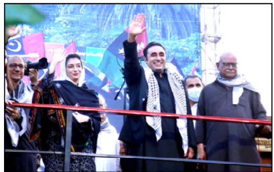
KARACHI: Chairman Pakistan People's Party (PPP), Bilawal Bhutto Zardari and Aseefa Bhutto Zardari wave to crowds at a rally organised on the occasion of anniversary of Karsaz tragedy.

mand for the immediate announcement of election schedule by election commission, saying that Pakistan can be brought back on the path of progress only via elections. Bilawal Bhutto also said that he wants to end the politics of divide and abuse, adding that if politicians keep fighting amongst themselves, the country will not progress. "We have to leave politics of abuses and divide behind. We need new leadership, which is not stuck in the past but thinks about the future. We don't want 90s' Pakistan or 2017's Pakistan. We want today's Pakistan," he added. The PPP chairman also announced that his party was kick-starting their mass contact campaign, which will demand the ECP issue election's date. "Let the people exercise their right to vote; they will have to accept the demand of the people," Bilawal added. Speaking of China-Pakistan Economic Corridor (CPEC), he said that former president Asif Ali Zardari laid the foundation of the mega project.