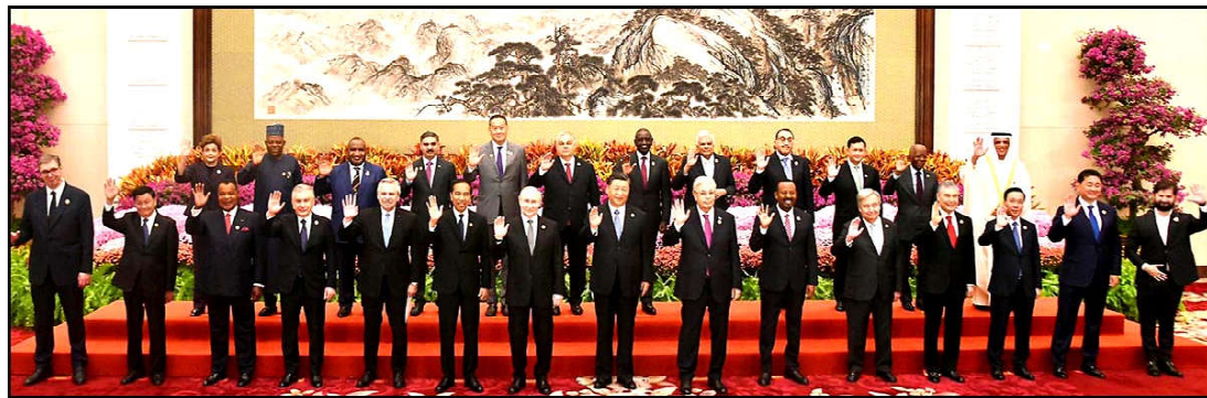
BEIJING: Caretaker Prime Minister Anwaar-ul-Haq Kakar in a group photo with President Xi Jinping and world leaders participating in the 3rd Belt and Road Forum, Beijing.