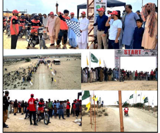
The final motor car race will be held on October 22, which includes international and women racers. District administration, Gwadar Port Authority, District Police, Security Forces, including all civil and military institutions of Gwadar are fully cooperating in organizing that wonderful event. On the occasion of the inauguration of the race, Chairman GPA

separate categories of motorbike races have been added along with the Jeep Rally. A long track of 250 km has been prepared, which includes the beautiful natural scenery of Gwadar, including the beach, desert and mountain areas. The prize distribution ceremony, musical night, fireworks and other interesting and colourful programs are included.