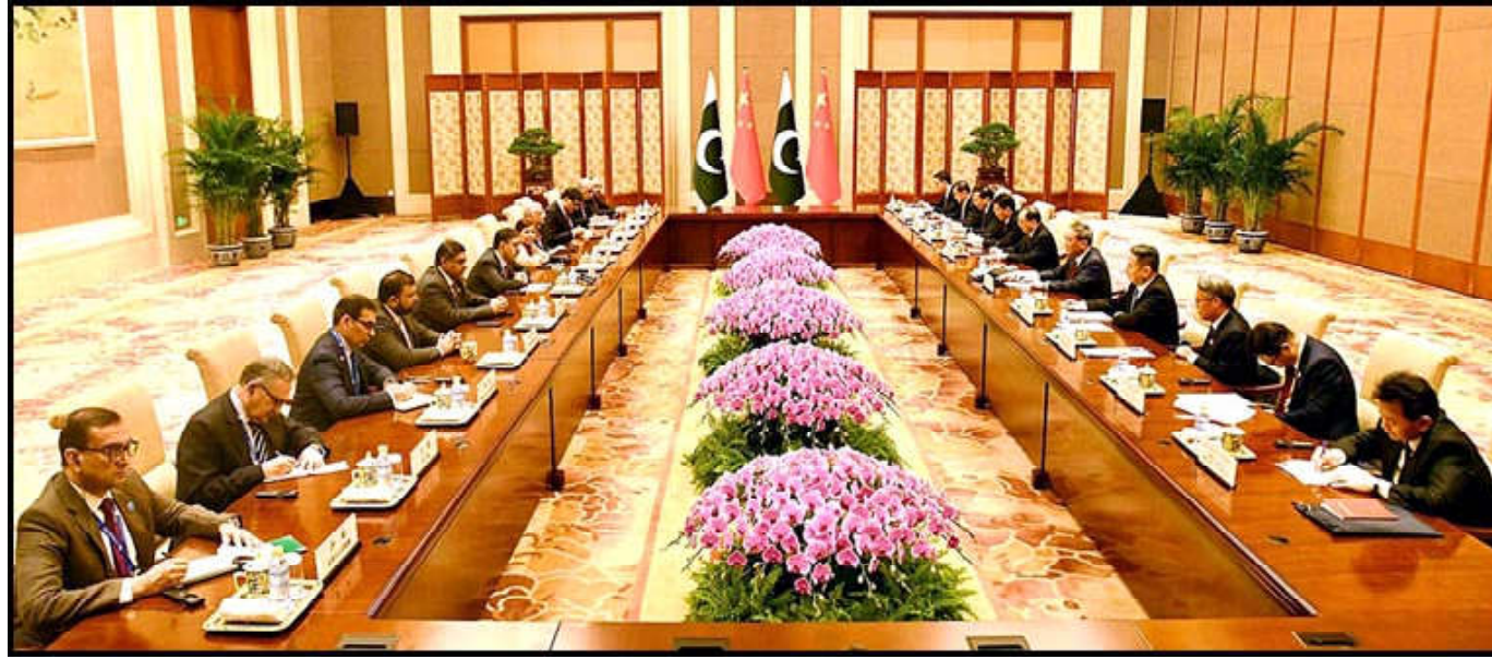
BEIJING: Caretaker Prime Minister Anwaar-ul-Haq Kakar and Chinese Premier Li Qiang met on the sidelines of 3rd Belt and Road Forum.

Ph: 284 1470/2841473 Vol: XVIII No. 289, Rabi-us-Sani 03, 1445 AH Thursday October 19, 2023, Pages 08, Price Rs.15