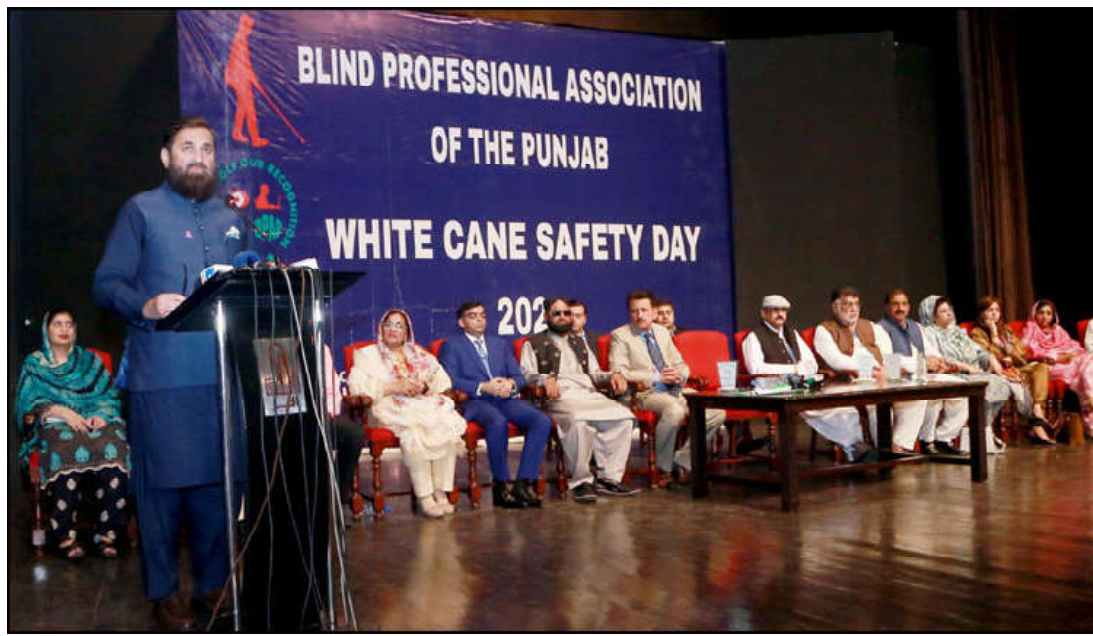
LAHORE: Governor Punjab Muhammad Balighur Rehman addressing a ceremony held in connection with International White Cane Safety Day organized by Blind Professional Association.