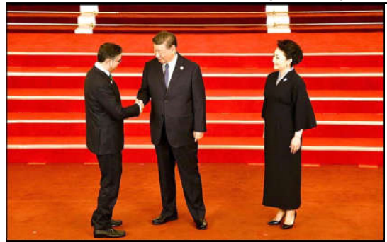
BEIJING: Chinese President Xi Jinping and First Lady, Madame Peng Liyuan welcomed Caretaker Prime Minister Anwaar-ul-Haq Kakar upon his arrival at Great Hall of the People to attend the banquet hosted by President Xi Jinping in honor of the leaders of the countries participating in the 3rd Belt and Road Forum.