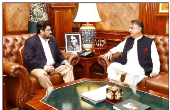
KARACHI: Governor Sindh Kamran Khan Tessori meets with Governor Balochistan Malik Abdul Wali Khan Kakar at Governor House

citizens should be avoided. It noted that the misuse of the authority created fear and insecurity among the people. "An environment of fear creates hatred against the institutions of the state and the media also cannot function freely in such circumstances." The court said that the critics and political opponents should not be considered as enemies. It added that the print and electronic media were the means of conveying information to the public. The judgment further said that it was difficult to believe that public representatives, journalists and political workers could indulge in anti-state activities.