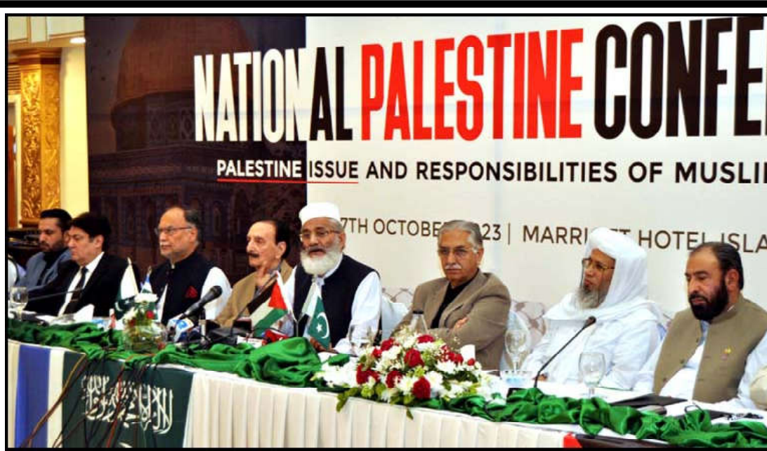
ISLAMABAD: Jamaat-e-Islami (JI) Chief, Siraj-ul-Haq addresses during the National Palestine Conference held in Islamabad.

The collaboration is set to bring together diverse perspectives and insights from experts around the world.