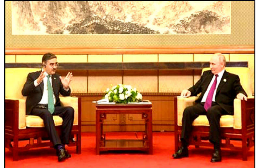
Caretaker Prime Minister Anwaar-ul-Haq Kakar meets Russian President Vladimir Putin on the sidelines of 3rd Belt and Road Forum, Beijing

Pakistan's energy minister had recently attended an Energy Week event in Russia where he had a "fruitful and constructive engagement" with the Russian team. The Russian team had come up with concrete proposals for enhancing energy cooperation, he added. Citing his previous visit to Russia as a senator, the prime minister said he was "mesmerized" by the Russian architecture particularly representing Christianity and churches.