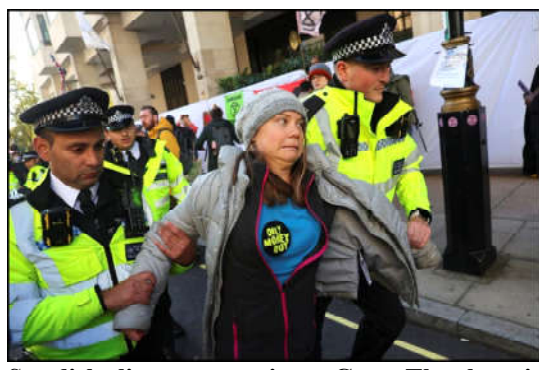
Swedish climate campaigner Greta Thunberg is detained during an Oily Money Out and Fossil Free London protest in London, Britain.

Monitoring Desk DUBAI: Iran's Supreme Leader Ayatollah Ali Khamenei has described Israel's assault on Gaza as a genocide of Palestinians and said it must stop immediately, state TV reported on Tuesday. A senior commander of Iran's Revolutionary Guards (IRGC) also warned of further action by Tehran-backed militant groups against Israel if it did not cease its attacks. Israel has bombed the Palestinian territory of Gaza with air strikes since Hamas fighters burst into Israel from the enclave on Oct. 7 and killed 1,300 people, most of them civilians. It has vowed to annihilate the Tehran-backed Hamas, which rules Gaza. But the Israeli retaliatory strikes have killed more than 2,800 Palestinians, a quarter of them children, and driven around half of the 2.3 million Gazans from their homes. Israel has also imposed a total blockade on the enclave, preventing food, fuel and medical supplies from getting in. "No one can confront Muslims and the resistance forces if the Zionist regime's (Israel) crimes against Palestinians continue. The bombardment of Gaza must stop immediately," Khamenei told a group of students in Tehran. "The world is witnessing the Zionist regime's genocide of Palestinians in Gaza," he said to chants of "Death to Israel".