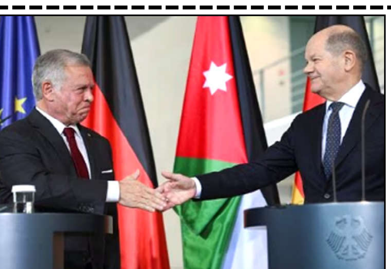
German Chancellor Olaf Scholz and Jordan's King Abdullah II go to shake hands, as they attend a press conference, at the Chancellery in Berlin, Germany.