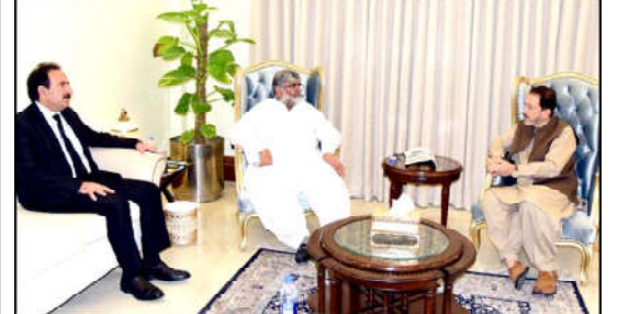
QUETTA: Caretaker Provincial Minister Sheikh Mahmoodul Hassan Mandokhail and Advocate General Asif Reki Advocate meeting with Chief Minister Balochistan Mir Ali Mardan Khan Domki

QUETTA (APP): Balochistan Caretaker Chief Minister Balochistan Mir Ali Mardan Khan Domki said on Tuesday that the digitization of public offices is vital to keeping provincial government affairs efficient, which will not only improve administrative affairs but also create an effective check and balance mechanism. In the briefing given to the caretaker chief minister regarding the Provincial Cloud Strategy and Digital Balochistan Policy, the meeting was informed that the implementation of the Cloud Policy 2023 is aimed at establishing integrated coordination through digitization in departmental af-