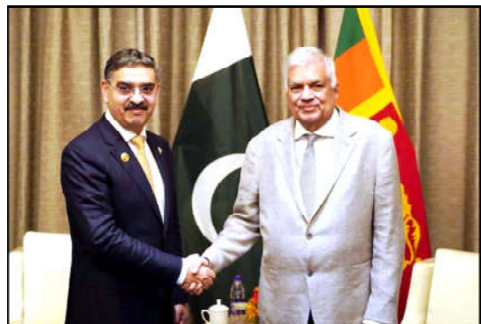
BEIJING: Caretaker Prime Minister Anwaar-ul-Haq Kakar meets President of Sri Lanka Ranil Wickremesinghe on the sidelines of 3rd Belt and Road Forum.

Bilawal said that the Karsaz tragedy will continue to remind us that the nexus of dictatorship and terrorism is the enemy of civilization and humanity. "October 18, 2007, in the form of Shaheed Mohtarma Benazir Bhutto's return from exile, was actually the rebirth of democracy in the country," he said, adding that Shaheed Bibi's mission was to make Pakistan a democratic and economic power in the world by providing basic rights and employment opportunities to the poor people.