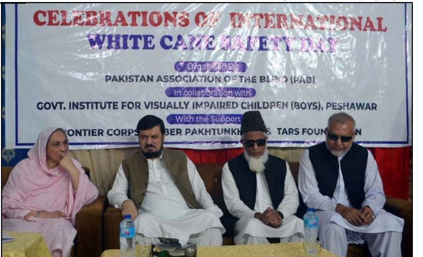
PESHAWAR: Khyber Pakhtunkhwa Governor, Haji Ghulam Ali and others during Celebrations of International White Cane Safety Day organized by Pakistan Association of the Blind (PAB) held in Peshawar.