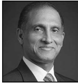
By Aizaz Ahmad Chaudhry

It is heartening to note that according to the 10-year Indicative Generation Capacity Expansion Plan, the country aims to produce 60pc of electricity through non-fossil fuels by 2030. However, maximising the use of coal for the remaining 40pc would nullify these very efforts. Given our potential in hydel, wind and solar energy — with hydel already contributing 37.6pc to the energy mix according to August data — these indigenous, renewable sources should be further explored and optimised. While coal might offer a temporary economic respite, the environmental repercussions are far-reaching and long-term. Pakistan must carve out an energy strategy that not only caters to its immediate needs but also ensures a green and sustainable future. Published in Dawn, October 15 th , 2023.