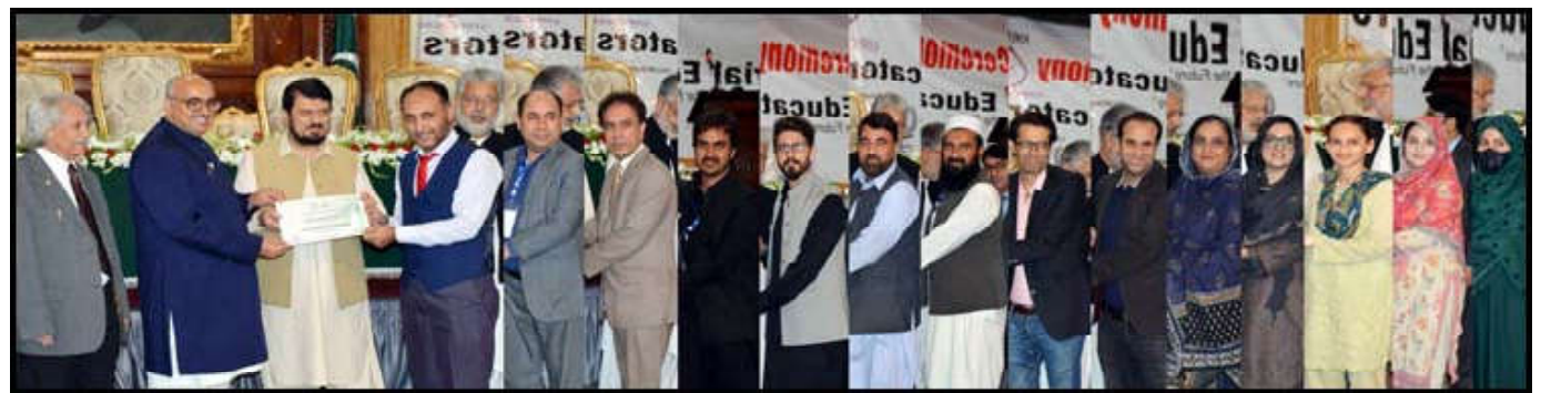
PESHAWAR: Governor Khyber Pakhtoonkhwa Hajji Ghulam Ali distributing appreciation certificates among participants of a ceremony organized by All Private Sector Universities Pakistan (ASUP) at Governor House.