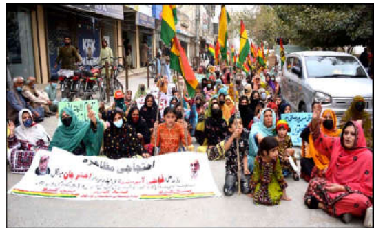
QUETTA: Activists of Balochistan National Party Women Wing hold a protest in favor of their demands outside QPC.

The security forces also seized a large quantity of weapons and explosive material from the possession of killed terrorists.