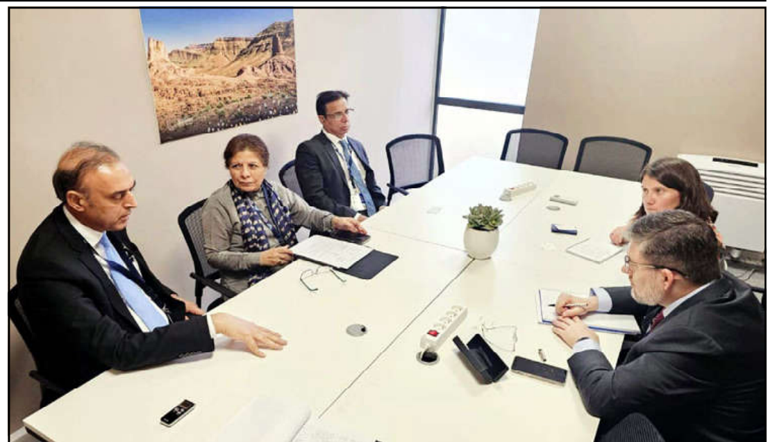
Marrakech: Federal Minister for Finance, Revenue, and Economic Affairs, Dr. Shamshad Akhtar held a meeting with a high-level delegation of Moody's, the global financial services company, during her visit to Morocco for the annual meeting of WB/IMF. During the meeting, Dr. Shamshad Akhtar reiterated the government's commitment to transparency in order to foster investor confidence and maintaining a positive credit rating of Pakistan in the global financial markets.

These efforts are essential to secure a more prosperous, equitable, and sustainable global future, he noted. Concluding his remarks, Al-Budaiwi praised the advancements resulting from the structural reforms implemented by GCC countries in response to economic challenges. These reforms have yielded favourable outcomes, including economic growth, an improved business environment, increased competitiveness, and a substantial rise in women's workforce participation. Furthermore, the non-oil sector experienced a notable increase of 4.8% in 2022.