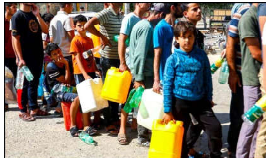
Palestinians queue as they wait to fill cans with fuel, amid shortages of fuel, as the Israeli-Palestinian conflict continues, at a petrol station in Khan Younis in the southern Gaza Strip.

At least 2 dead, over 100 wounded as earthquake jolts Afghanistan