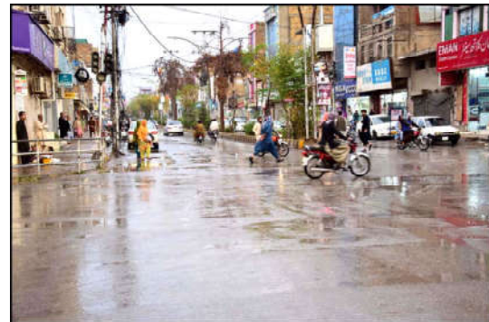
QUETTA: A view of 1st rain of winter in the provincial metropolis

year but the world community has become a mute spectator. He urged the United Nations to play a role in settling the Kashmir dispute in accordance with the UN resolutions and aspirations of the Kashmiri people. The spokesman expressed concern over the silence adopted by the international community on the ongoing worst Indian state terrorism and gross human rights violations in occupied Jammu and Kashmir. Meanwhile, the political experts and analysts in their media interviews and statements have said that the Modi-led fascist Indian government has unleashed its dreaded agencies to suppress the Kashmiris' ongoing struggle for securing their right to self-determination.