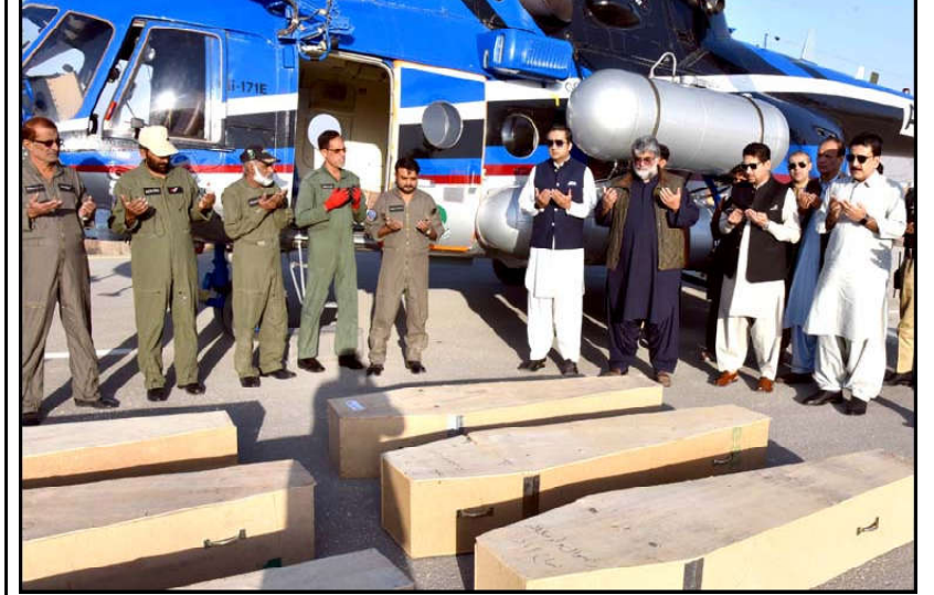
QUETTA: Caretaker Chief Minister Balochistan Mir Ali Mardan Khan Domki offering Fateha for labourers who were killed in Turbat before despatching their dead bodies to Multan

The Governor also said that all the government policies and development projects are aimed at benefiting and empowering the common man. By doing so, the government wants to spend the public budget and exchequer on the public, he maintained.