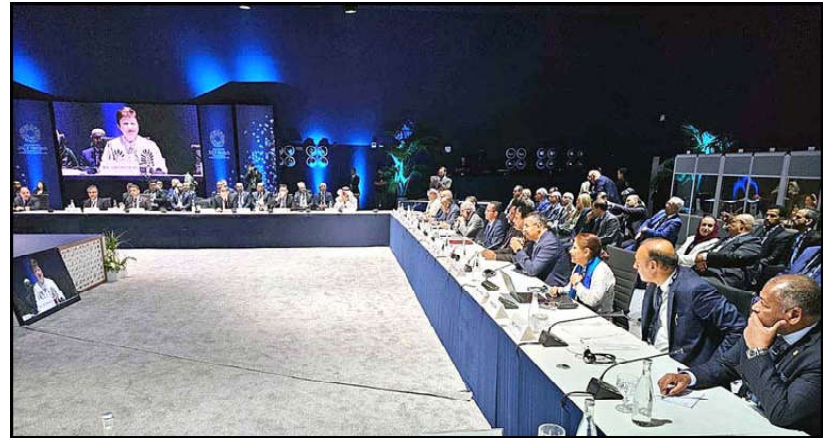
MARRAKECH: Dr. Shamshad Akhtar, Caretaker Federal Minister for Finance, Revenue, and Economic Affairs, participated in a high-profile meeting of Finance Ministers with the Managing Director of the International Monetary Fund (IMF) in Marrakesh.

In order to generate additional revenue to achieve the tax collection target for this fiscal year, the authorities, however, increased the levy on diesel by Rs5 to Rs55 per litre.