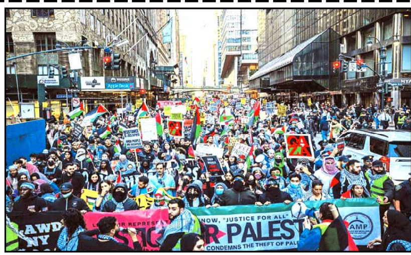
People hold a demonstration in support of Palestinians in New York City.

ements of the investigation. Authorities have suggested a probable link to the ongoing violence in the Middle East, with President Emmanuel Macron denouncing the incident as an act of "Islamist terror". The deployment of the soldiers from Operation Sentinelle will be completed by Monday evening, according to the Elysee presidential palace. Sentinelle is a French military operation with 10,000 soldiers and 4,700 police and gendarmes deployed since the aftermath of the January 2015 attacks.