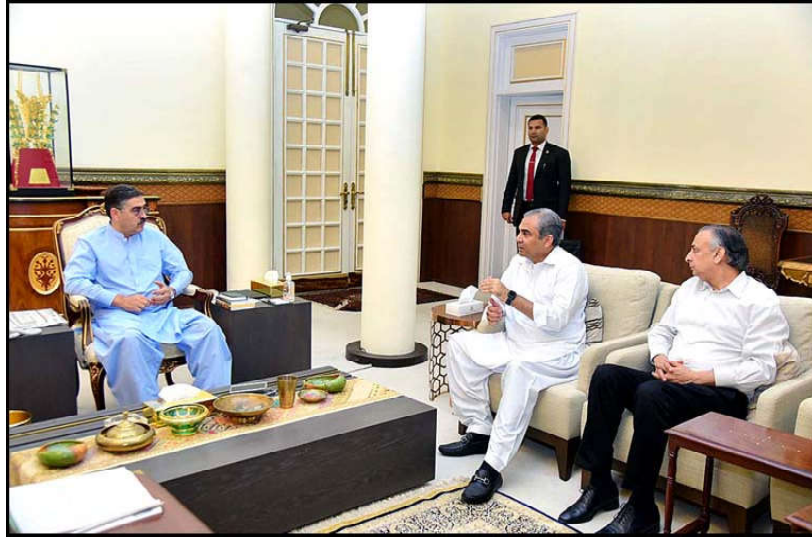
ISLAMABAD: The Caretaker Chief Minister of the Punjab Mohsin Naqvi calls on the Caretaker Prime Minister Anwar-ul-Haq Kakar.

"We are striving to open certain patches of the road for traffic in November as per instructions of Caretaker Prime Minister Anwar ul Haq Kakar," Shahid said.