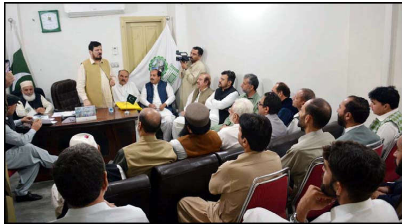
SWAT: Governor Khyber Pakhtoonkhwa Haji Ghulam Ali addressing office bearers of Chamber of Commerce & Industry and trader community during his visit of Swat.