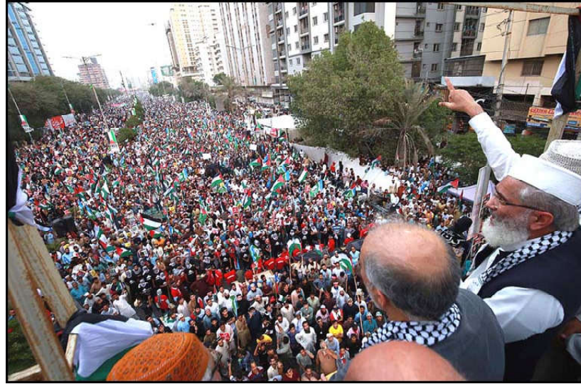
KARACHI: Ameer Jamaat-i-Islami Siraj ul Haq addresses "Al Aqsa Palestine March" organized by JI at Shahrah-e-Faisal.