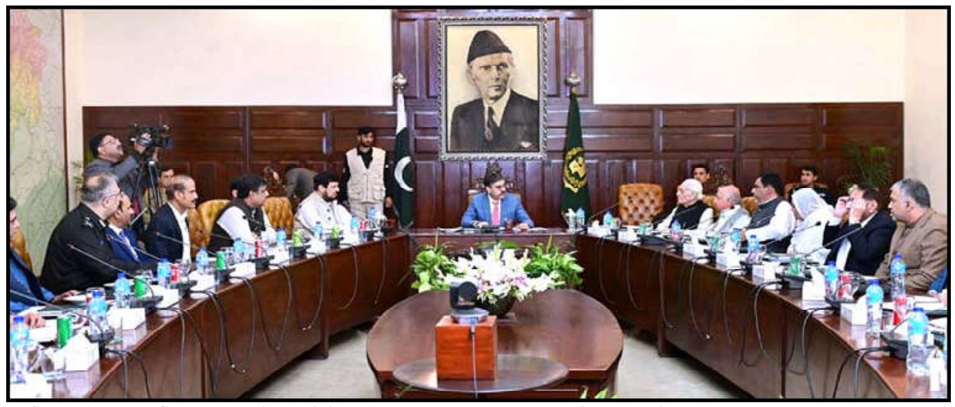
PESHAWAR: The Caretaker Prime Minister Anwaar-ul-Haq Kakar chairs a meeting on the matters related to Khyber

Ph: 2841470/2841473 Vol: XVIII No. 285, Rabi-ul-Awwal 27, 1445 AH Satuurday October 14, 2023, Pages 08, Price Rs. 15