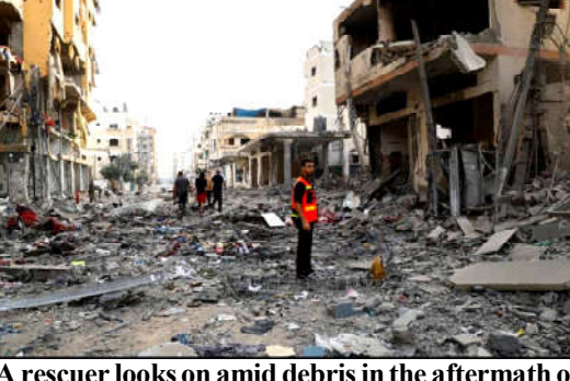
Israeli strikes, in Gaza City.

sides" "And most importantly, the civilian casualties will be absolutely unacceptable. Now the main thing is to stop the bloodshed," he said.