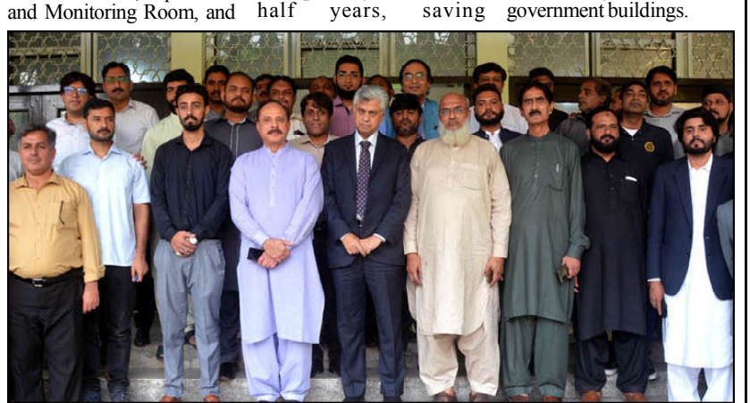
LAHORE: A group photo of Caretaker Federal Minister for Information and Broadcasting Murtaza Solangi with Radio Pakistan Staff.

As part of the Nankana Sahib Safe City project, a total of 30 kilometers of optical fiber has been laid throughout the city. This project has been seamlessly integrated with the Lahore Safe City network. Notably cameras have been strategically installed to enhance security at Sikh places of worship, Ashura routes, religious sites, and government buildings.