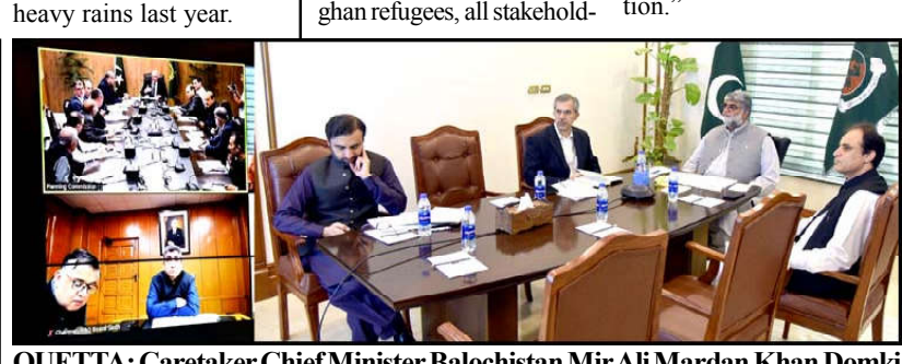
QUETTA: Caretaker Chief Minister Balochistan Mir Ali Mardan Khan Domki attending meeting of Policy & Strategy Committee formed about rehabilitation activities after last year's devastating floods between the government of Pakistan and international relief institutions through video link

"People, no matter which nationality they belong to, will not be troubled if they have a valid visa and other required documenta-