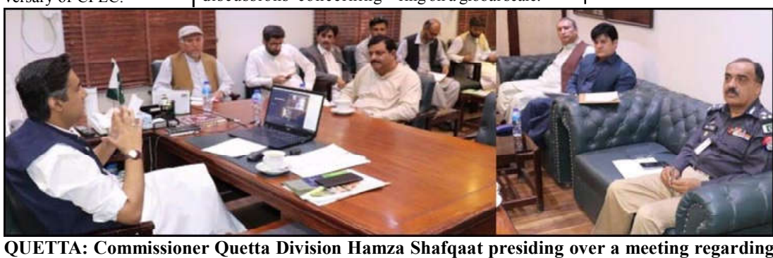
repatriation of Afghan refugees.

The discussion also encompassed contempo-