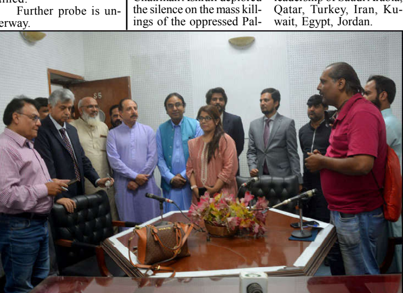
LAHORE: Caretaker Federal Minister for Information and Broadcasting, Murtaza Solangi visit Radio Pakistan.

estinians. He emphasized that for decades, Israel had been subjecting innocent civilians, hospitals, schools, and ambulances to its ruthless aggression. Notably, he said the United States, India, the United Kingdom, and other Western nations remained silent in the face of Israeli brutality, disregarding the principles of human rights. He called for swift action from the Muslim leaders to halt Israel's aggression stressing that at this moment, the entire Muslim world stood with their oppressed Palestinian brothers and sisters. He appreciated the unwavering efforts and stance of the leadership of Saudi Arabia,