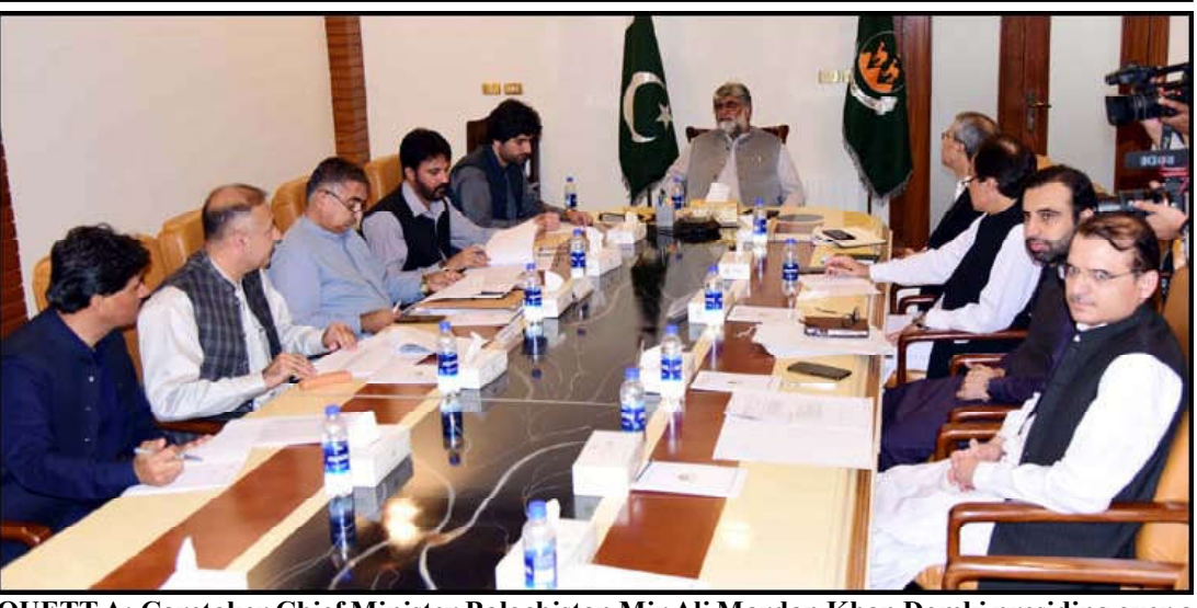
QUETT A: Caretaker Chief Minister Balochistan Mir Ali Mardan Khan Domki presiding over a meeting regarding National Program for Agriculture Development and Alternate Energy.