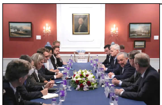
U.S. Senate Majority Leader Chuck Schumer, D-N.Y., speaks during a press roundtable with Schumer and his delegation at the residence of U.S. Ambassador to China, in Beijing.

Schumer later told reporters the meeting with Xi lasted 80 minutes, double the allotted time. Earlier China's top diplomat Wang Yi said he hoped Washington and Beijing could manage their differences "more rationally". Meeting with Schumer at Beijing's Diaoyutai State Guest-house, Foreign Minister Wang told the senate delegation he hoped their visit would help the two sides "manage existing differences more rationally, helping the relationship between the two countries return to the track of healthy development".