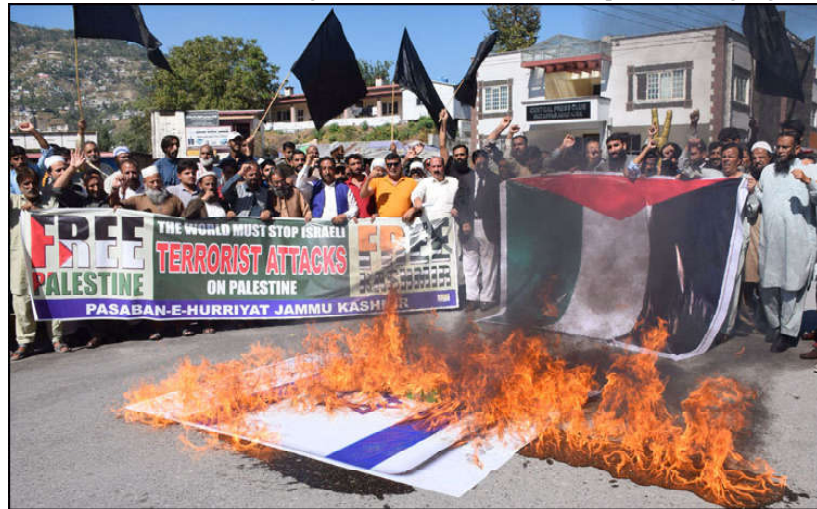
MUZAFFERABAD: Activists of Pasban-e-Hurriyat holds protest and burns Israiclan flag at Azadi Chowk to show solidarity with Palestinian People.