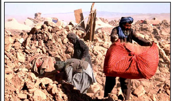
Afghan residents clear debris of damaged houses after earthquake in Nayeb Rafi village, Zenda Jan district of Herat province.

The KFOR peacekeepers—made up of around 4,500 troops from 27 nations—have been in Kosovo since June 1999, basically with light armament and vehicles. The 1998-1999 war between Serbia and Kosovo ended after a 78-day NATO bombing campaign forced Serbian forces to withdraw from Kosovo. More than 10,000 people died, mostly Kosovo Albanians. On Sept. 24, around 30 Serb gunmen killed a Kosovar police officer and then set up barricades in northern Kosovo before launching an hours-long gun battle with Kosovo police.