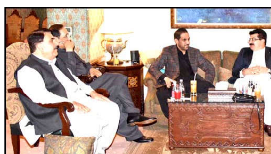
Chairman Senate, Muhammad Sadiq Sanjrani exchanging views with former Chief Minister of Balochistan, Mir Abdul Qudous Bizenjo in Islamabad.

Former Chief Minister Abdul Qudous Bizenjo expressed gratitude towards the Chairman Senate, acknowledging the continuous guidance provided by him for the development of Balochistan.