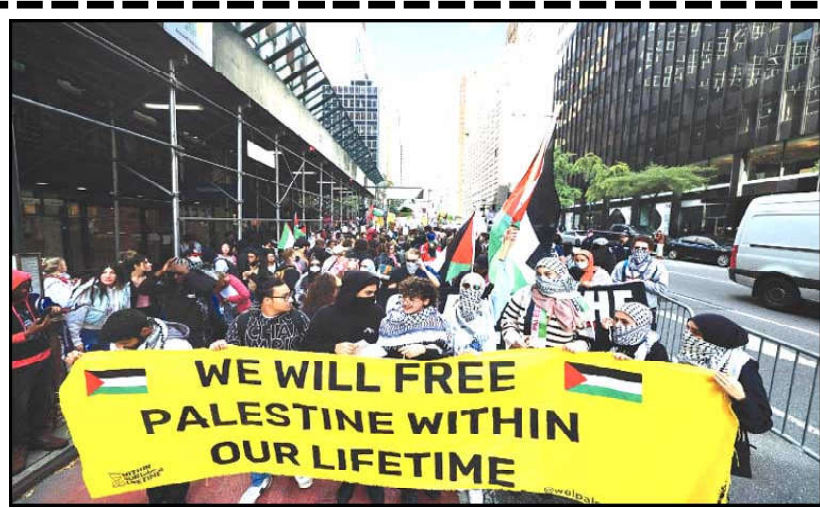
NEW YORK: Demonstrators gather in support of the Palestinian people during a rally for Gaza outside the Consulate of Israel.

Families have reportedly been abducted, leaving relatives in the dark about what happened to them. Hamas has threatened to kill a hostage whenever Israel fires an airstrike in retaliation without giving civilians the time to flee. According to Palestinian health officials, 4,000 people have been hurt in strikes so far, and 770 Palestinians have died in the Gaza Strip. Hamas sources in Lebanon have told Sky News the "operation" on Saturday was in the planning for more than a year.