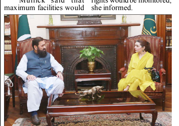
LAHORE: Special Assistant to Prime Minister for Human Rights Mushaal Hussein Malik meeting with Governor Punjab Muhammad Balighur Rehman.

Mullick said that maximum facilities would be provided to prisoners through her mandate of human rights and women empowerment, adding that prisoners' rights according to the Geneva Convention should be protected. She said that a 100-day plan would be launched next week with special focus on protection of prisoners' rights and for their rehabilitation. She said that a rehabilitation proposal is being prepared with the coordination of Legal Aid and Justice Authority (LAJA) for juveniles and women in jails. Under the proposal legal aid would be provided to prisoners while their facilities and rights would be monitored, she informed.