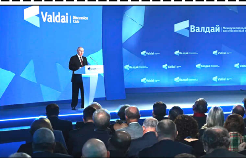
Russian President Vladimir Putin addresses the annual meeting of the Valdai Discussion Club in the Black Sea resort of Sochi, Russia.