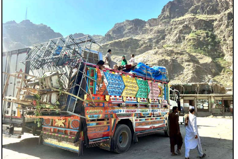
LANDIKOTAL: Unregistered Afghan families are willingly enroute their home land passing through Khyber Pass with their homes necessities after the government decided in the apex committee meeting to expell all those Afghans who are living in Pakistan unlawfully

year — said his elder brother will arrive at the Minar-e-Pakistan following his return to Pakistan. Nawaz, the three-time prime minister, has been living in London following a self-imposed exile since November 2019 owing to health reasons. He was disqualified for life in 2017 by the Supreme Court for not declaring a receivable salary. Meanwhile, speaking about his government's performance before the caretaker government took over, the former premier said: "We desperately tried to solve the problems in 16 months. Shehbaz said, God forbid, what would be the situation had Pakistan actually gone bankrupt?"