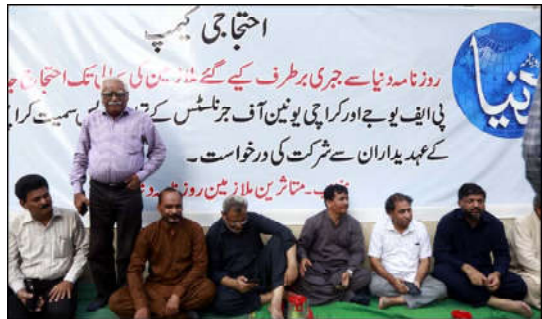
KARACHI: Employees of private news channel are holding protest demonstration against forced dismissals, at Karachi press club.

the IGP mentioned that a similar system has been initiated in D.I. Khan, Haripur, Kohat, and Nowshera. Modern cameras have been installed at 34 of the busiest intersections in Mardan city under the Command and Control Center. The IG Police also inaugurated the distribution of police equipment and the new computerized resource management system for security. The IGP also inaugurated the Ababeel Force, consisting of 50 motorbike riders, for urban policing in the city, emphasizing the importance of urban policing.