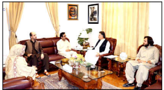
QUETTA: A delegation of Institute of Architects Pakistan Quetta Chapter led by Saif Dotani meeting with Governor Balochistan Malik Abdul Wali Khan Kakar