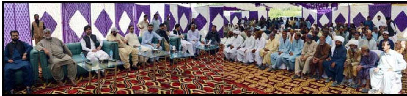
LEHRI: Caretaker Chief Minister Balochistan Mir Ali Mardan Khan Domki meeting with tribal elders.