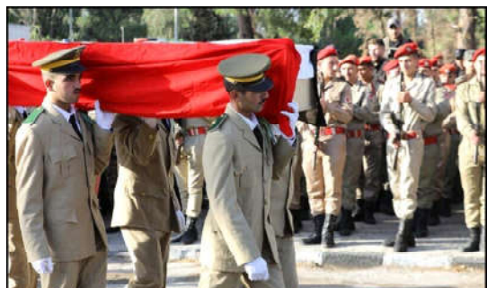
An soldiers carry a casket during the funeral of the victims of a drone attack targeting a Syrian military academy, outside a hospital in government-controlled Homs.

Monitoring Desk STOCKHOLM: Sweden will send Ukraine a new military support package worth 2.2 billion crowns ($199 million) - consisting mainly of artillery ammunition - and is looking into sending fighter jets, Defence Minister Pal Jonson said. Jonson told a news conference the armed forces were due to report by Nov. 6 on the potential for sending Jas Gripen jets to Ukraine after the government asked them to assess the issue. But he reiterated that Sweden would for domestic security reasons need to become member of NATO before it would be able to potentially spare any fighter jets. Sweden hopes to join the NATO defence alliance soon although its accession has been held up by member states Turkey and Hungary. The new military aid package will be Sweden's 14th to Ukraine since Russia's invasion, taking the total value of the Nordic country's such aid to just over 22 billion crowns. "We need to design our support so that it's long term and sustainable," Jonson said. "It is now important that more countries step up to support Ukraine."