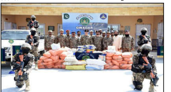
UTHAL: Pakistan Coast Guards seize huge quantity of narcotics from a vehicle.

Independent Report QUETTA: The Pakistan Coast Guard recovered huge quantity of narcotics from a vehicle in Gwadar on Friday morning. According to the spokesman of Coast Guard, a patrolling party of Coast Guard tried to intercept a vehicle in Bandri area of Gwadar. However, instead of stopping the vehicle, driver flee from the scene. The Coast Guard sources informed that the value of seized narcotics is stated to be over 21.84 million US dollar in the international drugs market.