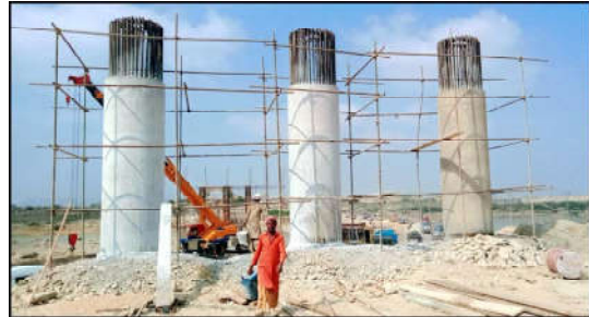
HUB: Construction works of Sindh and Balochistan connecting Bridge is underway, in Hub.