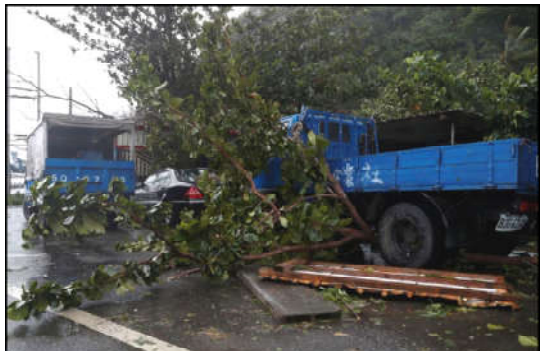
A fallen tree branch is pictured under a truck after Typhoon Koinu passed the southern tip of Taiwan, on the outskirts of Dawu, Taiwan.

Monitoring Desk MEXICO CITY: The U.S. government does not want to build new sections of wall on its border with Mexico, Mexican President Andres Manuel Lopez Obrador said on Friday, expressing doubt that the planned construction would be carried out. "It's pure publicity," Lopez Obrador said in a regular morning press conference after the Biden administration announced it would build additional sections of border wall.