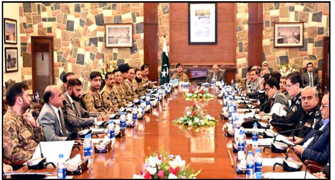
KARACHI: Caretaker Chief Minister Sindh, Justice (Retd) Maqbool Baqar chairs Provincial Apex Committee meeting held at CM House in Karachi. Chief of Army Staff (COAS), General Asim Munir is also present.

Transformation Plan, Progress on SIFC initiatives in Sindh and Green Sindh initiatives. The Army Chief underscored the need for synergy among all relevant departments for the gainful effects of the landmark initiatives. The participants affirmed that state institutions, government departments and people are united for the progress and prosperity of the province. Earlier, upon arrival, the COAS was received by Commander Karachi Corps.