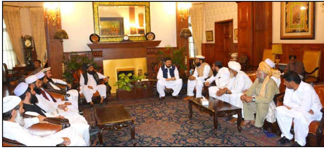
PESHAWAR: A delegation of tribal elites of merged Districts meeting with Khyber Pakhtunkhwa Governor Haji Ghulam Ali.

Pakistan friendship has a rich history, solid foundation fruitful outcomes, and promising prospects. He also stressed that the youth are the hope of the nation and the scholarship aimed to support students in realizing their dreams and contributing to the strong bond between China and Pakistan. Speaking at the ceremony, the Vice Chancellor expressed his profound gratitude towards the Chinese embassy for its unwavering support of the University of Sargodha. He stated, "Education is a powerful tool for building bridges and strengthening the bonds of friendship between nations."