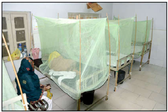
HYDERABAD: Dengue patients are under treatment at Bhitai Hospital as the dengue fever is spreading at an alarming proportion in the city.

MIRUR (AJK) (APP): Azad Jammu and Kashmir government has constituted 16-Member Cabinet Reconciliation Committee headed by the minister Faisal Mumtaz Rathore to get rid of the ongoing crises over high local power tariff and price hike besides non-availability of flour on subsidised rates and other identical issues. "In the larger public interest, the AJK government has been pleased to constitute the Reconciliation Committee comprising following members", an official order issued by AJK PM office late Thursday said. Quoting the official order issued late Thursday by the AJK PM office in the state metropolis, top official sources told APP here on Friday that led by the minister Faisal Mumtaz Rathore, belonging to PPP AJK in this coalition government, the committee is comprising ministers including Sardar Mir Akbar Khan.