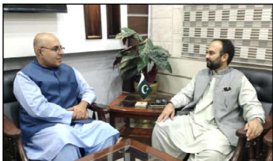
QUETTA: Caretaker Provincial Information Minister Jan Achakzai meeting with Caretaker Home Minister Captain (Retd) Muhammad Zubair Jamali

QUETTA (INP): Balochistan Caretaker Information Minister Jan Achakzai has said that stern action will be taken against the elements involved in terrorist activities. Addressing a press conference in Quetta on Wednesday, he said that the provincial government will also deal the illegal foreign citizens according to the law to ensure implementation of decisions of apex committee. Jan Achakzai further stated that no one would be allowed to cross our borders without passport. The Information Minister said Afghan citizens have been involved in terrorist activities in the country.