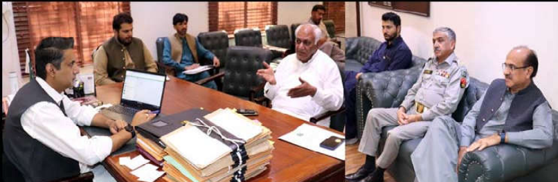
QUETTA: Commissioner Quetta Division Hamza Shafiq at presiding over a meeting regarding issues of traffic and its solution

He said that DHIS provides a baseline data for implementation of district planning and monitoring of disease patterns, key indicators of preventive services, saying that responds to the information needs of the district TB program system performance monitoring function at both the district and provincial levels. The overall objective of the feedback report from the DHIS program is to inform district managers and facility-in-charges about performance and TB disease and treatment, to meet the critical health information needs of the federal and provincial levels to monitor policy.