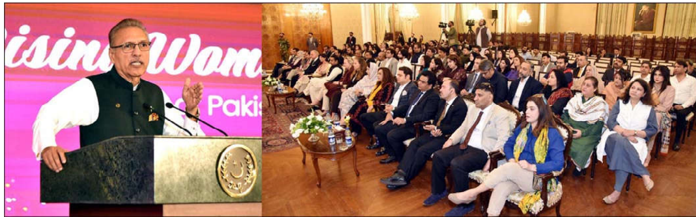
President Dr Arif Alvi addressing an event themed 'Rising Women 2023', organized by Women's Business Network (WBN), at Aiwan-e-Sadr, Islamabad