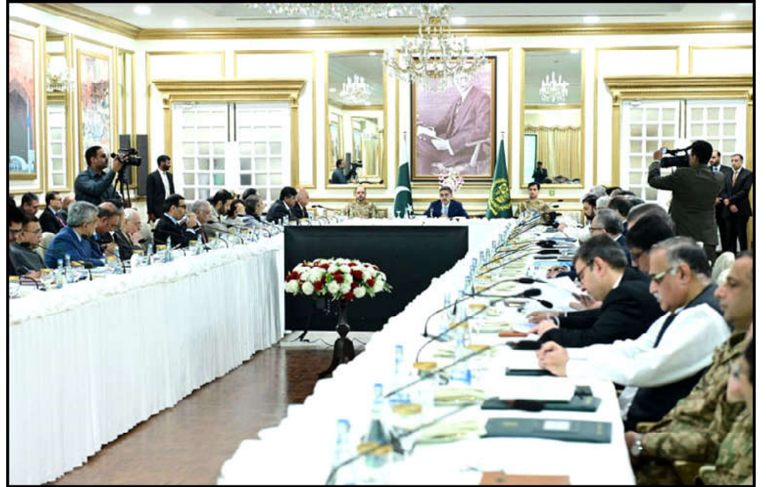
ISLAMABAD: Caretaker Prime Minister Anwaar-ul-Haq Kakar chairing 6th meeting of the Apex Committee of Special Investment Facilitation Council