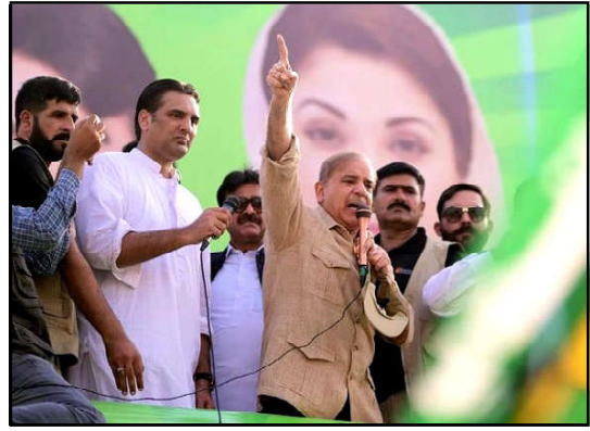
LAHORE: PML-N President Shehbaz Sharif addressing a political gathering.

Some 200 illegal Afghan refugees arrested under Foreign Act, says Commissioner