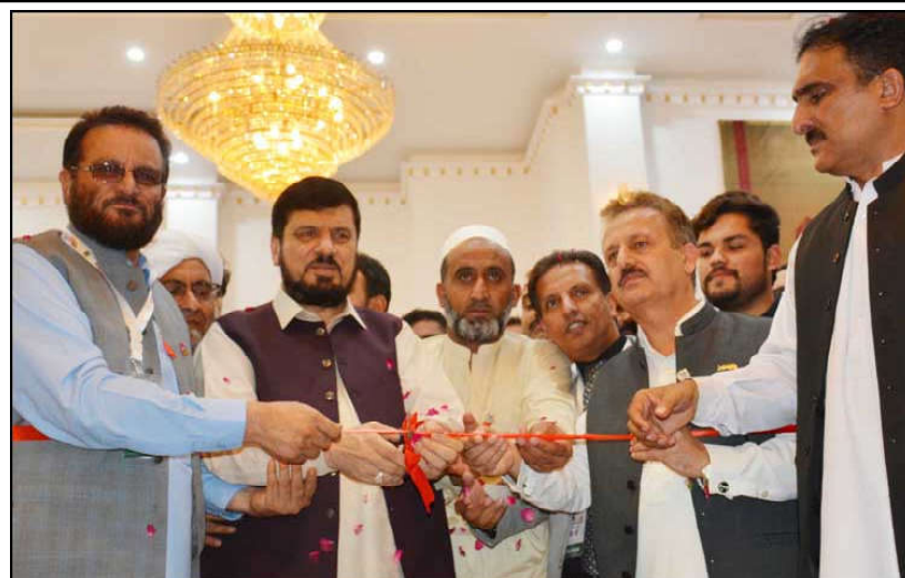
PESHAWAR: Governor Khyber Pakhtunkhwa, Haji Gulam Ali cutting ribbon to inaugurate Mega International Livestock & Fisheries Expo organized by the provincial livestock department.

He outlined three key priorities for the energy sector.