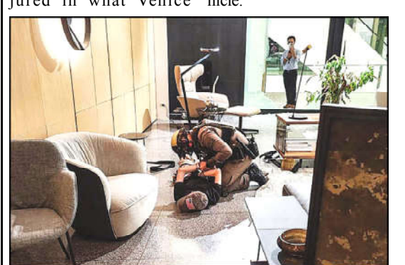
BANGKOK: This handout photo from the Royal Thai Police shows the arrest of a 14-year-old shooting suspect at the Siam Paragon shopping centre.