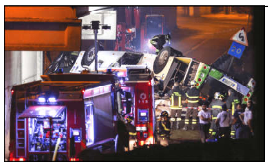
Firefighters and rescue personnel work near a coach after it crashed off an overpass near Venice, in Mestire, Italy.

ments suggest that Turkiye could expand its air strikes to include war-torn Syria. Syria's Kurds have carved out a semi-autonomous area in the country's north and east. US-supported Syrian Democratic Forces (SDF) — the Kurds' de facto army in the area — led the battle that dislodged Islamic State group fighters from the last scraps of their Syrian territory in 2019. But Turkiye views the Kurdish People's Protection Units (YPG) that dominate the SDF as an offshoot of the PKK. Turkish President Recep Tayyip Erdogan has repeatedly threatened to expand attacks against the YPG.