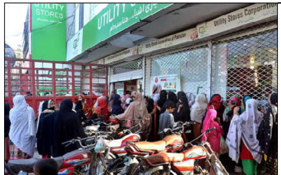
MULTAN: A large number of women standing in a queue waiting their turn outside Utility Store to purchase grocery items at Rasheedabad.

Under this Act, individuals involved in damaging gas pipelines can face up to 14 years in prison and a fine of Rs 10 million.