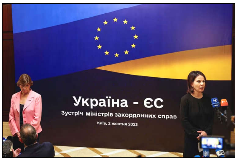
French Minister for Europe and Foreign Affairs Catherine Colonna and German Foreign Minister Annalena Baerbock speak to the media before EU-Ukraine foreign ministers meeting, amid Russia's attack on Ukraine, in Kyiv, Ukraine.

"I am sure that Ukraine and the entire free world are capable of winning this confrontation. But our victory depends directly on our cooperation with you."