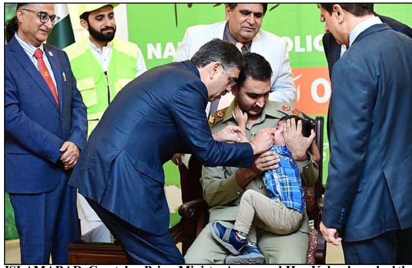
ISLAMABAD: Caretaker Prime Minister Anwaar-ul-Haq Kakar launched the National Polio Eradication Campaign by administering polio drops to child.