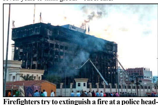
Firefighters try to extinguish a fire at a police headquarters in Ismailia.

While addressing a major international concern, his remarks came at a marquee oil industry event highlighting the state oil company he oversees — feeding the concerns of those already critical of his appointment while also drawing applause from the same energy firms he wants to court at the upcoming COP28 talks starting in November. "That is our North Star. It is, in fact, our only destination," al-Jaber said.