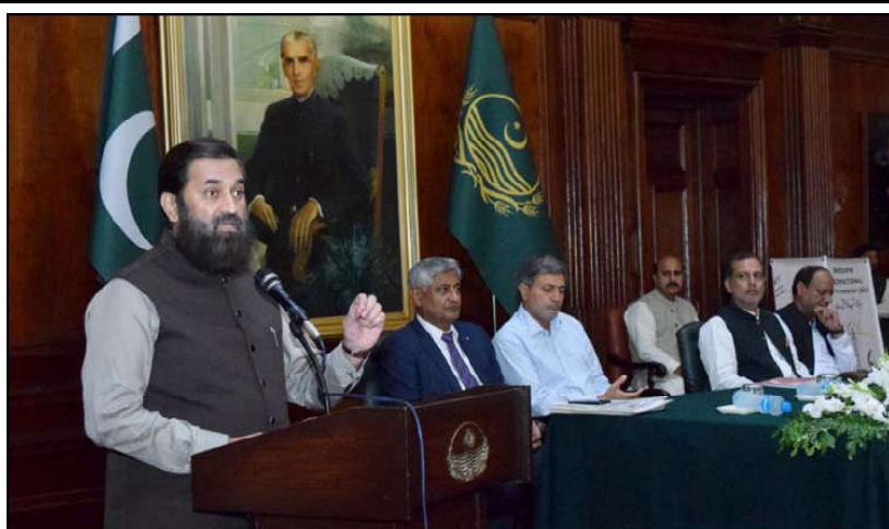
LAHORE: Governor Punjab Muhammad Balighur Rehman addressing 'Right to Information Day' function as a special guest at Governor House.