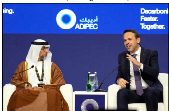
Turkish Energy Minister Alparslan Bayraktar, right, and United Arab Emirates Energy Minister Suhail al-Mazrouei attend the ADIPEC, Oil and Energy exhibition and conference in Abu Dhabi, United Arab Emirates.

While Senate Majority Leader Chuck Schumer, D-N.Y., has begun a process to potentially consider legislation providing additional Ukraine aid, House Speaker Kevin McCarthy, R-Calif., faces a more difficult task in keeping the commitment he made over the objections of nearly half of his GOP majority. He told CBS "Face on the Nation" that he supported "being able to make sure Ukraine has the weapons that they need," but that his priority was security at the U.S.-Mexico border.