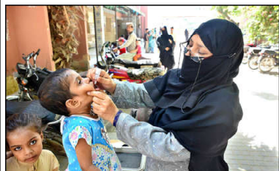
HYFERABAD: Health worker administering polio vaccine drops to a child during a Polio vaccination campaign at Government Hospital at Norani basti.

He said RTI has a key role in eradicating corruption in government institutions, making the work of public officials effective and in good governance, adding the RTI Act ensures transparency in the financial and administrative affairs of government institutions.