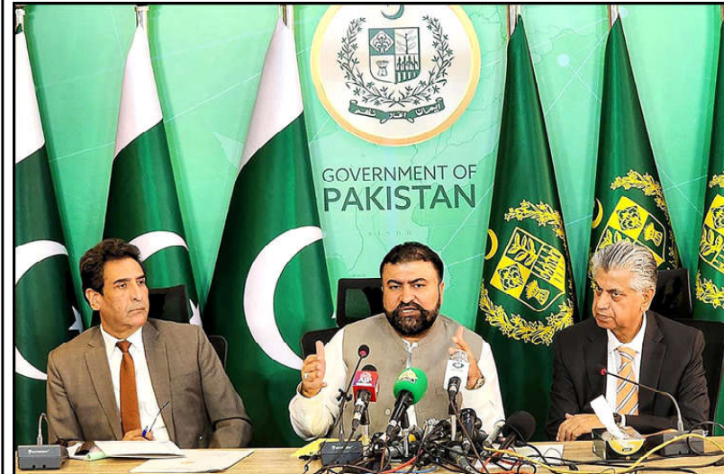
ISLAMABAD: Chairman Federal Minister for Interior Sarfraz Ahmed Bugti and Caretaker Federal Minister for Information and Broadcasting Murtaza Solangi addressing a press Conference.