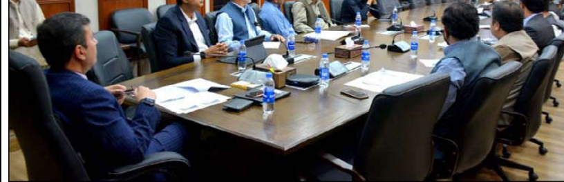
QUETTA: Balochistan Chief Secretary Shakeel Qadir Khan presiding over a meeting regarding Price Control Mechanism

The prime minister said the Islamic Ideology Council had been playing active role in maintaining law and order and religious harmony in the country.