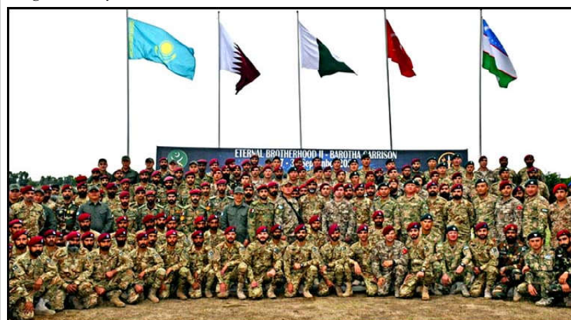
The two-week-long Exercise Eternal Brotherhood-II commenced on September 17 in Barotha, the Inter-Services Public Relations (ISPR) news release said. The Corps Commander 11 Corps attended the Closing Ceremony as Chief Guest along with the Director General Military Training and General Officer Commanding Special Service Group.

RAWALPINDI (APP): The Multinational Joint Special Forces Exercise Eternal Brotherhood-II conducted among Special Forces of Pakistan, Kazakhstan, Qatar, Turkiye and Uzbekistan in Counter Terrorism domain has concluded, the Military's media wing on Sunday said.