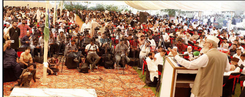
LAHORE: Amir Jamaat-e-Islami Sirajul Haq addressing Workers Convention and Youth Talent Award ceremony

SRINAGAR (INP): Indian troops in their unabated acts of state terrorism martyred thirteen (13) Kashmiris in the last month of September in Indian illegally occupied Jammu and Kashmir. According to the data issued by the Research Section of Kashmir Media Service, today, of those martyred nine (09) Kashmiris were killed in different fake encounters. During the month, eight youth were critically injured due to use of brute force by Indian paramilitary and police personnel in the territory. At least 157 civilians and political activists were arrested and most of them were booked under black laws, Public Safety Act (PSA) and Unlawful Activities (Prevention) Act (UAPA).