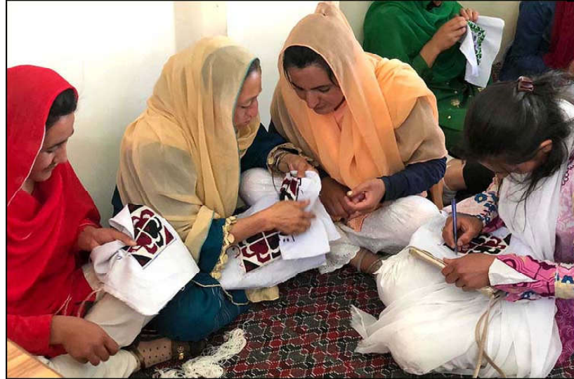
GILGIT: Skilled women are embroidering bed sheets and pillows for sale at the Women's Market.