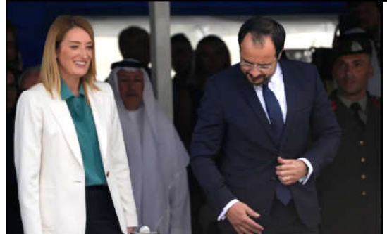
MALE: Officials count votes at a polling station during the second round of Maldives' presidential election.

government in the Islamic world," Raisi said during an international Islamic conference held in Tehran.