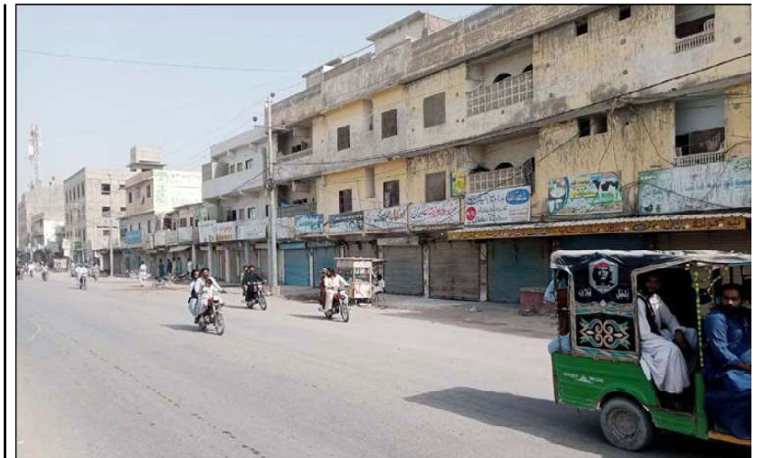
HUB: View of business activities seen closed while markets gives desert look during the shutter down strike called by religious parties against the bomb blast during procession of 12th Rabi-ul-Awwal Eid Milad-un-Nabi in Mastung.

The Minister Information also paid homage to the martyrs of security forces and other law enforcement agencies on their sacrifices for the sake of country.