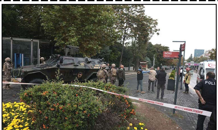
Members of Turkish Police Special Forces secure an area following an explosion near the Interior Ministry in Ankara, Turkey.

Monitoring Desk KYIV: European Union foreign policy chief Josep Borrell said during a visit to Kyiv on Sunday that Ukraine needed more military aid and he promised ongoing EU support.