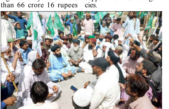
NASEERABAD: Members of various Sunni organizations are holding protest demonstration against the bomb attack on religious procession of 12th Rabi-ul-Awwal Eid Milad-un-Nabi in Mastung District, held at Dera Murad Jamali.

MULTAN (INP): A group of beggars bound to Saudi Arabia under the guise of Umrah pilgrims were intercepted and offloaded on Sunday. FIA officials said that eight people were going to Saudi Arabia on Umrah visa to persevere begging. As per the agreement, half of the money obtained from begging was supposed to be divided with the travel agent. "After the expiry of the Umrah visa, the passengers had to return to Pakistan," FIA told media persons in a statement issued. Earlier, FIA offloaded 16-member family including an infant who were going to Saudi Arabia for begging.