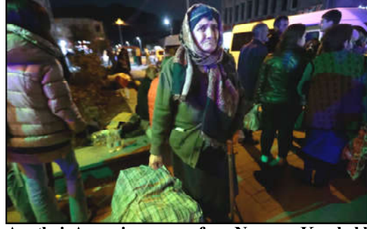
An ethnic Armenian woman from Nagorno-Karabakh carries her suitcase to a tent camp after arriving to Armenia's Goris in Syunik region, Armenia.