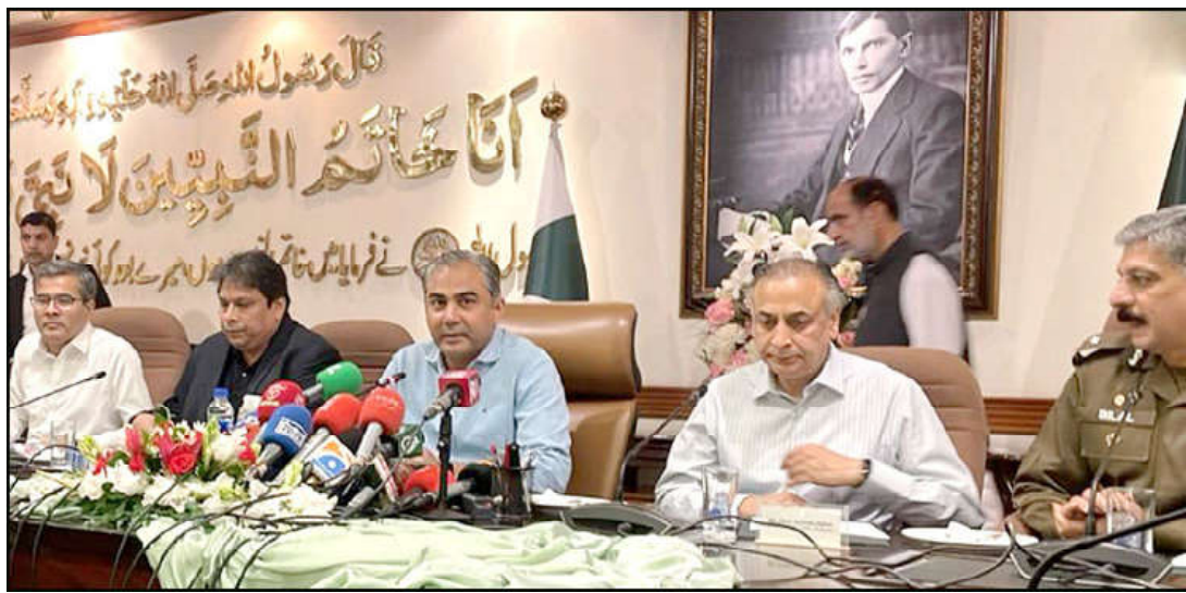
LAHORE: Caretaker Chief Minister Punjab Mohsin Naqvi addressing a Press conference.

He said now the reading room had become of an international standard. He hoped that the Mayo Hospital would be upgraded by January 31 next year. The hospital administration would take over ownership of the up-gradation work and the work would be completed soon, he added. "I visit every floor and review the pace of ongoing work."