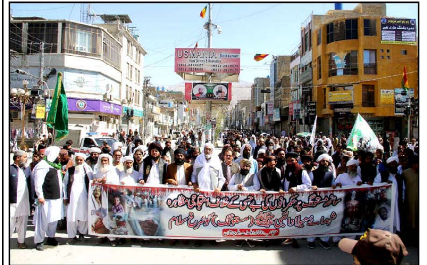
QUETTA: Business activities seen closed while markets gives deserting look during the shutter down strike called by Ittehad Ahle Sunnat Balochistan against Mastung bomb blast

“Our struggle will continue until the last terrorist is neutralised,” he said, echoing condemnation by other Turkish officials.