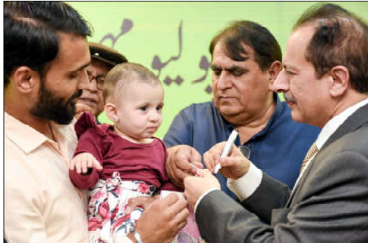
ISLAMABAD: Caretaker Federal Health Minister Dr. Nadeem Jan inaugurating 2nd anti polio campaign of 2023 by administering drop to a child

ISLAMABAD (APP): Caretaker Federal Minister for Health Dr Nadeem Jan on Sunday launched the anti-polio campaign by administering polio drops to children. Addressing the occasion, he said that the second national anti-polio campaign of the year 2023 is being started across the country from October 2. The minister said that around 43 million children will be vaccinated in the national anti-polio campaign. Dr. Nadeem Jan said that there is no cure for polio and that only the polio vaccine can save children from permanent disability. He urged parents, civil society, teachers, scholars and religious scholars to play their roles in the eradication of polio. Dr. Nadeem Jan said that eradication of polio is essential for our national honor and respect. He said at one stage it was not possible to eliminate polio from Afghanistan and Pakistan. Now we are close to eradicating polio." He said, "The fight to eradicate polio cannot be won without the help of parents." He appealed to citizens to cooperate with polio volunteers when they were at their doorstep. The minister said that work is being done under a comprehensive strategy for the eradication of polio. He said that the ministry has appointed top officers in Southern KP to stop the spread of the virus.