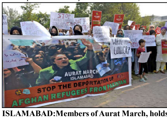
outside National Press club, in Federal Capital.