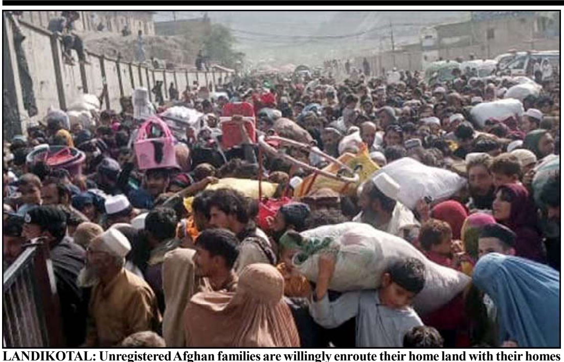
necessities after the government of Pakistan decided in the apex committee meeting to return all those Afghans who are living in Pakistan unlawfully, at Torkham Border in Landikotal.