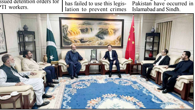
KARACHI: A delegation led by Former Chief Minster Balochistan Jam Kamal Khan meeting with Chinese Consul Yang Yundong. Caretaker Provincial Minister for Excise and Taxation Prince Ahmed Ali is also present.