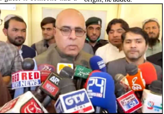
CHAMAN: Caretaker Information Minister of Balochistan Jan Achakzai talking with mediamen