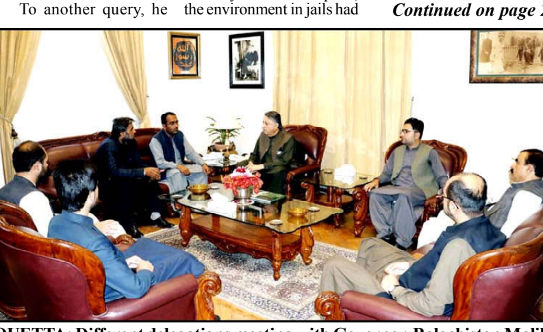
QUETTA: Different delegations meeting with Governor Balochistan Malik Abdul Wali Khan Kakar