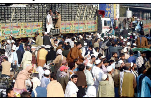
PESHAWAR: A view of rush on fruit mandi.

This agreement covers The trade between commerce and transit of commodities by road and rail as well as customs processes and will shift Uzbekistan's entire trade from Iran's Port Bandar time high.Pakistan and Abbas to Pakistani Uzbekistan signed a seaports. It will also of connect Pakistan seaports