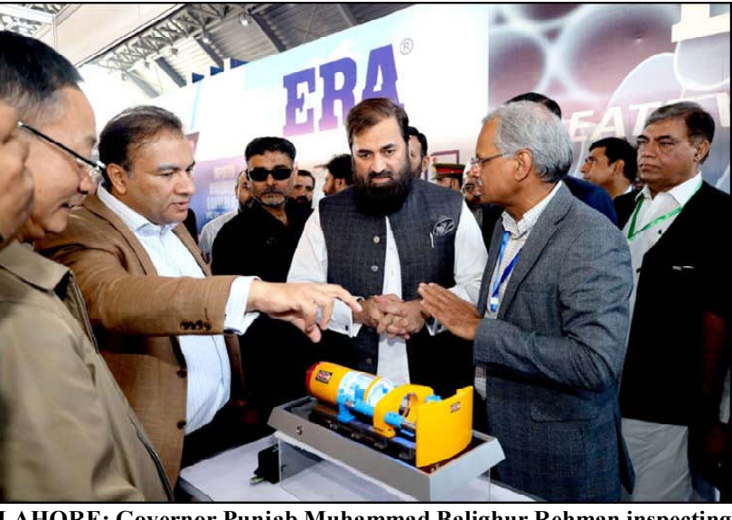
LAHORE: Governor Punjab Muhammad Balighur Rehman inspecting different projects at Pak Water & Energy Expo at Expo Center Lahore.

Rind said strict actions were being taken against the criminal elements in the city.