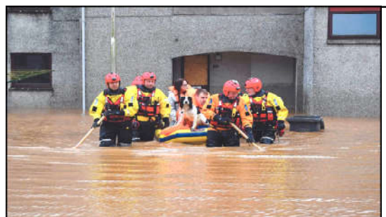
A couple and their dog are rescued by a coastguard team from a flooded street in Brechin, Scotland.

Israel began unrelenting air strikes on Gaza to its southwest after Hamas militants breached the border and carried out a shock rampage through nearby communities, killing 1,400 people, mainly civilians, and taking 212 hostages back to Gaza.