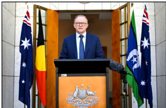
Australian Prime Minister Anthony Albanese speaks to the media during a press conference at Parliament House in Canberra.