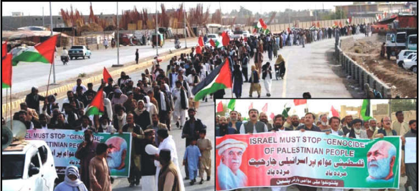
PISHIN: Activists of PMAP Pishin holding a rally against Israel

He lamented the absence of visits from the president of Pakistan, the chief minister or the governor to condole the impoverished families who had lost their loved ones. He said that these labourers had gone to Balochistan to make a living, not to engage in political activities or commit robberies. The JI chief also criticised the police and media, accusing them of favouring the rich over the poor. He claimed that when the mother of a poor person cried out for justice, they seemed to turn a blind eye to her pleas.