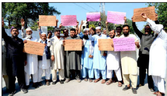
PESHAWAR: Employees of reading Hospital are demonstrating outside the press in support of their demands.

Caretaker Provincial Minister expressed these views while addressing the ceremony of a two-day capacity-building training workshop for teachers and lecturers of different educational institutions of science subjects at Roots Millennium School Peshawar.