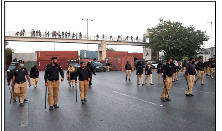
KARACHI: Police personals stands alert during Majlis Wahdat-e-Muslimmeen march toward the US consulate during protest rally against Israeli airstrikes on Gaza, and to show solidarity with Palestinian people, in Provincial Capital.

elections and the party would not back down from the demand to hold the general elections within the stipulated period. He said that the party is active and organized in Balochistan, as the People's Party has achieved great success in the local body elections across the province, the party would gain great success in Quetta elections as well.