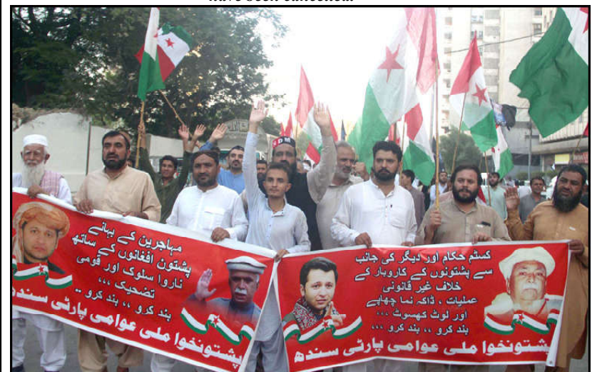
KARACHI: Activists of Pashtunkhwa Milli Awami Party hold a protest in favor of their demands, outside press club, in Provincial Capital.

KARACHI (Online): Due to the financial crisis of National Airline (PIA), 25 flights from all over the country have been cancelled today (Sunday). 16 flights from Karachi to different airports have been cancelled. Three Karachi Islamabad flights PK 300, PK 308 and PK 340 have been cancelled. Two Islamabad Karachi flights PK 301 and PK 369 have been canceled while Two Lahore to Karachi flights PK 303 have been cancelled. Three flights PK 302, PK 304 and PK 306 from Karachi to Lahore have been canceled while 6 flights to and from Karachi to Gwadar, Bahawalpur, Faisalabad have been cancelled.