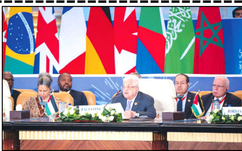
Palestinian President Mahmud Abbas delivers a speech during the summit in Cairo.