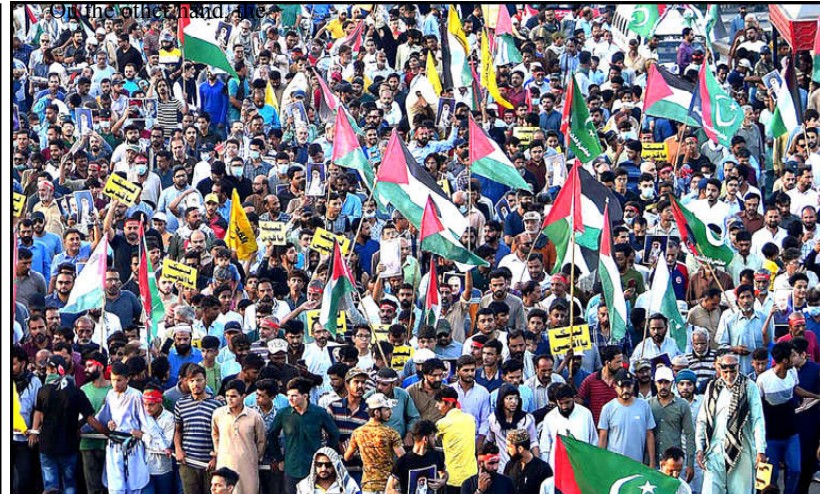
KARACHI: A large number of people participating in a rally to support Palestinians near Tower area.