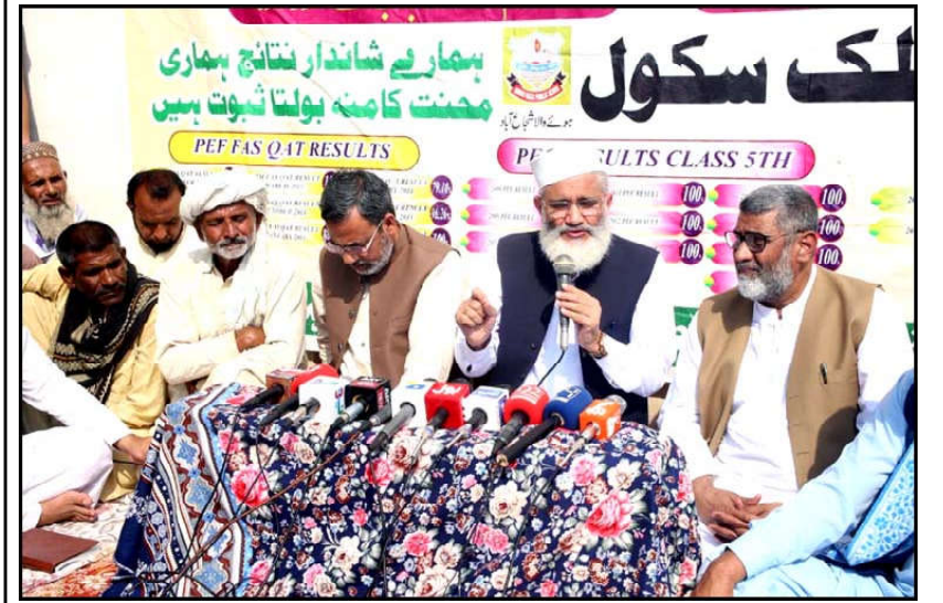
MULTAN: Jamat-e-Islami (JI) Chief, Siraj-ul-Haq along with others addresses to media persons during press conference, held in Multan.

displaced within or outside Gaza. Speaking about the Security Council's shortcomings, Munir Akram said these arise mainly due to the veto power of the five permanent members. He said the Security Council, which has the primary responsibility to promote world peace, has failed to "stop the slaughter in Gaza", as it also failed in Jammu and Kashmir. The Pakistani envoy said the Security Council's failures can be addressed by making it more representative and democratic, by enlarging the voice of the majority of small and medium-sized states, and more accountable through the democratic method of periodic elections.