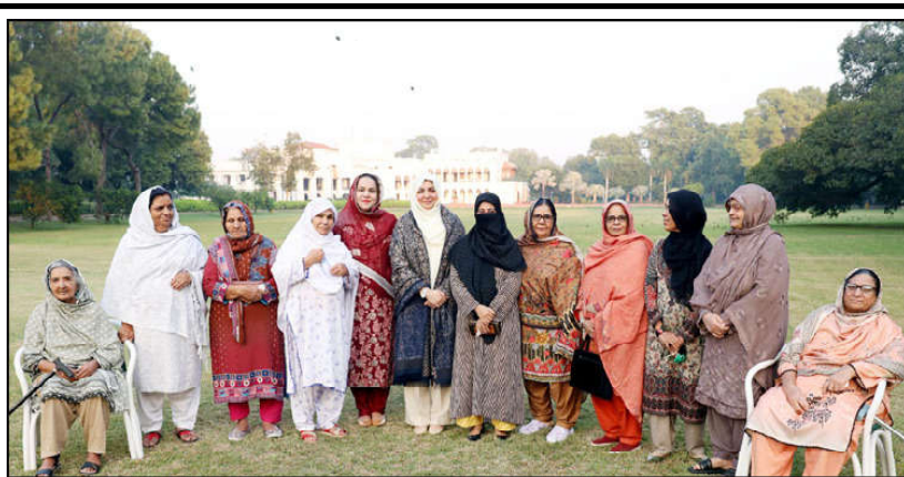
LAHORE: Begum Governor Punjab Ayesha Baligh in a group photo with women living in the Old Age Home at Governor House

PDMA is providing funds and relief materials to all district administrations, DGP PDMA Jannat Gul Afridi informed. The responsibilities of all institutions including PDMA have increased more than before, Jannat Gul Afridi said.