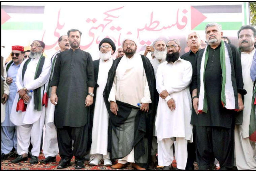
HYDERABAD: Leaders and members of Muttahida Qaumi Movement (MQM-P) are holding protest demonstration against Israeli cruel and inhumane acts and express unity with the innocent people of Palestine, at Hyderabad press club.