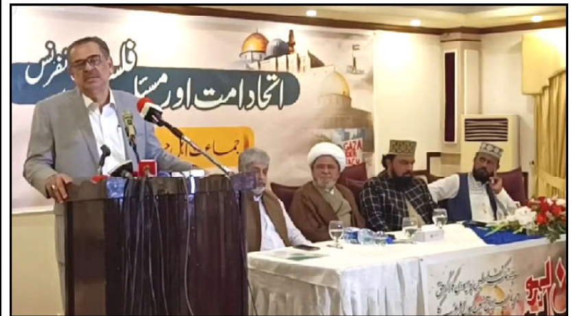
ISLAMABAD: Minister for Religious Affairs and Interfaith Harmony Aneeq Ahmed addressing a conference titled 'Unity of Ummah and Palestine Issue', organized by the Ahl-e-Haram

QUETTA: The Governor Balochistan, Malik Abdul Wali Khan Kakar has stated that the natural disasters cause losses to us due to our incompetence and backwardness and nothing else. If there is no rain in our areas then we suffer from drought and if there is more rains then we die of flash floods. The Governor pointed out that Quetta is situated in the seismic zone, and if the construction of buildings is not made keeping in view the dangers caused due to the earthquakes, then it may cause human and financial losses at large scale. He mentioned that earthquakes also occur in the developed countries like Japan, but the losses are not caused to that extent due to active role of the scientists and architects there, what we face and suffer because of mild intensity earthquakes here. The Governor was addressing the closing ceremony of 1st IAP exhibition & conference: the highly educated people and experts associated with different professions have just forgotten to make differentiation in fair and unfair, right and wrong. They have also been deprived of the ability to see beyond personal desires and interests, which is equal to the collective misfortune. The Governor also pointed out that at the moment, there is a serious crisis of energy in the country, and obviously it is a big challenge for all of us to overcome it.