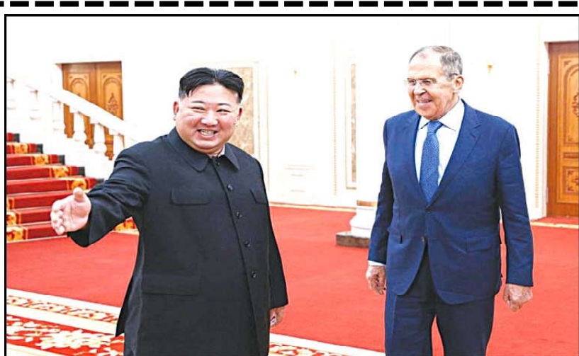
North Korean leader Kim Jong Un welcomes Russian Foreign Minister Sergei Lavrov in Pyongyang.

Monitoring Desk OTTAWA: Canada on Friday said it was temporarily suspending in-person operations at consulates in several Indian cities and warned of visa processing delays amid a diplomatic dispute over the murder of a Sikh separatist leader in British Columbia. The announcements affecting consulates in Bengaluru, Chandigarh, and Mumbai came hours after Foreign Minister Melanie Joly said Canada has withdrawn 41 diplomats from India. Separately, Indian government sources said New Delhi is not planning to impose any measures to curb imports or investments from Canada despite the dispute. New Delhi last month asked Ottawa to reduce its diplomatic presence after Prime Minister Justin Trudeau cited what he said was credible evidence of a potential link between Indian agents and the murder of Hardeep Singh Nijjar.