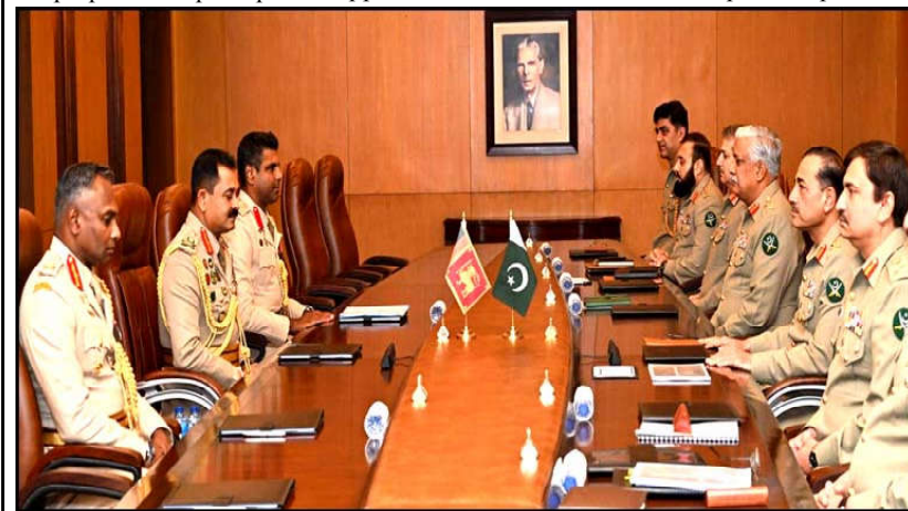
RAWALPINDI: Commander of the Sri Lankan Army Lieutenant General H L V M Liyanage meeting with Army Chief General Syed Asim Munir in Rawalpindi

During the visit, Prime Minister Anwaar ul Haq Kakar met President Xi Jinping, Premier Li Qiang and Li Xi, member of the Standing Committee of the Political Bureau of the Central Committee of the Communist Party of China (CPC) and Secretary of the CPC Central Commission for Discipline Inspection.