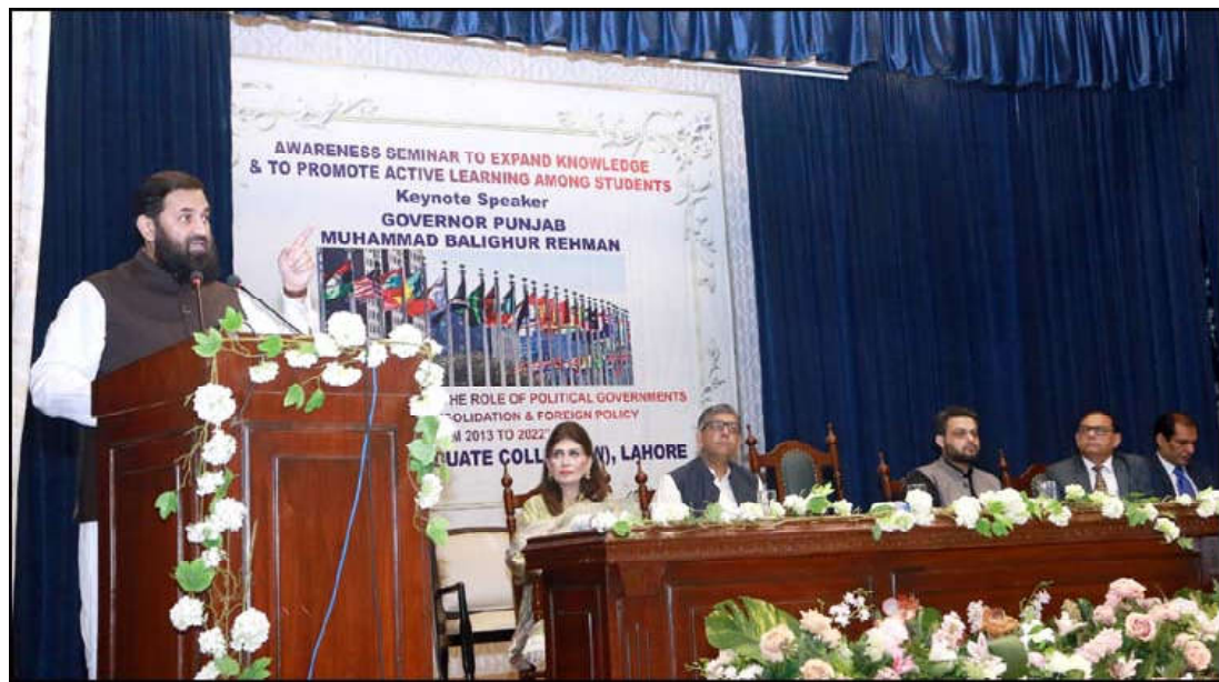
LAHORE: Governor Punjab Muhammad Balighur Rehman addressing a seminar at Government Graduate APWA College for Women.