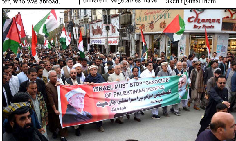
QUETTA: Pashtunkhwa Milli Awami Party (PkMAP) Chairman Mehmood Khan Achakzai led the solidarity rally with Palestinian people.

He said that those fleeing the people don't deserve any relaxation and as such stern action would be taken against them.