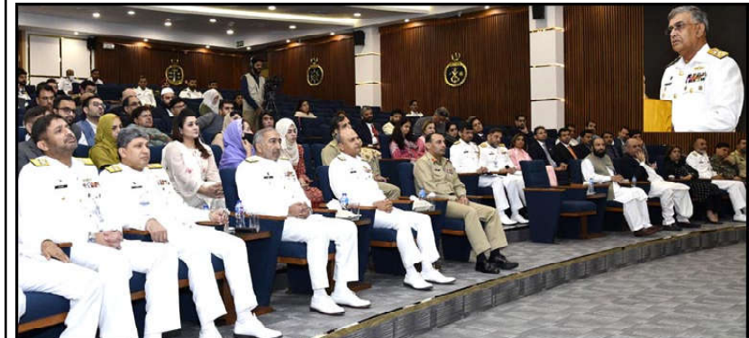
ISLAMABAD: Chief of the Naval Staff Admiral Naveed Ashraf addressed the participants of 25th National Security Workshop at Naval Headquarters.

people ties. Thanking the Prime Minister for visiting Xinjiang, Party Secretary Ma Xingrui stated that there was immense potential to deepen Pakistan-Xinjiang ties in multiple domains. He expressed Xinjiang's willingness to explore business and trade opportunities in Pakistan and to further facilitate commercial and people-to-people ties via Khunjerab-Sost border crossing. The two sides agreed to work together to harness the full potential of cooperation between Xinjiang and the neighbouring areas of Pakistan.