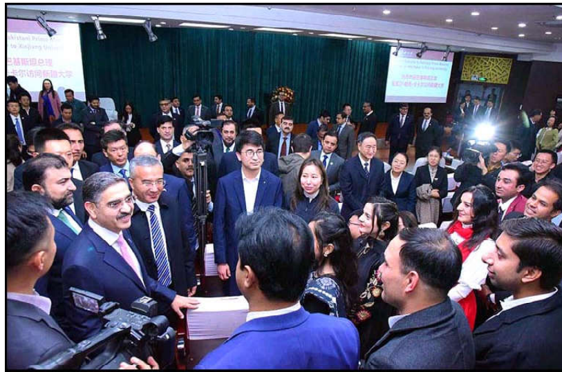
URUMQI: Caretaker Prime Minister Anwaar-ul-Haq Kakar interacts with the students of Xinjiang University.

Addressing the rally, Chairman PkMAP said if