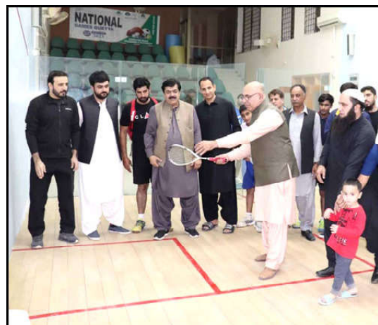
QUETTA: Provincial Information Minister Jan Achakzai inaugurating exhibition squash match by hitting shot

PESHAWAR (APP): The police constable, who was injured by bullets during an exchange of fire with a narcotics dealer last night in Kohat, succumbed to his injuries in the hospital. According to the details, a police party conducted a raid in the mountainous area of Chakerkot Bala last night to arrest a notorious drug dealer. However, he opened fire, seriously injuring Constable Kashif. During the raid, the suspect opened fire on the police team, resulting in the tragic martyrdom of the policeman. The police have initiated a large-scale operation in the area to apprehend the suspect.