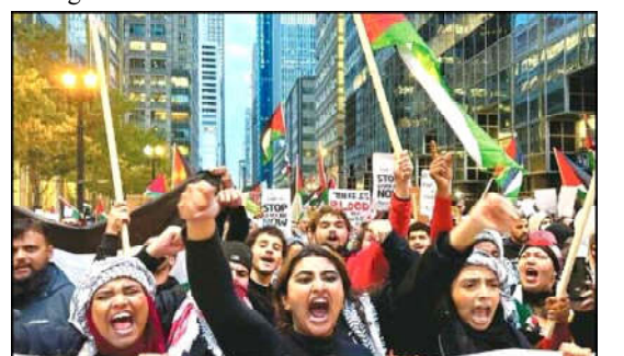
People take part in a rally in support of Palestinians on Thursday in Chicago.

Monitoring Desk RAMALLAH: The Israeli forces on Thursday extended atrocities to the occupied West Bank, killing 12 Palestinians and pounded a military base in Syria as calls for humanitarian aid swelled for the helpless people of Gaza Strip. At least 78 Palestinians have been killed by Israeli troops or settlers in the West Bank since the Hamas raid on Oct 7, the Palestinian health ministry said, as the death toll in Gaza soared to 3,785. The deaths occurred during an Israeli attack on Nur Shams refugee camp, the Palestinian Authority (PA) said. The Wafa news agency reported that seven of the dead had been transported to hospital, while five others were in a mosque inside the camp. The authority said it had been informed of "other martyrs who could not be transferred by ambulance to hospital". In separate clashes earlier in the day, Israeli forces shot dead a 17-year-old in Dheisheh refugee camp, near Bethlehem, and a 32-year-old in Budrus, to the west of Ramallah.