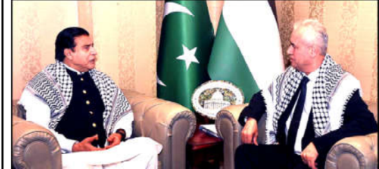
ISLAMABAD: Speaker National Assembly Raja Pervez Ashraf called on Palestinian Ambassador to Pakistan Mr. Ahmed Jawad Rabei.

He said people have been fooled for 75 years. If the politicians were sincere, the country would not have been in this situation, they are bad for the country, they have destroyed the country. Speaking at the PTIP Workers' Convention in