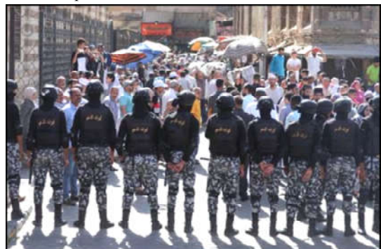
Members of the military stand guard as people take part in a protest in support of Palestinians, amid the ongoing conflict between Israel and Palestinian Islamist group Hamas, in Old Cairo, Egypt.