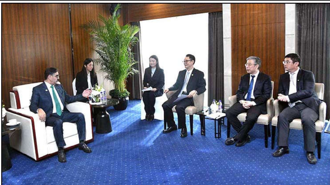
BEIJING: CEO China Communications Construction Company (CCCC) Wang Haihui and Chairman China Road and Bridge Corporation (CRBC) Du Fei called on Caretaker Prime Minister Anwaar-ul-Haq Kakar.

including the establishment of Special Investment Facilitation Council, which will act as a one-window platform to facilitate foreign investment. He encouraged the Chinese corporate executives to explore the vast investment potential of Pakistan, especially in ICT, agriculture, renewable energy, textile, digital economy and, mining and minerals sectors. Appreciating the measures taken by Pakistan to attract foreign investment, the entrepreneurs briefed the prime minister on their business portfolios in Pakistan. They also expressed their keen interest in working with Pakistani partners to expand their business footprint in Pakistan. Prime Minister Kakar also invited the executives of Chinese companies to Pakistan to discuss their business interests with relevant ministers. Meanwhile Caretaker Prime Minister Anwaar-ul-Haq Kakar on Thursday said that the government was taking measures.