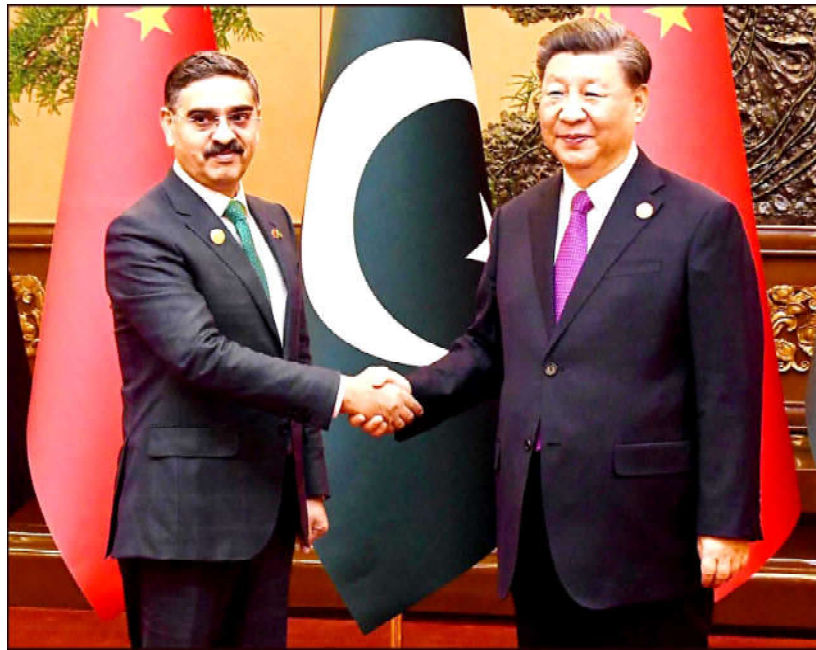
BEIJING: Caretaker Prime Minister Anwaar-ul-Haq Kakar meets Chinese President Xi Jinping in Beijing.

Ph: 284 1470/2841473 Vol: XVI No. 146, Rabi-us-Sani 04, 1445 AH Friday October 20, 2023, Pages 08, Price Rs.15