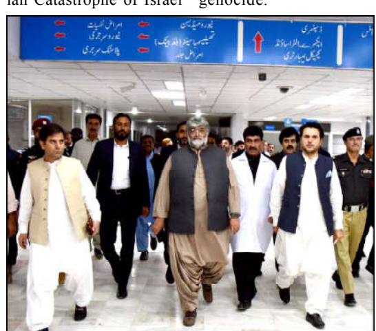
QUETTA: Caretaker Chief Minister Balochistan Mir Ali Mardan Khan Domki visiting BMC hospital

The SAPM on Human Rights and Women Empowerment lamented that the Zionist regime had no respect for the international laws, as it was targeting hospitals, residential areas and shelter homes with complete impunity, as Gazans were being subjected to genocide.