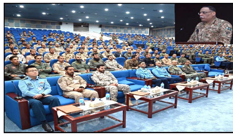
ISLAMABAD : Chairman Joint Chiefs of Staff Committee, General Sahir Shamshad Mirza addressing the participants of ongoing aerial exercise Indus Shield-2023

ISLAMABAD (APP): Pakistan on Thursday expressed its disappointment over the results of the emergency meeting of the United Nations Security Council (UNSC) held on Wednesday and called for an immediate end to the bombardment and inhumane blockade of Gaza. "We are nationally disappointed by the results of the UNSC debate. The Security Council should play its designated role to bring an immediate end to the bombardment and blockade leading to a humanitarian catastrophe," the