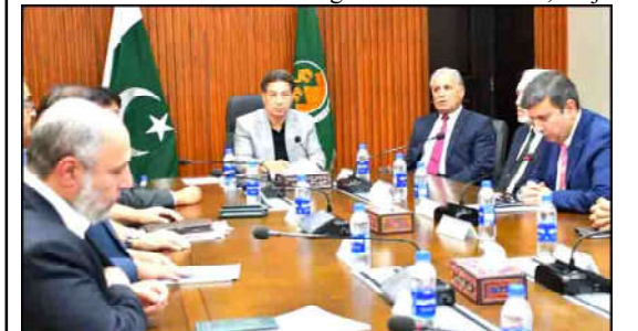
importance of utilizing all available resources to conduct a transparent and peaceful election in the country. Chairing a meeting at the Civil Secretariat Quetta to assess the preparations for the upcoming general elections, Raja emphasized the importance of close collaboration between the caretaker government and the Election Commission of Pakistan (ECP).

QUETTA (APP): Chief Election Commissioner Sikandar Sultan Raja on Wednesday stressed the importance of utilizing all available resources to conduct a transparent and peaceful election in the country. Chairing a meeting at the Civil Secretariat Quetta to assess the preparations for the upcoming general elections, Raja emphasized the importance of close collaboration between the caretaker government and the Election Commission of Pakistan (ECP).