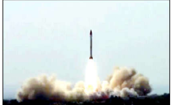
RAWALPINDI: Pakistan conducted successful test of Ababeel Weapon System, the test flight was aimed at re-validating various design, technical parameters and performance evaluation of different sub-systems of the weapon system.