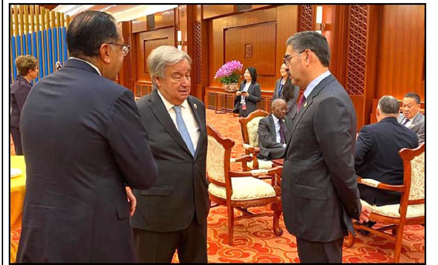
BEIJING: Caretaker Prime Minister Anwaar-ul-Haq Kakar meets Secretary General of United Nations Antonio Guterres on the sidelines of 3rd Belt and Road Forum, Beijing.