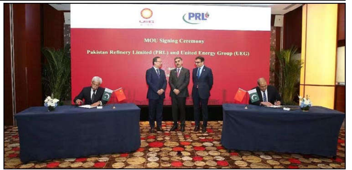
Caretaker Prime Minister Anwaar-ul-Haq Kakar and Caretaker Minister for Energy Muhammad Ali witnessing the signing ceremony of MoU between United Energy Group of China and Pakistan Refinery Limited for investment in the petroleum sector of Pakistan, Beijing.

Launched in 2013, the CPEC was a corridor linking the Gwadar port in southwestern Pakistan with Kashgar in northwest China's Xinjiang Uygur Autonomous Region, which highlights energy, transport and industrial cooperation.