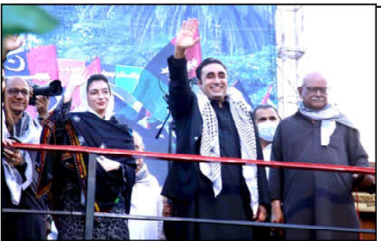
KARACHI: Chairman Pakistan People's Party (PPP), Bilawal Bhutto Zardari and Aseefa Bhutto Zardari wave to crowds at a rally organised on the occasion of anniversary of Karsaz tragedy.

the politics of divide and abuse, adding that if politicians keep fighting amongst themselves, the country will not progress. "We have to leave politics of abuses and divide behind. We need new leadership, which is not stuck in the past but thinks about the future. We don't want 90s' Pakistan or 2017's Pakistan," he added. The PPP chairman also announced that his party was kick-starting their mass contact campaign, which will demand the ECP issue election's date. "Let the people exercise their right to vote; they will have to accept the demand of the people," Bilawal added.