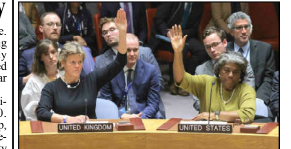
British Ambassador to the United Nations Barbara Woodward and US Ambassador Linda Thomas-Greenfield vote against the resolution.

deemed not to have the right to stay in the 27-nation bloc. Sweden's Prime Minister Ulf Kristersson said Europe's open-border Schengen zone would not survive unless the EU's external frontiers were better protected from unwanted immigration. "If we are not able to protect our common borders, we will not be able to uphold free movement within Europe," he said. Belgian Prime Minister Alexander De Croo said the EU also needed a more effective system of returning unauthorised immigrants. "This is something we need to tackle and can only do that in a coordinated way," he said.