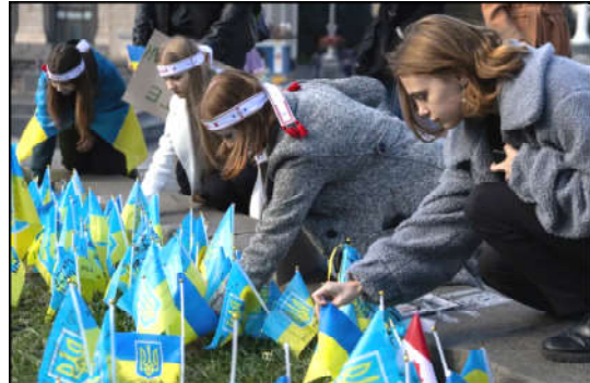
Ukrainian students, who lost relatives due to the Russia-Ukrainian war set flags in their memory on the memorial of fallen Ukrainian soldiers, while attending the reconstruction of a student-led protest campaign "Revolution on Granite" on Independence square in Kyiv, Ukraine.

consensus. Israel's Gilad Erdan said the Security Council, which has not adopted a resolution on the situation in Israel and the Palestinian territories since 2016, stood at "one of its most pivotal crossroads" since its founding in the aftermath of World War II. Palestinian ambassador Riyad Mansour said the council had a moral duty to act in a bid to restrain an Israeli assault on the Gaza Strip he said was claiming 12 lives every hour. "Don't send the signal that the Palestinian lives don't matter," he said.