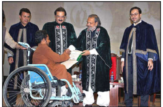
QUETTA: Caretaker Federal Minister for Education and Professional Training Madad Ali Sindhi distributing certificates in a graduation ceremony under PM's Youth Skills Development Program at University of Balochistan.