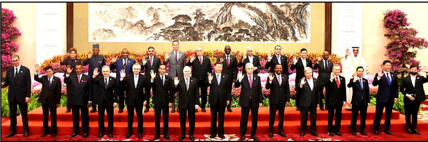
BEIJING: Caretaker Prime Minister Anwaar-ul-Haq Kakar in a group photo with President Xi Jinping and world leaders participating in the 3rd Belt and Road Forum, Beijing.