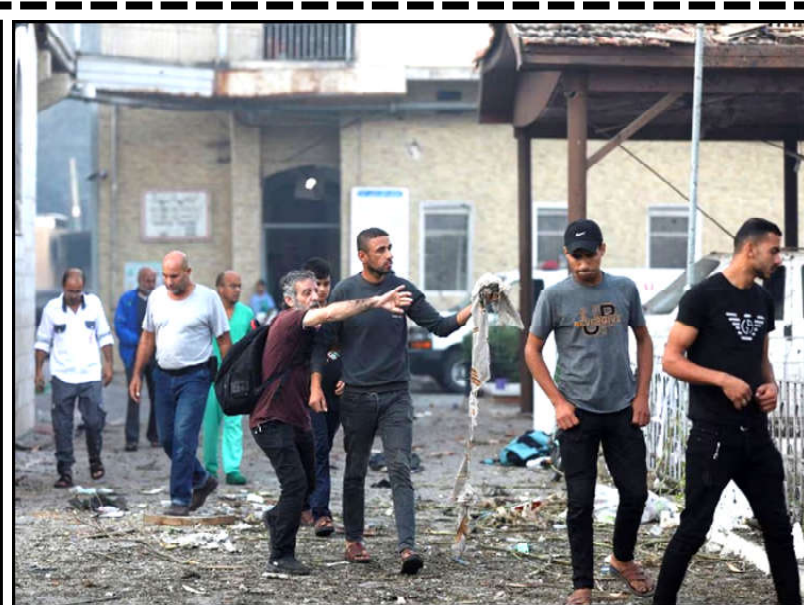
People inspect the area of Al-Ahli hospital, where hundreds of Palestinians were killed in a blast that Israeli and Palestinian officials blamed on each other, in Gaza City.

Monitoring Desk LONDON: Students from the Palestine Society at SOAS (School of Oriental and African Studies) on Tuesday said the university had "suspended students following a rally in solidarity with Gaza". The SOAS Palestine Society posted to X saying, "URGENT: @SOAS University of London, renowned for its so called progressive politics, has officially begun taking steps suspending its own students following a rally in solidarity with Gaza. This is a clear act of political repression. Please read on and share widely." The tweet said that on Oct 9, the Palestine Society and its student community held a rally in solidarity with the people of Gaza and that hundreds of students joined the demonstration. On October 13 and 14, the statement said "students were suspended and given warnings through disciplinary by the university" and said the action by the university demonstrated "a targeted act of political repression. The two leaders con-