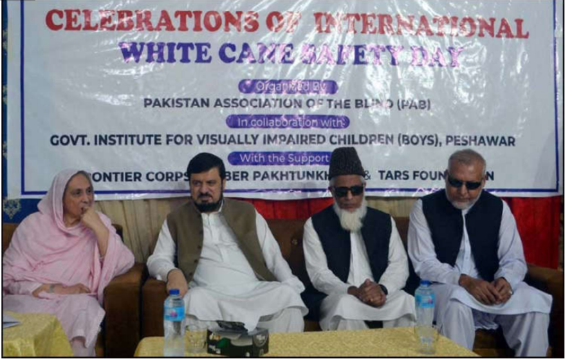
PESHAWAR: Khyber Pakhtunkhwa Governor, Haji Ghulam Ali and others during Celebrations of International White Cane Safety Day organized by Pakistan Association of the Blind (PAB) held in Peshawar.