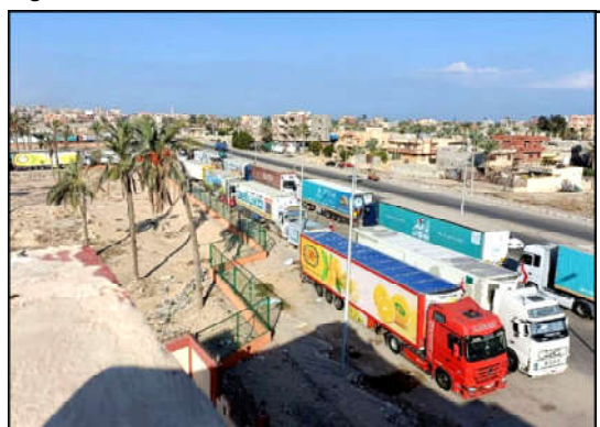
A view of trucks carrying humanitarian aid for Palestinians, as they wait for the re-opening of the Rafah border crossing to enter Gaza, amid the ongoing conflict between Israel and the Palestinian Islamist group Hamas, in the city of Al-Arish, Sinai peninsula, Egypt.

Hamas official Izzat El-Reshiq told Reuters the same. On the ground at Rafah, one source said that there had been no bombardments on Monday and that the Egyptian side of the crossing was ready.