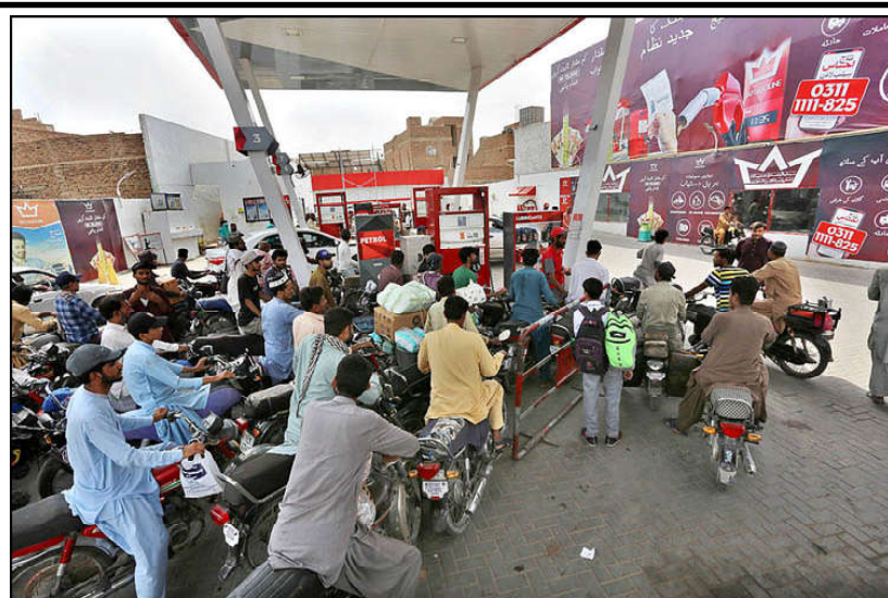
HYDERABAD: A large number of motorcyclists at petrol pump after the government reduce the petrol prices.

They attributed the positive indicators to the government's zero-tolerance policy against the illicit trade and smuggling of essential commodities and the dollar mafia. These measures led to the strengthening of the local currency against the