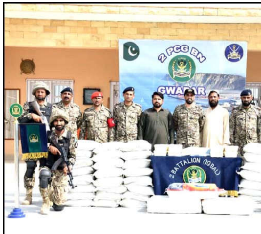
HUB: Pakistan Coast Guard Officials are showing huge apprehended drugs worth millions of rupees to media persons during press conference held at PCG Gwadar Headquarters in Hub.

Independent Report QUETTA: The Pakistan Coast Guard (PCG) foiled major bid of smuggling of huge quantity of narcotics from sea-route in Jiwan on Monday. According to the spokesman of PCG, huge quantity of narcotics was recovered from a speed boat which otherwise was to be smuggled abroad via sea. The PCG patrolling team got a secret informa-