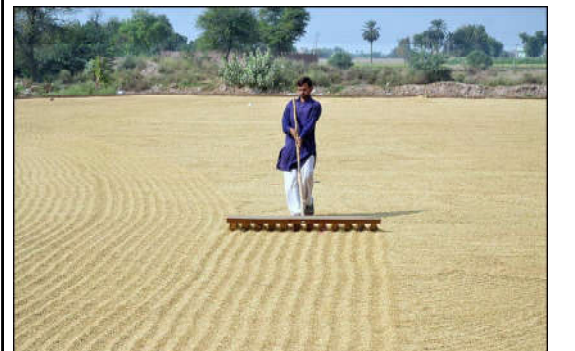
MULTAN: A labourer busy in spreading rice for drying purpose in the field.