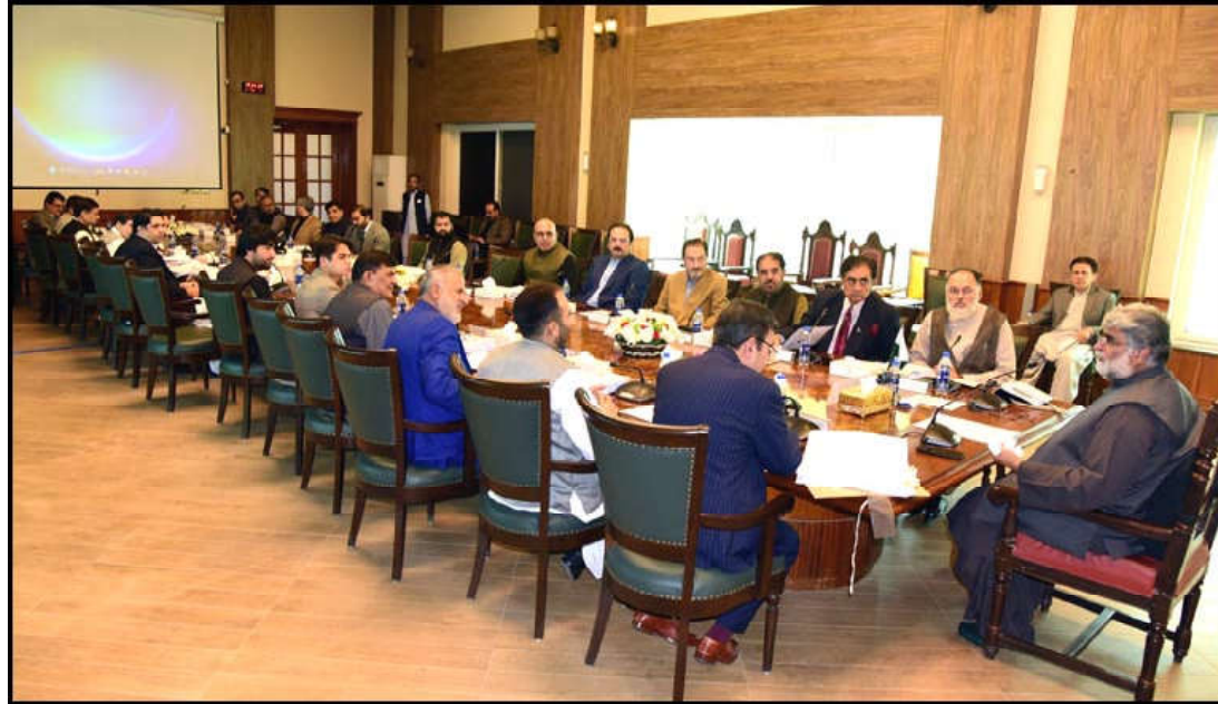
QUETTA: Caretaker Chief Minister Balochistan Mir Ali Mardan Khan Domki presiding over meeting of Provincial Cabinet

Ph: 2841470/2841473 Vol: XVI No. 143, Rabi-us-Sani 01, 1445 AH Tuesday October 17, 2023, Pages 08, Price Rs. 15