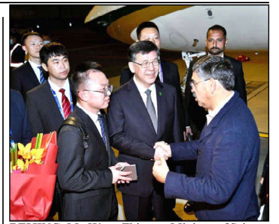
BEIJING: Mr. Wang Zhigang, Minister of Science & Technology of China receiving Caretaker Prime Minister Anwaar-ul-Haq Kakar upon his arrival.