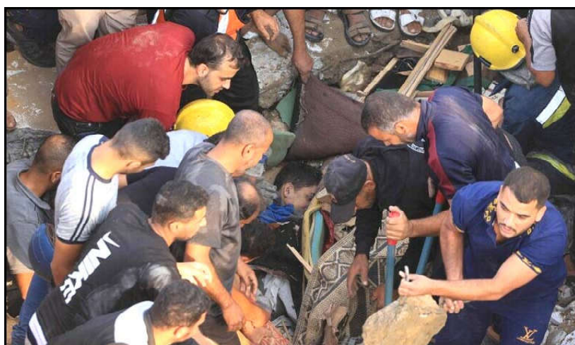
Palestinians recover a body from under the rubble of a building destroyed in an Israeli airstrike in Khan Yunis in the southern of Gaza Strip.

Hamas has said it will trade the captives for thousands of Palestinians held by Israel in the kind of lopsided exchange deals that have been reached in the past.