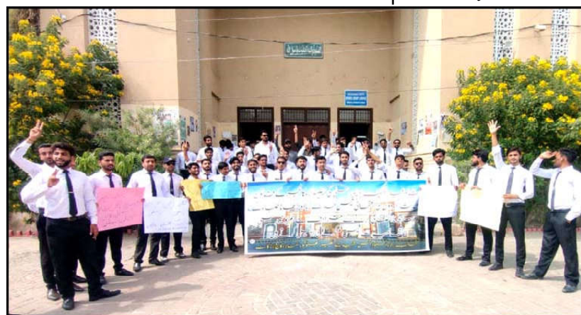
LARKANA: Students of Government Shaheed Benazir Bhutto Law College are holding protest demonstration against the examination fee being increased by administration of Shah Abdul Latif University Khairpur held at Jinnah Bagh in Larkana.

An official informed that during the day-long camp, it surfaced that the drivers of heavy transport vehicles including the public transport vehicles suffered from eye-sight issues and some other ailments of eyes.