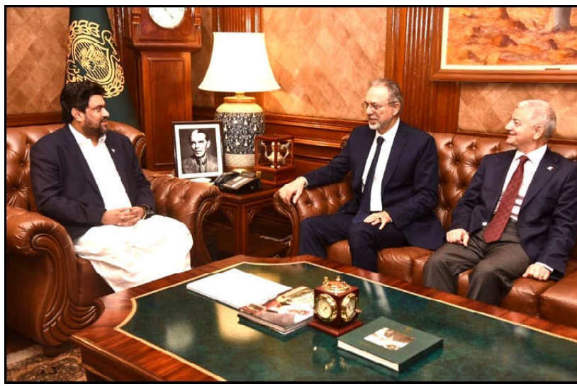
KARACHI: Turkish Ambassador to Pakistan Mehmet Pacaci called on Sindh Governor Mohammed Kamaran Khan Tessori at Governor House.

Chief Minister Mohsin Naqvi issued directives to Price Control Magistrates and Price Control Committees, urging them to actively contribute to providing relief to the public. He emphasized the necessity of a relentless crackdown on hoarders, ensuring that the benefits of the reduced petroleum prices are equitably distributed among the populace.