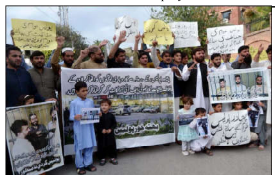
PESHAWAR: Members of Car Showrooms Association Ring Road are holding protest demonstration against high handedness of influential police officials, held at Peshawar press club.

The three top-trading companies were K-Electric Ltd with 98,168,338 shares at Rs 3.15 per share, PTCL with 22,603,000 shares at Rs 6.95 per share and Pak Int. Bulk with 22,073,500 shares at Rs 4.59 per share. Nestle Pakistan witnessed a maximum increase of Rs 102.00 per share price, closing at Rs 7,300.00, whereas the runner-up was Philip Morris Pak with a Rs 40.50 rise in its per share price to Rs 580.50.