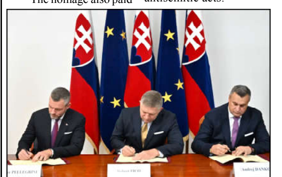
Hlas-Social Democracy party chairman Peter Pellegrini, Smer-Social Democracy party chairman Robert Fico and Slovak National Party chairman Andrej Danko sign a coalition agreement to form a new government in Bratislava, Slovakia.

tribute to another teacher, Samuel Paty, killed exactly three years ago near his Paris area school. He was beheaded by a radicalized Chechen later killed by police. Macron cut short travel plans abroad to hold a security meeting at midday with the prime minister and other key government members as well as top military and counterterrorism officials. He initially planned to attend a summit on the Western Balkans in Tirana, Albania. Speaking at the end of the meeting, Interior Minister Gerald Darmanin said that 102 people have been arrested in relation with antisemitic acts.