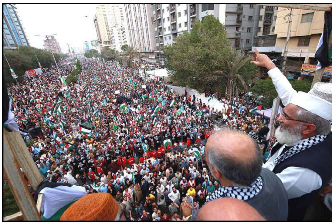
KARACHI: Ameer Jamaat-i-Islami Siraj ul Haq addresses "Al-Aqsa Palestine March" organized by JI at Shahrah-e-Faisal.