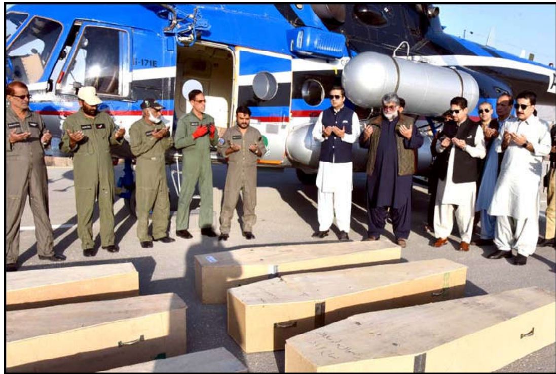
QUETTA: Caretaker Chief Minister Balochistan Mir Ali Mardan Khan Domki offering Fateha for labourers who were killed in Turbat before despatching their dead bodies to Multan

Ph: 2841470/2841473 Vol: XVI No. 142, Rabi-ul-Awwal 29, 1445 AH Monday October 16, 2023, Pages 08, Price Rs.15