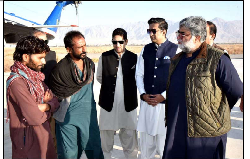
QUETTA: Caretaker Chief Minister Balochistan Mir Ali Mardan Khan Domki getting detail of Turbat firing incident from relatives of labourers

world events, cautioning that silence might be construed as support for America. Haq stressed the need for action to safeguard Al-Aqsa Mosque, citing Saudi Arabia's decision to sever ties with Israel and the budding diplomatic contacts between Iran and Saudi Arabia. "Now, it's our turn to contribute what we can. It's time we protect Gaza," avowed the JI chief while highlighting the urgency of the situation. He expressed that the death of honor was preferable to a life of humiliation. He preached to the participants of the march the insignificance of worldly life in comparison to the hereafter, and argued that the Palestinian mujahideen held the right to protect the Al-Aqsa Mosque by all means.