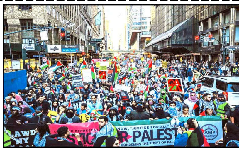
People hold a demonstration in support of Palestinians in New York City.

ements of the investigation. Authorities have suggested a probable link to the ongoing violence in the Middle East, with President Emmanuel Macron denouncing the incident as an act of "Islamist terror". The deployment of the soldiers from Operation Sentinelle will be completed by Monday evening, according to the Elysee presidential palace. Sentinelle is a French military operation with 10,000 soldiers and 4,700 police and gendarmes deployed since the aftermath of the January 2015 attacks.