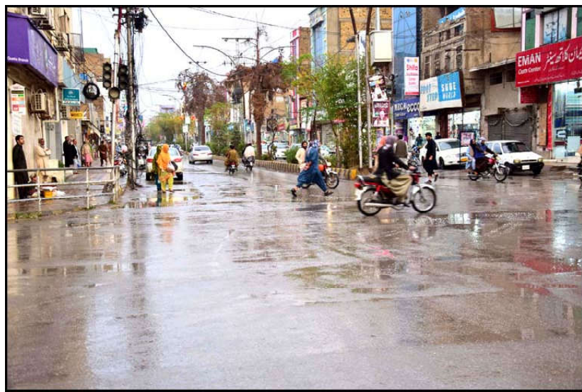
QUETTA: A view of 1 st rain of winter in the provincial metropolis