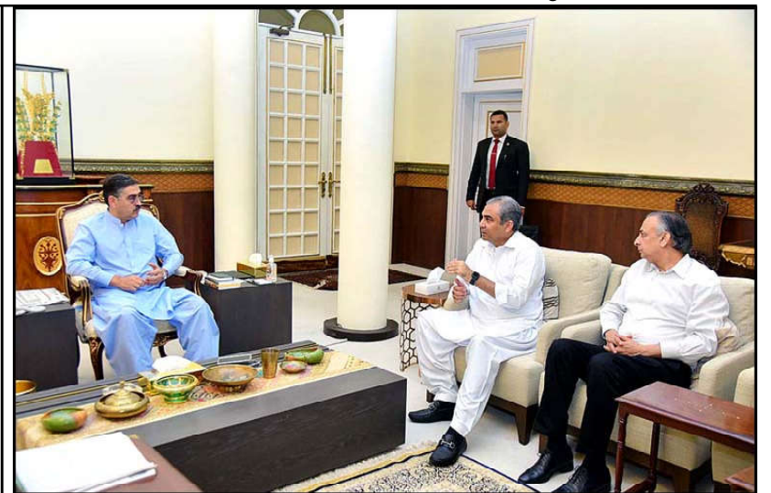
ISLAMABAD: The Caretaker Chief Minister of the Punjab Mohsin Naqvi calls on the Caretaker Prime Minister Anwaar-ul-Haq Kakar.

massive level; even water, electricity, food supply and medicine have been cut off," the president said in a statement issued by the President House. He said Israel had crossed all limits by killing children, women and innocent people. He regretted that the international community had failed to prevent Israel from the genocide of the Palestinian people. "Pakistan supports the establishment of an independent state for the Palestinian people that is the only solution to bring lasting peace and stability in the region," the president added.