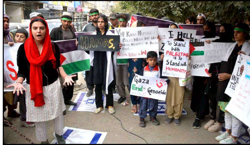
QUETTA: Activists of Quetta Foundation hold a protest to express solidarity with Palestine, while the protesters are burning the Israeli flag at the front of the press club.

an additional financial burden of Rs1.6 billion. NEPRA is scheduled to hold a hearing on K-Electric's application on October 19. Just a week ago, NEPRA had increased the cost of electricity by Rs1.71 per unit under the head of monthly fuel adjustment. The adjustment in the tariff was made for the month of August and will be charged in the bills for October. A notification for the tariff raise was also issued. The increase was not applicable to K-Electric and lifeline customers.