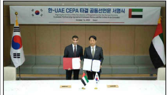
United Arab Emirates' Minister of Foreign Trade Thani Al Zeyoudi and South Korea's Trade Minister Dukgeun Ahn meet in Seoul, South Korea.