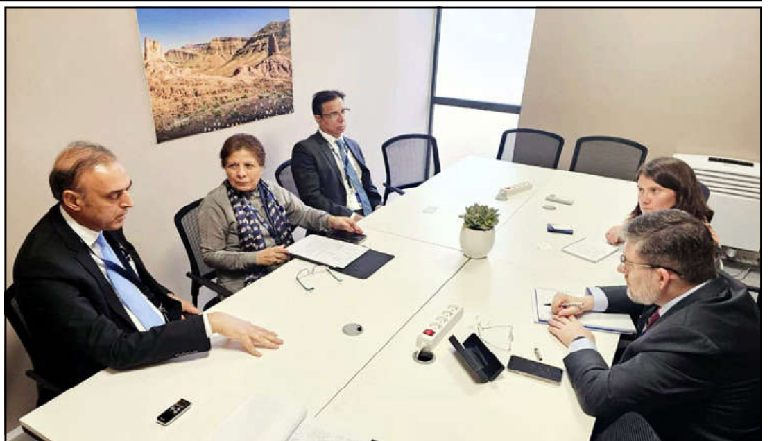
Marrakech: Federal Minister for Finance, Revenue, and Economic Affairs, Dr. Shamshad Akhtar held a meeting with a high-level delegation of Moody's, the global financial services company, during her visit to Morocco for the annual meeting of WB/IMF. During the meeting, Dr. Shamshad Akhtar reiterated the government's commitment to transparency in order to foster investor confidence and maintaining a positive credit rating of Pakistan in the global financial markets.

These efforts are essential to secure a more prosperous, equitable, and sustainable global future, he noted. Concluding his remarks, Albudaiwi praised the advancements resulting from the structural reforms implemented by GCC countries in response to economic challenges. These reforms have yielded favourable outcomes, including economic growth, an improved business environment, increased competitiveness, and a substantial rise in women's workforce participation. Furthermore, the non-oil sector experienced a notable increase of 4.8% in 2022.