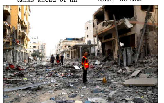
A rescuer looks on amid debris in the aftermath of Israeli strikes, in Gaza City.

expected ground invasion in response to a devastating weekend attack by the militant group Hamas. Putin said that using heavy weaponry in residential areas was "fraught with serious consequences for all sides." "And most importantly, the civilian casualties will be absolutely unacceptable. Now the main thing is to stop the bloodshed," he said.