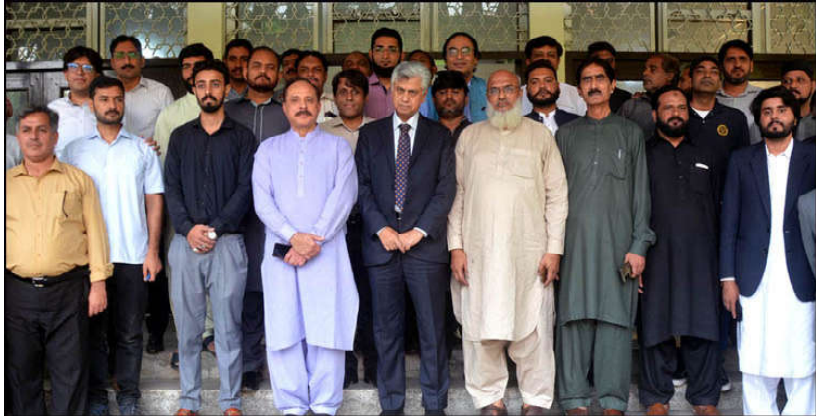
LAHORE: A group photo of Caretaker Federal Minister for Information and Broadcasting Murtaza Solangi with Radio Pakistan Staff.

approximately Rs 50 million in costs. The Nankana Sahib Safe City Project was a joint endeavor involving local and international companies, which will also take on the responsibility of operation and maintenance for the next three years. As part of the Nankana Sahib Safe City project, a total of 30 kilometers of optical fiber has been laid throughout the city. This project has been seamlessly integrated with the Lahore Safe City network. Notably, cameras have been strategically installed to enhance security at Sikh places of worship, Ashura routes, religious sites, and government buildings.