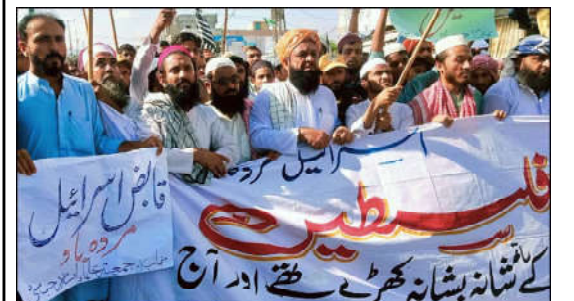
HUB: Activists of Jamiat Ulema-e-Islam (JU-I) are holding protest rally against Israeli cruel and inhumane acts and express unity with the innocent people of Palestine, at RCD road in Hub.

Moreover, the recovery of amount against the dues of QESCO is also continued as over Rs. 83 crore were collected from the defaulters. Similarly, over Rs. 12 crore were also recovered from the pilferers on charges of electricity theft in the province.