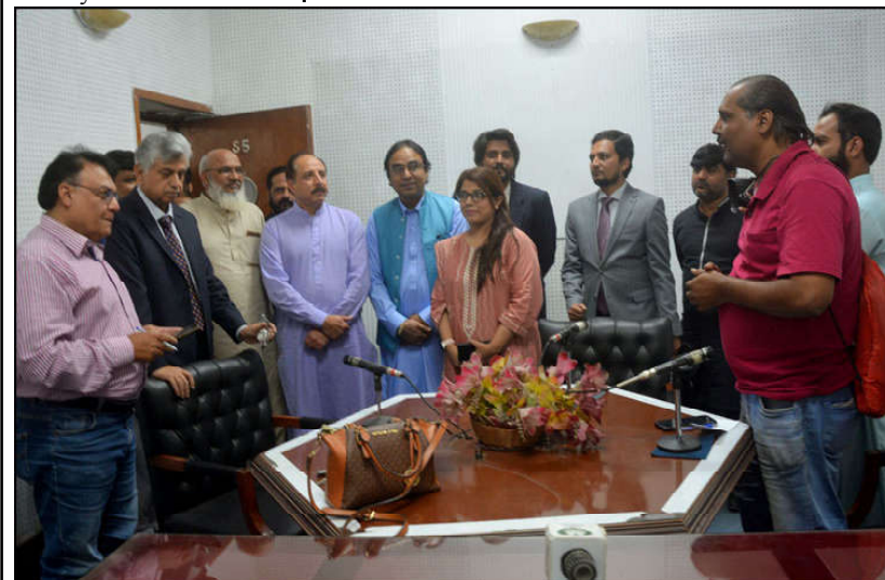
LAHORE: Caretaker Federal Minister for Information and Broadcasting, Murtaza Solangi visit Radio Pakistan.