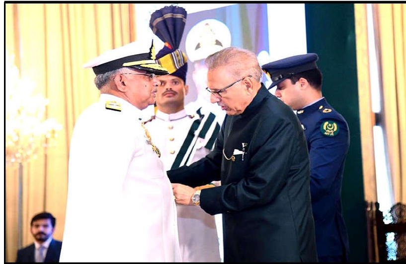
ISLAMABAD: President Dr Arif Alvi conferring the award of Nishan-e-Imtiaz (Military) upon the Chief of Naval Staff, Admiral Naveed Ashraf, at a special investiture ceremony held at Aiwan-e-Sadr.