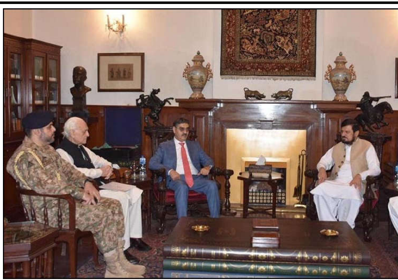
PESHAWAR: Governor Khyber Pakhtunkhwa Haji Ghulam Ali and the Caretaker Chief Minister Khyber Pakhtunkhwa Azam Khan call on the Caretaker Prime Minister Anwaar-ul-Haq Kakar.

PESHAWAR (APP): The officials of Pakistan Telecommunication Authority (PTA) and Federal Investigation Agency (FIA) have arrested five accused for issuing illegal phone SIMs on Afghan passports. FIR spokesman told media on Friday that action was taken at Kohat Road, Peshawar from where five accused were arrested from a franchise of a mobile phone company.