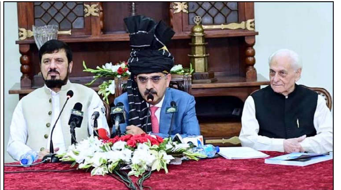
PESHAWAR: Caretaker Prime Minister Anwaar-ul-Haq Kakar talking with mediemen and delegation of Sarhad Chamber of Commerce and Industry.

He said as the illegal residents had no registration in Pakistan's database, the state was unable to distinguish between those playing a productive role in the society and the criminals.