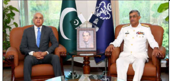
ISLAMABAD: Chief of the Naval Staff, Admiral Naveed Ashraf exchanging views with Shahid Ashraf Tarar, Caretaker Minister for Maritime Affairs during meeting held at Naval Headquarters.

estinians. He emphasized that for decades, Israel had been subjecting innocent civilians, hospitals, schools, and ambulances to its ruthless aggression. Notably, he said the United States, India, the United Kingdom, and other Western nations remained silent in the face of Israeli brutality, disregarding the principles of human rights. He called for swift action from the Muslim leaders to halt Israel's aggression stressing that at this moment, the entire Muslim world stood with their oppressed Palestinian brothers and sisters. He appreciated the unwavering efforts and stance of the leadership of Saudi Arabia, Qatar, Turkey, Iran, Kuwait, Egypt, Jordan.