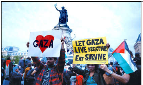
Protesters hold Palestinian flags during a demonstration in Paris.

wrote on social media. White House national security spokesman John Kirby said such a huge evacuation was a "tall order," but that Washington would not second-guess its ally's decision to tell civilians to get out of the way. "We understand what they're trying to do and why they're trying to do this—to try to isolate the civilian population from Hamas, which is their real target," he said on MSNBC. The northern half of the Gaza Strip includes the enclave's biggest settlement Gaza City. The U.N. said it had been told that Israel wanted the entire population to move across the wetlands that bisect the enclave.