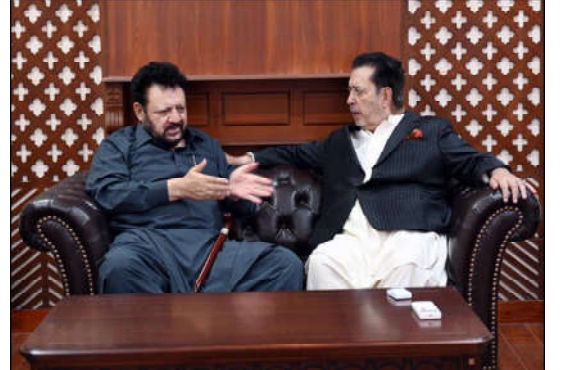
ISLAMABAD: Chief Minister Gilgit Baltistan Haji Gulbar Khan in a meeting with Governor Gilgit Baltistan Syed Mehdi Shah at his office.

hospitals on a priority basis. He said that all kinds of emergency services at MTIs should not be affected in any way, adding that required funds should be arranged on priority so that uninterrupted emergency services must be ensured in these hospitals. The Chief Minister said that it was the top priority of the caretaker provincial government to keep uninterrupted healthcare facilities continued for the public, and added that despite financial crunches, the provincial government would make no compromise on the provision of treatment facilities to the masses.