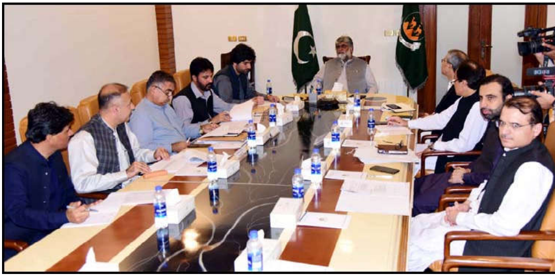
QUETTA: Caretaker Chief Minister Balochistan Mir Ali Mardan Khan Domki presiding over a meeting regarding National Program for Agriculture Development and Alternate Energy.