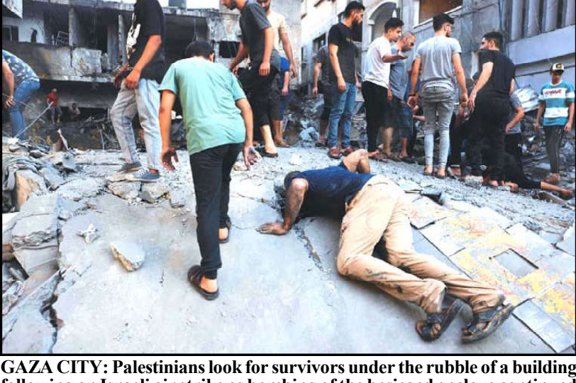
following an Israeli air strike as bombing of the besieged enclave continued for the fifth consecutive day.