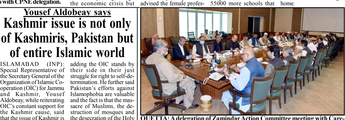
QUETTA: A delegation of Zamindar Action Committee meeting with Caretaker Chief Minister Balochistan Mir Ali Mardan Khan Domki

He said the Brick and Mortar structure could be followed to educate maximum number of children. He said the mosques could be utilized for providing education besides use of latest technology to educate the children while sitting at