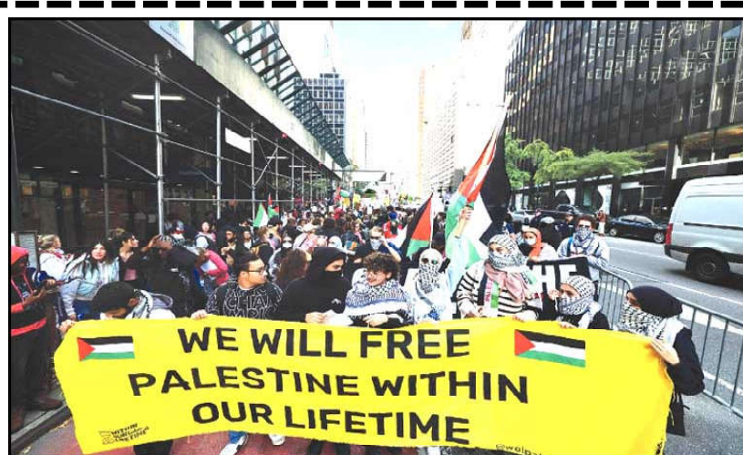
NEW YORK: Demonstrators gather in support of the Palestinian people during a rally for Gaza outside the Consulate of Israel.

According to Palestinian health officials, 4,000 people have been hurt in strikes so far, and 770 Palestinians have died in the Gaza Strip. Hamas sources in Lebanon have told Sky News the "operation" on Saturday was in the planning for more than a year.