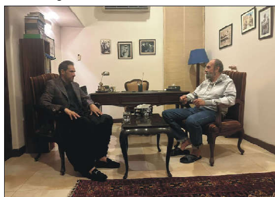
ISLAMABAD: Former Chief Ministers Balochistan Nawab Muhammad Aslam Raisani and Mir Abdul Quddus Bizenjo holding a meeting