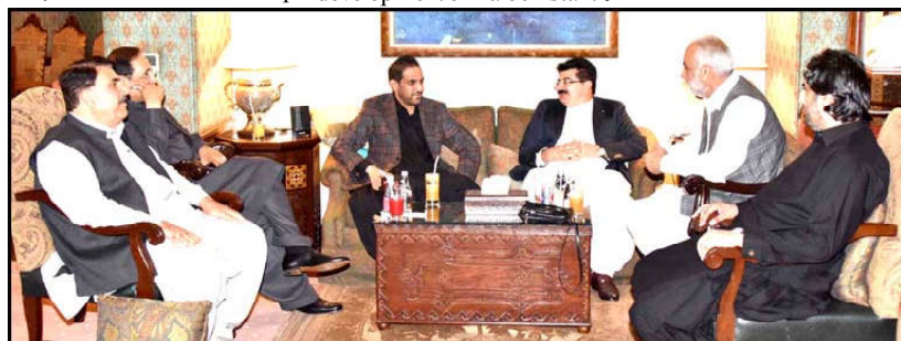
Chairman Senate, Muhammad Sadiq Sanjrani exchanging views with former Chief Minister of Balochistan, Mir Abdul Qudous Bizenjo in Islamabad.