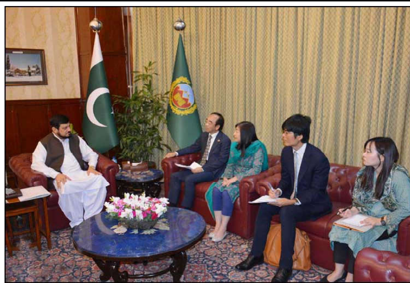
PESHAWAR: Governor Khyber Pakhtunkhwa Haji Ghulam Ali is called on by the Ambassador of the Japan Wada Mitsuhiro at Governor House Peshawar.

Kashmiris at all levels, and Pakistan will continue to play its positive role in this regard. He said that a peaceful solution to the Kashmir issue is very important for durable peace in the region. Governor Punjab said that Pakistan wants peaceful resolution of Kashmir and Palestine issues. He said that Israel's illegal occupation of Palestine and violations of human rights are a threat to the peace in the region. He said that depriving Palestinians of their legitimate right to self-determination, inhumane atrocities on innocent Palestinians, attacks on Al-Aqsa Mosque and other holy places by the Israeli occupying forces are crimes that the international community should not only take notice