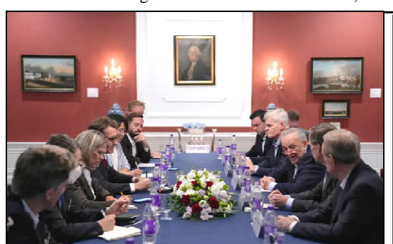
U.S. Senate Majority Leader Chuck Schumer, D-N.Y., speaks during a press roundtable with Schumer and his delegation at the residence of U.S. Ambassador to China, in Beijing.

Schumer later told reporters the meeting with Xi lasted 80 minutes, double the allotted time. Earlier China's top diplomat Wang Yi said he hoped Washington and Beijing could manage their differences "more rationally". Meeting with Schumer at Beijing's Diaoyutai State Guest-house, Foreign Minister Wang told the senate delegation he hoped their visit would help the two sides "manage existing differences more rationally, helping the relationship between the two countries return to the track of healthy development".