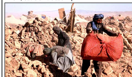
Afghan residents clear debris of damaged houses after earthquake in Nayeb Rafi village, Zenda Jan district of Herat province.

Adm. Stuart B. Munsch of the Allied Joint Force Command Naples, Italy said that a battalion of some 200 troops from the United Kingdom and 100 others from Romania "is bringing heavier armament in order to have combat power" to the NATO-led Kosovo Force, or KFOR, but didn't elaborate further. The KFOR peacekeepers — made up of around 4,500 troops from 27 nations — have been in Kosovo since June 1999, basically with light armament and vehicles. The 1998-1999 war between Serbia and Kosovo ended after a 78-day NATO bombing campaign forced Serbian forces to withdraw from Kosovo. More than 10,000 people died, mostly Kosovo Albanians. On Sept. 24, around 30 Serb gunmen killed a Kosovar police officer and then set up barricades in northern Kosovo before launching an hours-long gun battle with Kosovo police.