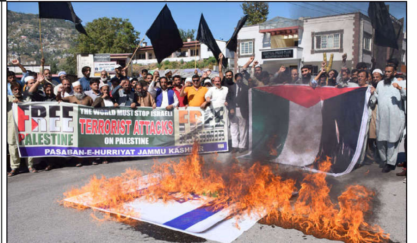
MUZAFFERABAD: Activists of Pasban-e-Hurriyat holds protest and burns Israeli flag at Azadi Chowk to show solidarity with Palestinian People.