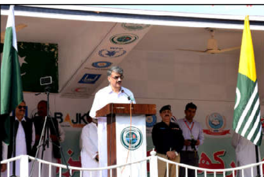
MUZAFFRABAD: Prime Minister of AJK Chaudhry Anwar ul Haq addressing during a ceremony to mark the 18th anniversary of the devastating 2005 earthquake

RAWALPINDI (APP): One terrorist was killed in an exchange of fire with security forces in Razmak area of North Waziristan. According to Inter Services Public Relations (ISPR), weapons and ammunition were also recovered from the killed terrorist. Known as Azeem Ullah alias 'Ghazi', the killed terrorist remained actively involved in various terror activities against security forces and killing of innocent civilians. The ISPR said sanitization has been carried out to eliminate any other terrorist in the area. Locals of the area have appreciated the operation.