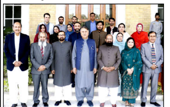
QUETTA: Governor Balochistan Malik Abdul Wali Khan Kakar in a group photo with members of College of Physicians and Surgeons Pakistan

It was told that the immigrants to be brought in Chaman following the action to be taken after the given date would be kept in the camps before their handing over to the respective country. The basic facilities have been provided at the camps, the number of which would be increased in view of the number of immigrants, it was further informed. The meeting was also informed that the strength of police and levies is being increased owing to the arrival of large number of immigrants in Chaman. In addition to this, it has been proposed to set up Afghan sub-consulate in Chaman.