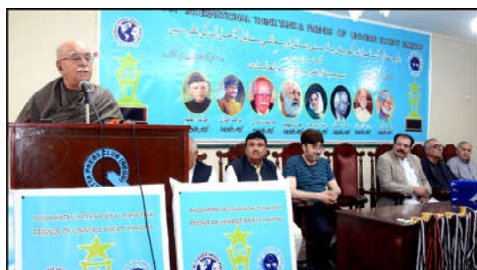
QUETTA: Chairman Pashtoonkhwa Milli Awami Party Mahmood Khan Achakzai addressing during award distributing ceremony organized by Baluchistan International Think Tank and friends of universe Society Pakistan, at Press club

the phase of election and during the environment of election, any party and its leadership had the freedom to give their stand on any important issue", he maintained. Murtaza Solangi said that media in Pakistan enjoyed freedom and the courts were also free, adding all registered political parties had equal opportunities. The Election Commission of Pakistan and caretaker government would ensure equal opportunities for all political parties in the upcoming elections, he added. The minister stated that there was no ban on PTI as a political party. Replying to a question, he said that the process of privatization was not initiated by caretaker government, previous parliament and its elected government decided to privatize various entities.