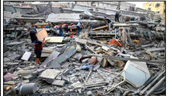
People inspect a building destroyed in Israeli strikes in Gaza City

The death toll of Israelis in various clashes has exceeded 600, including more than 100 military commanders and officials. On the other hand, the Israeli army, in a cowardly operation, bombarded the houses of Hamas commanders in Gaza throughout the night. Everywhere there are scenes of destruction. According to the Ministry of Health in the Gaza Strip, more than 313 Palestinians, including children, were martyred in these attacks. According to local media reports, fierce clashes between Israeli forces and Palestinian militants are ongoing in many parts of southern Israel. The Israeli army said it had regained control of most of the south, but heavy fighting was still ongoing in Israeli areas near the Gaza border, including Be'eri and Sderot.