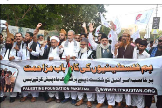
KARACHI: Palestine Foundation Pakistan activists chant slogans against Israel at a protest rally outside Karachi Press Club.

just close to his vehicle. As a result the explosive device hitting his vehicle exploded, the Project Manager PMDC died on the spot while his driver got injured. The area police and administration reached the spot and shifted the body of deceased to the local hospital. The injured, however, was removed to the Sandeman Provincial Headquarter Hospital for treatment where his condition is stated to be precarious.