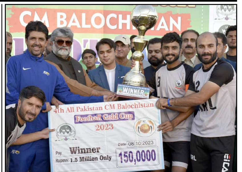
QUETTA: Caretaker Chief Minister Balochistan Mir Ali Mardan Khan Domki giving away trophy to captain of winning team after conclusion of All Pakistan Chief Minister Gold Cup Football Tournament. Caretaker Provincial Minister for Sports Mir Jamal Raisani is also present

This was briefed at a special session of the National Emergency Operations Centre held in Islamabad today.