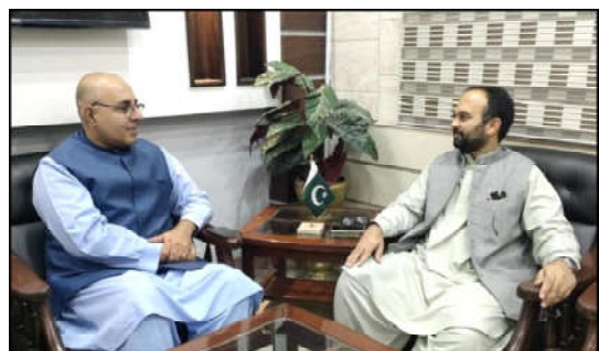
QUETTA: Caretaker Provincial Information Minister Jan Achakzai meeting with Caretaker Home Minister Captain (Retd) Muhammad Zubair Jamali

The Governor also appreciated the role of female teachers in the province and said that they are performing well despite the lack of necessary facilities and economic hardships.