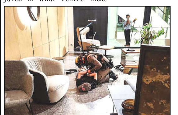
BANGKOK: This handout photo from the Royal Thai Police shows the arrest of a 14-year-old shooting suspect at the Siam Paragon shopping centre.