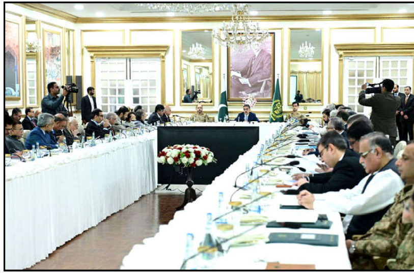
ISLAMABAD: Caretaker Prime Minister Anwaar-ul-Haq Kakar chairing 6th meeting of the Apex Committee of Special Investment Facilitation Council

The chief of army staff assured unflinching resolve of Pakistan army to support the government's endeavours for a sustainable path towards economic recovery.