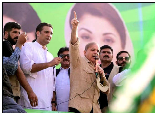
LAHORE: PML-N President Shehbaz Sharif addressing a political gathering.