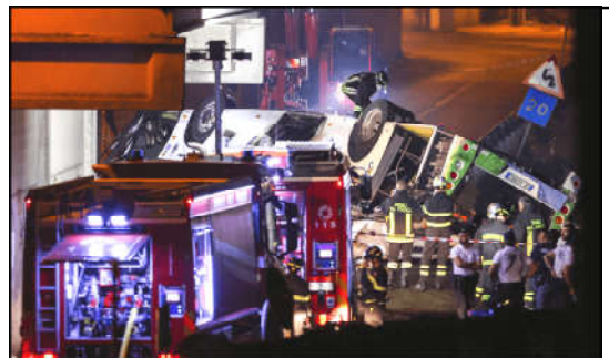
Firefighters and rescue personnel work near a coach after it crashed off an overpass near Venice, in Mestre, Italy.

Monitoring Desk BAKU: Azerbaijan's President Ilham Aliyev has decided against attending an EU-brokered event in Spain where he could have held talks with Armenian Prime Minister Nikol Pashinyan, Azerbaijani state media reported on Wednesday. Aliyev had been considering taking part in a five-way meeting in Granada, Spain, on Thursday with the leaders of France, Germany, Armenia and EU Council President Charles Michel. The five were due to discuss the future of the Nagorno-Karabakh region after Baku took back full control in a 24-hour military operation launched on Sept. 19, and to review the progress of long-running but troubled peace talks between Azerbaijan and Armenia. Azerbaijan's state-run APA news agency, citing unnamed sources, said Aliyev had decided against attending however. There was no official confirmation that Aliyev would not go. APA said Aliyev had wanted Turkey to be represented at the meeting, but that France and Germany had objected, and said that Baku felt "an anti-Azerbaijani atmosphere" had developed among the meeting's potential participants.