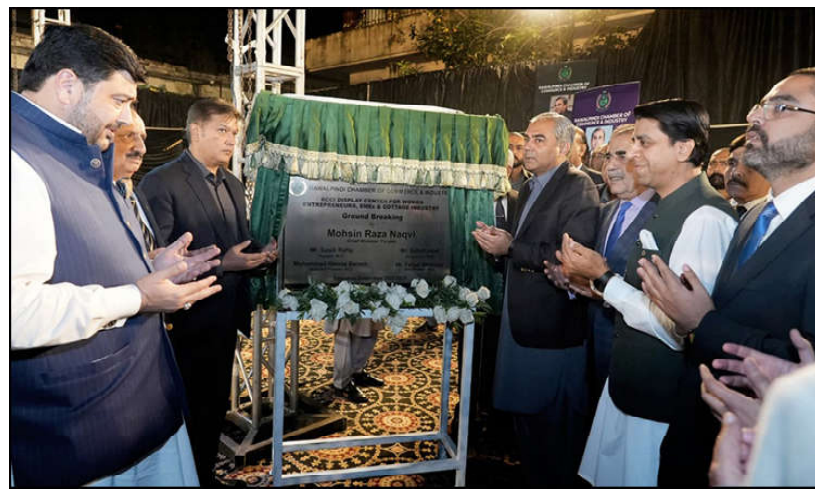
LAHORE: Caretaker Chief Minister Punjab Mohsin Naqvi and others offering Dua after laying foundation stone of the business women, small and medium enterprises and cottage industries display centre.

minister mentioned the transformation of the Urology Hospital into a PKLI, significantly enhancing its standards. He commended the Provincial Minister for Industries SM Tanveer and the Chief Secretary Punjab for their dedicated work on the one-window operation. Highlighting the study of the one-window operation model in China, the CM announced its implementation by establishing a one-window operation facility in alignment with the recommendations of the six major chambers of commerce and industries in Punjab. "The finalization of this operation is expected in the coming days, facilitating seamless interaction between the business community and 36 departments."