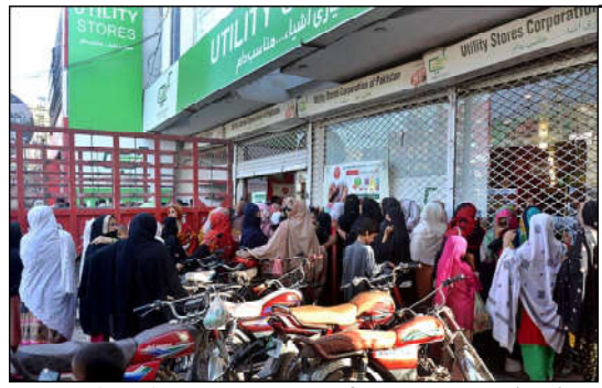
MULTAN: A large number of women standing in a queue waiting their turn outside Utility Store to purchase grocery items at Rasheedabad.