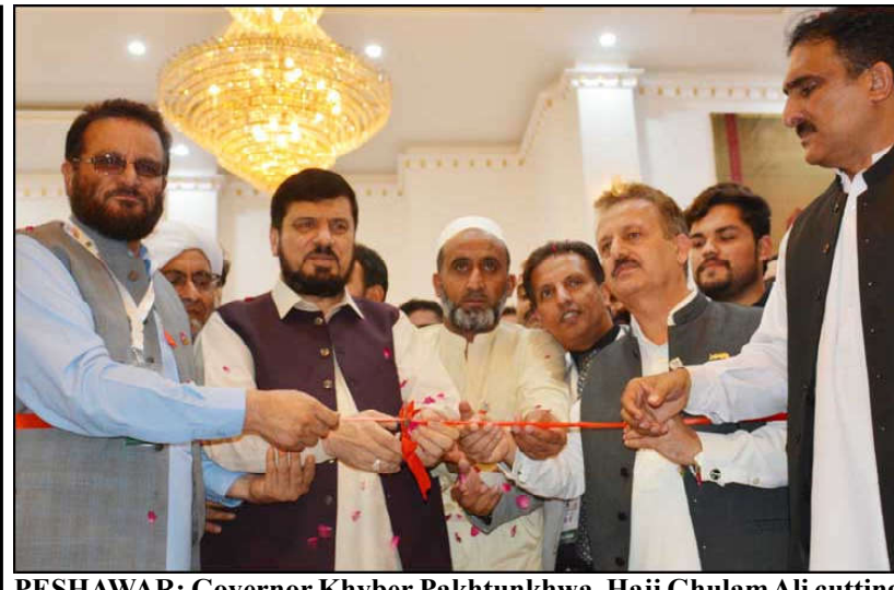
PESHAWAR: Governor Khyber Pakhtunkhwa, Haji Ghulam Ali cutting ribbon to inaugurate Mega International Livestock & Fisheries Expo organized by the provincial livestock department.

He outlined three key priorities for the energy sector.