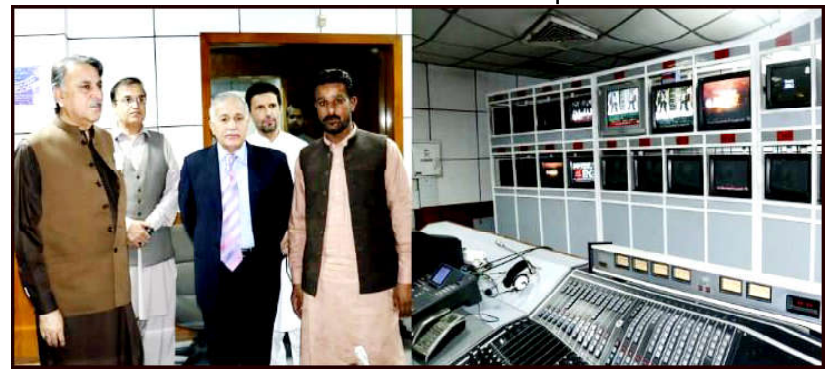
QUETTA: Governor Balochistan Malik Abdul Wali Khan Kakar inspecting different sections during his visit to Pakistan Television Quetta Center