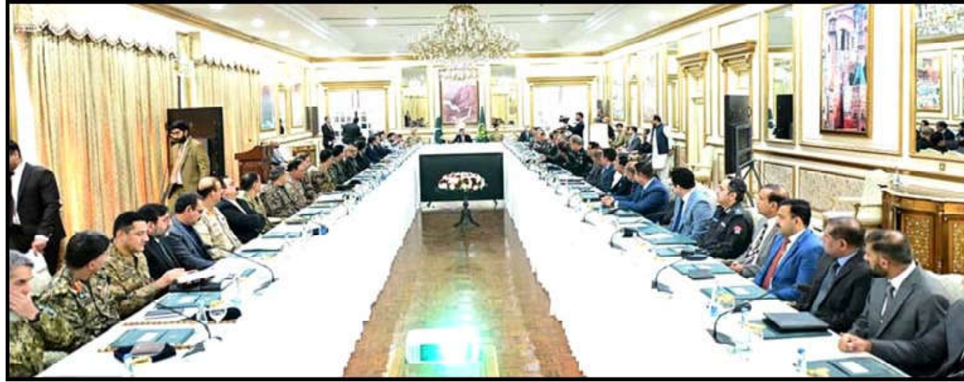
ISLAMABAD: Caretaker Prime Minister Anwaar-ul-Haq Kakar chairs a meeting of the Apex Committee on National Action Plan.

Ph: 2841470/2841473 Vol: XVI No. 132, Rabi-ul-Awwal 17, 1445 AH Wednesday October 04, 2023, Pages 08, Price Rs.15