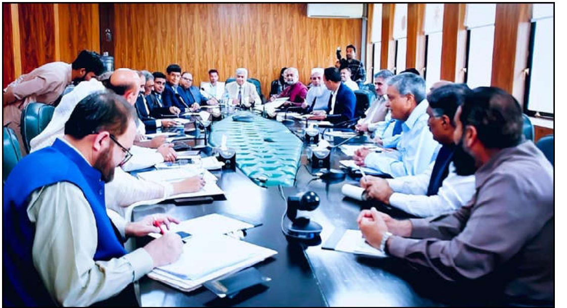
Caretaker Federal Minister for National Food Security and Research, Dr. Kausar Abdullah Malik chaired a meeting on Seed System of Pakistan and reviewed its challenges and future prospects at Islamabad.

the other hand, implementation of the economic adjustment program and a likely smooth general election should boost confidence, while the easing of import controls should support investment as fiscal tightening restrains public consumption. On the output side, better weather conditions will enable an increase in the area under cultivation and in yields, supporting recovery in agriculture. The government's relief package of free seeds, subsidized credit,