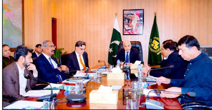
ISLAMABAD: Caretaker Federal Minister for Railways, Shahid Ashraf Tarar chairing a meeting at Ministry of Railways.