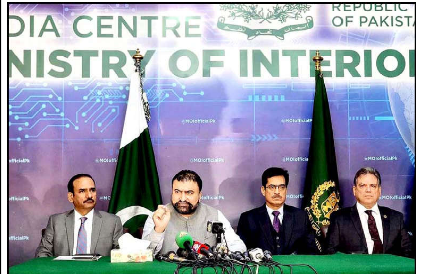
ISLAMABAD: Caretaker Federal Minister for Interior, Sarfraz Ahmed Bugti addressing a Press Conference.

Sayyed Mazhar Ali Akbar Naqvi, Justice Jamal Khan Mandokhel, Justice Muhammad Ali Mazhar, Justice Ayesha A. Malik, Justice Athar Minallah, Justice Syed Hasan Azhar Rizvi, Justice Shahid Waheed, and Justice Musarrat Hilali. The hearing was adjourned till Monday, October 9. At the start of today's hearing, the chief justice said the law affected the CJP and the two senior-most judges of the SC. He added that the law would also apply to future chief justices and senior judges of the apex court. Elaborating further, Justice Isa stated that he felt that he should not have been part of the bench, however, as the law affects all judges of the apex court, it was decided that a full court will hear the case.