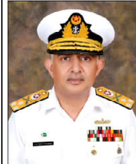
ISLAMABAD (Online): Vice Admiral Naveed Ashraf has been appointed as the new Naval Chief.

Naveed Ashraf got commission in the Operations Branch of Pakistan Navy in 1989. He is a graduate of National Defense University Islamabad, US Naval War College and UK's Royal College of Defense Studies. Vice Admiral Naveed Ashraf has vast experience of working in key command and staff positions. He is currently serving as the Chief of Staff at the Naval Headquarters. In recognition of his exceptional professional services and valiance, Naveed Ashraf has also been awarded with Hilal-e-Imtiaz (Military) and Tamgha-i-Basalat.