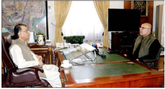
He called on him here at the Governor House on Monday. During the course of meeting, they discussed the latest political situation, role of modern technology in sustainable development, complete operationalisation of the

technical institutions, besides other matters of mutual interests. Speaking on the occasion, Governor said that actually technology is the basis of economic and social development and this is reality that the dream of bright future can't be materialised without getting acquainted about the modern technology. The Governor said