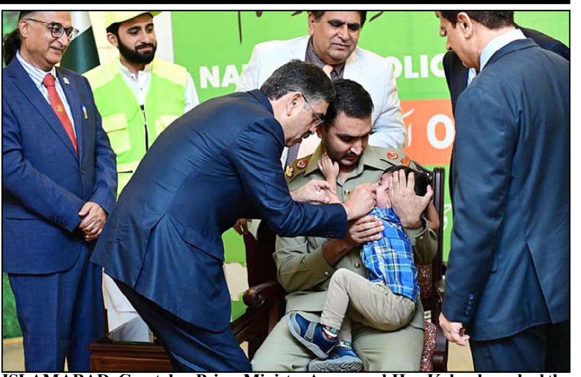
ISLAMABAD: Caretaker Prime Minister Anwaar-ul-Haq Kakar launched the National Polio Eradication Campaign by administering polio drops to child.