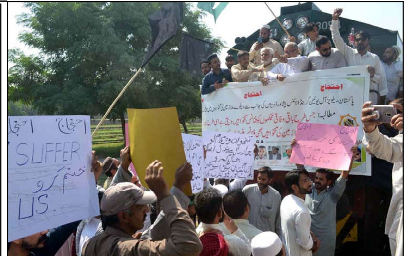
PESHAWAR: Members of Pakistan Railway All Union Grand Alliance block railway track as they are holding protest demonstration for acceptance of their demands, held at Cantt Railway Station in Peshawar.

exports decreased by 3.78 per cent to $6.899 billion compared to the exports of $7.170 billion during the corresponding period of last year, according to the latest PBS data. On the other hand, the imports narrowed by 25.36 per cent and were recorded at $12.188 billion compared to $16.329 billion last year. Meanwhile, on a year-on-year basis, the exports from the country increased by 1.15 per cent in September compared to the exports of the same month of last year.