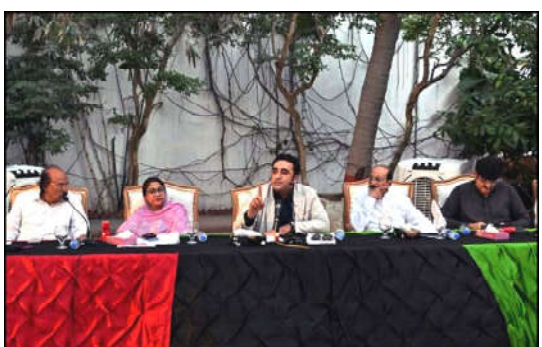
KARACHI: Peoples Party (PPP) Chairman, Bilawal Bhutto Zardari addresses the PPP candidates who won the local elections of Sindh, during meeting held at Bilawal House in Karachi.

The ministers said that the caretaker government will provide all possible assistance to the ECP in fulfilling its constitutional responsibility of conducting general elections in the country.