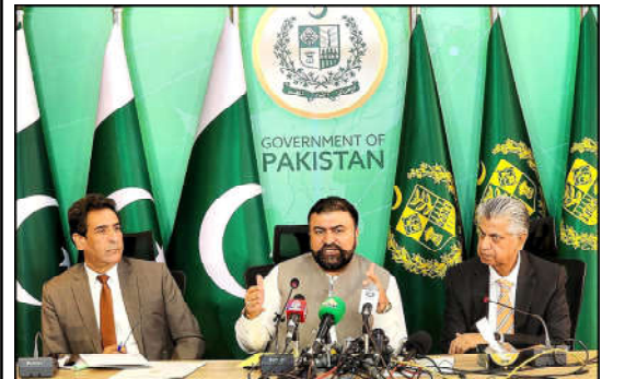
ISLAMABAD: Chairman Federal Minister for Interior Sarfraz Ahmed Bugti and Caretaker Federal Minister for Information and Broadcasting Murtaza Solangi addressing a press Conference.

However, steps are being taken for prevention of the virus and stopping it's spread to other areas.