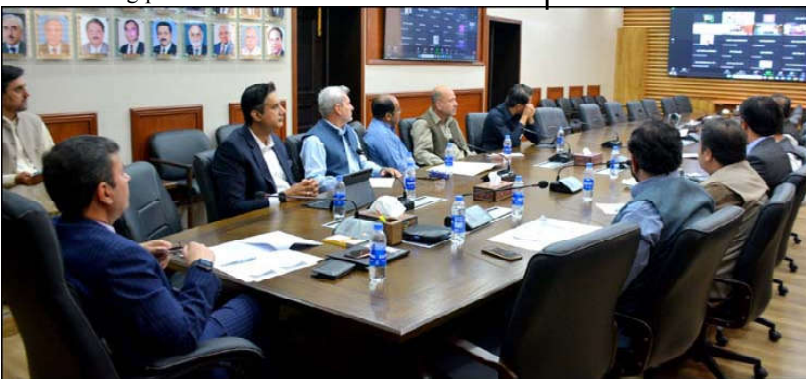
QUETTA: Balochistan Chief Secretary Shakeel Qadir Khan presiding over a meeting regarding Price Control Mechanism

ISLAMABAD (APP): Chairman Council of Islamic Ideology Qibla Ayaz called on Caretaker Prime Minister Anwaar-ul-Haq Kakar here on Monday. During the meeting, Qibla Ayaz paid tribute to the prime minister on successfully representing Pakistan in the United National General Assembly (UNGA). The chairman of the Council informed the prime minister about the current status of religious harmony in the country. He also invited PM Kakar to attend the general meeting of the Council of Islamic Ideology. The prime minister said the Islamic Ideology Council had been playing active role in maintaining law and order and religious harmony in the country.