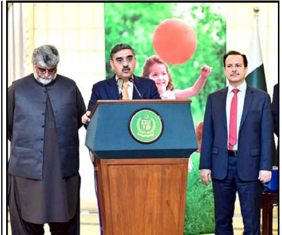
ISLAMABAD: The Caretaker Prime Minister Anwaar-ul-Haq Kakar addresses the launching ceremony of National Polio Eradication Campaign. Caretaker Chief Minister Balochistan Mir Ali Mardan Khan Domki is also present

Lt Gen Muhammad Munir is an MPhil in Public Policy and National Security Management.