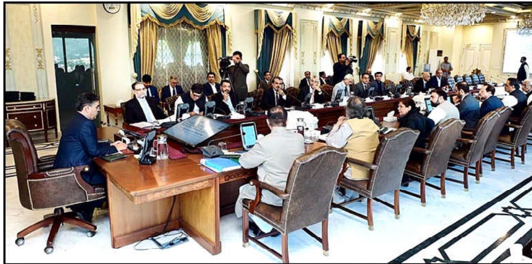
ISLAMABAD: The Caretaker Prime Minister Anwaar-ul-Haq Kakar chairs a meeting of the Federal Cabinet.

Khyber Pakhtunkhwa at a time when the main grip—ped by intense winter.