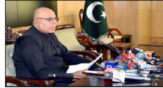
secretariat on Sunday afternoon.

“We would go behind all those involved in the Mastung carnage including