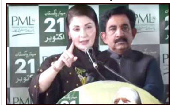
LAHORE: Senior Vice President and Chief Organizer of PML (N) Maryam Nawaz presiding over meeting of youth volunteers.

“Heartiest congratulations to Dr. Mohamed Muizzu on his victory in the presidential elections of Maldives. Look forward to working with him for further strengthening Pak-Maldives relations and regional cooperation,” the prime minister said on X, formerly known as twitter.