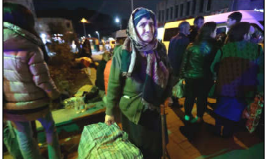
An ethnic Armenian woman from Nagorno-Karabakh carries her suitcase to a tent camp after arriving to Armenia's Goris in Syunik region, Armenia.