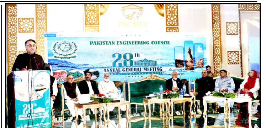
QUETTA: Governor Balochistan, Malik Abdul Wali Khan Kakar addressing the annual meeting of Pakistan Engineering Council (PEC)

During the strike, the flow of traffic remained below normal in the metropolis. The Ittehad Ahle Sunnat leaders demanded of the government to bring the terrorist elements involved in the Mastung carnage to justice immediately apprehending them.