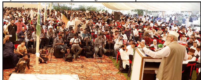
LAHORE: Amir Jamaat-e-Islami Sirajul Haq addressing Workers Convention and Youth Talent Award ceremony

During the month, eight youth were critically injured due to use of brute force by Indian paramilitary and police personnel in the territory. At least 157 civilians and political activists were arrested and most of them were booked under black laws, Public Safety Act (PSA) and Unlawful Activities (Prevention) Act (UAPA).