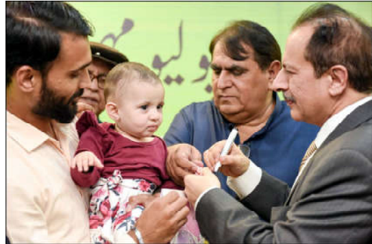
ISLAMABAD: Caretaker Federal Health Minister Dr. Nadeem Jan inaugurating 2nd anti polio campaign of 2023 by administering drop to a child

ISLAMABAD (APP): Caretaker Federal Minister for Health Dr Nadeem Jan on Sunday launched the anti-polio campaign by administering polio drops to children. Addressing the occasion, he said that the second national anti-polio campaign of the year 2023 is being started across the country from October 2. The minister said that around 43 million children will be vaccinated in the national anti-polio campaign. Dr. Nadeem Jan said that there is no cure for polio and that only the polio vaccine can save children from permanent disability. He urged parents, civil society, teachers, scholars and religious scholars to play their roles in the eradication of polio. Dr. Nadeem Jan said that eradication of polio is essential for our national honor and respect. He said at one stage it was not possible to eliminate polio from Afghanistan and Pakistan. Now we are close to eradicating polio." He said, "The fight to eradicate polio cannot be won without the help of parents." He appealed to citizens to cooperate with polio volunteers when they were at their doorstep. The minister said that work is being done under a comprehensive strategy for the eradication of polio. He said that the ministry has appointed top officers in Southern KP to stop the spread of the virus.