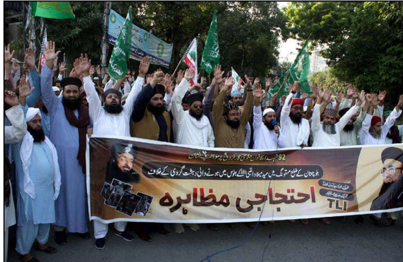
LAHORE: Members of various Sunni organizations are holding protest demonstration against the bomb attack on religious procession of 12th Rabi-ul-Awwal Eid Milad-un-Nabi in Mastung District, held at Lahore press club.