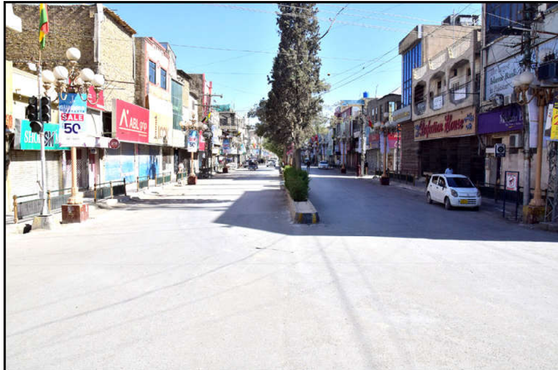
QUETTA: Business activities seen closed while markets gives deserted look during the shutter down strike called by Ittehad Ahle Sunnat Balochistan against Mastung bomb blast

Ph: 2841470/2841473 Vol: XVI No. 130, Rabi-ul-Awwal 15, 1445 AH Monday October 02,, 2023, Pages 08, Price Rs.15