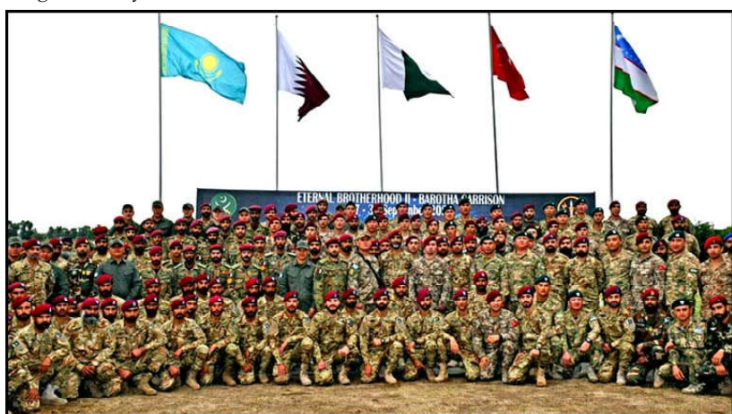
The two-week-long Exercise Eternal Brotherhood-II commenced on September 17 in Barotha, the Inter-Services Public Relations (ISPR) news release said. The Corps Commander 11 Corps attended the Closing Ceremony as Chief Guest along with the Director General Military Training and General Officer Commanding Special Service Group.

RAWALPINDI (APP): The Multinational Joint Special Forces Exercise Eternal Brotherhood-II conducted among Special Forces of Pakistan, Kazakhstan, Qatar, Turkiye and Uzbekistan in Counter Terrorism domain has concluded, the Military’s media wing on Sunday said.