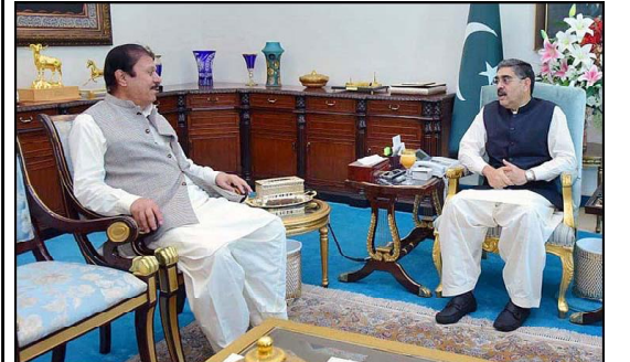
ISLAMABAD: Former Senator Sardar Muhammad Yaqoob Khan Nasir calls on the Caretaker Prime Minister Anwaar-ul-Haq Kakar.

focus on undertaking new various schemes to increase the revenue level of the Authority at large. He directed to launch of a comprehensive media campaign for the implementation of hiked violation fines on Motorways and National Highways across the country. He further asked to gear up the pace of work on the construction of residential apartments for NHA employees. Tarar desired to improve the maintenance affairs of Motorways and National Highways and that maximum travelling and civic amenities on service and rest areas be ensured for ease of the travellers. He also emphasized the beautification of Motorways loops that would ultimately improve environmental conditions and will be a practical step forward towards achieving an environmentally friendly roads network in the country.