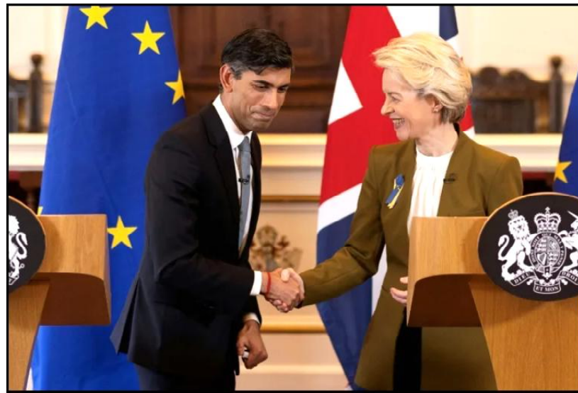
London and the EU agreed the UK can rejoin the EU's Horizon science programme.

with Washington set to unveil more than $1 billion in fresh aid to battle Russia. During a meeting with Foreign Minister Dmytro Kuleba, Blinken reiterated Washington's support for Kyiv in its fight to liberate territory in the south and east. "We want to make sure that Ukraine has what it needs, not only to succeed in the counteroffensive, but has what it needs for the long term, to make sure that it has a strong deterrent," he told Kuleba. Blinken is expected to announce "more than a billion dollars in new US funding for Ukraine", said a senior State Department official. The Kremlin dismissed Blinken's Kyiv visit, arguing US aid would not "influence the course of the special military operation" — Moscow's term for its offensive.