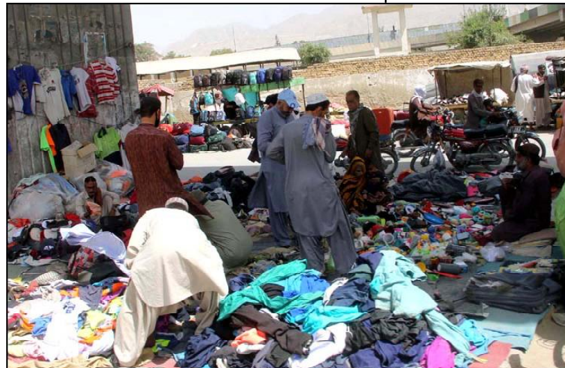
QUETTA: People purchase used goods due to price hiking, at makeshift weekly market located on Benazir Flyover road in Quetta

Commenting on the collaboration, Shahzad Khan, Head of Productive Lending, Channels & Corporate Business,