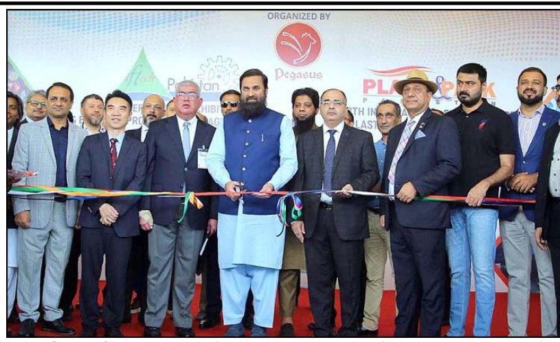
LAHORE: Governor Punjab, Muhammad Balighur Rehman cutting ribbon to inaugurate the 18th IFTECH and Plastic & Pack exhibitions at Expo Centre.