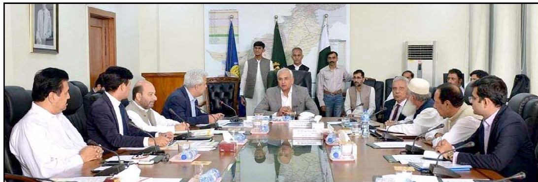
ISLAMABAD: Federal Minister for Communications & Railways Mr. Shahid Ashraf Tarar presiding over meeting of National Highway Council - Supreme body of National Highway Authority.

warships proceeded on an audacious mission inside enemy territory and destroyed significant shore installations including Indian radar station and a radio beacon at Dwarka. PN Flotilla's attack took the enemy by surprise and dealt a severe blow to the morale of the Indian Navy that not only rattled its defences but paralyzed its response. Furthermore, PN Submarine GHAZI posed an ominous threat to the Indian Navy severely restricting its operations and confining it close to the coast. Pakistan Navy besides ensuring own maritime defence also maintains round the clock presence in the international waters and engages with regional navies to foster interoperability and promotes maritime security at high seas. Therefore, Pakistan Navy is acquiring state of the art capabilities to meet emerging security challenges.