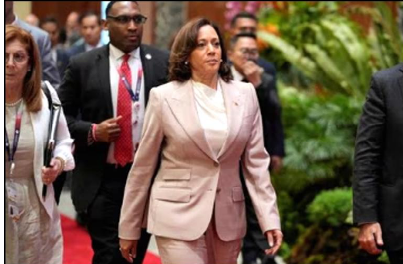
U.S. Vice President Kamala Harris leaves after attending the East Asia Summit at the Association of Southeast Asian Nations (ASEAN) Summit in Jakarta, Indonesia.

summit, where Premier Li Qiang will represent the country. Afterward the summit, Biden and Vietnamese General Secretary Nguyen Phu Trong will meet in Hanoi and are expected to announce plans to tighten economic cooperation. Vietnam and China have robust trade relations, but also deep differences. Vietnam, like Malaysia, the Philippines, Taiwan and Brunei, has been in a tense territorial standoff for decades with China.