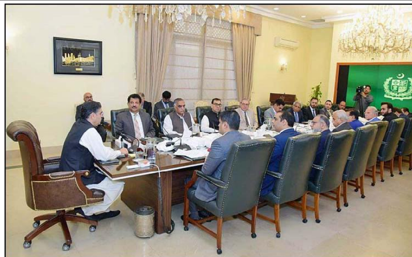
ISLAMABAD: A delegation of Islamabad Chamber of Commerce called on Caretaker Prime Minister Anwaar-ul-Haq Kakar

He directed the authorities concerned to submit a report on expansion of FBR's Point of Sales system besides improving the performance of commercial attaches in Pakistan's diplomatic missions.