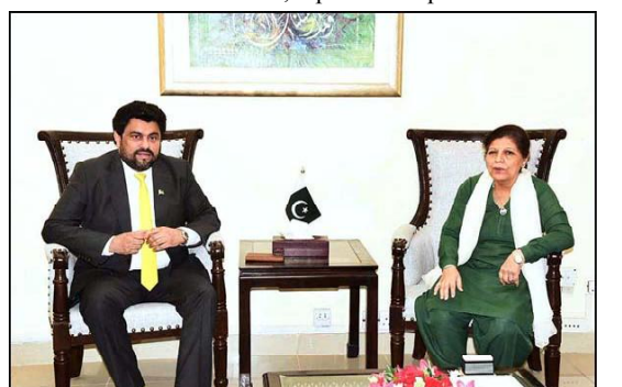
ISLAMABAD: Muhammad Kamran Tessori, Governor of Sindh called on Dr. Shamshad Akhtar, Caretaker Federal Minister for Finance, Revenue, Economic Affairs & Privatization at Finance Division.