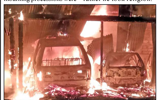
ABBOTTABAD: A View of the fire eruption in vehicles at workshop of shumalai area of the District.

taken out to highlight the importance of the day and pay rich tribute to the Karbala martyrs. On the occasion Chehlum, the prominent speakers said that Azadari is the strongest citadel and most effective spiritual weapon against international colonial powers. Addressing in Majlis-e-Aza, the participants, and speakers said Azadari is echoes of Zainab (RA) and Zain-ul Abideen (RA). They said Azadari-e-Imam Hussain (RA) preaches courage and bravery and the lesson of sacrifice with the spirit of sacrifice. In Khairpur and other districts, speakers said that Nawasa-e-Rasool Al-Saqain Shahzade-e-Konain Hazrat Imam Hussain (RA) sacrificed his life along with 72 near and dear ones in Karbala for protecting Islamic values, supporting human dignity, and defending religion and Shariat rather he took religion.