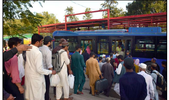
ISLAMABAD: A view of the long queue of passengers at Green Line/Blue Line Bus Station outside PIMS Hospital as according to them the quantity of buses are very rare, which needs to be increased by local administration for the ease of the passengers in Federal Capital.

In a meeting held at the Central Police Office, he gave directions to ensure the effective security of residential foreign diplomats, ambassadors, and offices of international organizations. The meeting was attended by the officers of NLC, Police and CDA. The meeting assessed the complete security of the diplomatic enclave and decided to take measures for its improvement. During the meeting, ongoing construction work in the diplomatic enclave was also reviewed, emphasizing environmentally-friendly construction practices and minimizing damage to natural beauty such as trees and greenery.