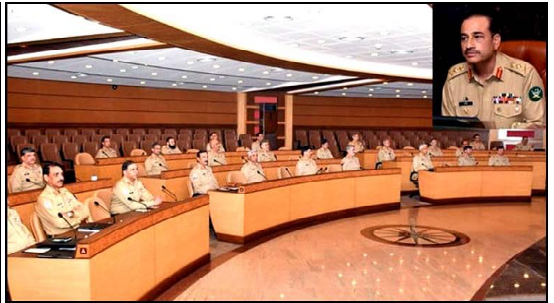
RAWALPINDI: Chief of the Army Staff General Asim Munir presiding over 259th Corps Commanders' Conference.