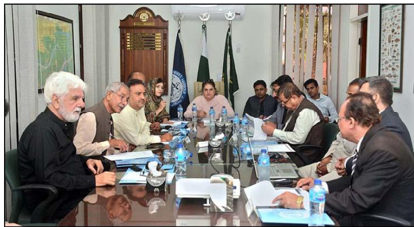
KARACHI: Chairperson Senate Standing Committee on Maritime Affairs Senator Rubina Khalid chairing a meeting to review performance of Korangi Fisheries Harbour Authority (KoFHA).

The chairperson and committee members expressing dissatisfaction with the performance of the authority noted that KoFHA had failed to exert its authority with regard to controlling unlicensed fishing activities in its jurisdiction, starting auctions at the harbour and facilitation of export-oriented business activities. The chairperson proposed the officials to frame a clear plan of action with defined functions and powers and implementation mechanism for ensuring the licensing of fishing vessels besides utilizing modern technology.