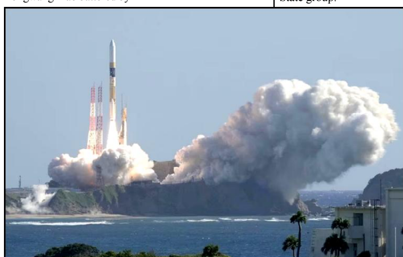
H-IIA rocket carrying the national space agency's moon lander is launched at Tanegashima Space Center on the southwestern island of Tanegashima, Japan in this photo taken by Kyodo.

of cancer in 2019, up 28pc from 1990, the study said. The deadliest cancers were breast, windpipe, lung, bowel and stomach cancers, according to the study. Breast cancer was the most commonly diagnosed over the three decades. But the cancers that rose the fastest were of the nasopharynx, where the back of the nose meets the top of the throat, and prostate. Liver cancer meanwhile fell by 2.9pc a year. The researchers used data from the 2019 Global Burden of Disease Study, analysing the rates of 29 different cancers in 204 countries. The more developed the country, the more likely it was to have a higher rate of under-50s diagnosed with cancer, the study said. This could suggest that wealthier countries with better healthcare systems catch cancer earlier, but only a few nations screen for certain cancers in people under 50, the study added.