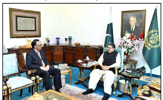
ISLAMABAD: Caretaker Foreign Minister Jalil Abbas Jilani called on caretaker Prime Minister Anwar-ul-Haq Kakar.

He stressed that Food department, concerned departments and district administration would have to take wholehearted action for bringing stability in the prices.