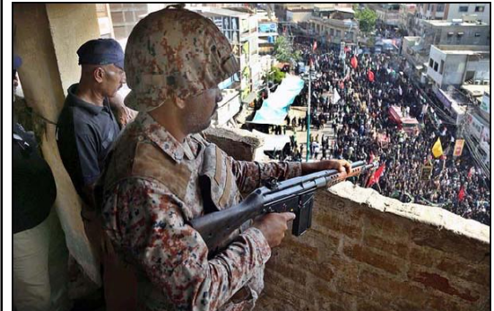
HYDERABAD: Security high alert on the top of building at Koh-e-Noor Chowk during Chehlum of Hazrat Imam Hussain (RA) the grandson of the Holy Prophet Mohammad (PBUH), martyred along with his family members and companions at Karbala.

prosecution procedure after registration of FIR against power thieves. The Chief Secretary said that prevention of electricity theft is a national cause. He said that the burden of electricity theft has to be borne by the common consumer, and urged the citizens to support the government in the national campaign against electricity theft. He said that electricity thieves are causing direct damage to the national treasury, adding that it is necessary to punish such elements. The Chief Secretary said that according to the data, the line losses are highest in the areas managed by LESCO and MEPCO in Punjab. He said that the administration and police would provide full support in the operation against electricity theft while a committee would be constituted at the province level for monitoring.