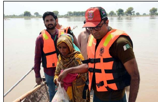
MULTAN: Rescue workers evacuate people from the villages as water from the Sutlej River continued to inundate settlements along its banks, near Multan on Thursday.