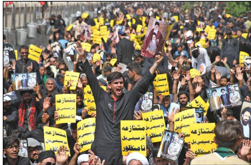
KARACHI: Shiite Muslims holds placards against the National Assembly Bill, during Arbaeen procession in Provincial Capital.