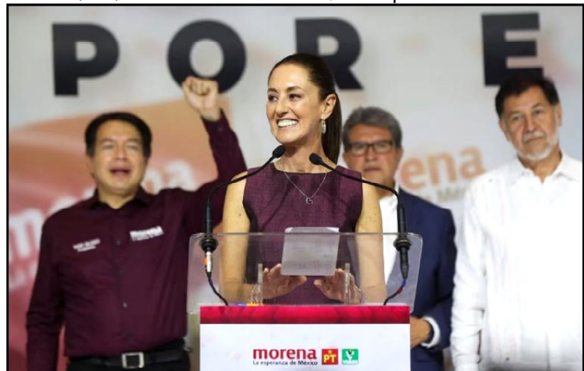
Former Mexico City Mayor Claudia Sheinbaum smiles after the announcement of the results of an internal national polling which declared Sheinbaum as the presidential candidate, in Mexico City, Mexico.

Monitoring Desk LONDON: The U.K. announced Wednesday it will declare Russia's Wagner mercenary group a banned terrorist organization, saying it remains a threat to global security even after the death of leader Yevgeny Prigozhin. The government said an order will be introduced in Parliament to proscribe the group under the Terrorism Act. The designation, once approved by lawmakers, will bar membership in or support for Wagner, which has played a major fighting role during Russia's invasion of Ukraine. It also has operated in Syria and several African nations. The move, expected to take effect within days, puts Wagner in the same category as the Islamic State group.