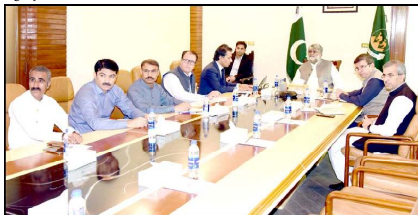
QUETTA: Caretaker Chief Minister Balochistan Mir Ali Mardan Khan Domki presiding over a meeting to review affairs of Food Department