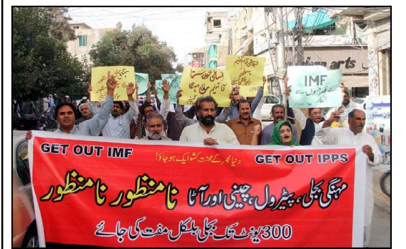
QUETTA: Members of Awami Action Committee are holding protest demonstration against massive unemployment, increasing price of daily use products, inflation price hiking and the highly inflated electricity bills, at Quetta press club.

"The NEC has approved an energy conservation plan under which shops and commercial centres would be closed by 8pm," he had announced, noting that energy has become a huge challenge for Pakistan due to global prices. However, no implementation was made on the measures announced by the previous govt.