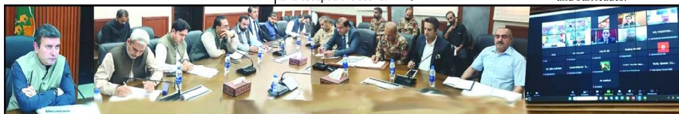
QUETTA: Chief Secretary Balochistan Shakeel Qadir Khan presiding over a meeting of Provincial Task Force for Anti-Smuggling regarding stopping of smuggling of Urea and Sugar in the province