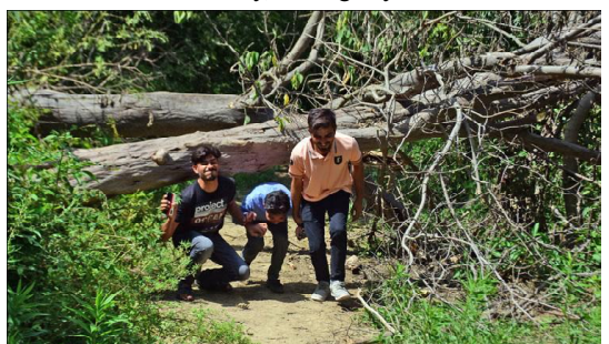
ISLAMABAD: A view of the newly inaugurated "Jungle Track" at Shakarparian area as the track is unsuitable for walking or cycling at all, which is surprising in order to inaugurate by Chairman CDA in Federal Capital.

The CWAs provided valuable insights into their roles, shedding light on the obstacles they encountered while providing support to the Pakistani community, it