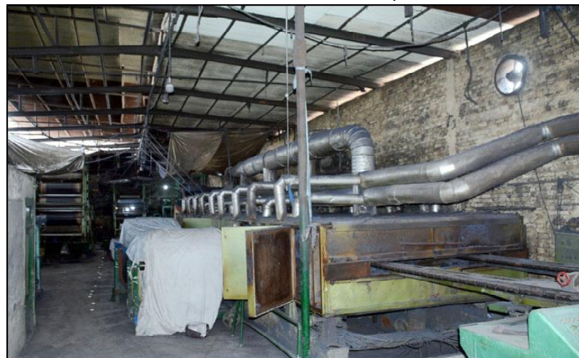
FAISALABAD: A view of the unfunctional factory along the Maqbool road as due to the un stable economic and political situation, a lot of such factories shut their production across the country.

As per the details available on the official site of the PTA, the number of active mobile SIMs reached 191 million during the same period. The number of broadband subscribers reached 129 million while the broadband penetration was recorded at 54.18 per cent.