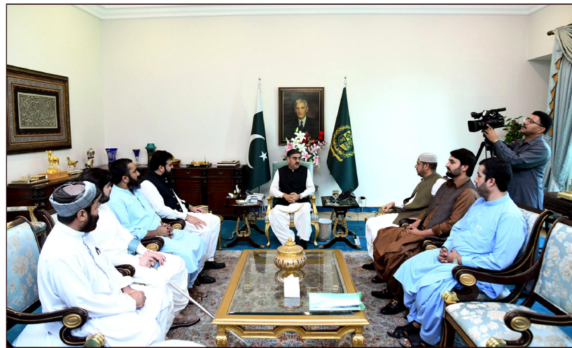
ISLAMABAD: A delegation of notables from Balochistan led by Haji Aziz Hasni, called on Caretaker Prime Minister Anwaar-ul-Haq Kakar.