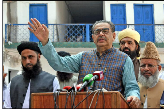
LAHORE: Caretaker Federal Minister for Religious Affairs Aneeq Ahmed talking to media persons after visiting Jamia Naemia.

Earlier this week, top government officials announced a countrywide crackdown against smugglers and power thieves in attempt to reduce the losses suffered by national exchequer and control the rising prices of different commodities.