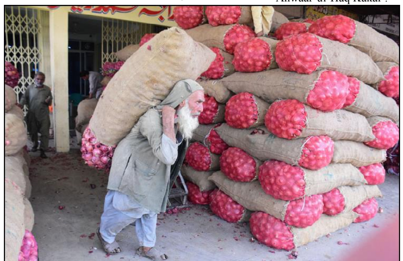
ISLAMABAD: An elder vendor holds heavy weight Onion Sack on his back at Fruit and Vegetables Market as due to the extremely high Inflation such vendors, who are in the retirement age are doing hard work to earn daily wages for the livelihood of his family.

were cultivated at a small area whereas other vegetables needed more area. Therefore, before planting the vegetables, a diagram should be drawn on a paper and write the selected vegetables in it. Similarly, the spokesman also suggested cultivating vegetables in rows with sufficient distance between plants and their rows. In winter the rows for vegetable cultivation should be oriented to north-south for getting maximum sunlight. The birds and pet animals like chicken and rabbits could attack the kitchen gardening vegetables. Therefore, protective fence and bright strips.