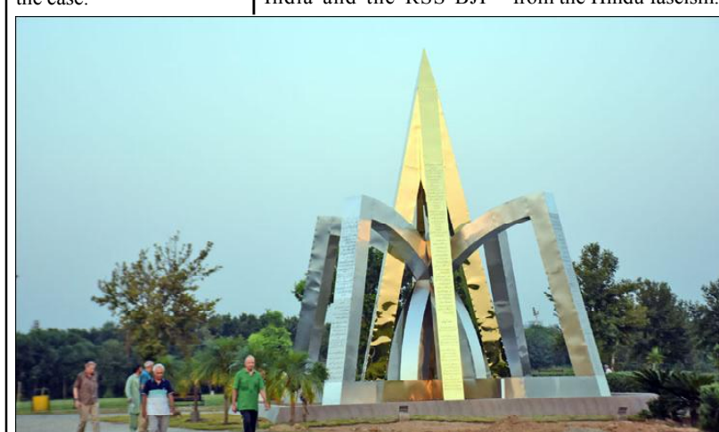
ISLAMABAD: A view of the newly installed Martyrs Monument at Fatima Jinnah Park in Federal Capital.