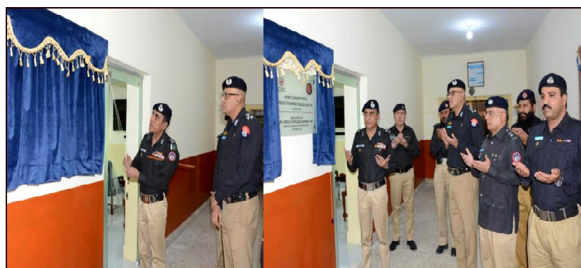
QUETTA: Inspector General of Police Balochistan Abdul Khaliq Sheikh inaugurating training hall at Police Training College Quetta

Meanwhile, a comprehensive campaign would be launched on mainstream and social media before and after the return of elder Sharif who is now scheduled to fly back home in October.