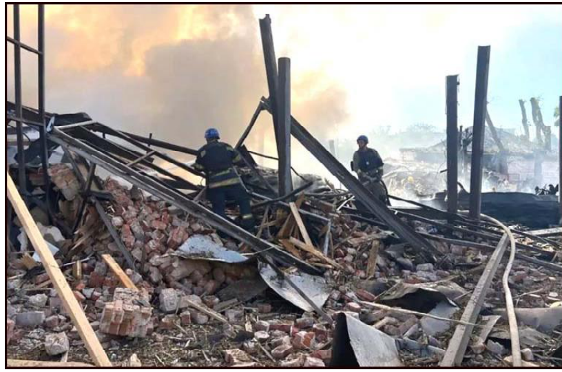
Emergency services personnel work to extinguish a fire following a Russian attack in Kryvyi Rih, Ukraine.

Journalists kept away from Modi-Biden meeting Monitoring Desk NEW DELHI: US President Joe Biden was welcomed warmly by Indian Prime Minister Narendra Modi on Friday ahead of the G20 summit in New Delhi, but journalists were blocked from covering the key meeting. Media access to such bilateral encounters on the sidelines of major summits like the G20 is always tightly controlled, but it is rarely blocked entirely. The incident comes after protracted negotiations were needed before Indian officials agreed to Modi taking one question from US reporters at a press briefing when he made a state visit to Washington.