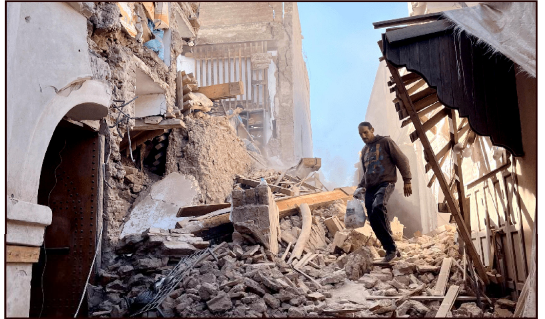
Continued on page 2 A general view of damage in the historic city of Marrakech, following a powerful earthquake in Morocco

People were all in shock and panic. The children