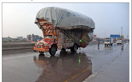
ISLAMABAD: A view of the over-loaded truck travelling at Express Way during rainy weather early in the morning, which may have chance of an incident, in Federal Capital.

ISLAMABAD (APP): The separate MDCAT examination for the students of flood affected areas will be convened after consultation with the provincial governments. According to a circular issued by the Acting Registrar of Pakistan Medical and Dental Council (PMDC), all aspects and any other valid reason in this regard will be discussed with provinces. It added that Caretaker Federal Minister for Health Dr. Nadeem Jan had taken sympathetic view to the plight of those flood affected students who intend to appear in the MDCAT examination, going to be convened on September 10, 2023. It said that some PMDC approved syllabus will apply which is already available on PMDC website. The council clarified that MDCAT examination is going to be convened nationwide on the already decided date which is September 10, (Sunday) 2023.