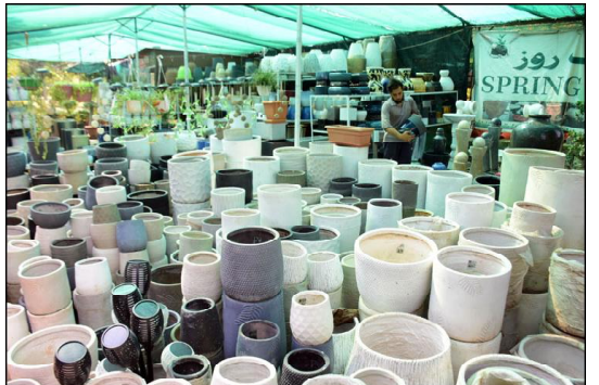
ISLAMABAD: A worker is dusting the fancy flowers pots at nursery in Sector H-9 as in the modern age of the era, now days flowers pots are also become modernize in Federal Capital.