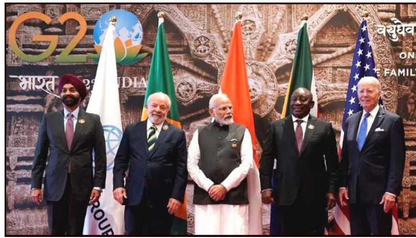
World Bank President Ajay Banga, Brazilian President Luiz Inacio Lula da Silva, Indian Prime Minister Narendra Modi, South African President Cyril Ramaphosa and U.S. President Joe Biden pose for the group photo during G20 Summit, in New Delhi, India.

fort. While some supporters of the name Bharat said "India" was given by British colonisers, historians say the name predates colonial rule by centuries. The Rashtriya Swayamsevak Sangh, the ideological parent of the ruling Bharatiya Janata Party (BJP), has always insisted on calling the country Bharat. Modi's rivals say the change has been forced by the new opposition alliance formed by 28 parties in July called INDIA or Indian National Developmental Inclusive Alliance, to take on BJP in parliamentary elections next year. A spokesperson for the Prime Minister's Office did not respond to a request for comment.