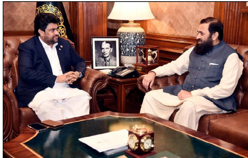
KARACHI: Punjab Governor Muhammad Baligh ur Rehman meeting with Sindh Governor Kamran Khan Tessori.

MW Chappari Charkhel project and 6.9 MW Mujabdeen hydropower projects while work has been started on the 300 MW Balakot Hydropower project with financial assistance from Asian Development Bank. The work would soon start on the 88 MW Gabral Kalam project and 157 MW Madayn hydropower project. Participants of the meeting were briefed that the Civil Secretariat, CM House and CM Secretariat have been converted to solar power while 8000 schools, 187 Basic Health Units and 4000 mosques have also been converted to solar power. PEDO has also converted 300 mosques of merged districts to solar power. It was told that 356 mini micro hydropower projects are completed in Phase I while work is underway on 291 power projects under Phase II.