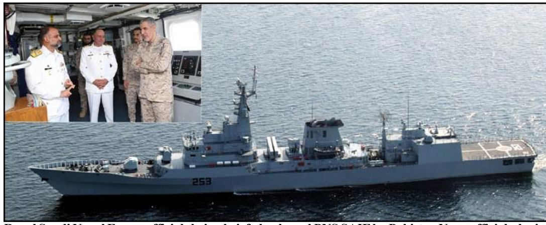
Royal Saudi Naval Forces officials being briefed onboard PNS SAIF by Pakistan Navy officials during joint Naval Exercise Naseem Al Bahr-XIV between Pakistan Navy (PN) & Royal Saudi Naval Force (RSNF) commenced at Al Jubail, Saudi Arabia.