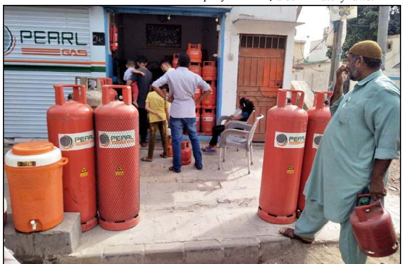
KARACHI: Citizens are refill their gas cylinder with LPG gas at a shop as residents are facing shortage of Sui Gas, at Saddar area in Karachi

ISLAMABAD (Online): Under the auspices of Serena Hotels in collaboration with Nomad Gallery held a crafts bazaar and film festival on Saturday. Ambassador of Portugal Frederico Silva also addressed during Inaugural ceremony of Crafts Bazaar "Empowering women and communities through indigenous crafts" at local hotel. In the upcoming events during the two days of crafts bazaar the documentaries by Nageen Hayat on Pakistan's rich cultural heritage and also on discriminatory laws.