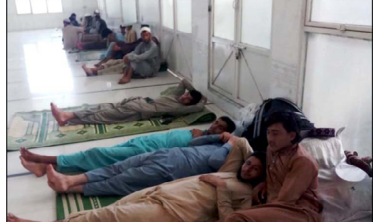
LANDIKOTAL: People are facing inconvenience after Torkham border closed due to an exchange of gunfire between Afghan and Pakistani forces, at Torkham Border in Landikotal.

He noted that a comprehensive reshuffling affected a total of 351 officers within LESCO. Additionally, 17 officers were assigned to less critical positions. Within LESCO, 24 SEs, 89 XENs, and 238 SDOs were subject to reassignments. In the case of GEPCO, a total of 138 officers underwent reshuffling, which includes 8 SEs, 42 XENs, and 88 SDOs. Additionally, 13 officers with a questionable reputation were placed in less critical roles.