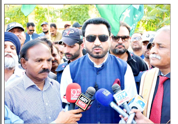
Caretaker Federal Minister for Human Rights Khalil George talking to the media on his arrival to Quetta

Minister for Human Rights, Khalil George, while talking to journalists, said that for the first time in the 76-year history of the country, a ministry like human rights has been given to the Christian community. The minority and especially the Christian community are deeply grateful for this. The federal minister further said that love for Pakistan is in every vein. Khalil George assured the Christian community and the people of the area that serving the people is the first priority and will try to solve the problems of the people at their doorsteps.