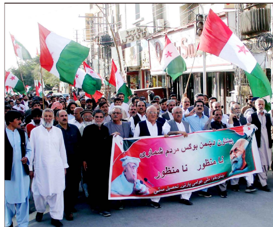
QUETTA: Members of Pashtunkhwa Milli Awami Party are holding protest demonstration against the Digital Census, held at Manan Chowk in Quetta