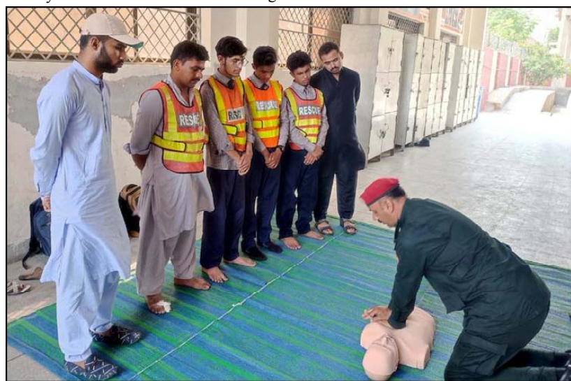
MULTAN: Rescue 1122 workers are busy training workshop on first aid to mark the World First Aid Day held in Multan.

MULTAN (APP): City Traffic Police (CTP) has issued a route plan for the students to enter Bahauddin Zakariya University (BZU) to appear in the medical entry test going to be held on Sunday. According to a CTP spokesman, the students from Khanewal and Vehari would use the route from Sahu Chowk for entry through the back gate of the university. The students from Muzaffargarh and Head Muhammadwala would use Syedanwala bypass Chowk for entry through the back gate, while the students from Bahawalpur would use Qadafi Chowk to Nagana Chowk for entry from the back gate.