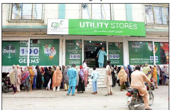
FAISALABAD: A view of the long queues outside Utility Store of the Islam Nagar as people are starving to buy grocery on subsidized prices in City.

Pakistani youth are the second largest online workforce in the world and we are working to make it easy for them to get paid. There will be no restriction on the IT industry pertaining to dollar transactions, he said, adding that the interim government is removing all barriers to make it possible. Stressing the significance of Pakistani youth, IT Minister Saif said they are the second largest online workforce in the world and the government was working to make it easy for them to get paid.