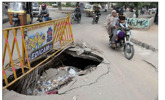
KARACHI: A view of the broken part of the nullah on road at Jamshed Town causing trouble in smooth traffic flow, which needs the attention of concern authorities.