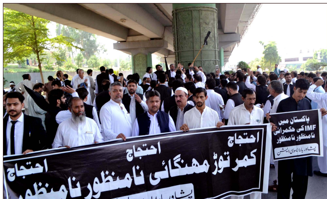
PESHAWAR: Members of Peshawar Bar Association are holding protest demonstration against massive unemployment, increasing price of daily use products, inflation price hiking and the highly inflated electricity bills, nearby KPK Assembly building

The decision of court will be accepted. Parvez Khattak further said that we were not in favor of clashing with institutions. Chairman PTI kept telling lies and nation thought that he was the savior.