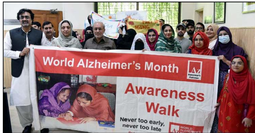
LAHORE: Participants are holding awareness walk in connection of the World Alzheimer's Month organized by Centre for Clinical Psychology Punjab University, held in Lahore.

LAHORE (APP): The price control magistrates arrested 143 shopkeepers and sealed various shops over profiteering and hoarding in a crackdown, launched across the provincial capital by the district administration. On the directions of Lahore Deputy Commissioner Rafia Haider, more than 2,897 sale points and shops were inspected during the last 24 hours, while legal action was taken against 1,163 points. A spokesperson for the district administration told the media on Saturday that cases were also registered against 93 shopkeepers over violation of the rules and 69 violators were imposed penalties in form of fines. A comprehensive report was presented to the deputy commissioner.