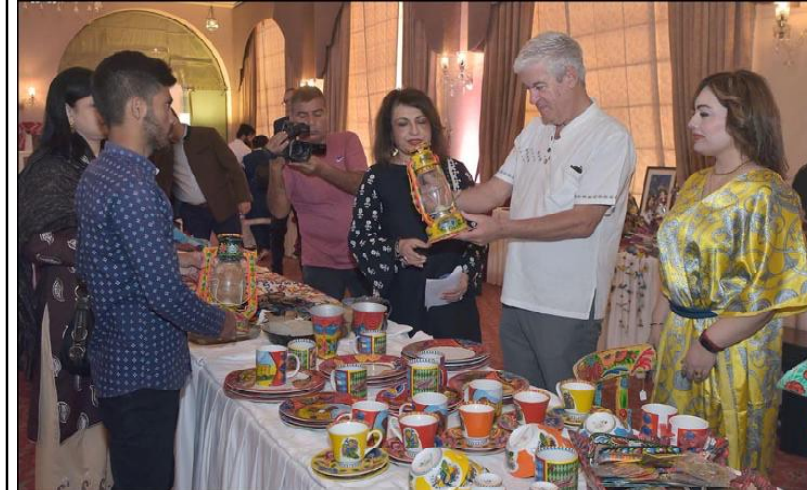
ISLAMABAD: Ambassador of Portugal to Pakistan Frederico Silva visiting the different stalls of traditional stuff of Pakistani Culture during "Craft Bazaar" organized by Serena Hotels, in collaboration with Nomad Art Gallery

ISLAMABAD (INP): Pakistani top leadership on Saturday expressed the grief over loss of lives and property in a severe earthquake that jolted Morocco. Earlier on Friday night, a powerful 6.8 magnitude earthquake struck Morocco, leaving nearly 632 people dead and 239 injured, the country's interior ministry said in an updated toll on Saturday. Of those injured, 51 were in a critical condition, the ministry said. Several buildings were destroyed during the earthquake, sending residents of major cities rushing from their homes. Moreover, a local official said most deaths were in mountain areas that were hard to reach. In their separate messages, the Pakistan leadership including President Dr. Arif Alvi, Caretaker Prime Minister Anwar-ul-Haq Kakar, former premier Shehbaz Sharif and former foreign minister and PPP Chairman Bilawal Bhutto Zardari have expressed their grief over the loss of precious lives and damages caused to infrastructure after a strong earthquake hit central Morocco. In his statement, President Dr. Arif Alvi on Saturday expressed his grief over the loss of precious lives and damages caused to infrastructure after a strong earthquake hit central Morocco. The PML-N Presi-