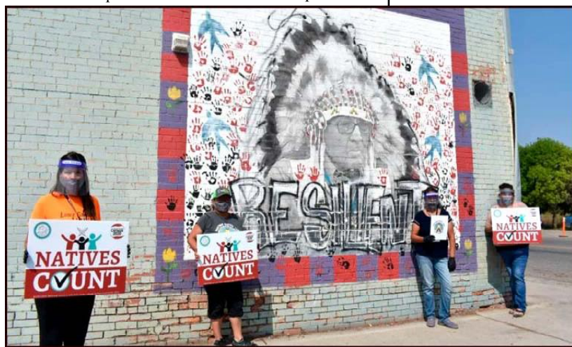
Activists hold signs promoting Native American participation in the U.S. census in front of a mural of Crow Tribe historian and Presidential Medal of Freedom recipient Joe Medicine Crow on the Crow Indian Reservation.