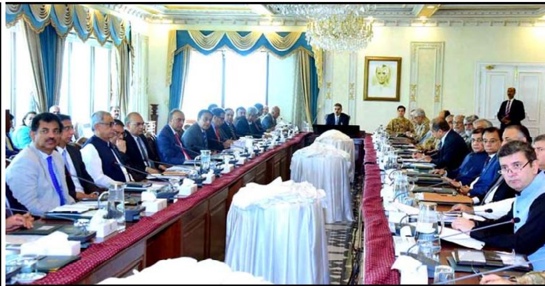
ISLAMABAD: Caretaker Prime Minister, Anwaar-ul-Haq Kakar chairs the 5th Apex Committee Meeting of Special Investment Facilitation Council.

Tarar said Pakistan had played a vital role in COP-27, and was striving to comply with the environmental standards issued by the Climate Conference, in all sectors.