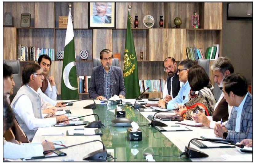
ISLAMABAD: Caretaker Federal Minister for National Heritage and Culture Jamal Shah chairing a meeting regarding revival plan of cultural and literary heritage.