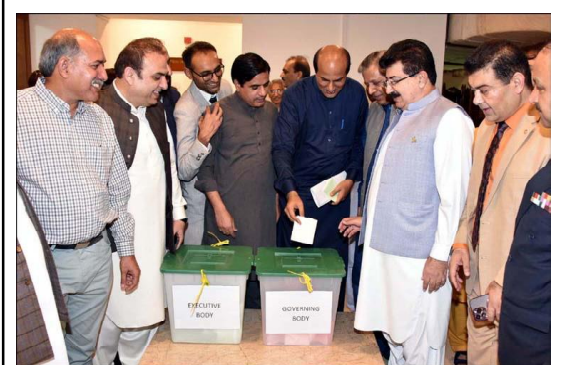
ISLAMABAD: Chairman Senate, Muhammad Sadiq Sanjrani witnessing the election process of Parliamentary Reporters Association (PRA) held at Parliament House in Islamabad.

During his visit, Chairman Senate was impressed by the organized and efficient manner in which the PRA elections were conducted. He commended the democratic values and principles upheld during the election, affirming his belief in the importance of fair and open processes in all aspects. Furthermore, Chairman Senate acknowledged the invaluable role played by the PRA in providing comprehensive and accurate coverage of Parliamentary proceedings. He praised their commitment to keeping the public informed and promoting transparency in government affairs.