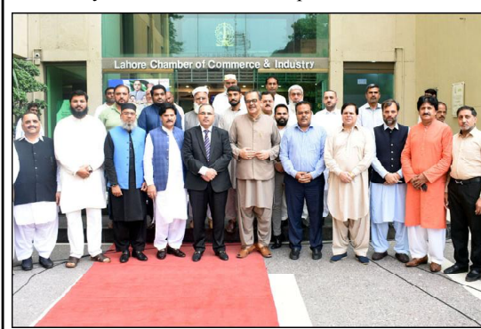
LAHORE: Caretaker Federal Minister for Religious Affairs Aneeq Ahmed posing for group photo along with others after visits Chamber of Commerce and Industry (LCCI) in Provincial Capital.

It is pertinent to mention here that any alteration in gas tariffs is subject to the approval of the federal cabinet.