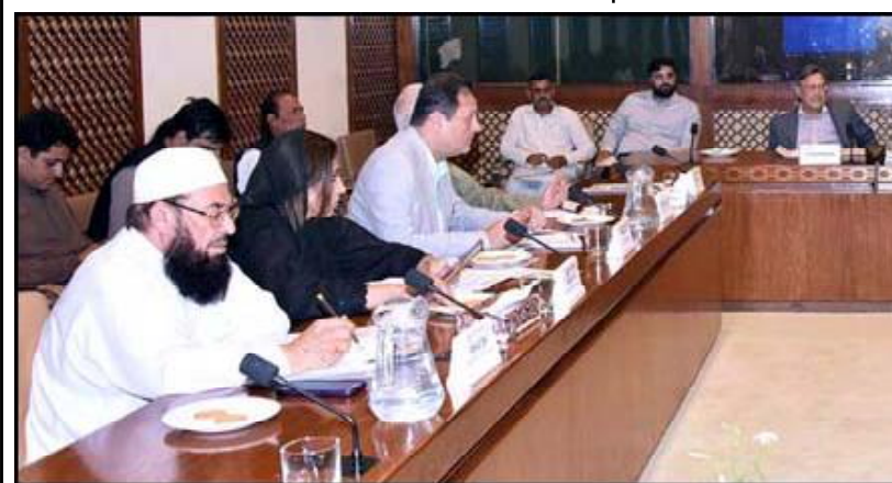
ISLAMABAD: Senator Farooq Hamid Naek, Chairman Senate Standing Committee on Foreign Affairs presiding over a meeting of the committee at Parliament House.

ISLAMABAD (INP): International Literacy Day is observed on September 8 every year to promote literacy and raise awareness of its importance in building more inclusive, peaceful, and sustainable societies. The day's theme for 2023 was "Promoting literacy for a world in transition: Building the foundation for sustainable and peaceful societies." Literacy is the ability to read and write. It is essential for communication, learning, and participating in society. People who are literate are better able to access information, improve their job prospects, and make informed decisions about their lives. According to the United Nations Educational, Scientific and Cultural Organization (UNESCO), about 774 million adults lack the minimum literacy skills. This means that they cannot read and write a simple sentence about their everyday life.