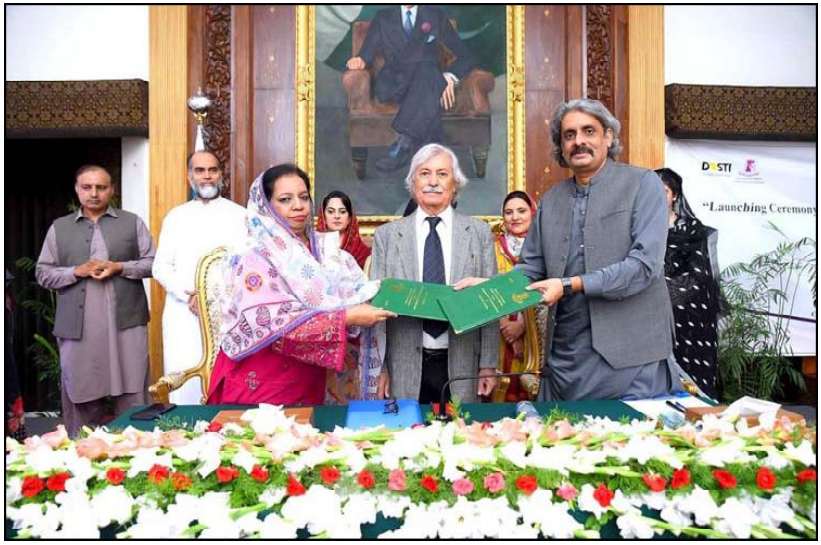
PESHAWAR: MOU signed between SBBWU and Dosti Welfare Organization during the launching ceremony of Dosti Peshawar's Women's Literature Festival 1st Edition at Governor House.

The Gulberg police had registered a case against Pakistan Tehreek-e-Insaf leaders and workers over attacking Askari Tower during the May 9 violence.