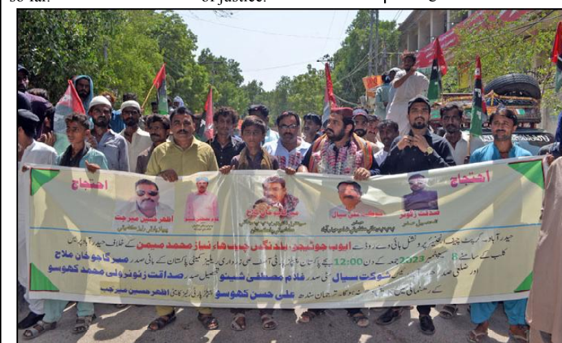
HYDERABAD: Workers PPP Release Committee hold a protest against officials of Highways Division, in City.

It is requested that court should order to constitute JC for the sake of justice.