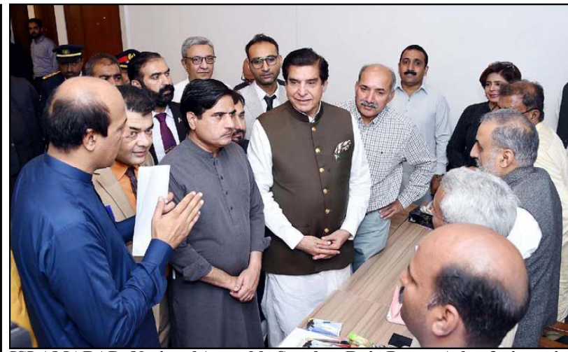
ISLAMABAD: National Assembly Speaker, Raja Pervez Ashraf witnessing the election process of Parliamentary Reporters Association (PRA) held at Parliament House in Islamabad.