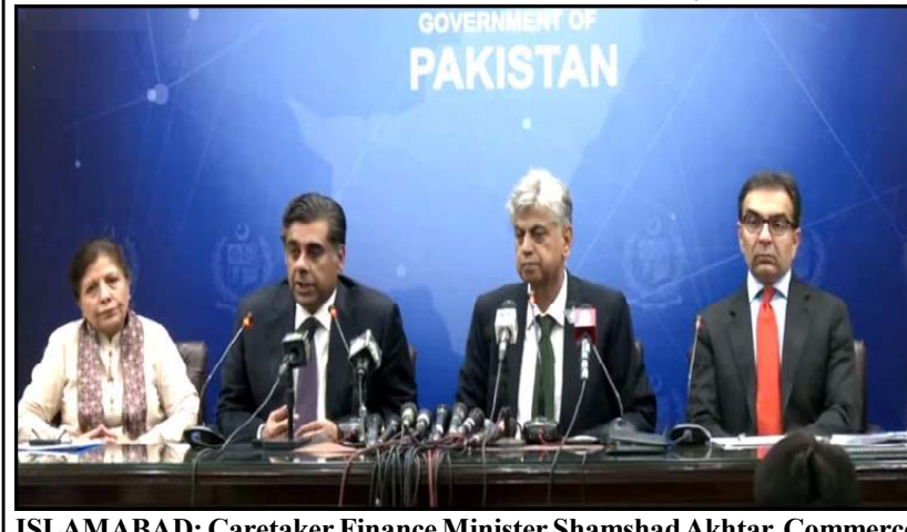
ISLAMABAD: Caretaker Finance Minister Shamshad Akhtar, Commerce Minister Gohar Ejaz, Information Minister Murtaza Solangi and Power Minister Muhammad Ali addressing the joint press conference after the SIFC Apex Committee meeting.

The committee said that the Punjab and Khyber Pakhtunkhwa (KP) assemblies had been dissolved on January 14 and 18 respectively but the Pakistan Democratic Movement (PDM) government did not fulfil its constitutional duty to organise polls in 90 days besides violating the Supreme Court's April 4 order. The political party urged for concrete steps to establish a democratic government to resolve the crisis. The PTI core committee said that Article 48 bounds the president to finalise the election date in 90 days.