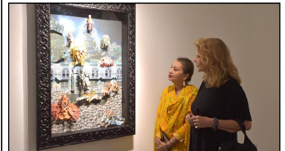
ISLAMABAD: Visitor take interest in exhibition titled "Theater of Absurdities" at Tanzara Gallery.