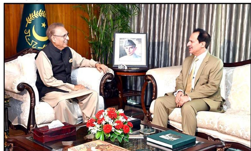
ISLAMABAD: Caretaker Federal Minister for National Health Services Regulations and Coordination, Dr Nadeem Jan, calls on President Dr Arif Alvi, at Aiwan-e-Sadr.