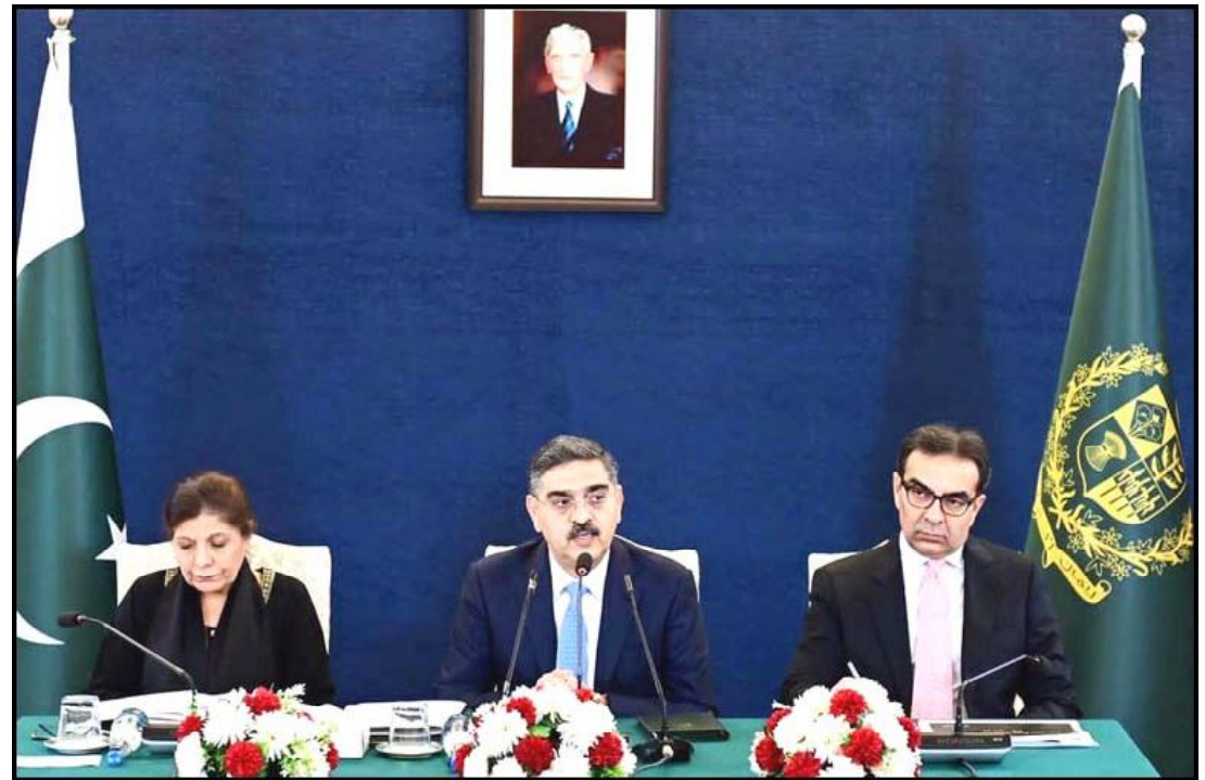
ISLAMABAD: Caretaker Prime Minister Anwaar-ul-Haq Kakar talking to Anchors and Journalists in a meeting at the Prime Minister's House.

He said the caretaker government was formed for the continuity of constitutional order, and was dealing with economic and security challenges.