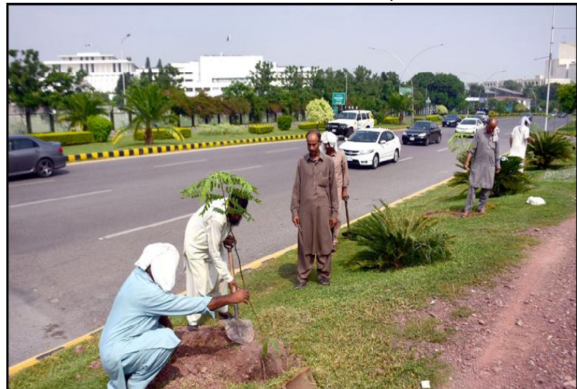
ISLAMABAD: Workers of Capital Development Authority are planting plant sapling on green belt along the Constitution Avenue in Federal Capital.