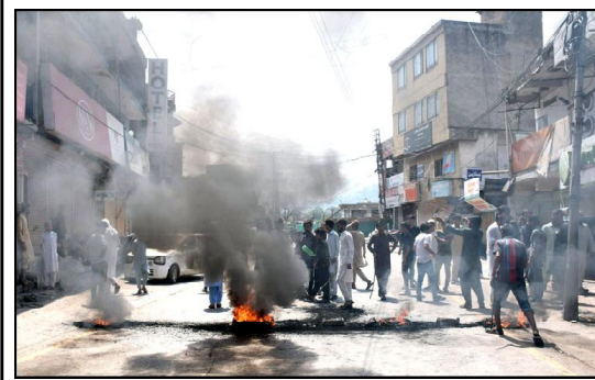
MUZAFFERABAD: People burn tyre during protest by Awami Action Committee against unjust price hike of electricity and unbearable inflation in the Capital of Azad Jammu and Kashmir.