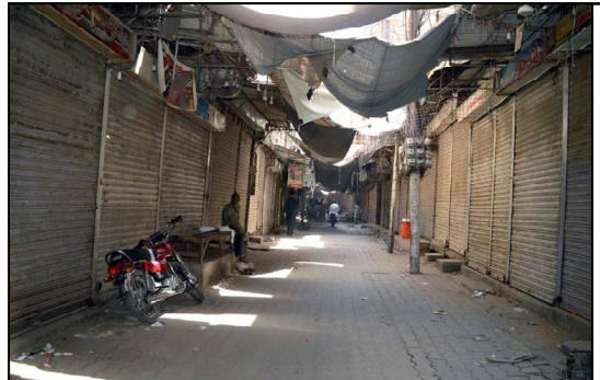
MULTAN: View of business activities seen closed while market gives desert look during the shutter down strike called by trader community against inflation price hiking and the highly inflated electricity bills, in Multan.

He appreciated the efforts of KPCTA to promote tourism and facilitate visitors and said that the hospitality of KP people in well known in the world. He also highlighted the steps of KPCTA to boost tourism and said that the government would provide all the needed assistance and cooperation to visitors.