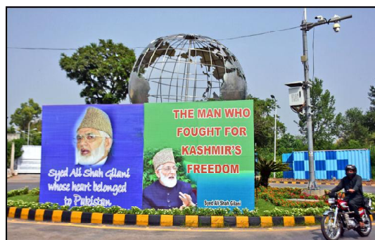
ISLAMABAD: A view of the banners along the Constitution Avenue on the death anniversary of Syed Ali Shah Geelani, in Federal Capital.