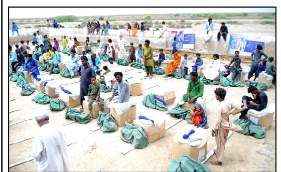
THATA: Villagers of Coastal belt near Ketu bandar district Thatta sits with tool kits and NFIs kits, during distribution of Emergency kits for survival in disaster, by Welfare Foundation with collaboration with IOM (International Organization for Migration, a part of UN).