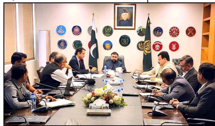
ISLAMABAD: Caretaker Federal Minister for Interior, Sarfraz Ahmad Bugti chairing meeting regarding anti smuggling measures.

The rupee has lost over Rs15 in the inter-bank market since the formation of the caretaker government which is tasked with overseeing at least one review of the International Monetary Fund (IMF) $3 billion standby arrangement; and steering the country through to a national election that is in theory due to take place by November.