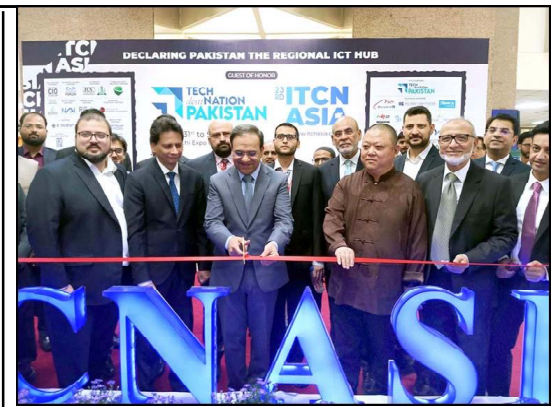
KARACHI: Caretaker Federal Minister for IT and Telecommunication Dr. Umar Saif along with others cutting ribbon at the opening of "ITCNA Asia 2023", International IT & Telecom Show at Expo Centre.

Therefore, the court was imposing fine worth Rs 25,000 on him, and asked him to pay the said amount to the petitioner before the next hearing.