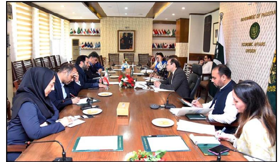
ISLAMABAD: Iranian Deputy Minister for Economics and Finance calls on the Acting Secretary Ministry of Economic Affairs.

He said the basic treatment of mental health could be provided with the help of modern technology, Artificial Intelligence and Chatbot.