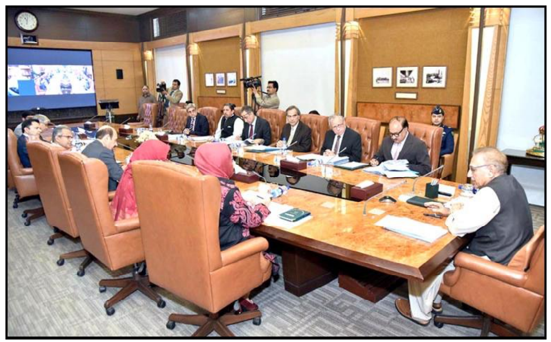
ISLAMABAD: President Dr Arif Alvi chairing the 23rd meeting of the Board of Governors of the National School of Public Policy, at Aiwan-e-Sadr.