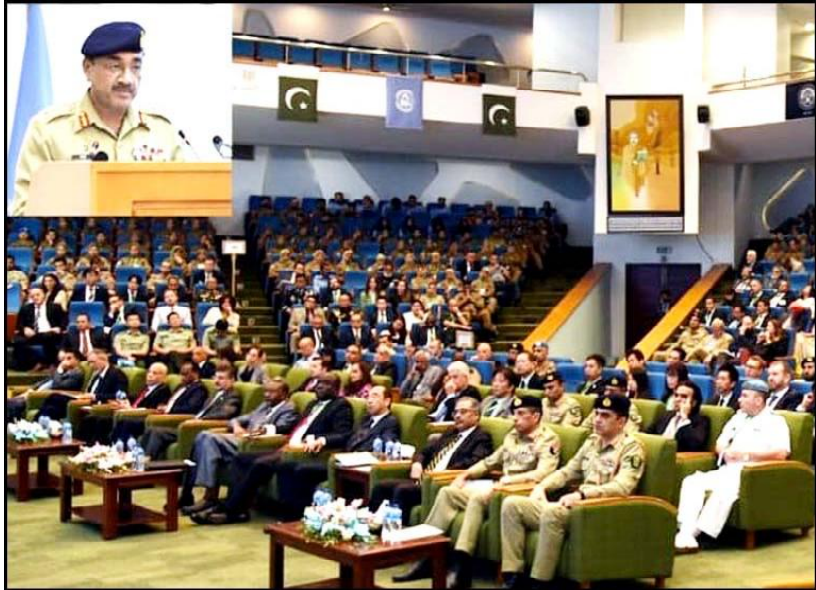
Chief of the Army Staff, General Asim Munir addressing participant of a meeting held to review the preparations regarding the ministerial meeting of the United Nations peacekeeping mission.

Ph: 2841470/2841473 Vol: XVIII No. 250, Safar 15, 1445 AH Saturday September 02, 2023, Pages 08, Price Rs.15