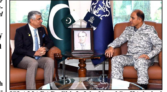
ISLAMABAD: Chief of the Naval Staff Admiral Muhammad Amjad Khan Niazi exchanging views with Secretary Defence, Lieutenant General (R) Hamood uz Zaman Khan at Naval Headquarters.

Monitoring Desk LAHORE/ISLAMABAD: Pakistan Tehreek-e-Insaf President and former Punjab chief minister Parvez Elahi was rearrested under 3-MPO (Maintenance of Public Order) by the Islamabad Capital Territory (ICT) police shortly after being released by the National Accountability Bureau (NAB), according to sources. The seasoned politician would be put under house arrest in Adiala jail for the next 15 days, the sources privy to the matter added.