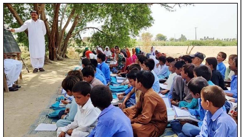
RATODERO: Students of Government Boys Primary School are studying under open sky, as the only one classroom built for 200 more students, which is in the worst condition in the school, they are demanding to build more classrooms in the school, they also demanded basic facilities including furniture, fans, electricity, and cold water, at Pir Bahar Shah village in Ratodero.

The Chief Secretary mentioned that the Special Branch is the eyes and ears of the Punjab government and the police for ensuring good governance and reining in organized crime. He further said that the role of the Special Branch is very important in maintaining law and order.