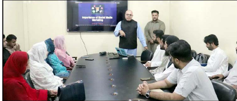
QUETTA: Caretaker Information Minister Jan Achakzai talking with participants of Social Media Training held at Department of Public Relations