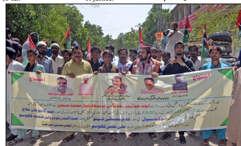
HYDERABAD: Workers PPP Release Committee hold a protest against officials of Highways Division, in City.

According to a police spokesperson, during the crackdown launched against drug peddlers and bootleggers, Rawalpindi district police arrested 246 accused and recovered over 200 kg charras, 788 liters liquor, 470 grams heroin and 50 grams Ice drug during the last two weeks.