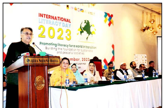
QUETTA: Governor Balochistan, Malik Abdul Wali Khan Kakar addressing a seminar on the International Literacy Day at a local hotel

ISLAMABAD (INP): The Anti-Terrorism Court (ATC), Islamabad, on Friday sent former Punjab chief minister and Pakistan Tehreek-e-Insaf (PTI) President Chaudhry Pervaiz Elahi to Adiala jail on judicial remand.