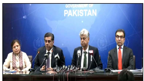
environment in the country being imperative for 'economic revival'.

Meanwhile Caretaker Minister for Information and Broadcasting Murtaza Solangi on Friday said the caretaker government respected the international financial agreements and would continue to implement them in true letter and spirit. Addressing a news