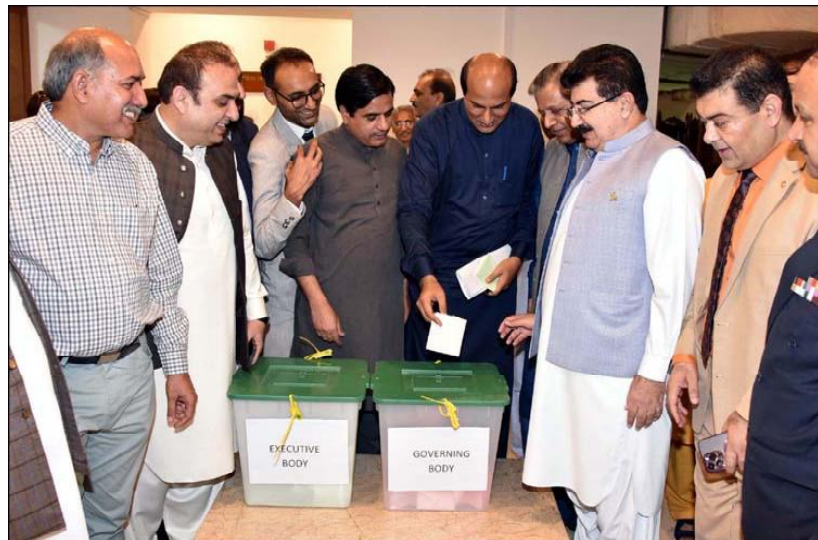
ISLAMABAD: Chairman Senate, Muhammad Sadiq Sanjrani witnessing the election process of Parliamentary Reporters Association (PRA) held at Parliament House in Islamabad.

may it be mosque, temple or Gurudwar. Auqaf department should construct four walls of Gurudwaras and save them from illegal occupations. The court remarked we are seeking report from all departments. You should give list of affected gurudwaras. The court issued notice to secretary religious affairs, chairman Auqaf, attorney and advocate generals. The court remarked the state needs to take practical steps to ensure security of Sikh community. The court sought detailed report from IG KP on recent incidents of target killings. The court summoned report from advocate general and IG Punjab regarding Jaranwala incident besides seeking report from home department Punjab on the steps taken after the incident.