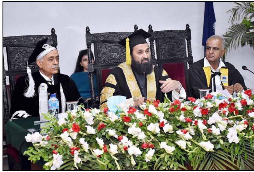
FAISALABAD: Governor Punjab Muhammad Balighur Rehman presiding over the 50th meeting of the Senate of University of Agriculture Faisalabad (UAF).

He said that in UAF, no student leaves education due to financial constraint, as ample educational scholarships are available. He said that the UAF was taking all possible measures to find a local solution to the problems of agriculture. He said that the University of Agriculture is working not only at the national level but also with international institutions on education and research issues and running international projects like Center for Advanced Studies.