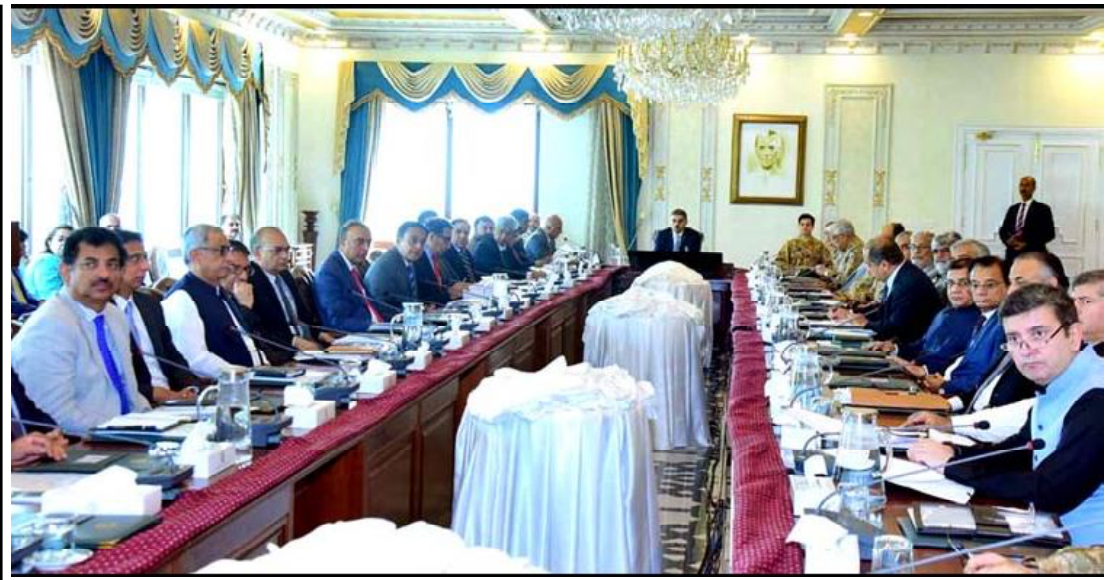
ISLAMABAD: Caretaker Prime Minister, Anwaar-ul-Haq Kakar chairs the 5th Apex Committee Meeting of Special Investment Facilitation Council.

The notification stated that the surge in power tariff would be applied to the bills of September, meanwhile, the hike will not be applicable to Lifeline and K Electric customers.