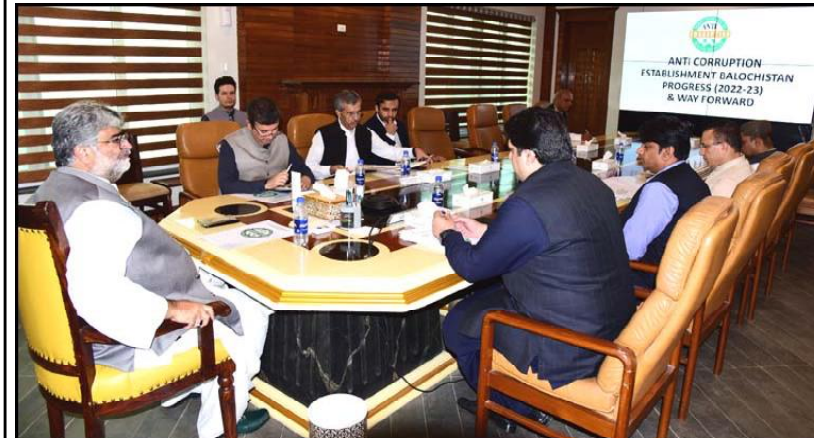
QUETTA: Caretaker Chief Minister Balochistan, Mir Ali Mardan Khan Domki chairing a meeting held to review performance of the Balochistan Anti-Corruption Establishment

Rabbani alleged that President Alvi unlawfully appointed two members of the Election Commission of Pakistan, bypassing established procedures and the Constitution, 1973.