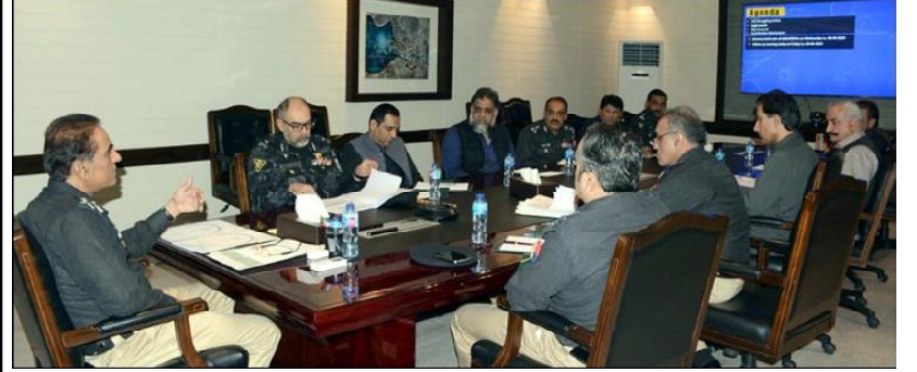
QUETTA: Inspector General Police Balochistan Abdul Khaliq Sheikh presiding over a meeting regarding prevention of smuggling in the province.

QUETTA (APP): In light of the instructions of the provincial government, Assistant Commissioner (AC) Gwadar Muhammad Naveed Alam chaired a price control committee meeting to ensure the implementation of the control price lists of edible items on Friday. The meeting was attended by the representatives of Anjuman-e-Tajiran and other relevant officers. In the meeting, the Price Control Committee reviewed the prices of essential commodities in detail and instructions were also issued to ensure the implementation of the official price list. Addressing the meeting, the AC said that the measures taken frequently to ensure the availability and quality of essential commodities in the city at fixed rates are providing relief to the people. The price Magistrate should continue the ongoing action against the wholesalers and ensure the sale of grocery items as well as fruits and vegetables as per the rate lists issued by the Market Committee, he said. AC said that to save people from the current wave of inflation and to ensure the sale of essential items at fixed prices, the Tehsil administration and related institutions should coordinate and manage measures so that people could get relief in this regard.