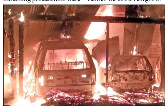
ABBOTTABAD: A View of the fire eruption in vehicles at workshop of shumalai area of the District.