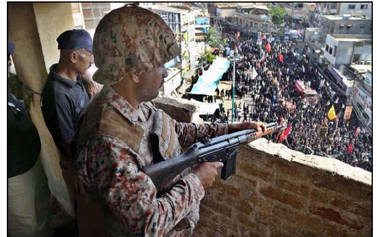
HYDERABAD: Security high alert on the top of building at Koh-e-Noor Chowk during Chehlum of Hazrat Imam Hussain (RA) the grandson of the Holy Prophet Mohammad (PBUH), martyred along with his family members and companions at Karbala.