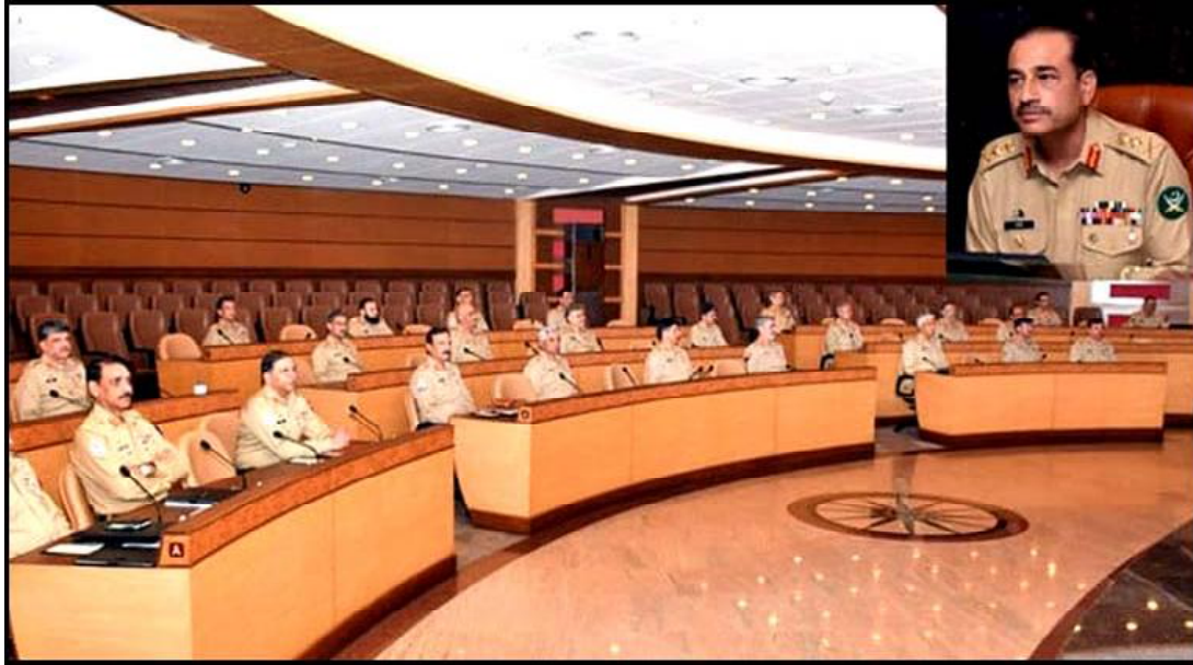
RAWALPINDI: Chief of the Army Staff General Asim Munir presiding over 259th Corps Commanders' Conference.

Ph: 2841470/2841473 Vol: XVI No. 111, Safar 21, 1445 AH Friday September 08, 2023, Pages 08, Price Rs.15