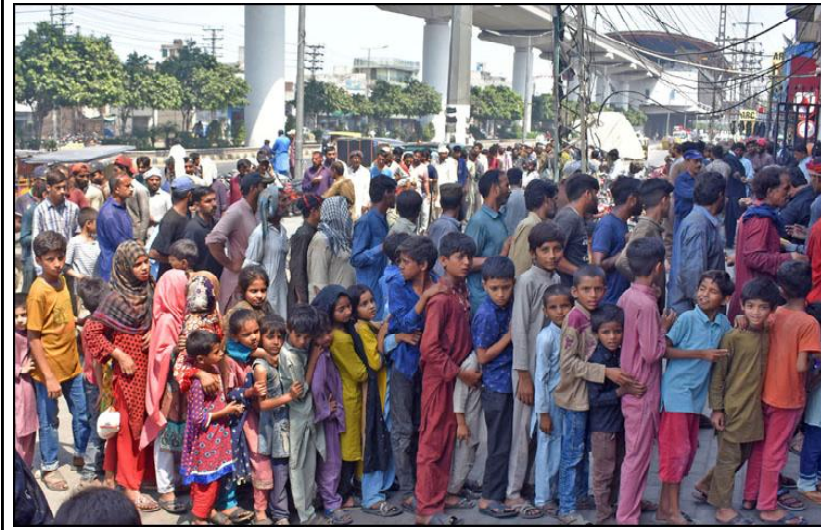
LAHORE: Deserving people stand in long queues to take free food at G.T Road, in Provincial Capital.