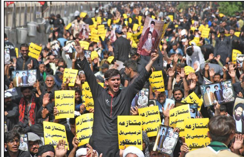
KARACHI: Shiite Muslims holds placards against the National Assembly Bill, during Arbaben procession in Provincial Capital.

LAHORE (Online): As many as 3 persons died and 4 were injured when a dumper collided with a standing tractor trolley at Arayan stop Raiwind road Lahore. Those riding tractor trolley were having breakfast when the dumper collided with tractor trolley. 3 persons died on the spot while 4 got injured. On information Rescue teams rushed to the scene and shifted the injured to Indus hospital.