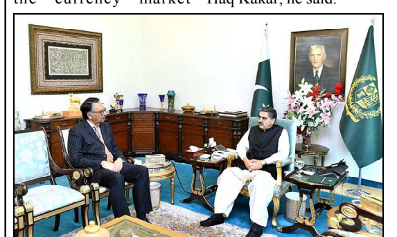
ISLAMABAD: Caretaker Foreign Minister Jalil Abbas Jilani called on caretaker Prime Minister Anwaar-ul-Haq Kakar.

ISLAMABAD (INP): In a significant development, the International Monetary Fund (IMF) has given the green light to a relief plan of Rs 15 billion which aimed to give financial relief to electricity consumers in Pakistan, sources said on Thursday. According to media reports, matter revealed that the Federal Board of Revenue (FBR) played a pivotal role in securing this relief from the IMF, adding that the FBR has exceeded expectations by collecting an impressive amount of Rs 20 billion in excess taxes. The IMF's decision to grant the relief of Rs15 billion – aimed at relieving the financial burden on electricity consumers – is a testament to the commendable performance of the FBR.