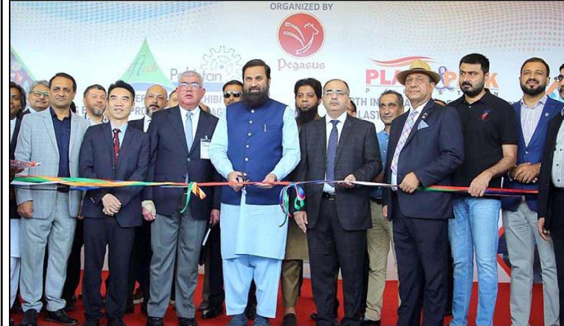
LAHORE: Governor Punjab, Muhammad Balighur Rehman cutting ribbon to inaugurate the 18th IFTEC and Plastic & Pack exhibitions at Expo Centre.