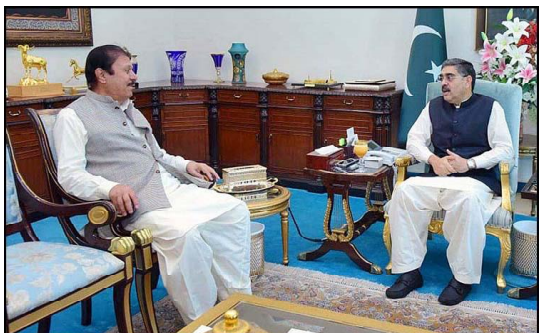
ISLAMABAD: Former Senator Sardar Muhammad Yaqoob Khan Nasir calls on the Caretaker Prime Minister Anwaar-ul-Haq Kakar.