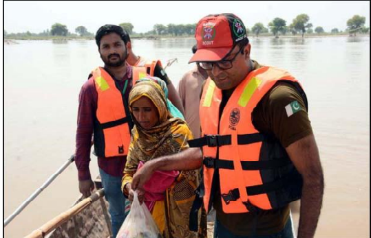
MULTAN: Rescue workers evacuate people from the villages as water from the Sutlej River continued to inundate settlements along its banks, near Multan on Thursday.

SUKKUR (APP): Hindus in across the northern Sindh are celebrating Thadori festival on Thursday. Thadori is a famous traditional festival, celebrated in Siraman/Saawan month of monsoon season. On this day women decorate the doorways of their houses and do mud plaster to their kitchens. No cooking activities were done on this day. The sweet roties (mitho lolo) made of pure ghee are offered to Shitla Mata to stay safe from various diseases. Sweet roties are exchanged with relatives and friends, if needed women cook fresh food or tea in the temporary fireplace.