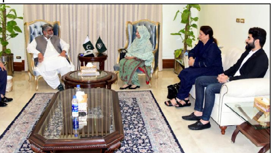
QUETTA: A delegation of Education Parliamentarians Cuscus of Senate led by Senator Sana Jamali meeting with Caretaker Chief Minister Balochistan Mir Ali Mardan Khan Domki.