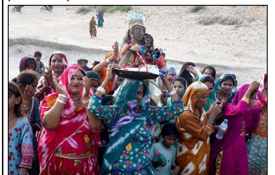
HYDERABAD: A large number of Hindu community members are joyfully celebrating the Ramakrishna festival on the banks of the Indus River.

He made it clear that the government is committed to continue to support the tribal people as well as to resolve their problems on a sustainable basis adding that no stone would be left unturned to this effect. The tribal people on this occasion thanked the Chief Minister for taking a keen interest in resolving the problems of the tribal districts.