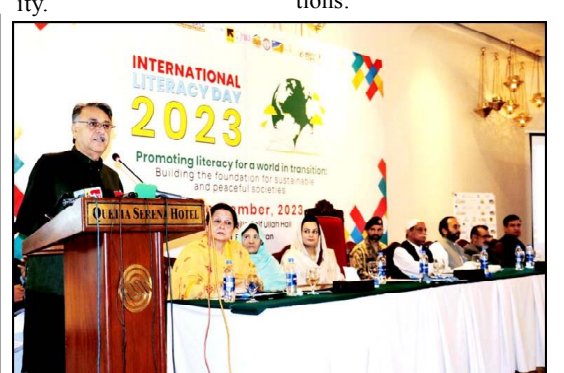
QUETTA: Governor Balochistan, Malik Abdul Wali Khan Kakar addressing a seminar on the International Literacy Day at a local hotel

The seminar was arranged by the Literacy and Non-Formal Education Directorate in collaboration with different national and international organizations.