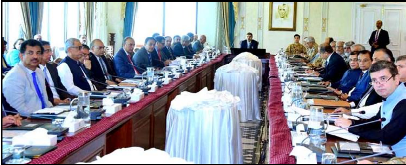
ISLAMABAD: Caretaker Prime Minister, Anwaar-ul-Haq Kakar chairs the 5th Apex Committee Meeting of Special Investment Facilitation Council.

Ph: 2841470/2841473 Vol: XVI No. 112, Safar 22, 1445 AH Saturday September 09, 2023, Pages 08, Price Rs.15