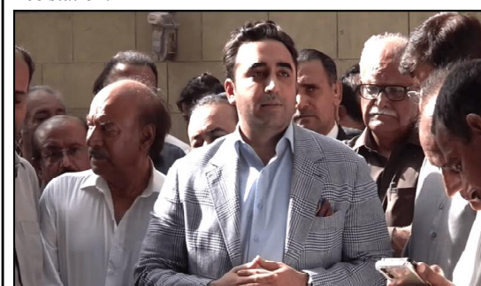
PPP Chairman Bilawal Bhutto Zardari speaks to the media in Karachi.

A fierce retaliatory attack by police made the terrorists flee away. Police launched a search operation in the area.