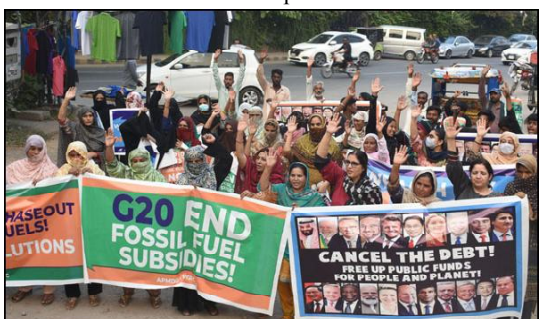
LAHORE: Members Kisan Rabta Committee holds protest in the favor of their demands outside press club in Provincial Capital.

In reflection, Chief Minister Mohsin Naqvi expressed the belief that effective coordination and teamwork invariably yield positive outcomes.