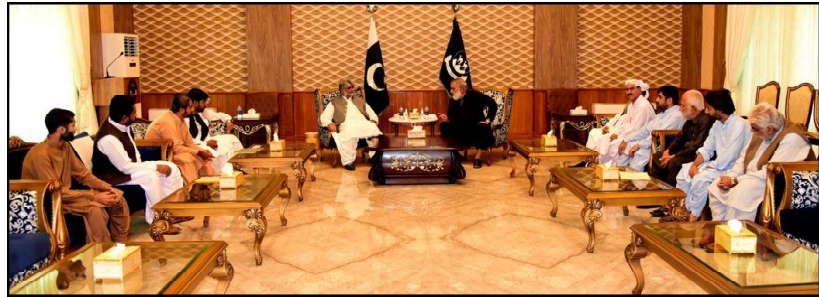
QUETTA: A representative delegation of Sibi, Babur, Kach led by Mir Hamza Marri meeting with Caretaker Chief Minister Balochistan Mir Ali Mardan Khan Domki

were unable to get education to matric level. He said the role of the non-formal education department is also important to reduce the illiteracy ratio and ensure education for all in the province. The literacy rate in Balochistan has increased over the past two decades due to educational awareness among the people. Ali Mardan said efforts should be taken to reduce the dropout rate from schools and ensure a suitable environment for learning. He added that according to an estimate, 2.5 million children are deprived of education in the country.