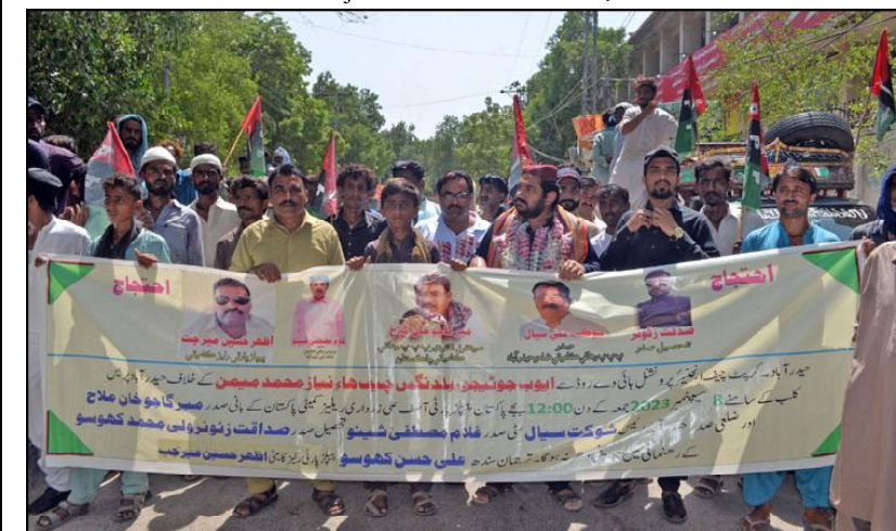
HYDERABAD: Workers PPP Release Committee hold a protest against officials of Highways Division, in City.

According to a police spokesperson, during the crackdown launched against drug peddlers and bootleggers, Rawalpindi district police arrested 246 accused and recovered over 200 kg charras, 788 liters liquor, 470 grams heroin and 50 grams Ice drug during the last two weeks.