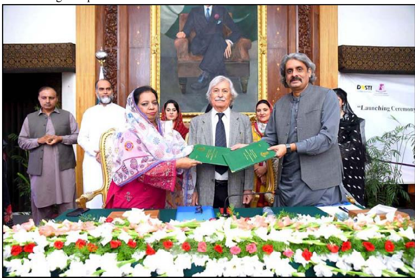
PESHAWAR: MOU signed between SBBWU and Dosti Welfare Organization during the launching ceremony of Dosti Peshawar's Women's Literature Festival 1st Edition at Governor House.

The Gulberg police had registered a case against Pakistan Tehreek-e-Insaf leaders and workers over attacking Askari Tower during the May 9 violence.