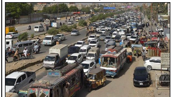
KARACHI: A view of traffic jam at Hasan square.

RPO while giving the briefing said that with the help of 300 cameras equipped with modern technology in the command and control center. A wide network has been established, through which 24-hour sensitive places of Dera city, security of government offices, central jail, police lines, four bazaars in the center of the city, markets.