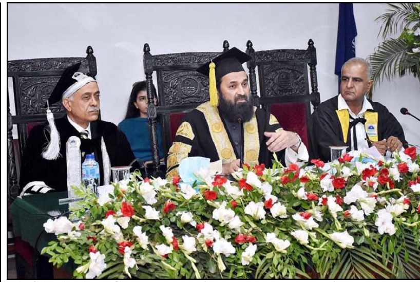
FAISALABAD: Governor Punjab Muhammad Balighur Rehman presiding over the 50th meeting of the Senate of University of Agriculture Faisalabad (UAF).

He said that in UAF, no student leaves education due to financial constraint, as ample educational scholarships are available. He said that the UAF was taking all possible measures to find a local solution to the problems of agriculture. He said that the University of Agriculture is working not only at the national level but also with international institutions on education and research issues and running international projects like Center for Advanced Studies.