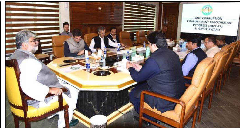
QUETTA: Caretaker Chief Minister Balochistan, Mir Ali Mardan Khan Domki chairing a meeting held to review performance of the Balochistan Anti-Corruption Establishment

The caretaker Provincial Minister for Home, Captain (Retd) Muhammad Zubair has appreciated the performance of district administration on successful action taken against the hoarders.