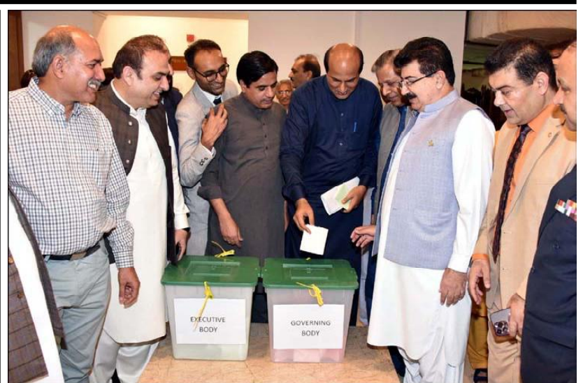
ISLAMABAD: Chairman Senate, Muhammad Sadiq Sanjrani witnessing the election process of Parliamentary Reporters Association (PRA) held at Parliament House in Islamabad.