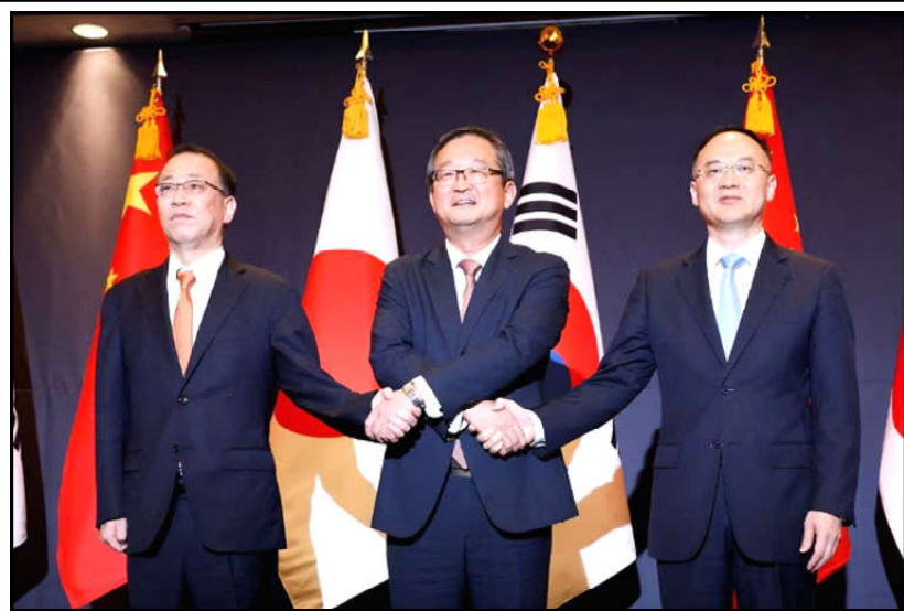
South Korea's deputy foreign minister for political affairs, Chung Byung-won, Japan's Senior Deputy Minister for Foreign Affairs, Funakoshi Takehiro, and China's Assistant Foreign Minister, Nong Rong, pose for photographs during their meeting in Seoul, South Korea.