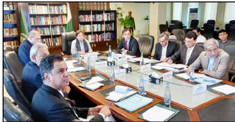
The Federal Minister of Finance, Revenue and Economic Affairs Division Dr. Shamshad Akhtar held a meeting with the Provincial Finance Minister at the Finance Division.

The meeting was held in a hybrid format, where the respective Provincial Ministers joined through the video link. The meeting was attended by the Chief Minister of Sindh, Finance Ministers of Khyber Pakhtunkhwa (KPK) and Balochistan, besides the Federal and provincial Finance Secretaries, Federal Secretary of Planning, as well as senior government officials.