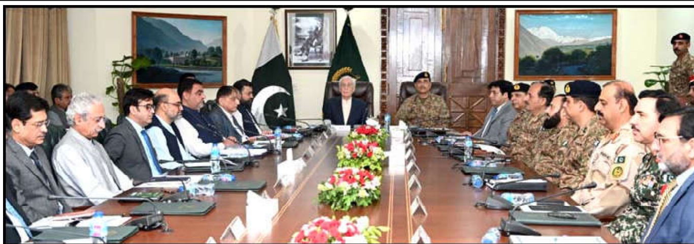
PESHAWAR: Army Chief General Syed Asim Munir attending meeting of Provincial Apex Committee.

In this regard, the court issued notices to Shahid Khaqan Abbasi and other accused.