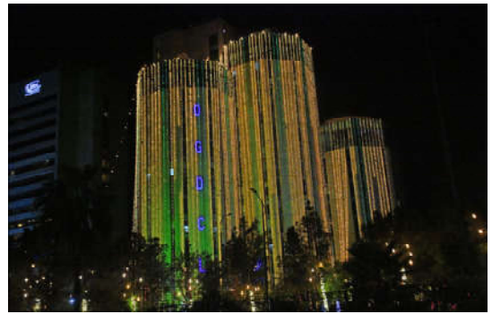
ISLAMABAD: An eye catching view of the OGDCI Tower illuminated with colorful decoration lights for the celebrations for Eid-e-Milad an-Nabi with great Zeal in Federal Capital.

This rain spell, expected in the parts of Islamabad, Punjab, Khyber Pakhtunkhwa, Kashmir, and Gilgit Baltistan will further decrease the temperatures in the country compelling the citizens to bring out the woollies with the arrival of the winter season.