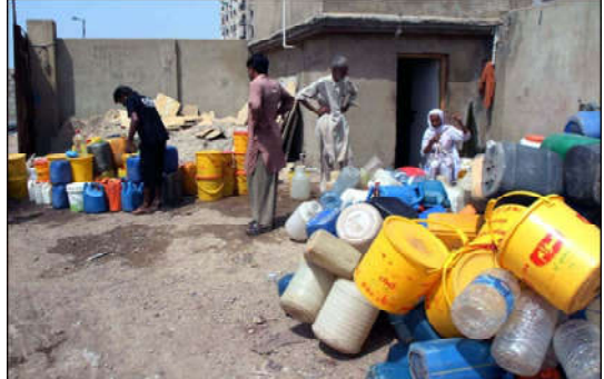
KARACHI: People are filling their water cans from public tap as they facing shortage of drinking water in their area, at Lyari area in Karachi.

The caretaker chief minister added that the natural beauty and cultural heritage of the province need to be effectively utilized for tourism. He said that Pakistan and especially Khyber Pakhtunkhwa, has immense opportunities for tourism. Muhammad Azam Khan said that by promoting tourism.