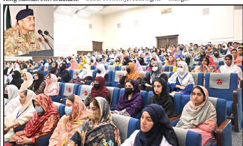
RAWALPINDI: Chief of Army Staff (COAS) General Asim Munir addressing the participants of interactive session with the women of Khyber Pakhtunkhwa during 'KPK Women Symposium - 2023'