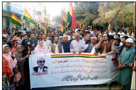
QUETTA: Activists of Balochistan National Party (BNP) holding protest demonstration for acceptance of their demands, at Quetta press club.

The Commissioner Makran, Commissioner Sibi, Commissioner Loralai, Commissioner Rakhshan, representatives of the Corps Headquarter, Frontier Corps South, and other concerned high ups participated through video link.