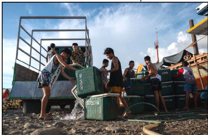
Workers unload fishing coolers at a port in Masinloc, Zambales province, Philippines.

Monitoring Desk NEW YORK: Donald Trump and his family business were found liable for fraud on Tuesday by a New York judge in state Attorney General Letitia James' civil lawsuit, accusing the former US president of illegally inflating his assets and net worth. The decision was issued by Justice Arthur Engoron of the New York state court in Manhattan. James sued Trump in Sept 2022, accusing him and the Trump Organisation of lying for a decade about asset values and his net worth to get better terms on bank loans and insurance. She has said Trump inflated his net worth by as much as $2.23 billion, and by one measure as much as $3.6 billion.