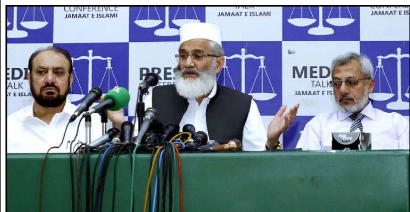
LAHORE: Jamat-e-Islami (JI) Chief, Siraj-ul-Haq addresses to media persons during press conference, at Mansoorah in Lahore.

Continued from page 1 429,929, 428,431 for the Sindh Assembly, 355,270 for the KP Assembly and 292,047 for the Balochistan Assembly. The election commission will address the objections from October 28 to November 26, whereas, the objections could be filed against the delimitations from September 27 to October 26. The hearing on the pleas against the delimitations will be conducted till November 25. The ECP will unveil the final delimitations on November 30. After the publication of the final delimitations, a 54-day election schedule will be announced and general polls will be held in the first week of January 2024. APP adds: The Election Commission of Pakistan (ECP) posted the initial constituency report and Form 5 list on its website, www.ecp.gov.pk, on Wednesday for public access. According to ECP spokesman, the website also provides access to the preliminary constituency maps. The publication of the preliminary constituencies will continue for 30 days, commencing on September 27 and concluding on October 26, 2023. Voters within the relevant constituency have the opportunity to submit