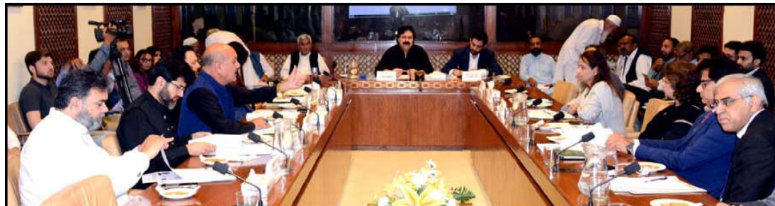
Senator Manzoor Ahmed, Chairman Senate Standing Committee on Overseas Pakistanis and Human Resource Development presiding over a meeting of the Committee at Parliament House Islamabad

He also noted that Pakistan and Ukraine must learn from this episode, and create new domestic energy and food markets.