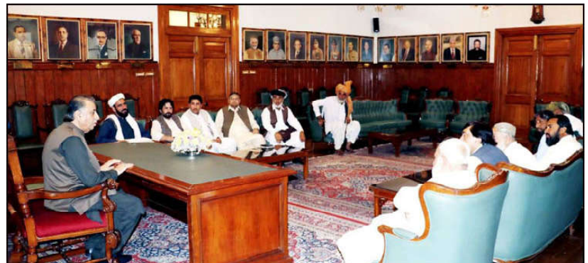
QUETTA: A delegation led by All Balochistan Transport Action Committee led by its President Haji Habibullah Badaezi meeting with Balochistan Governor Malik Abdul Wali Khan Kakar.