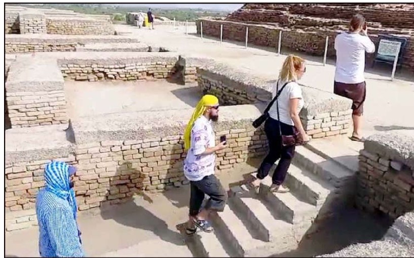
MOHENJO DARO: A delegation of Czech Republic tourists are visiting and expressed keen interest in the historical ruins of the World Heritage Monuments of Mohenjo Daro.