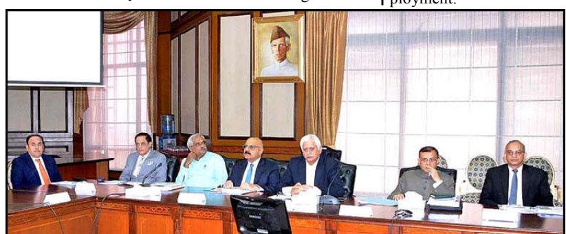
ISLAMABAD: 2nd Session of 5th Executive Committee Meeting of SIFC.