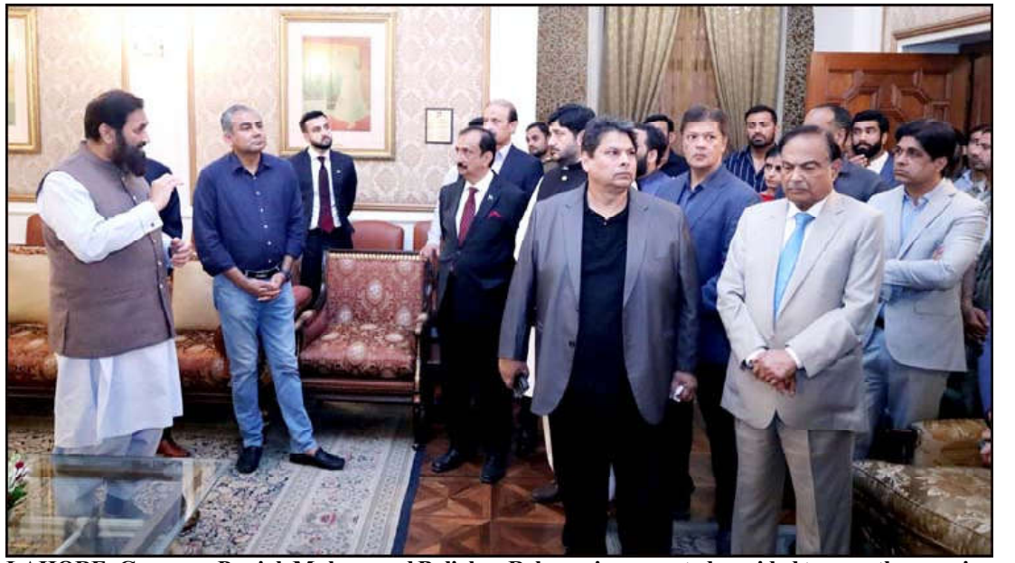
LAHORE: Governor Punjab Muhammad Balighur Rehman inaugurated a guided tour on the occasion of World Tourism Day at Governor House Lahore. Caretaker Chief Minister Punjab Mohsin Naqvi and members of the Caretaker Cabinet are also present on this occasion.

Schools. On the instructions of Chief Minister, Provincial Minister School Education Mansoor Qadir also reached the school. Chief Minister also ordered to buy new computers and increase the number of lights and fans in the classrooms. He further emphasized the need for a fresh coat of paint and the assurance of basic amenities in the classrooms. The Chief Minister paid visits to the principal's office and the staff room.