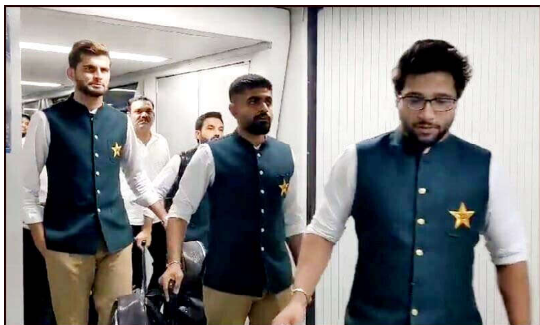
HYDERABAD: Pakistan cricket team landed in India's Hyderabad to participate in the ICC World Cup 2023