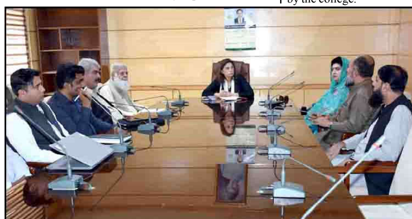
QUETTA: Commissioner Child Protection Federal Ombudsman retired Ambassador Fouzia Nasreen talking with different stake holders regarding protection of children.

She said that all the stakeholders along with the central and provincial ombudsman need to pay more attention to issues like prevention of early marriage of girls, education of children, health, food, child labor so that the architect of our future can contribute to the development of the country.