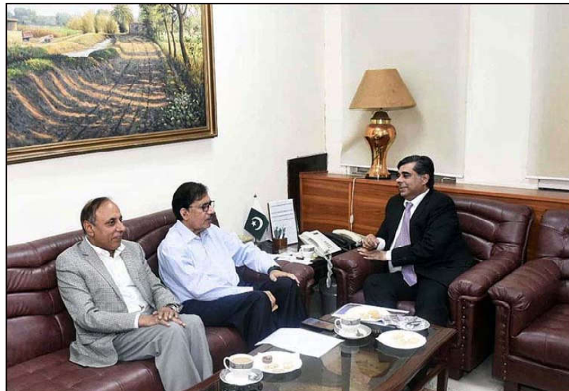
ISLAMABAD: CEO National Steel along with delegation from the steel industry called on Federal Minister for Commerce, Industries, Production, Dr. Gohar Ejaz at the Commerce Ministry.