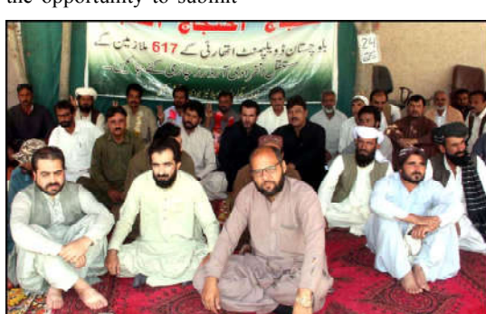
QUETTA: Members of newly Regularized Employees Joint Action Committee are holding protest demonstration for regularized appointment letters