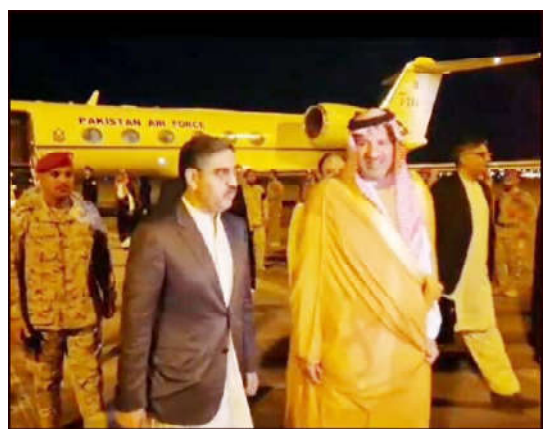
MADINAH MUNAWWARAH (APP): Caretaker Prime Minister Anwaar-ul-Haq Kakar arrived here on Wednesday on his private visit to Saudi Arabia.