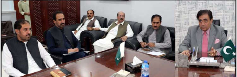
QUETTA: Caretaker Provincial Minister for PHE Sardar Ejaz Jaffar and former Federal Minister Sardar Sikandar Hayat Jomezai meeting with Caretaker Health Minister Dr. Amir Muhammad Khan Jomezai

Moreover, some industrial units located in urban areas are getting water from the Irrigation while the feasibility study of maintenance and expansion project of Lasbela canal is in final stages of completion.