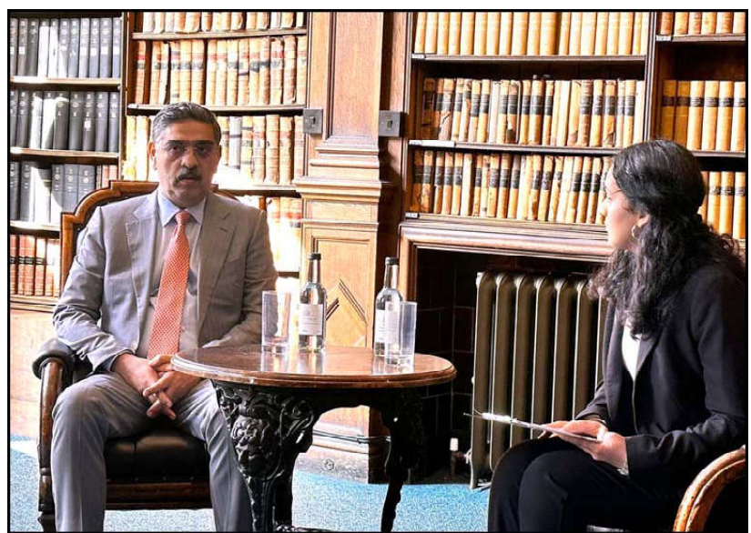
LONDON: Caretaker Prime Minister Anwaar-ul-Haq Kakar interacted with the students at Oxford Union.