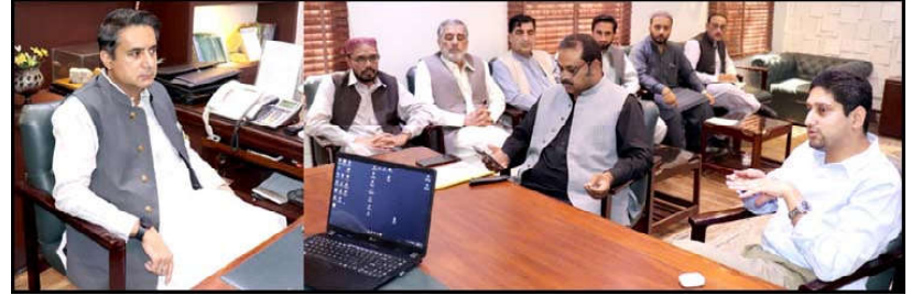
QUETTA: Commissioner Quetta Division Hamza Shafiqat presiding over a meeting regarding gas pressure in the city.

QUETTA: The caretaker Provincial Minister for Home, Captain (Retd) Mir Muhammad Zubair Jamali paid rich tributes to six jawans of the security forces who were martyred in a helicopter crash occurred in Harnai last year.