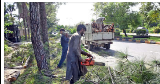
ISLAMABAD: Workers are cutting the trees stems along the Margala road, in the name of tree shaping, which needs the strict action and inquiry to prevent the natural beauty of Federal Capital.

ISLAMABAD (APP): A group of high-ranking officials from the Majlis-e-Shura of the Kingdom of Saudi Arabia (KSA) here on Tuesday visited National Assembly of Pakistan. The visit was in line with the roadmap agreed upon by Speaker of the National Assembly, Raja Pervez Ashraf, and , Chairman of Majlis-e-Shura, Dr. Abdullah bin Mohammed bin Ibrahim Al Sheikh during their meeting, aimed at further strengthening cooperation and collaboration between the National Assembly of Pakistan and the Majlis-e-Shura. The Saudi delegation consisting of official of Majlis-e-Shura was briefed about important initiatives undertaken taken by the national assembly for its complete and comprehensive digitalization. The delegation expressed appreciation about progress of different projects undertaken by National Assembly of Pakistan. Later, the delegates also toured the Parliament House including National Assembly Hall.