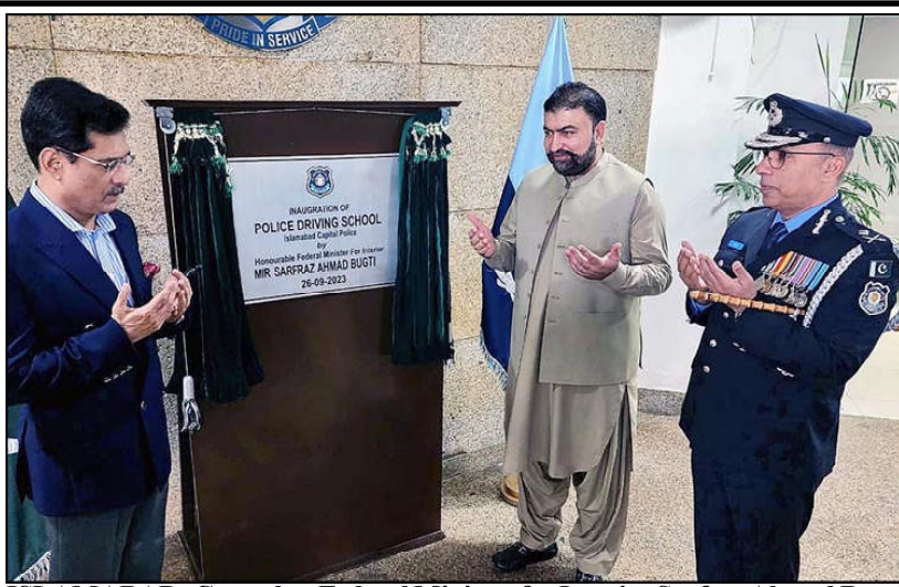
ISLAMABAD: Caretaker Federal Minister for Interior Sarfraz Ahmed Bugti inaugurating the First Police Driving School for Women.

highlighting the advanced technological capabilities being employed to enhance security and surveillance. In his address to the officers, Federal Minister for Interior Sarfraz Bugti emphasized the importance of maintaining the highest standards of professionalism and dedication to public service. He underscored the need for officers to uphold the rule of law and engage with the citizens courteously while actively addressing their concerns. The Islamabad Capital Police is continually upgrading its technical expertise and remains committed to ensuring the safety and security of the capital city, he added. The Interior Minister also praised the police force for their efforts in maintaining a peaceful environment in Islamabad and encouraged them to persist in their endeavors.