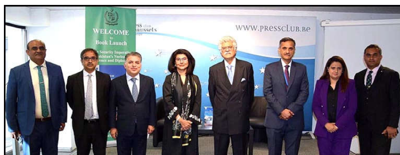
BRUSSELS: The Embassy of Pakistan in Brussels hosted the launch of the book titled 'The Security Imperative - Pakistan's Nuclear Deterrence and Diplomacy' authored by Ambassador Zamir Akram at the Brussels Press Club.