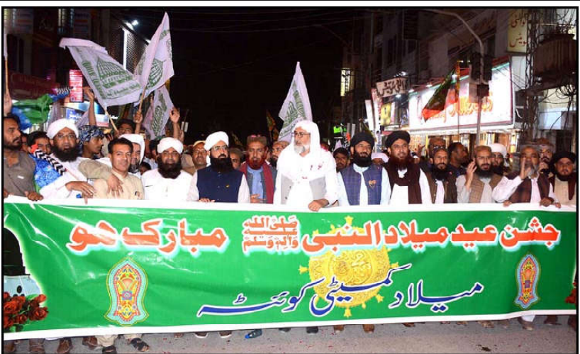
QUETTA: Members of Milad Committee hold rally in concretion with 12 Rabi Ul Awal.

He also reviewed the situation of cleanliness and facilities being provided to the patients at the Hospital. He also reviewed the situation of cleanliness and facilities being provided to the patients at the Hospital.