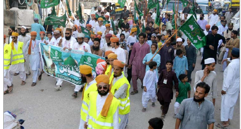
HYDERABAD: Seminary students participate in Milad rally at Al Waheed Colony Hali Road in connection with 12 Rabi Ul Awal.