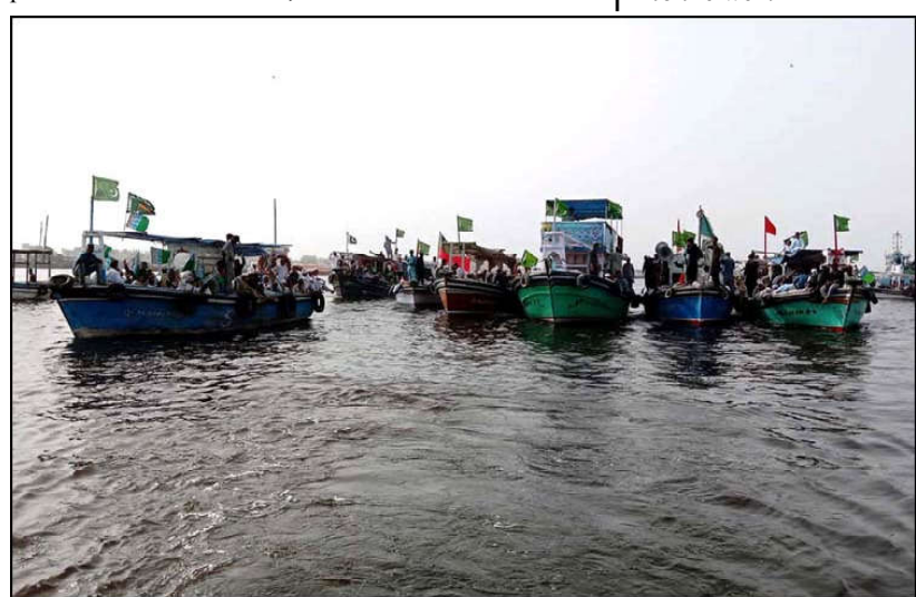
KARACHI: Activists of Jamaat-e-Ahlesunnat Pakistan are holding Jashan-e-Eid Milad-un-Nabi (SAW) Boats rally in connection of 12th Rabi-ul-Awwal the Birthday Ceremony of Holy Prophet (P.B.U.H) coming ahead, at Manora Beach in Karachi.

Independent Report LAHORE (INP): The Drug Regulatory Authority of Pakistan (DRAP) on Monday launched a crackdown against medicine distributors amid the rising cases of vision loss due to the use of substandard injections in Punjab, says in media reports. Initially, it was reported that the eyesight of over 40 diabetes patients was affected in Punjab after which the provincial caretaker government imposed a two-week ban on Avastin's sales and usage for ophthalmology-related treatments. But the number has now increased by over 70. After the cases were reported, DRAP banned hospitals, pharmacies, and patients across the country from using the injections. DRAP officials said that no hospital, laboratory, or pharmacy in Pakistan has a licence to repack the injection. They revealed that both unregistered and registered injections are available in the market. The officials further advised the people and hospitals to not use the imported injections before quality check results were obtained.