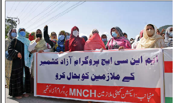
MUZAFFERABAD: Employees of MNC Traders holds protest in the favor of their demands at Azadi Chowk in the Capital of Azad Jammu and Kashmir: Following Prophet (SAWW) teachings key to civilized society: PU VC

Independent Report KARACHI (Online): Watchman of house has killed mother and son in Nazimabad. According to policemen, dead bodies of mother and son have been found from well inside the house in Mujahid Colony, Nazimabad who has been strangled to death. Police said that when the incident was investigated, the watchman of the house was found involved in the murder who strangled both of them to death and threw the bodies into the well.