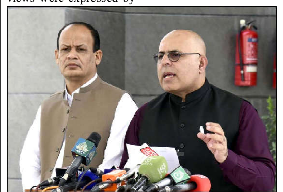
QUETTA: Caretaker Information Minister Jan Achakzai talking with media men