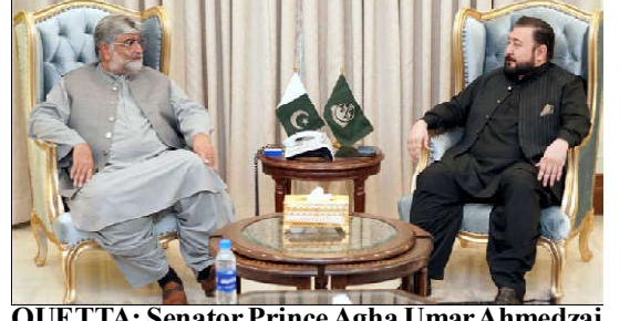
QUETTA: Senator Prince Agha Umar Ahmedzai meeting with Caretaker Chief Minister Mir Ali Mardan Khan Domki

ISLAMABAD (APP): Minister for Planning, Development and Special Initiatives Muhammad Sami Saeed on Monday chaired a meeting of the National Price Monitoring Committee (NPMC) to review the prices of essential commodities, directing the quarters concerned to maintain food prices and provide relief to the common man. The minister emphasised zero-tolerance against hoarders and profiteers, directing the provincial governments to engage their respective Commissions, Deputy Commissioners and Magistrates against the elements involved in hoarders, a news release said. Among others, the meeting was attended by the Chief Statistician from the Pakistan Bureau of Statistics (PBS), representatives from all provinces, the Federal Board of Revenue (FBR), Ministry of Food Security & Industries, and other relevant stakeholders. During the meeting, the PBS officials presented the price and inflation data, while representatives from Punjab, Khyber Pakhtunkhwa, Sindh and Balochistan apprised the forum on the current production and supply of wheat, sugar and other essential commodities, which remained satisfactory. The meeting decided that the PBS would give access to its App to the provinces so that prices could be monitored and controlled effectively. It also highlighted the importance of minimizing the price difference between wholesale and retail items and directed the relevant stakeholders.