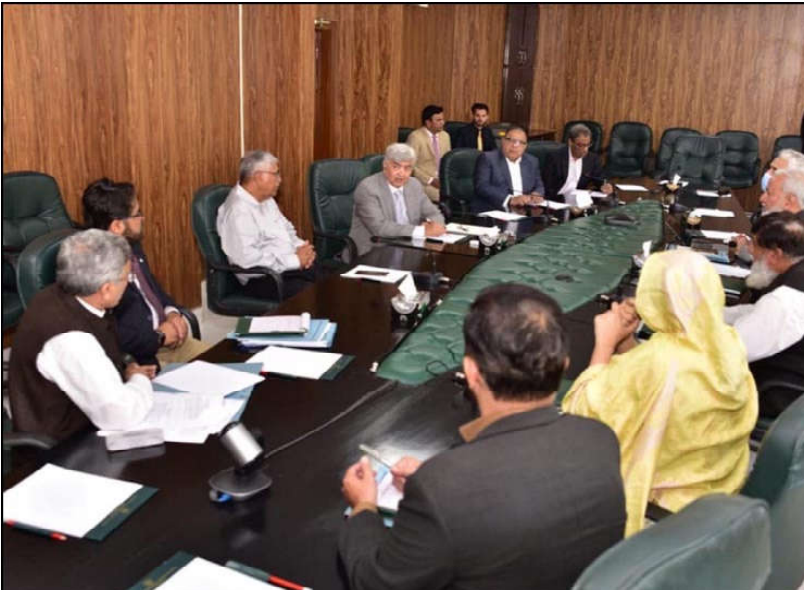
Federal Minister for National food and security and Research is receiving briefing on Agriculture Policy Institute Islamabad.

Dagha also said at the conference that effective import substitution should be an integral part of the country's industrial policy based on achieving growth-based imports. He further said small and medium enterprises (SMEs) must be focused on to achieve high growth and that strategy should focus on skilled youth, high productivity and value addition to agriculture, mining and mineral sectors.