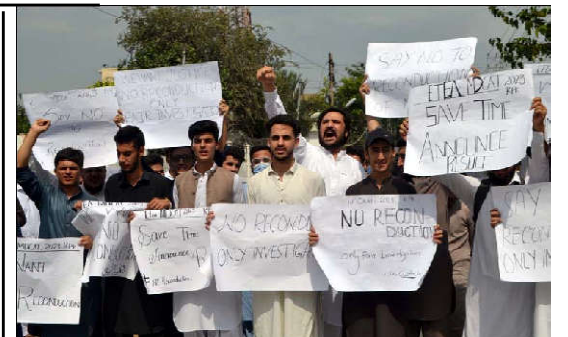
PESHAWAR: Students are holding protest demonstration against re-conduct of MDCAT, at Peshawar press club.