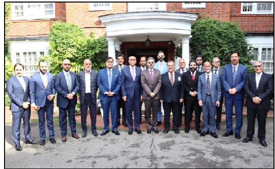
LONDON: A delegation of prominent British Pakistani businessmen call on the Caretaker Prime Minister Anwaar-ul-Haq Kakar.

This initiative aims at enhancing ease of doing business, removing bureaucratic hurdles, and creating a long-term investment roadmap. Moreover, Prime Minister Kakar also shared the government's resolve and commitment to privatize loss-making state-owned enterprises.