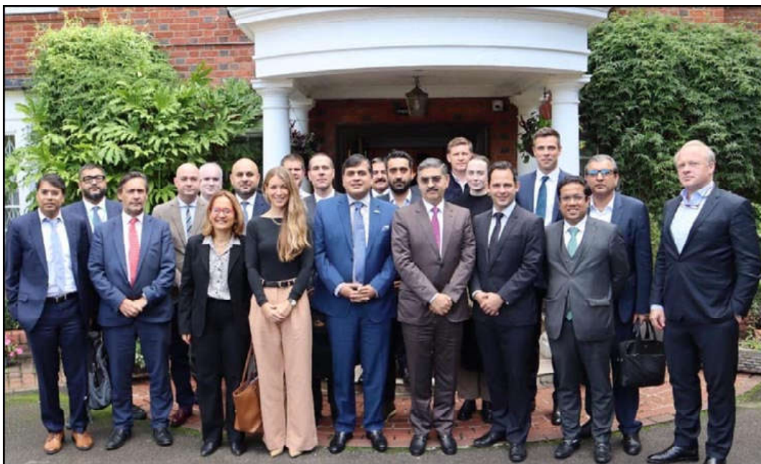
LONDON: Senior leaders of London's capital and Financial Market cell on the Caretaker Prime Minister Anwaar-ul-Haq Kakar.

improvements such as reduced inflation with expected sustained decline, and upcoming growth in agriculture and industry. He mentioned improved trade after removal of restrictions on imports and fiscal measures for monetary support and medium-term inflation targets. The prime minister highlighted Pakistan's pro-investment efforts, introducing the Special Investment Facilitation Council (SIFC). This initiative, led by the prime minister himself.