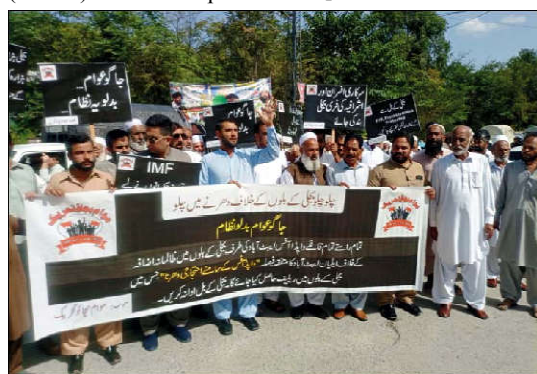
ABBOTTABAD: Members of Awam Bachao Tehreek are holding protest demonstration against highly inflated electricity bills, outside WAPDA Office in Abbottabad.