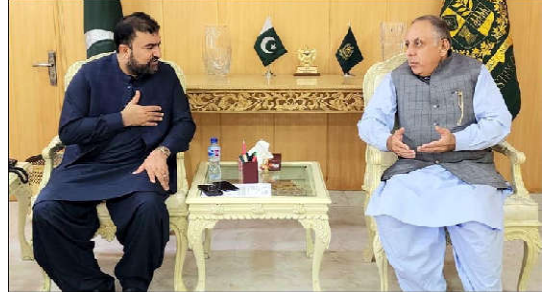
Caretaker Federal Minister for Interior Sarfraz Ahmed Bugti in a meeting with Former Federal Minister Mir Changaiz Khan Jamali in Islamabad.

try, this additional EU funding will help support vulnerable communities as they try to recover their former lives." This allocation will be used to provide multi-sectoral humanitarian assistance to those who remain displaced, as well as those who have returned to their place of origin, given the level of damage to houses and key basic services such as water and sanitation or health. As the winter season approaches, multi-purpose cash assistance, shelter and non-food items will be prioritized. This new funding comes in addition to the €16.5 million already allocated in humanitarian assistance to Pakistan earlier this year, in order to assist the most vulnerable population affected by conflict and climate-induced disasters.