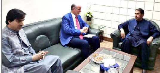
QUETTA: Country Representative of UNFPAMr. Loi Shabane meeting with caretaker Provincial Minister for PHE Sardar Ejaz Ahmed Khan Jaffar

struction of Education Facilities, the Sindh government wanted to meet the need to reduce the dropout and increase enrollment. For this purpose, the government has planned to establish at least 500 elementary schools in the province. The Sindh Education and Literacy Department (SELD) has undertaken multiple initiatives securing development partners' assistance for the upgradation. It brought in 'innovative approaches' through technical assistance with a targeted focus on improving girls' education, girls' retention and successful transition from primary to secondary education. The project has been conceived, considering that the number of elementary schools is much lower than the primary schools in rural Sindh. Under the Operational Improvement of Federal Investigation Agency