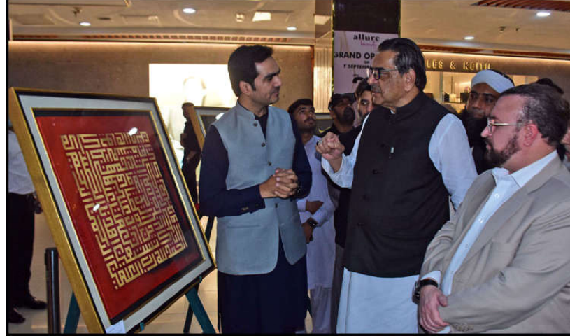
Senator Sardar Muhammad Shafiq Tareen, Chairman Senate standing committee on Science and Technology presiding over a meeting of the Committee at Ministry of Science and Technology, Islamabad.

Talking about 12th Conference of Culture Ministers of the Organization of Islamic Cooperation, he said conference is focusing on cultural issues with a view to enhance joint cultural action in the areas of cultural planning and development indicators and addressing the illicit trafficking of cultural property. Replying a question, minister said that promotion of national heritage and culture among the people can only prevent the society from social ills hatred.