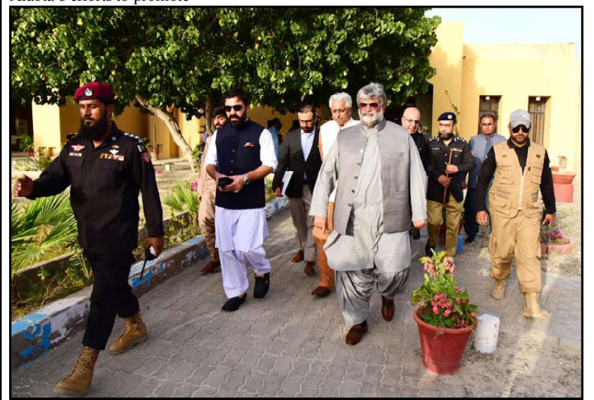
GWADAR: Caretaker Chief Minister Balochistan Mir Ali Mardan Khan Domki coming out of Gwadar airport

actively prevent racist and Islamophobic acts, which incite religious hatred. It is important for the international community to raise its voice against Islamophobia and work in concert to promote inter-faith harmony. That was the spirit behind the resolution passed by the United Nations General Assembly in 2022 to mark 15 March as the International Day to Combat Islamophobia. Pakistan's concerns have been conveyed to the Dutch authorities. We urge them to be mindful of the sentiments of the people of Pakistan and Muslims around the world and take active steps to prevent such hateful and Islamophobic acts, the spokesperson added.