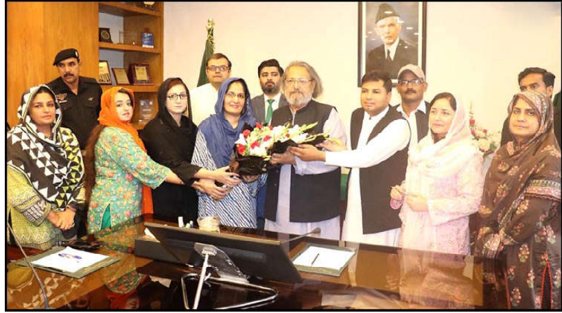
ISLAMABAD: A delegation of daily wagers met the Caretaker Federal Minister for the Ministry of Education and Professional Training Madad Ali Sindhi and thank to him for resolving all of their issue.

SAPM said that the designated support desks services will be extended to other institutions at the federal and provincial levels that offer services to Overseas Pakistanis. This means that overseas Pakistanis can access a wide range of services at the support desks, from all levels of government. This significant move is expected to increase the trust that Overseas Pakistanis have in the government, adding said it will also help to make it easier for Overseas Pakistanis living to access government services with ease. The support desks are located in ICT's Offices at G-11/4 and CDA's building at G-7/2 Islamabad, which will be open to all Overseas Pakistanis, regardless of where they live in the world.