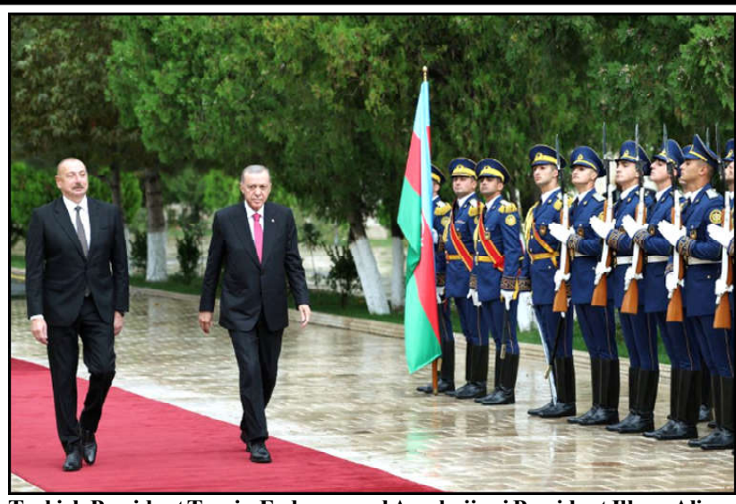
Turkish President Tayyip Erdogan and Azerbaijani President Ilham Aliyev attend a welcoming ceremony in Nakhchivan, Azerbaijan.