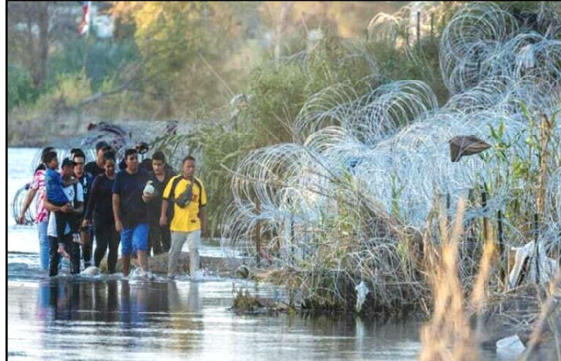
Migrants walk along razor wire looking for a place to cross the Rio Grande river, near the US-Mexico border.

Monitoring Desk SEOUL: North Korea on Monday called South Korean President Yoon Suk Yeol "a guy with a trash-like brain" and "a diplomatic idiot" as it blasted him for using a U.N. speech to issue a warning over the North's deepening military ties with Russia. In a speech at the U.N. General Assembly last week, Yoon said South Korea "will not sit idly by" if North Korea and Russia agree to weapons deals that would pose a threat to the South. North Korean leader Kim Jong Un's trip to Russia earlier this month to meet President Vladimir Putin and visit key military sites raised international concern about a possible push by North Korea to receive sophisticated nuclear and weapons technologies in return for replenishing Russia's conventional arms inventory depleted by its war with Ukraine.