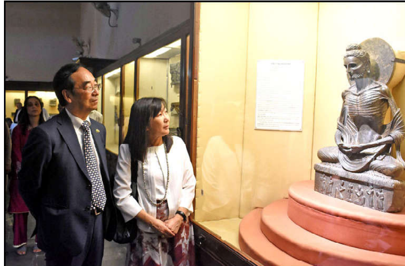
LAHORE: Ambassador of Japan to Pakistan Mitsuhiro Wada take keen interest in a sculpture during visiting at Lahore Museum, in Provincial Capital.