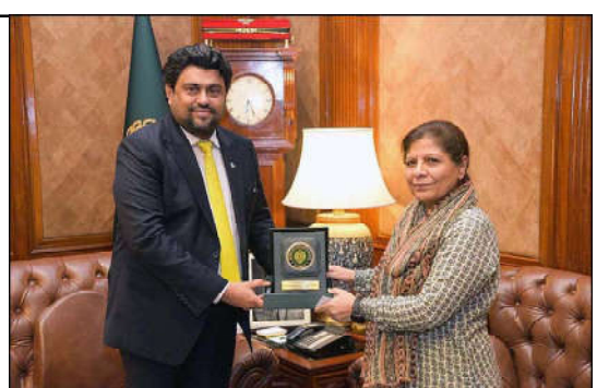
KARACHI: Sindh Governor Kamran Khan Tessori presenting the shield to the caretaker Federal Minister for Finance and Economic Affairs Shamsah Akhtar at the Governor House.