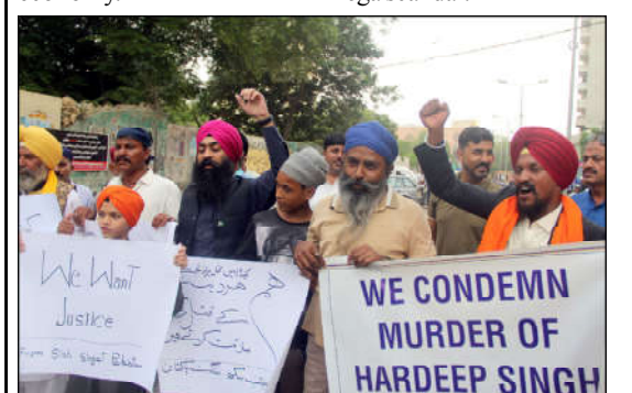
KARACHI: Members of Pakistan's Sikh community shout slogans during a protest outside press club, in Provincial Capital, to condemn the killing of a Sikh separatist Hardeep Singh Nijjar in Canada.

He said no doubt the economic hitmen operating under the political cover of the PPP, PML-N and PTI are responsible for the IPPs scam and they should be fully unmasked and dealt as per law. He said it is heartening to know that some lawyers and activists are going to file a constitutional petition in the Supreme Court of Pakistan against the IPPs mega scandal.