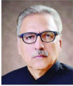
Dr. Arif Alvi President Islamic Republic of Pakistan

I extend my sincere congratulations to all newspaper readers and the All-Pakistan Newspapers Society (APNS) on the occasion of National Newspaper Readership Day. Reading newspapers has a greater educative value as they provide us knowledge and information about the social, economic, and political issues as well as sports, culture and entertainment. They educate the readers about the developments taking place in the national and international arena and broaden the mental horizon of the readers. Besides, newspapers play important role in shaping public opinion and influencing and guiding the decision-makers by providing their input and insight.