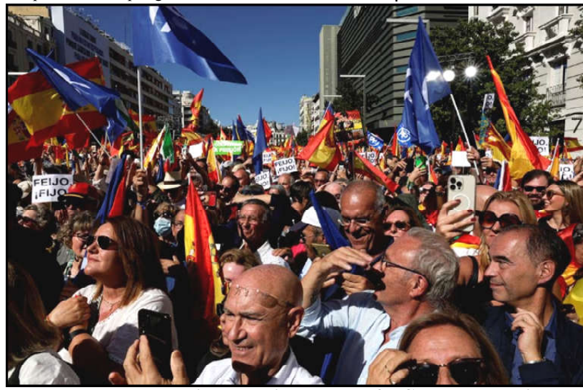
People attend a rally against a possible amnesty for Catalan separatist leaders in Madrid, Spain.