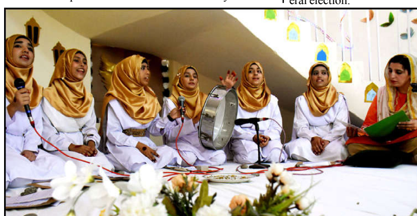
ISLAMABAD: Students are reciting Naat in the annual Mehfil-e-Milad held at Model College for Girls 1-8/3.