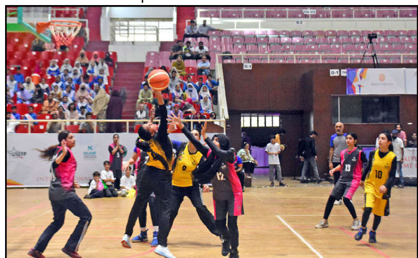
ISLAMABAD: Girls Players of Pak Army and Islamabad Basket Ball are in action during match at Sports Complex, as Organized by KKAWF in Federal Capital.

It has been explained that various amendments have been made to the Election Commission Rules in accordance with the law to address various scenarios and problems that arise over time.