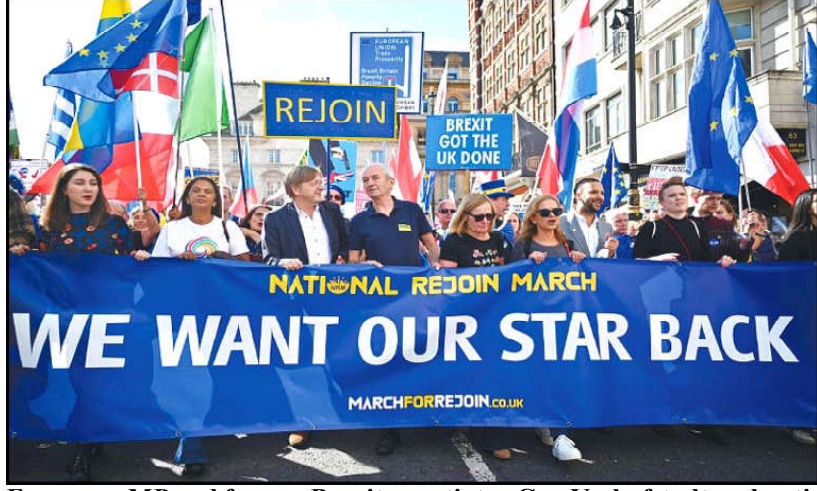
European MP and former Brexit negotiator Guy Verhofstadt and anti-Brexit campaigner Gina Miller take part in a rally calling for the UK to rejoin the EU.

Monitoring Desk PARIS: French President Emmanuel Macron pledged to invest $150 million in the International Fund for Agricultural Development (IFAD) to fight poverty and climate change in rural areas. France decided to host and organise the 13 th replenishment of IFAD, and was now launching a call for contributions by making the commitment, Macron said in a video message broadcast during a charity concert organized in New York by the non-profit group Global Citizen. IFAD is a Rome-based United Nations agency working to address poverty and hunger in developing countries' rural areas.