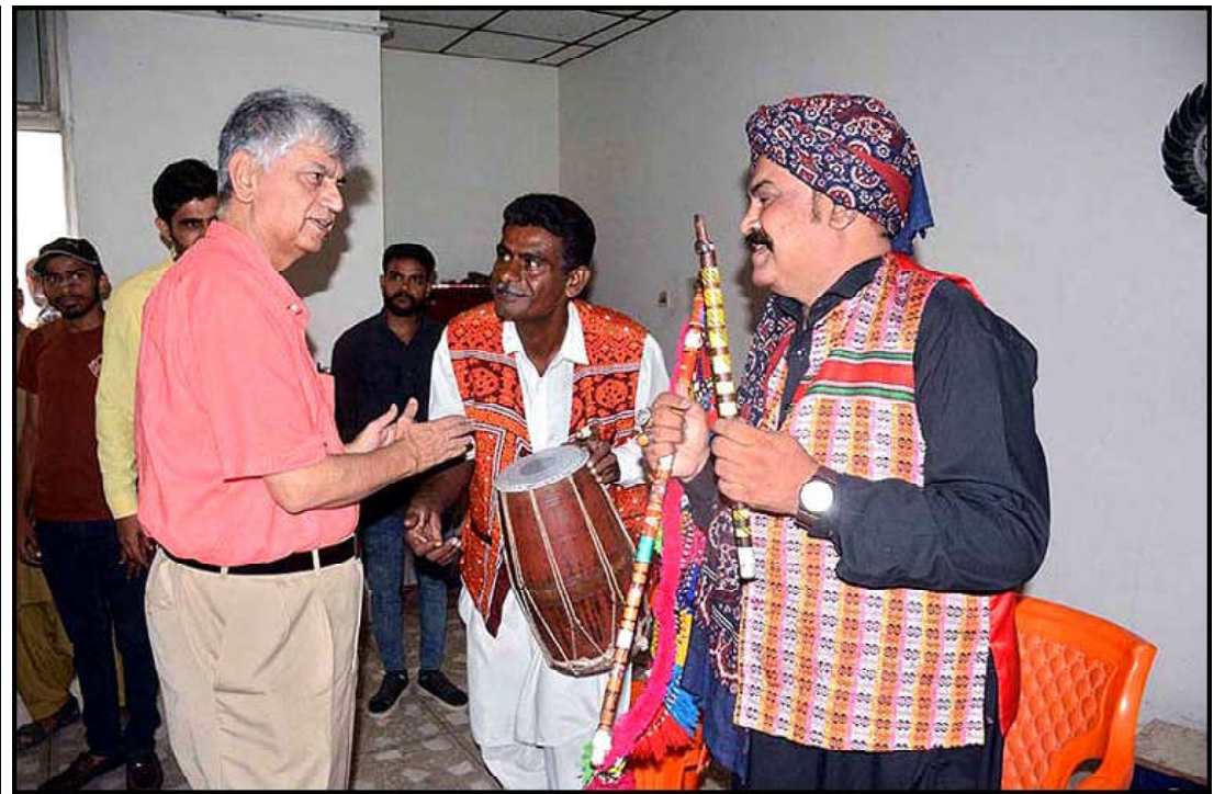
KARACHI: Caretaker Minister for Information and Broadcasting Murtaza Solangi talks to a folk artist after a ceremony held in his honor at Radio Pakistan Broadcasting House.

The issues highlighted by all speakers underscored the urgency of addressing the environmental challenges facing global Deltas and considered it imperative that governments, researchers, environmental organizations, and communities collaborate to ensure the preservation and revitalization of the global vital ecosystem for future generations.