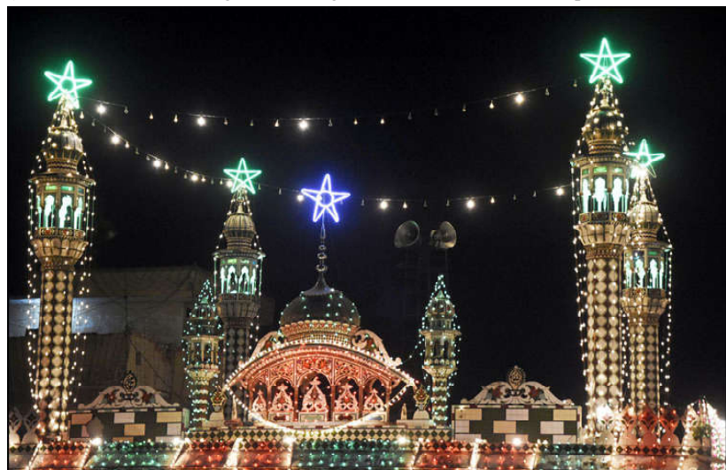
RAWALPINDI: An illuminated view of a Mosque decorated with colourful lights in connection with Eid-e-Milad-un-Nabi (PBUH) at Pirwadai Road as the nation starts preparation to celebrate in befitting manners.