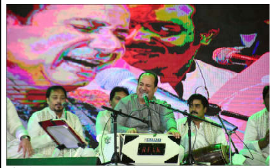
ISLAMABAD: Famous singer Rahat Fateh Ali Khan is performing during musical concert to Honor Pakistan's Martyrs and Ghazis at Liaqat Gymnasium Sports Complex in Federal Capital, organized by Islamabad Chamber of Commerce (ICCI).

Kashmir and Palestine disputes, he added, will continue to put a question mark on the UN credibility unless these issues are resolved as per the World Body's resolutions and aspirations of the people of Kashmir and Palestine.