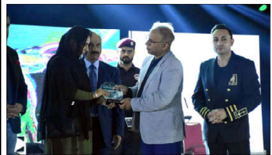
Representatives from the business community addressed the gathering, acknowledging the sacrifices made by Pakistan's Armed Forces and Police, affirming their commitment to support and stand by them.