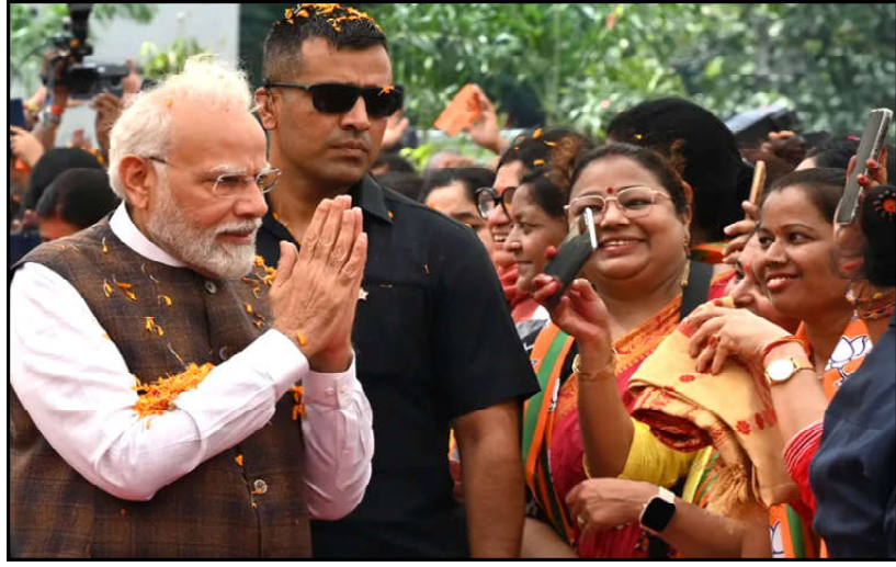
Indian Prime Minister Narendra Modi is welcomed at the Bharatiya Janata Party headquarters, where he was felicitated a day after the women's reservation bill was passed by the Indian Parliament in New Delhi.