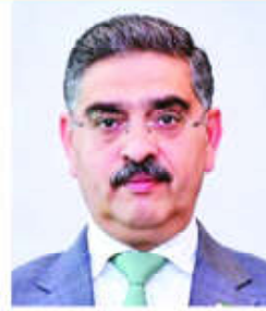
Anwaar-ul-Haq Kakar Caretaker Prime Minister

I extend my heartfelt congratulations to the All-Pakistan Newspapers Society (APNS) for their commitment to celebrating National Newspaper Readership Day. I am confident that this initiative will significantly contribute to nurturing the habit of reading among our people, empowering them with the knowledge and insight to make informed decisions for a better future.