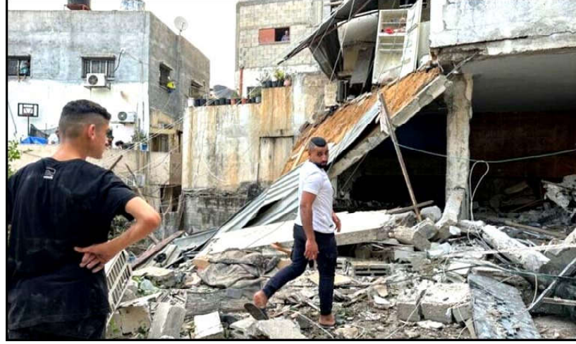
Palestinians check a damaged house following an Israeli raid in Tulkarm in the Israeli-occupied West Bank.

agency, the Federal Security Service, also known as the FSB. The Kursk region of Russia borders Ukraine and also is a frequent target of attacks. The drone strike on Sunday took place as residents commemorated the anniversary of the regional capital's founding. There was no immediate comment from the Ukrainian authorities, who usually don't acknowledge responsibility for attacks on Russian territory. Ukrainian President Volodymyr Zelenskyy was traveling home from North America, where he addressed the U.N. General Assembly and paid his first wartime visit to Canada. In a social media statement Saturday, Zelenskyy said he stopped in Poland on his way back to Ukraine to give state awards to two Polish volunteers.