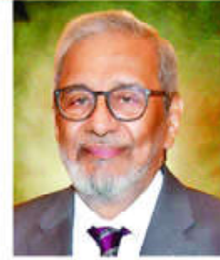
Justice (Retd.) Maqbool Baqar Caretaker Chief Minister Sindh

Newspapers are the most authentic source of accurate information, therefore newspapers were, are and will remain an important part of every society. The importance of newspapers for raising public awareness is unquestionable. Newspapers have played an unforgettable role in every society for the promotion of free democratic values. In Pakistan movement, newspapers played an important role in raising awareness of the importance of a separate homeland among the people. In developed societies, newspapers are still being printed and sold with full gusto. The habit of newspaper reading, has diminished in the digital age, but it cannot be eradicated by any means. Newspapers provide easy and affordable access to accurate and authentic information. Despite electronic and digital media, newspapers are still a great source of information for readers. By studying newspapers one gets awareness of various economic and social issues. The reader's access to the language and vocabulary is also widened by reading newspapers.