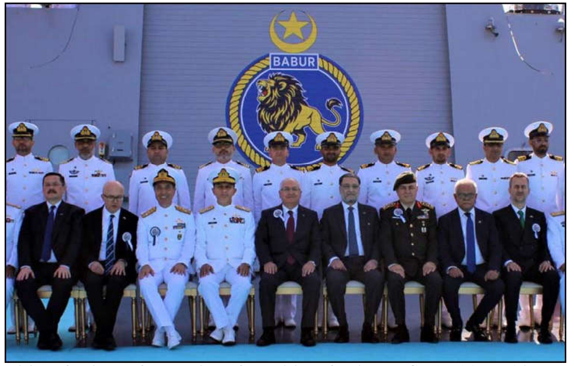
Minister of National Defence Turkiye, Defence Minister of Pakistan Lt. Gen (retd) Anwar Ali Hyder and Chief of the Naval Staff Admiral Muhammad Amjad Khan Niazi in a group photo along with commissioning crew onboard newly commissioned PNS BABUR.

role and reforms, and terrorism issues, in his address to the UNGA session. Being the first interim prime minister to represent Pakistan at the world body, Kakar held important discussions with Iranian President, UN Secretary General, Chinese Vice President, President of Uzbekistan and heads of different financial institutions on the sidelines of the UNGA 78. In a bilateral meeting with President of Iran Ebrahim Raisi, the caretaker prime minister reaffirmed Pakistan's strong commitment to further strengthen and deepen ties with the brotherly country.