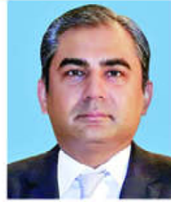
Mohsin Naqvi Caretaker Chief Minister of Punjab

On behalf of the Ministry of Information & Broadcasting, I appreciate the efforts of the APNS for observing the National Newspaper Readership Day in acquainting the nation with the significance of newspaper reading. There is no gainsaying that the newspapers are a source of reliable and authentic information in an era of massive proliferation of fake news and it is encouraging to see that the newspapers have upheld their authenticity, credibility, and reliability, despite the advent of digital media. Moreover, the newspapers also helped in effectively putting Pakistan's stance across the globe. Lastly, I reiterate the Government's resolve to promote freedom of expression and urge the print media fraternity to join hands with the Government to develop an educated and enlightened nation.