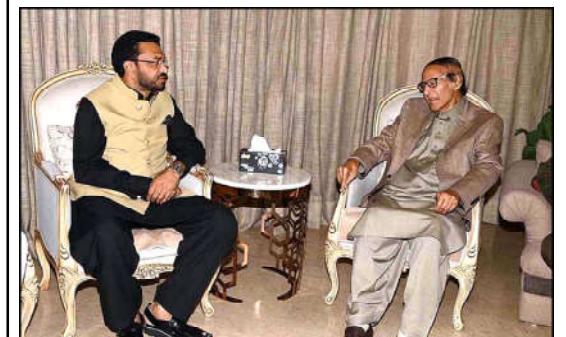
LAHORE: Mr. Khalil George, Federal Minister for Human Rights meets with Ch Shujaat Hussain at his residence in Gulberg.

In addition to this, necessary steps should also be taken for improving the situation of cleanliness in Quetta on an emergent basis.