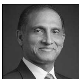
Aizaz Ahmad Chaudhry

Earlier this month, India hosted, with gaudy fanfare, the 18 th meeting of the G20. The outcome was an 83-paragraph declaration, which called for green development and inclusive growth, but broke no new ground. The declaration deplored the aggression against Ukraine but did not name Russia. Ukraine was irritated.