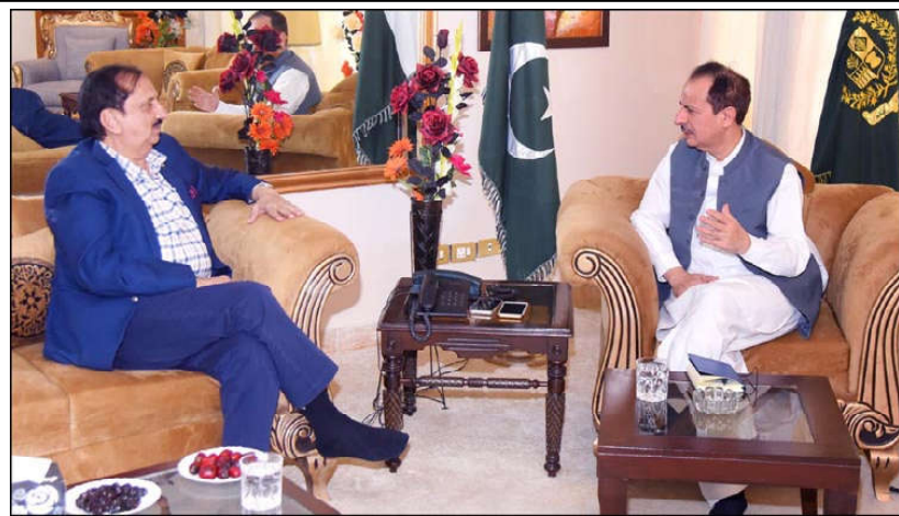
Federal caretaker health minister Dr Nadeem Jan and provincial care taker primary and secondary health care minister Dr Jamal Nasir meeting today in Islamabad

PPP's Wassan said his party [PPP] will form a government with the power of the people and the process of accountability will continue even after the general election.