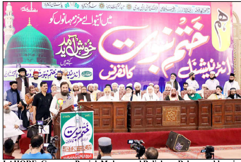
LAHORE: Governor Punjab Muhammad Balighur-Rehman addressing annual Khatm-e-Nabuwat (SAWW) Conference at Aiwan-e-Iqbal Lahore.