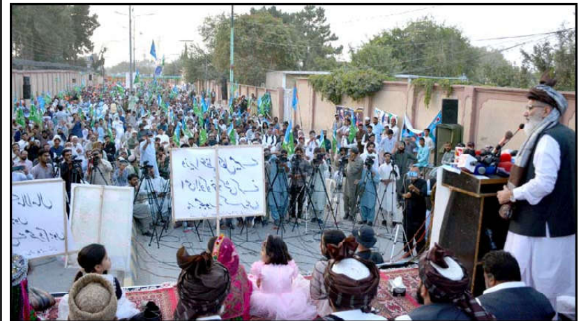
QUETTA: Ameer Jamaat-e-Islami Sirajul Haq addressing a protest gathering against the hike electricity and petrol prices in front of Governor House