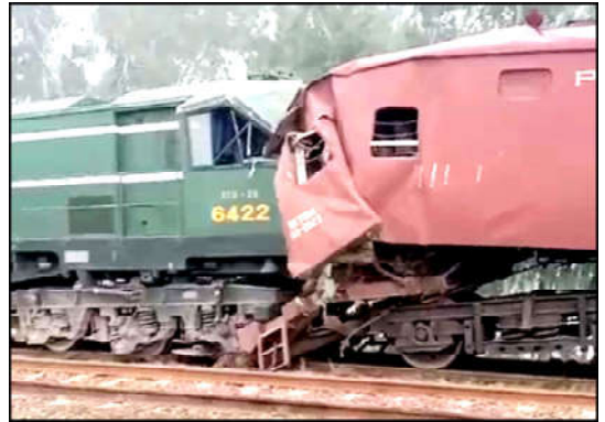
SHEIKHPURA: A view collision between Mianwali Express with goods train near Qilla Sattar Shah railway station

He said that frontline health workers are the real heroes of our immunization program, who perform their duties with dedication and devotion.