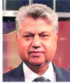
Murtaza Solangi Caretaker Minister of Information & Broadcasting

I deeply appreciate the remarkable initiative of the All Pakistan Newspaper Society to celebrate 25 September as the National Newspaper Readership day.