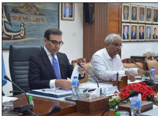
Interim Minister for Energy Muhammad Ali held a meeting with National Transmission and Dispatch Company (NTDC) wherein MD NTDC highlighted company profile, future expansion plan, major recent achievements and issues being faced by SBP in Lahore.

ISLAMABAD (APP): The 100-index of the Pakistan Stock Exchange (PSX) continued with bullish trend on Friday and gained 219.02 points, showing a positive change of 0.47 per cent, closing at 46,421.15 points against 46,202.13 points the previous day. A total of 172,894,248 shares valuing Rs. 6.269 billion were traded during the day as compared to 172,158,686 shares valuing Rs. 5.345 billion the previous day. As many as 323 companies transacted their shares in the stock market; 197 of them recorded gains and 99 sustained losses, whereas the share price of 27 companies remained unchanged. The three top-trading companies were Cnergyco PK with 10,563,972 shares at Rs3.09 per share, WorldCall Telecom with 10,059,097 shares at Rs.1.14 per share, and Unity Food Ltd with 8,137,436 shares at Rs.25.41 per share. Sapphire Textile witnessed a maximum increase of Rs.64.93 per share price, closing at Rs.1,192.93, whereas the runner-up was Sapphire Fiber.