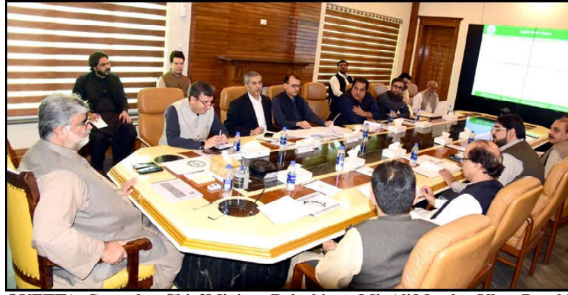
QUETTA: Caretaker Chief Minister Balochistan Mir Ali Mardan Khan Domki presiding over a meeting to review affairs regarding Provincial Disaster Management Authority

Ph: 2841470/2841473 REG: No. BC-116 B/ID-445 V&amp; XXV No 33, Rabi-ul-Awwal 06, 1445 AH Saturday September 23, 2023 Pages 12, Price Rs.15