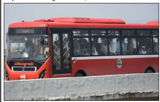
RAWALPINDI: People travelling in Metro Bus to reach their destination as administration increase the fares about Rs. 20 per head, which affect the Citizens especially daily wagers in the twin cities.