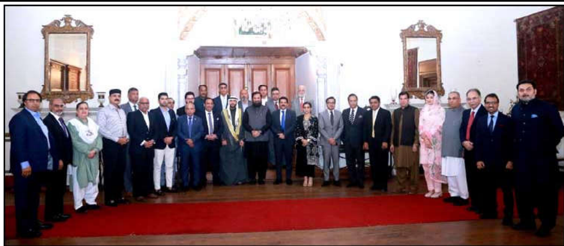
LAHORE: A delegation of CEO Club Worldwide Pakistan & UAE Chapter in a group photo with Punjab Governor, Muhammad Balighur Rehman at Governor House.