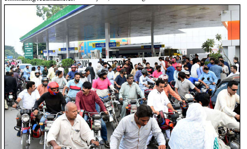
LAHORE: A large number of the people are gathers surround the Patrol Pump to refill bikes tanks free of cost, under the banner of prominent Pakistan's Welfare Organization, in Provincial Capital.

remitters accumulate reward points by sending remittances through formal channels of SBP regulated entities, said a statement issued here. Former Finance Minister Ishaq Dar in his budget speech for FY24 had announced the addition of Diamond category with enhanced reward points and provision of other benefits like arms license of non-prohibited bore, preferential treatment at Pakistan embassies and airports and gratis passport to the Diamond Category holders.