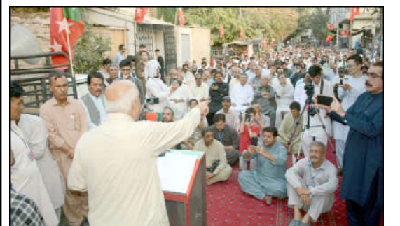
QUETTA: Chief of National Party Dr. Abdul Malik Baloch addressing a protest against inflation and increase in electricity and gas prices.

In the discussion, both sides accentuated the augmentation of bilateral trade volume and applauded the resumption of flights between Pakistan and Ethiopia. Chairman Sanjrani lauded the initiative, stating that it would enhance connectivity not only within Africa but also with Pakistan. He further stressed the significance of increasing cooperation and public relations in the field of education and addressing global challenges such as Islamophobia through interfaith harmony and mutual respect. The meeting concluded on a positive note, with both sides expressing their commitment to strengthening the bilateral ties between Pakistan and Ethiopia.