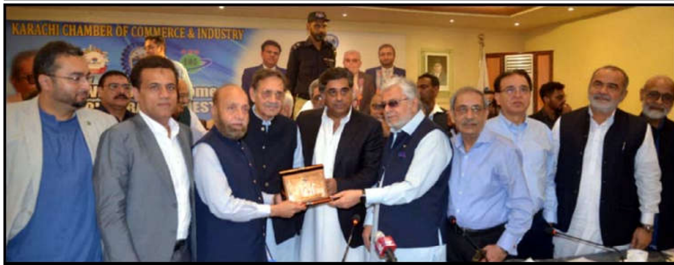
KARACHI: Caretaker Federal Minister for Commerce Industries & Production Dr. Gohar Ejaz is being presented with memento during his visit to Karachi Chamber of Commerce & Industries KCCI.