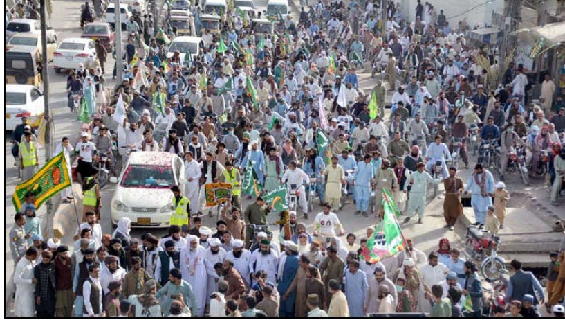
QUETTA: A view of rally in connection with Eid Milad un Nabi (SAWW).