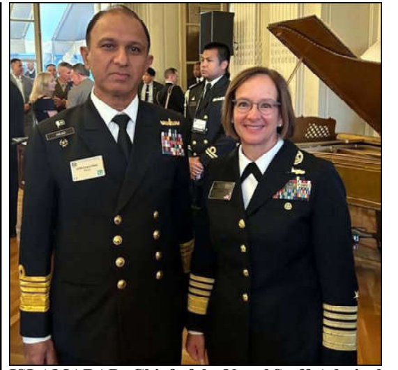
ISLAMABAD: Chief of the Naval Staff, Admiral Muhammad Amjad Khan Niazi along with Admiral Lisa M. Franchetti, US Chief of Naval Operation during the 25th International Seapower Symposium held in USA.

Pakistan Party and former senior Minister Punjab, Aleem Khan and said that he has already made commitment to establish a modern dialysis unit in Quetta. He said that we would also request him (Aleem Khan) for the dialysis units at the district level.