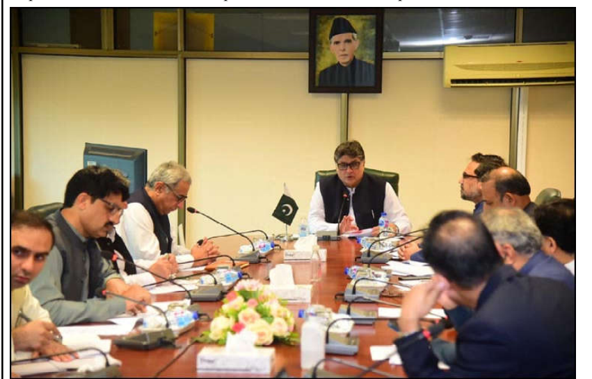
Meeting on PIA's restructuring leading to Privatisation held under the Chairmanship of Minister Fawad Hasan Fawad, Advisor to PM on Aviation is also present.

Dr. Shamshad appreciated that the CGP provide immense opportunities to investors and great convenience to market intermediaries by removing duplications and streamlining the customer onboarding process. She appreciated SECP for its efforts and constructive reforms for facilitating investors' onboarding, with having the potential of transforming the landscape of Pakistan's capital markets. However, Shamshad said the successful launch of the CGP should not be deemed the end of this project. Having developed this promising digital platform, we are now faced with the critical part of realizing the potential it offers.