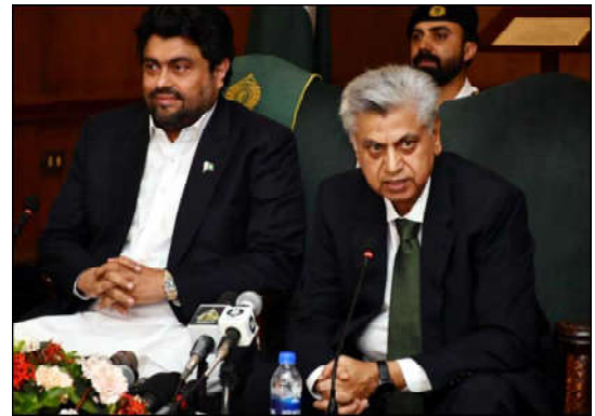
Caretaker Federal Minister for Information & Broadcasting Murtaza Solangi addressing the Press Conference at Governor House Karachi. Governor Sindh, Kamran Khan Tessori also present.