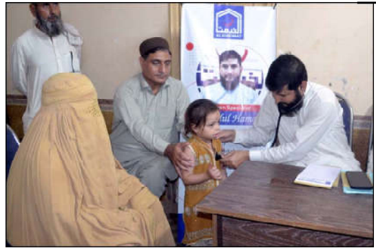
PESHAWAR: Patients are being examine by doctor during the free medical camp organized by Al-Khidmat Foundation held at Shaheen Muslim Town in Peshawar.