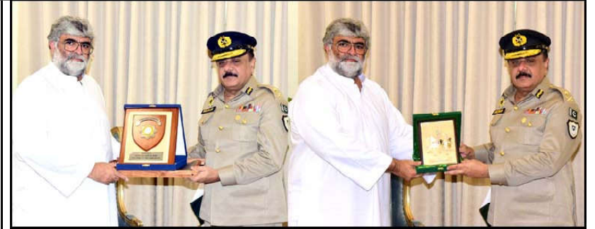
QUETTA: Caretaker Chief Minister Balochistan Mir Ali Mardan Khan Domki and Inspector General National Highways, Motorway Police Sultan Ali Khawaja exchanging shields during a meeting

suffered from lack of facilities in prisons were poor, while the state was also not playing a role in providing cheap and quick justice to them. It further said that the criminal system allowed the exploitation of the weaker sections of society by the powerful. The court said that such a condition of prisons was intolerable in a constitutional society. It was the responsibility of the state to protect the fundamental rights of every prisoner. The prisoners were entitled to enjoy all constitutional rights except freedom of movement, it added. A division bench of the apex court led by former Chief Justice of Pakistan Umar Ata Bandial had heard the matter.