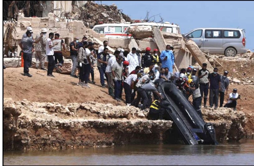
United Arab Emirates search and rescue personnel drop in a boat to carry out a search mission for dead bodies stranded at sea following floods in Derna, Libya.

Trump has voiced skepticism about Washington's engagement with traditional allies, including NATO, and has been complimentary of Putin.