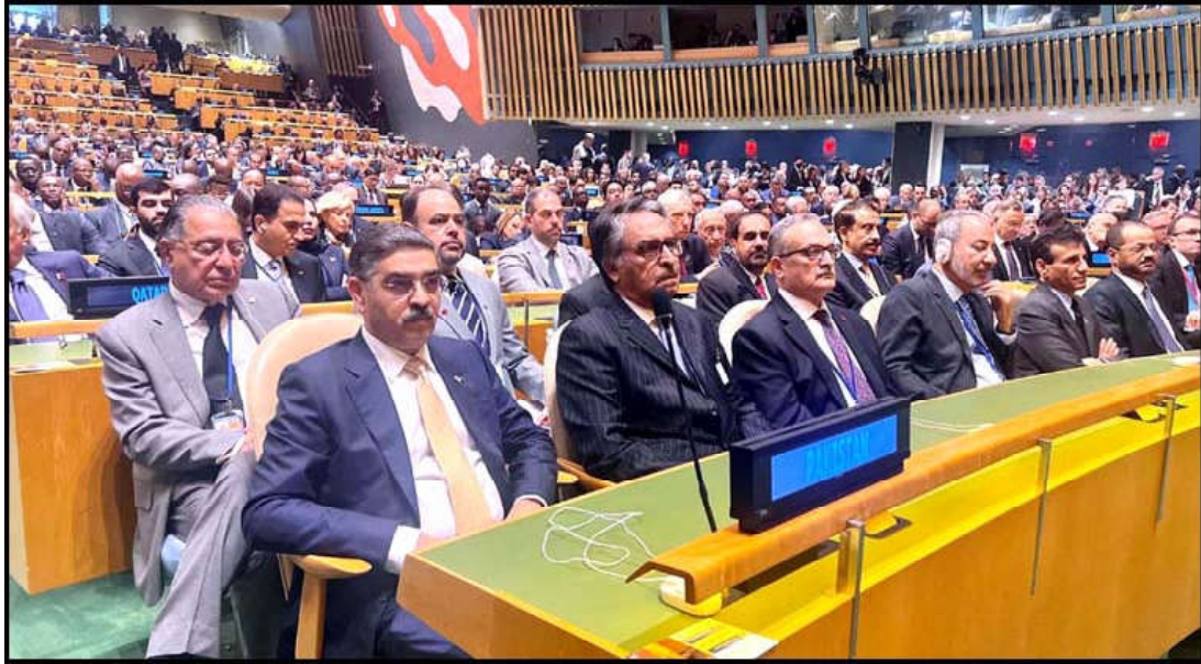
NEW YORK: Caretaker Prime Minister Anwaar-ul-Haq Kakar is attending the opening session of the General Debate of 78th UNGA session at the UN headquarters.

Ph: 2841470/2841473 REG: No. BC-116 B/ID-445 Vd XXV No 30, Rabi-ul-Awwal 03, 1445 AH Wednesday September 20, 2023 Pages 12, Price Rs.15