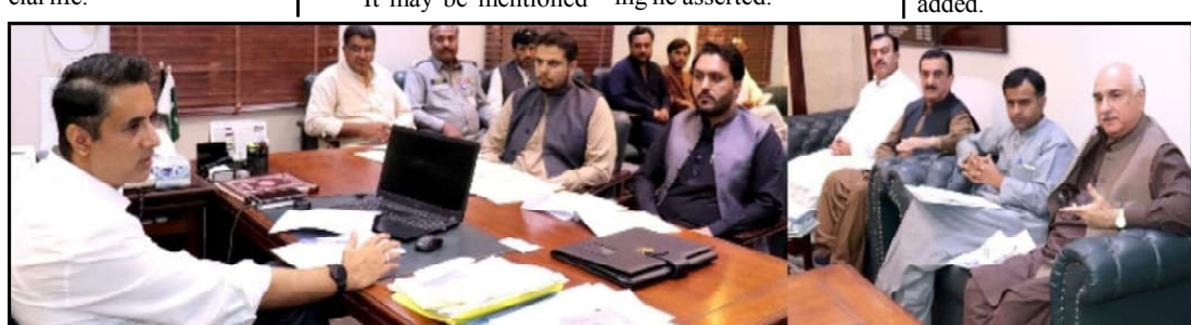
QUETTA: Commissioner Quetta Division Hamza Shafiqat presiding over a meeting regarding Karachi Bus Terminal Hazarganji

QUETTA: Commissioner Quetta Division Hamza Shafiqat presiding over a meeting regarding Karachi Bus Terminal Hazarganji. The meeting was held in a conference room where several officials were present. Commissioner Shafiqat was seen interacting with the officials and discussing the issues related to the bus terminal. The meeting was attended by various departmental heads and officials from the Quetta Division. The Commissioner emphasized the need for a comprehensive plan for the terminal and the importance of ensuring the safety and convenience of the passengers. The meeting concluded with a decision to take further steps to address the concerns raised by the officials.