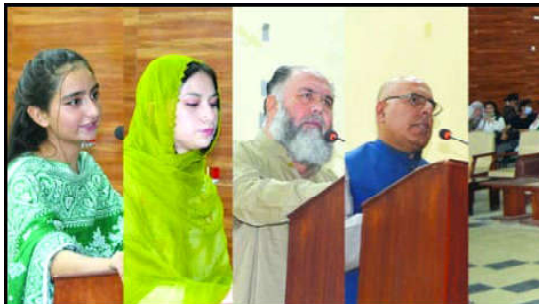
QUETTA: Caretaker Information Minister Jan Achakzai and others addressing participants of a ceremony organized by Aurat Foundation

The Information Minister said that the basic objective behind the training programme is to impart training and skills to the youth in sector of information technology, he training programme is also aimed at enabling the talented youth of Balochistan through respectable livelihood, he added.