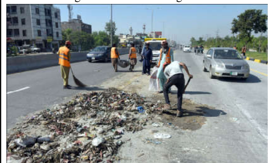
ISLAMABAD: Sanitation Workers of CDA are collecting the garbage to clean the Kernal Sher Khan road as massive garbage fall down from speedy Sanitation truck, in Federal Capital.

He said that PIEAS and PAEC train doctors and medical professionals in the fields of nuclear medicine and diagnostics.