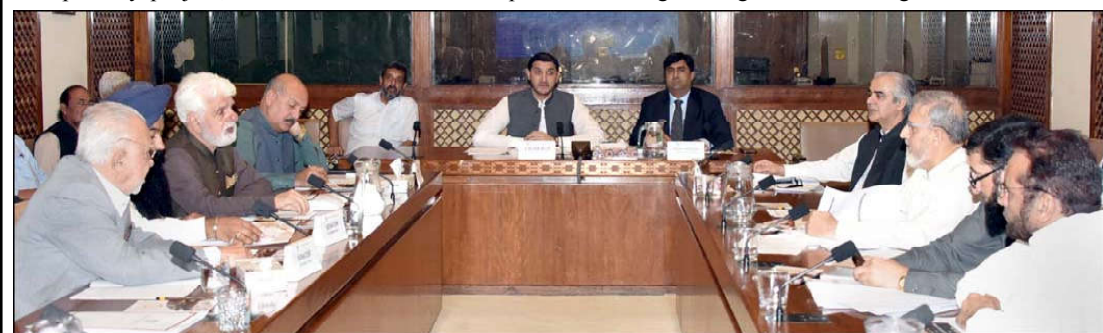
Senator Hilal Ur Rehman, Chairman Senate Standing Committee on States and Frontier regions presiding over a meeting of the committee at Parliament House Islamabad.

The purpose of day 1 of training was to give brief