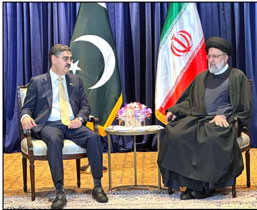
NEW YORK: Caretaker Prime Minister Anwaar-ul-Haq Kakar in a meeting with meeting with the President of Iran Ebrahim Raisi.