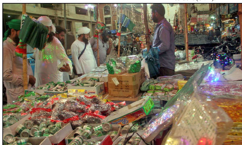
KARACHI: People are buying fancy lights and other stuff from vendor at sadr area to celebrates 12 Rab-ul-Awal with great zeal in Provincial Capital.

from US $58.551 million to US $58.425 million. The export of repair and maintenance services surged by 400 per cent from US $0.007 million to US $0.035 million whereas the export and imports of computer software services witnessed an increase of 9.30 per cent, from $46.044 million to $50.327 million. In addition, the exports of other computer services also witnessed a growth of 15.03 per cent from US $55.179 million to US $63.473 million. Meanwhile, the export of information services during the month under review also increased by 3.45 per cent growing from US $0.290 million to US $0.300 million. Among the information services, the exports of information-related services decreased by 8.82 per cent, from US $0.204 million to US $0.186 million whereas the exports of other information services rose by 32.56 per cent, from US $0.086 million to US $0.114 million.