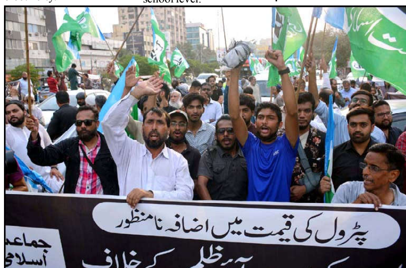
KARACHI: Leaders and supporters of Jamat-e-Islami (JI) block road as they are holding protest demonstration against massive unemployment, increasing price of daily use products, inflation price hiking and the highly inflated electricity bills, held at Shahrah-e-Faisal road in Karachi.

cerns raised by local police. Although a late change in dates was not feasible, security authorities have accommodated this request. It must be noted that Pakistan is set to play a total of eleven matches in the World Cup, with four of them, including two warm-up matches and two group games, scheduled to take place in Hyderabad. The Men in Green are expected to arrive in Hyderabad via Dubai on September 27. Pakistan's schedule for the ICC World Cup 2023: October 6 - vs Netherlands in Hyderabad October 10 - vs Sri Lanka in Hyderabad October 14 - vs India in Ahmedabad October 20 - vs Australia in Bengaluru October 23 - vs Afghanistan in Chennai October 27 - vs South Africa in Chennai October 31 - vs Bangladesh in Kolkata November 4 - vs New Zealand Bengaluru (Day match) November 11 - vs England in Kolkata The day matches will start at 10:00 am Pakistan Standard Time (PST) while all other matches will be day-night fixtures starting at 01:30 pm (PST). If Pakistan qualify for the semi-finals, they will play in Kolkata. If India qualifies for the semi-finals, they will play in Mumbai unless playing against Pakistan, in which case they will play in Kolkata.