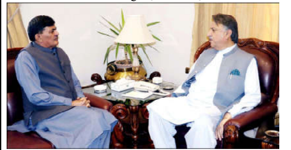
QUETTA: Caretaker Provincial Education Minister Qadir Bakhsh Baloch meeting with Governor Balochistan Malik Abdul Wali Khan Kakar

The board meeting formed sub-committee of Finance department for review of the administrative and financial matters of Traffic Engineering Bureau. The caretaker Chief Minister on the occasion directed to present the proposed service rules of the Traffic Bureau officers and staff in the next board meeting after reviewing the same. He was of the view that the project of Traffic Bureau can be useful when proposals of all concerned departments would be included in it. He also stressed the need to ensure correct use of resources provided for the Traffic Bureau. The Chief Minister urged the Traffic Bureau to demonstrate remarkable performance so that the general public may realize good change.