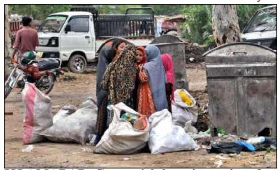
ISLAMABAD: Gypsy girls busy in gossips after searching valuables from garbage container at Mera Abadi Road, F-11.

The AC with the dengue monitoring teams ensured adherence of dengue SOPs at various sites i.e. marble factories, workshops, tyre shops, nurseries, dump-sites etc. and inspected the doorstep households where patients were found as per the SOPs. Action was also taken