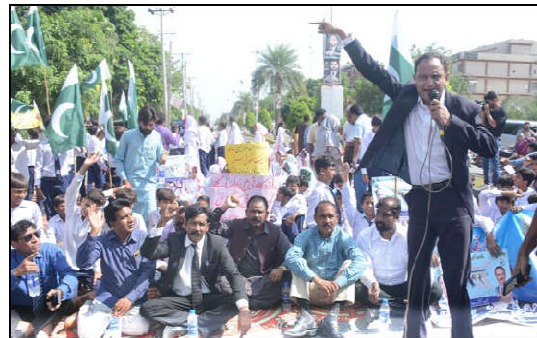
FAISALABAD: Teachers and students of private school holds protest in the favor of their demands outside DC Office in City.

As per the MoU, Plus W would give three months of short-course certification in Artificial Intelligence, Big Data, Blockchain, Deep Learning, Machine Learning and other technologies.