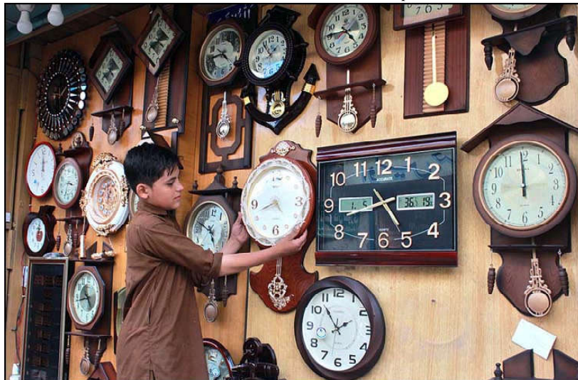
QUETTA: A shopkeeper displaying wall clock in his shop.

As per reports from the international media outlet 'The Guardian', a 30 percent increase in oil prices has been recorded.