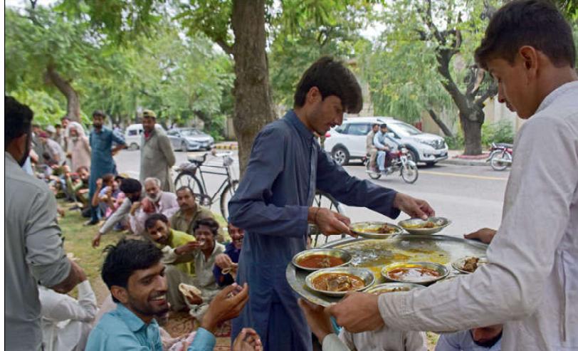
ISLAMABAD: Volunteers are distributing foods among the deserving people at Sector F-7 in Federal Capital.

According to the PMD, few heavy or isolated very heavy falls are expected in Thatta, Badin, Sajawal, Umerkot, Tharparkar and Mirpurkhas. The synoptic situation has revealed that a low pressure area (LPA) was located over Southeast of Rajasthan (India) and likely to move south westwards during next 48 hours.