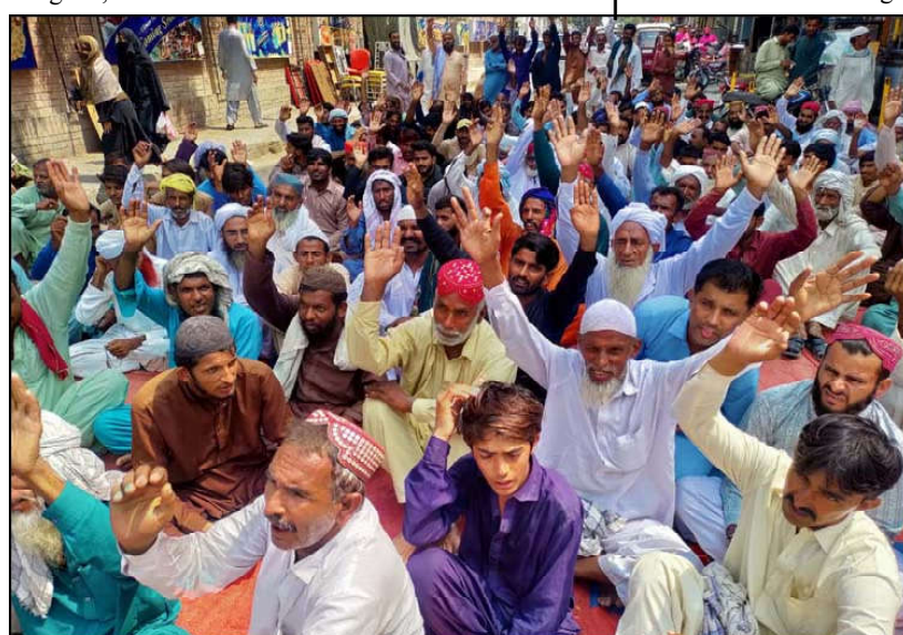
SUKKUR: Members of Civil Society are holding protest demonstration against unrest law and order situation in city, held in Sukkur on Monday.

As a result of these actions, Kohat authorities sealed the suspects' shop. An FIR has been registered against the suspects, and the investigation is currently ongoing to uncover further details.