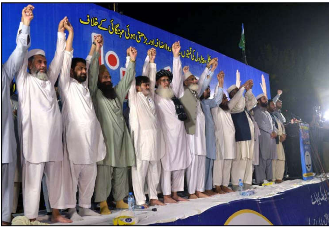
PESHAWAR: Jamat-e-Islami (JI) Chief, Siraj-ul-Haq along with other leaders joint hand with other leaders to express their solidarity during protest demonstration against massive unemployment, increasing price of daily use products, inflation price hiking and the highly inflated electricity bills, held near Governor House building in Peshawar.