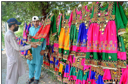
MULTAN: Roadside vendor displaying colorful fancy dresses to attract customers.