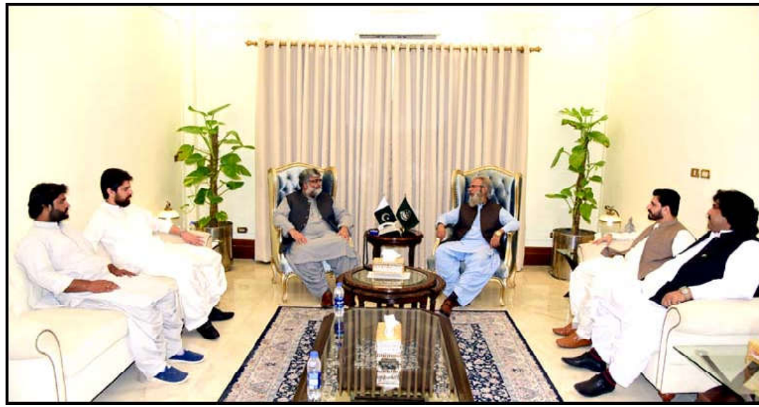
QUETTA: A delegation of tribal elites led by Sardar Kamal Khan Bangulzai meeting with Caretaker Chief Minister Mir Ali Mardan Khan Domki