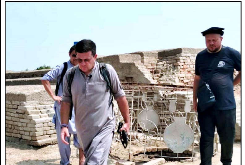
MOHENJO DARO: A delegation of Russian tourists are visiting and expressed keen interest in the historical ruins of the World Heritage Monuments of Mohenjo Daro.

context of climate finance, he said the adaptation finance had increased from 20-28% from 2017-20 whereas there was stagnated funding provided for both mitigation and adaptation-related projects. "There has been a little increase in international climate finance as $803 billion have been provided globally for climate finance," he added. In Pakistan's context, he said the 2022 floods alone caused $30 billion in losses $16 billion was required for reconstruction and it required $7-14 billion for annual adaptation purposes. Pakistan has not utilized climate investment funds (CIFs) and there was space to engage CIFs and bilateral and multilateral funds still available at the global level, he added.