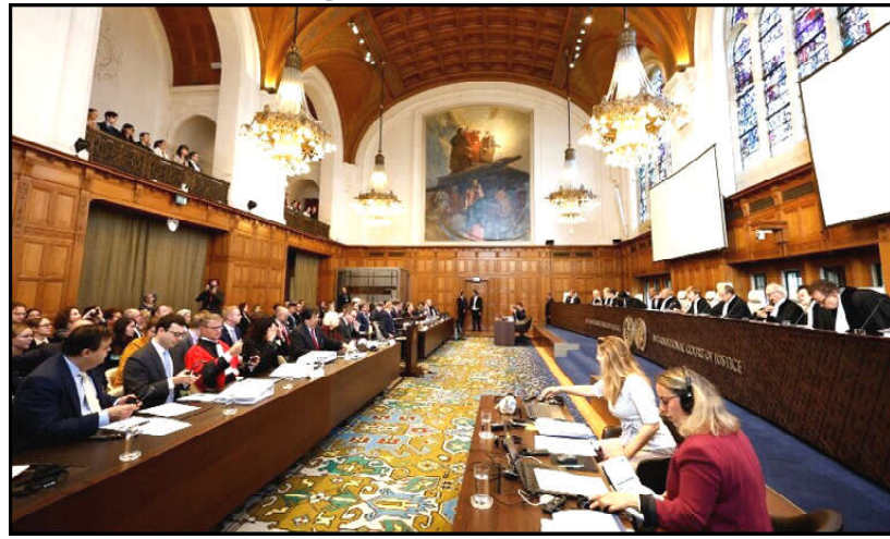
Members of the World Court listen as Russia begins presenting its objections against the jurisdiction of the World Court in a genocide case brought by Ukraine which claims Moscow falsely applied genocide law to justify its February 24, 2022 invasion, in The Hague, Netherlands.

Dressed in black, thousands of teachers and school staff occupied a street near the National Assembly, chanting slogans and holding up signs that read: "Grant teachers immunity from child emotional abuse claims."