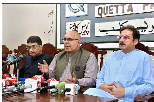
QUETTA: Provincial Minister for Information Jan Achakzai and Minister for Finance Amjad Rasheed addressing a press conference.

With respect to the taxation system in the country, the prime minister said people were facing problems due to a bad tax system that desperately needed to be improved. He said the rupee had stabilized in recent days due to better administrative measures.