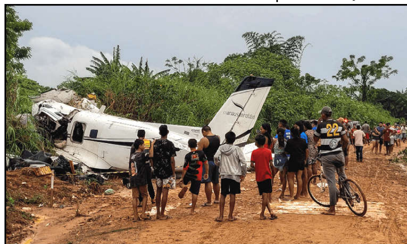
People stand looking at the site where an Embraer EMB-110 aircraft of the Manaus Aerotaxi airline crashed, causing the deaths of 14 people during the plane's landing the previous day at Barcelos airport, about 400 km from Manaus, Amazonas state, Brazil.

Lima added that the region faces heavy rainfall and the most likely cause of the accident was an error in the route taken at the time of landing.