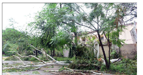
ISLAMABAD: A view of the trees outside school at Sector F-7 as trimmed by someone with any reason, which needs strict action of Concern authority.

"Bushra Bibi is being repeatedly summoned and harassed. We request that the FIA be stopped from harassing Bushra Bibi.