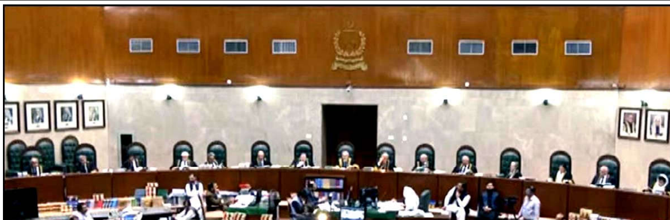
ISLAMABAD: Chief Justice of Pakistan, Justice Qazi Faez Isa presides over the hearing of petitions challenging the Supreme Court (Practice and Procedure) Act 2023, held at Supreme Court of Pakistan Building in Islamabad.