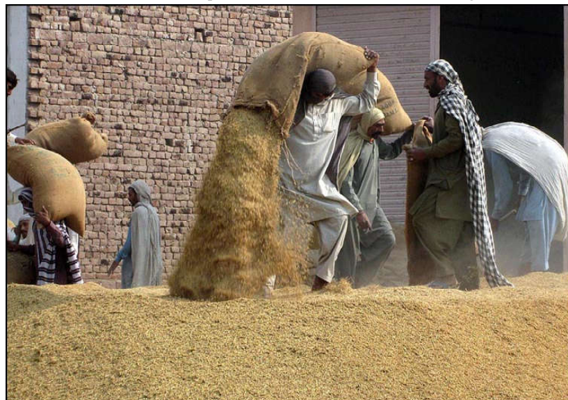
FAISALABAD: Workers spreading the rice crop for drying at a rice warehouse.

Profitability indicators witnessed noticeable improvement as return on assets (ROA) improved to 1.5 percent in H1CY23 (1.0 percent for CY22). The higher earnings in turn also helped to improve Capital Adequacy Ratio (CAR) of the banking sector to 17.8 percent by end June-2023 (17.0 percent at end Dec-2022). With further improvement in solvency indicators, the ability of the banking sector.