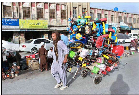
QUETTA: A worker supplying kids cycles to shops at Shahra-e-Iqbal.

The main commodities of exports during August 2023 were Knitwear (Rs. 117,892 million), readymade garments (Rs. 83,447 million), cotton cloth (Rs. 47,002 million), cotton yarn (Rs.30,793 million), towels (Rs.25,567 million), made-up articles, excluding towels & bedwear (Rs.18,377 million), rice others (Rs.18,073 million), rice basmati (Rs.16,271 million) and meat and meat preparations (Rs.11,210 million).