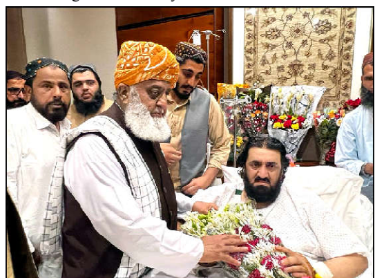
KARACHI: Amir Jamiat Ulema-e-Islam Maulana Fazlur Rehman enquiring about health of Hafiz Hamdullah who was injured in Mastung blast.

Undoubtedly, he mentioned that the signers and artists happen to be the ambassadors of social activities as such there is a dire need to encourage and financially support those associated with them. He also stressed the need to honour the democratic behaviours and difference of opinion and maintain the environment of peace and harmony so as to create more stability, equality and mutual trust in the society.