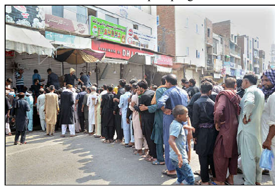
FAISALABAD: People are standing in a queue to receive free food being distributed by volunteers.