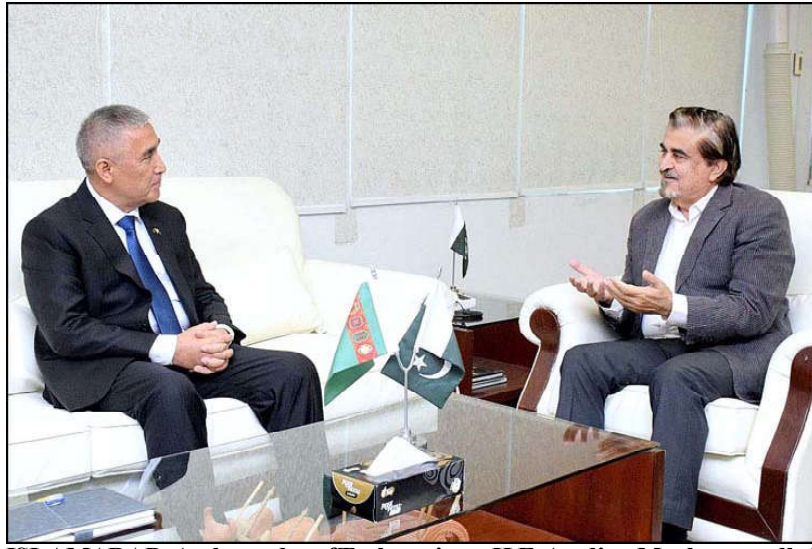
ISLAMABAD: Ambassador of Turkmenistan H.E. Atadjan Movlamov called on Interim Federal Minister for National Heritage and Culture Jamal Shah.

This event promises to be a significant platform for exchanging ideas and promoting a harmonious society based on the teachings of the Prophet Muhammad (PBUH).