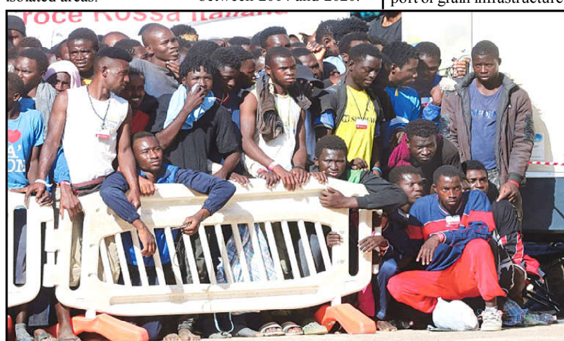
Migrants gather at a reception centre in Lampedusa before European Commission President Ursula von der Leyen and Italian Prime Minister Giorgia Meloni's visit to the Sicilian island.

Monitoring Desk LONDON: The trial of five Israelis accused of gang raping a British woman in a Cyprus hotel room is scheduled for next month, when they will enter pleas to charges including rape, sexual assault, sexual harassment and abduction, Cypriot police said Monday.