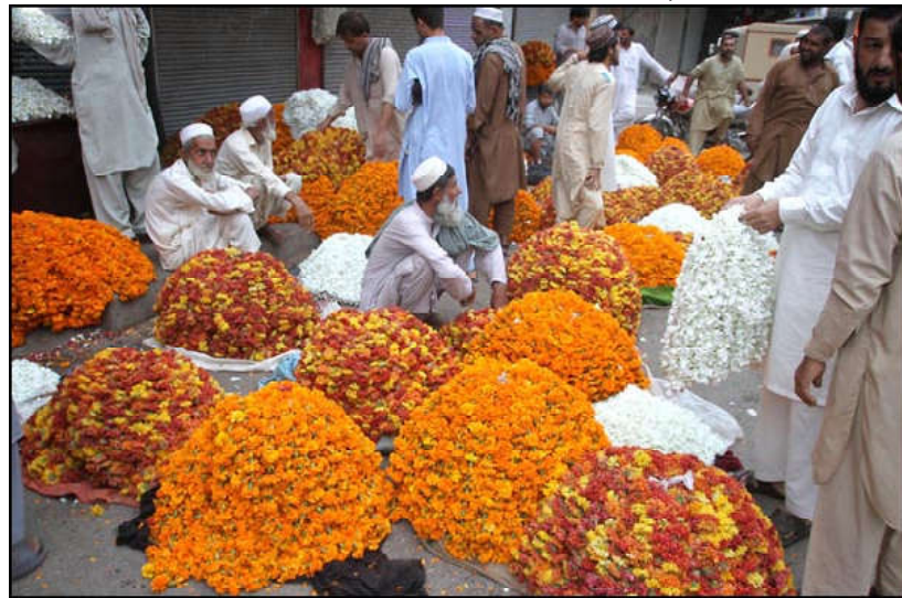
PESHAWAR: People buying flowers in Sarki flower market.