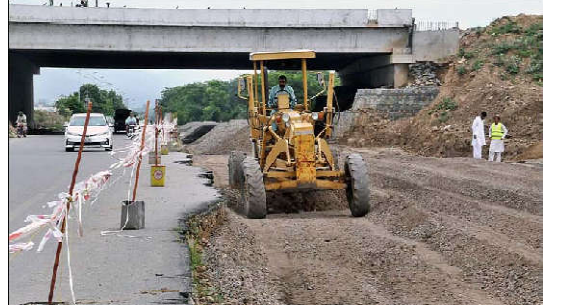
ISLAMABAD: Heavy machinery being used for construction work of Margalla Road during development work in Federal Capital.

He said that the 14th-century Multani Caravanserai in Baku, Azerbaijan is a clear example of our historical relations. He acknowledged the existing scope of cooperation in the field of cultural heritage between the two friendly countries and desired to undertake joint ventures in respective fields.